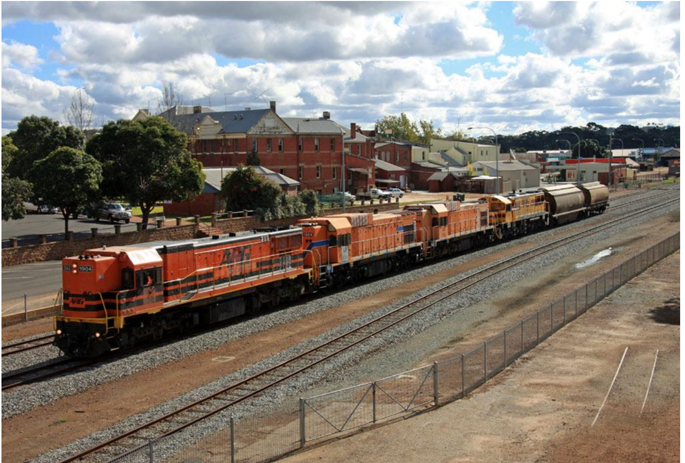
DAZ1904, AB1504, AB1502, DD2359 and two empty wheat wagons entering Narrogin on 1463 engine and wagon movement July 5th where DD2359 and XY wagon will be detached.