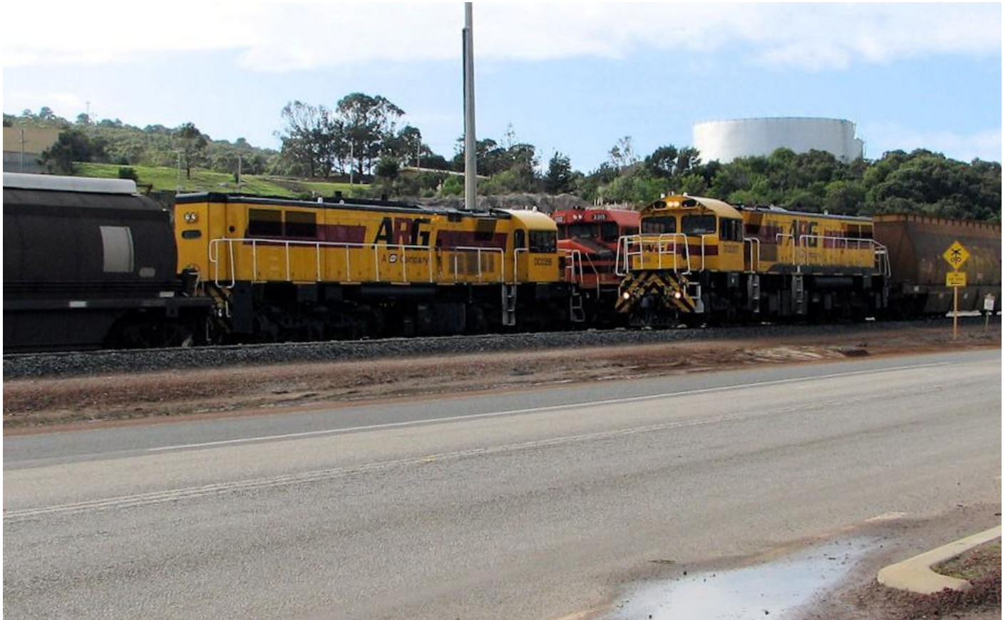
DD2357 on empty woodchip train to mill crosses DD2359 dead attached on 3643 wheat train in Albany yards on July 7th in a rare not soon to be repeated working.

When 3643 wheat train arrived at Albany on July 7th there were seven locomotives on three trains in the yard, being P2501, DBZ2313 & DD2359 on 3643, P2516 & DBZ2303 on empty 3642 wheat and DD2357 & P2313 on empty woodchip service about to depart for mill. SW