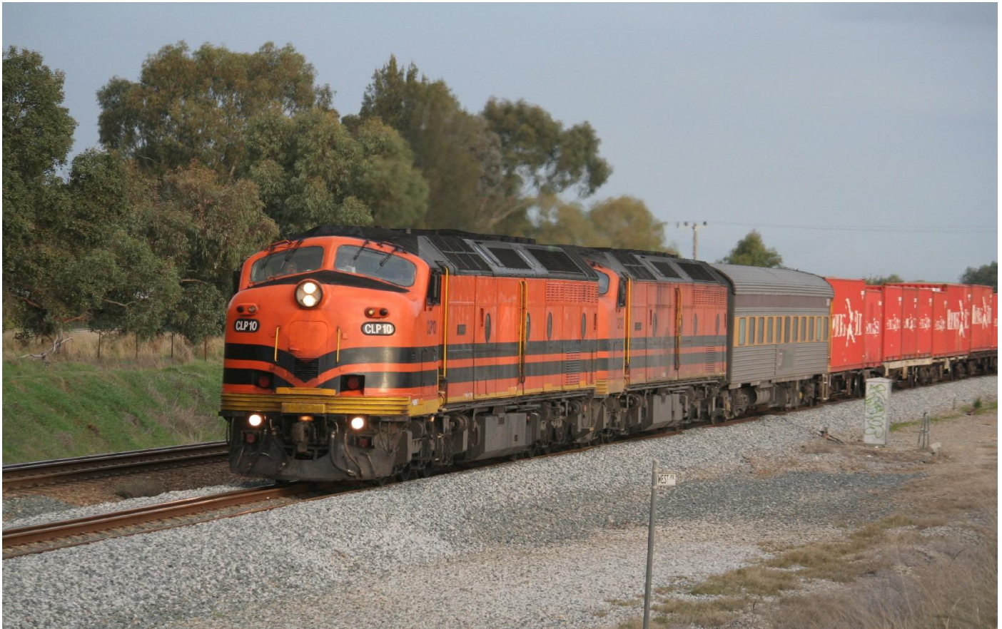
Still a favourite among many railfans CLP and CLF locomotives here CLP10 & CLP4 run 3PA1 QR National intermodal through Hazelmere at beginning of the run to Adelaide July 7th.