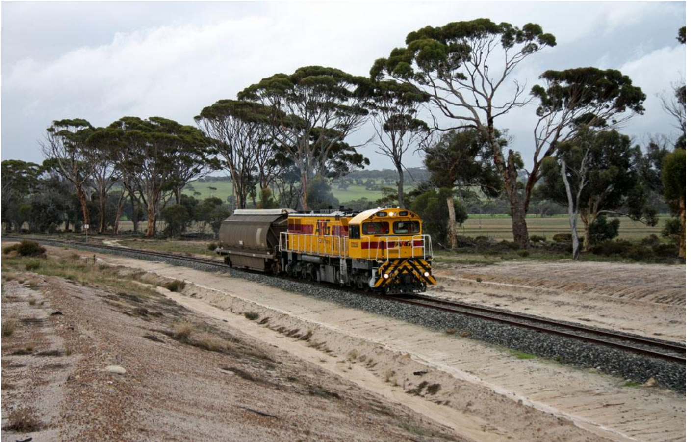
Narrogin to Wagin section of GSR sees little traffic only occasional engine movements often after dark here DD2359 and empty XU wagon run in Piesseville area north of Wagin on July 6th.