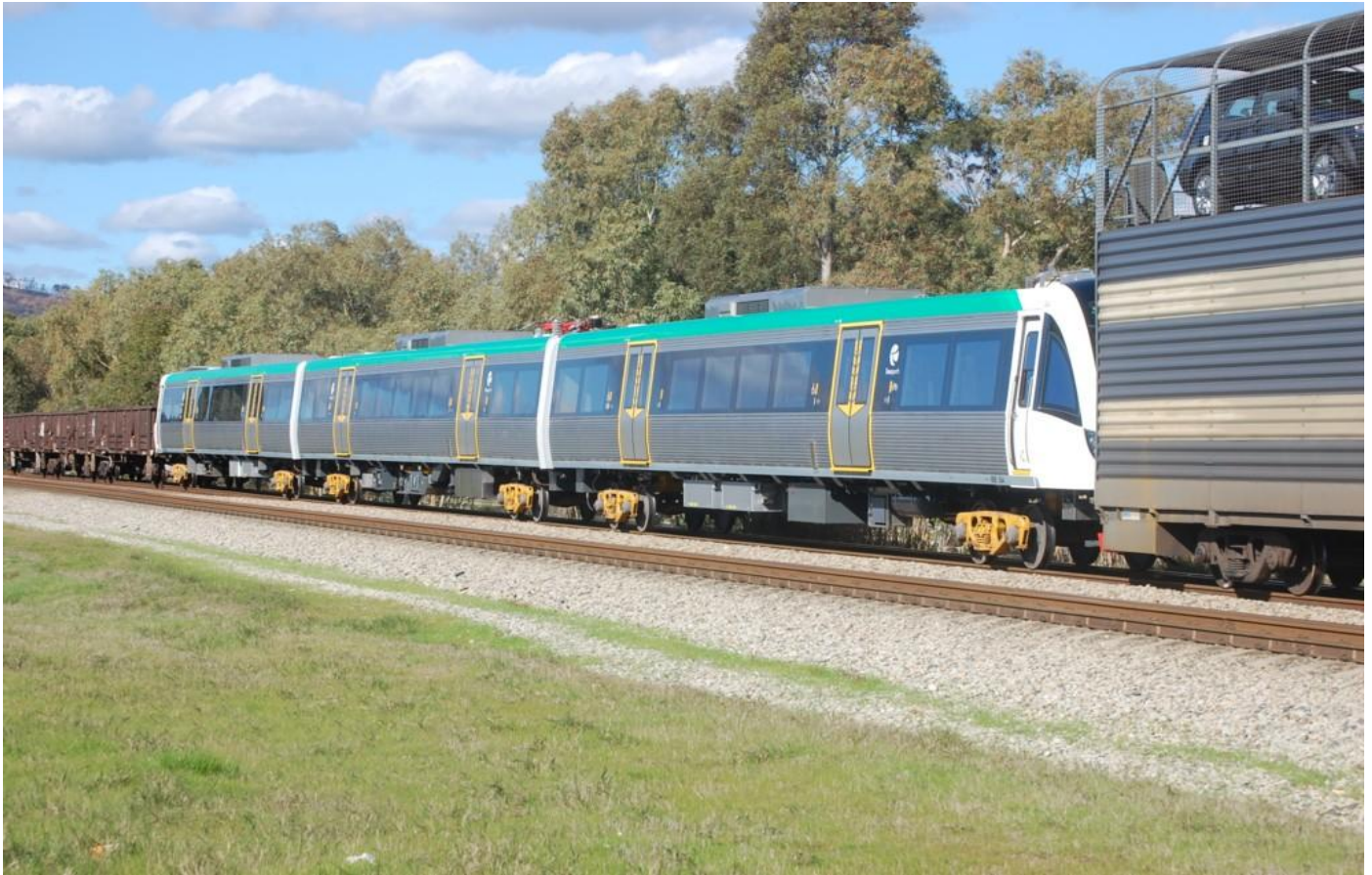
Transperth EMU B set #84 on standard gauge transfer bogies on rear of 4WP2 steel train as it runs through Bellevue on its delivery run from its builders in Queensland on July 5th.