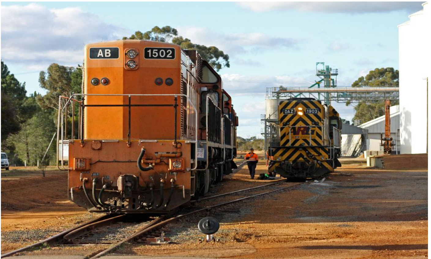
AB1502, AB1504 & DAZ1904 on 1463 light engines at Yealering crossing DAZ1903 & DAZ1906 on 1462 light engines that will run to Avon Yard collecting the two wagons at Wickepin. P2