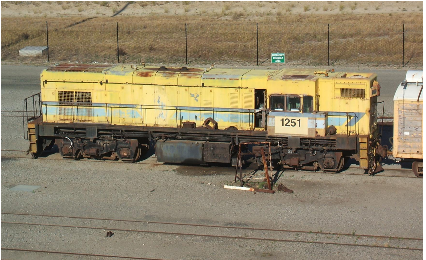
Historic ex BHP Whyalla locomotive 1251 stored at narrow gauge loco November 25th.