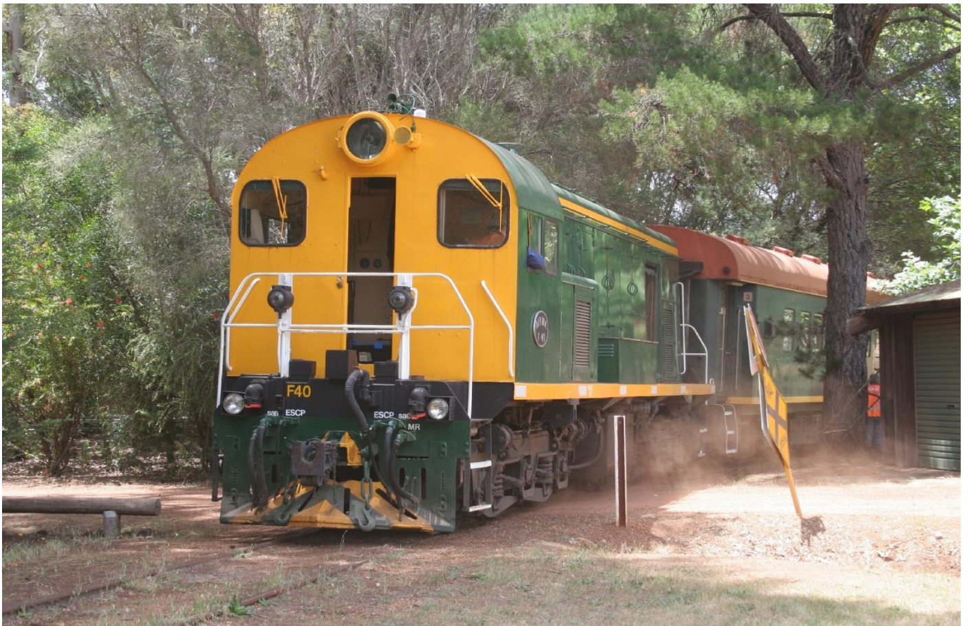
F40 shunts coaches on Dwellingup triangle December 12th.