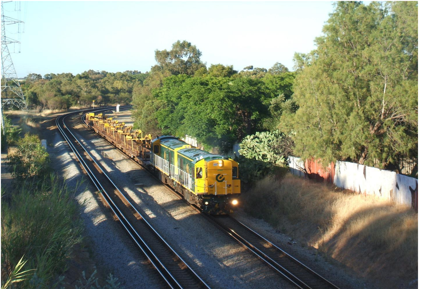
R1902 & KA212 on 6S23 rail train at Bellevue on December 10th.