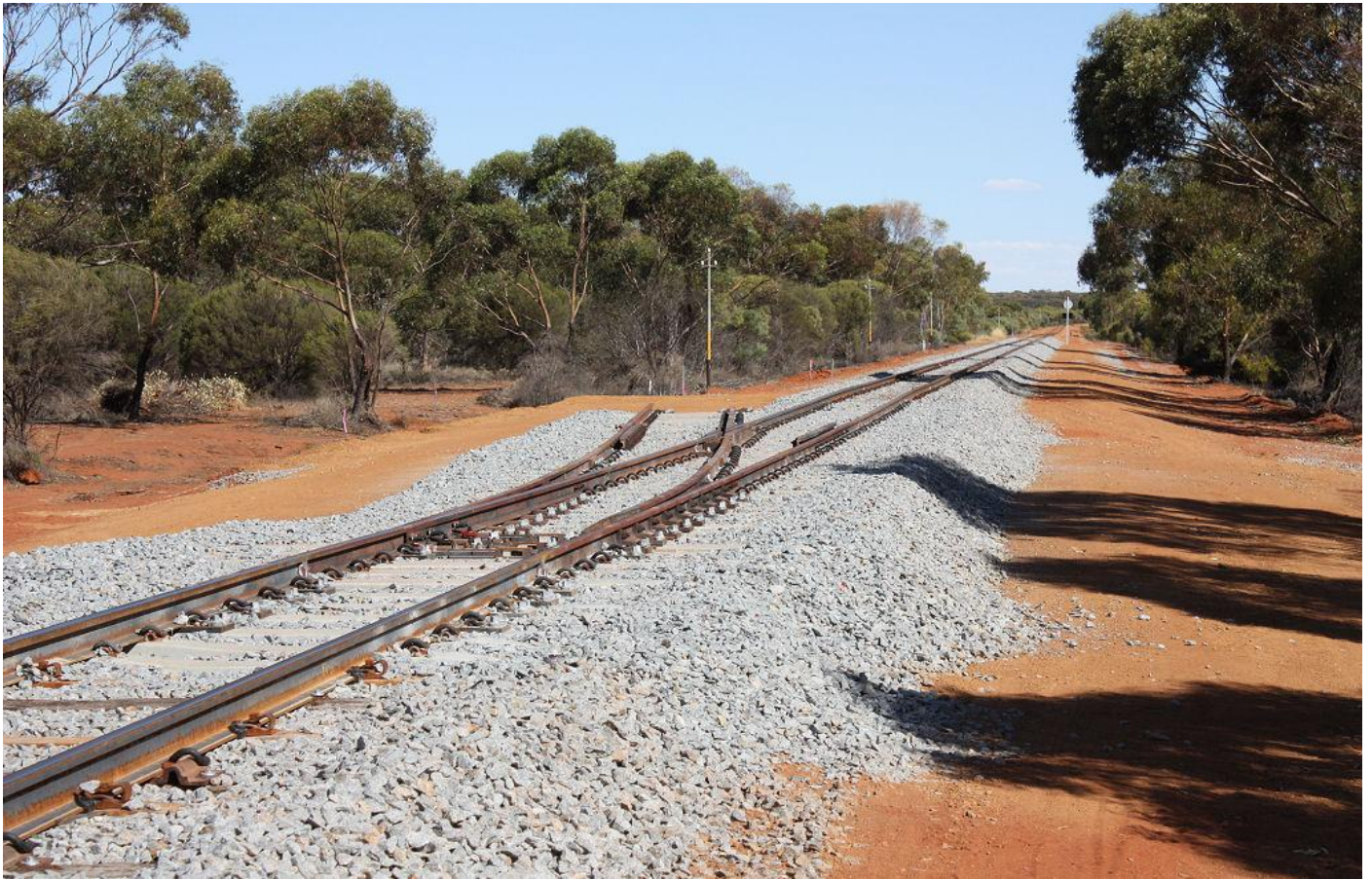
Points at Perenjori South going of main line to Mt Gibson loading facility December 12th.