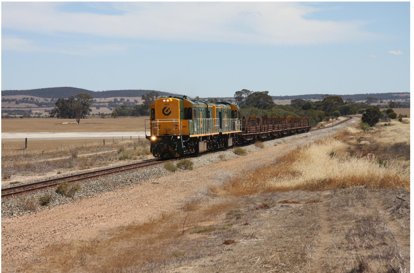
RA212 & R1902 on 1S24 rail train at Pootenup siding site December 12th.