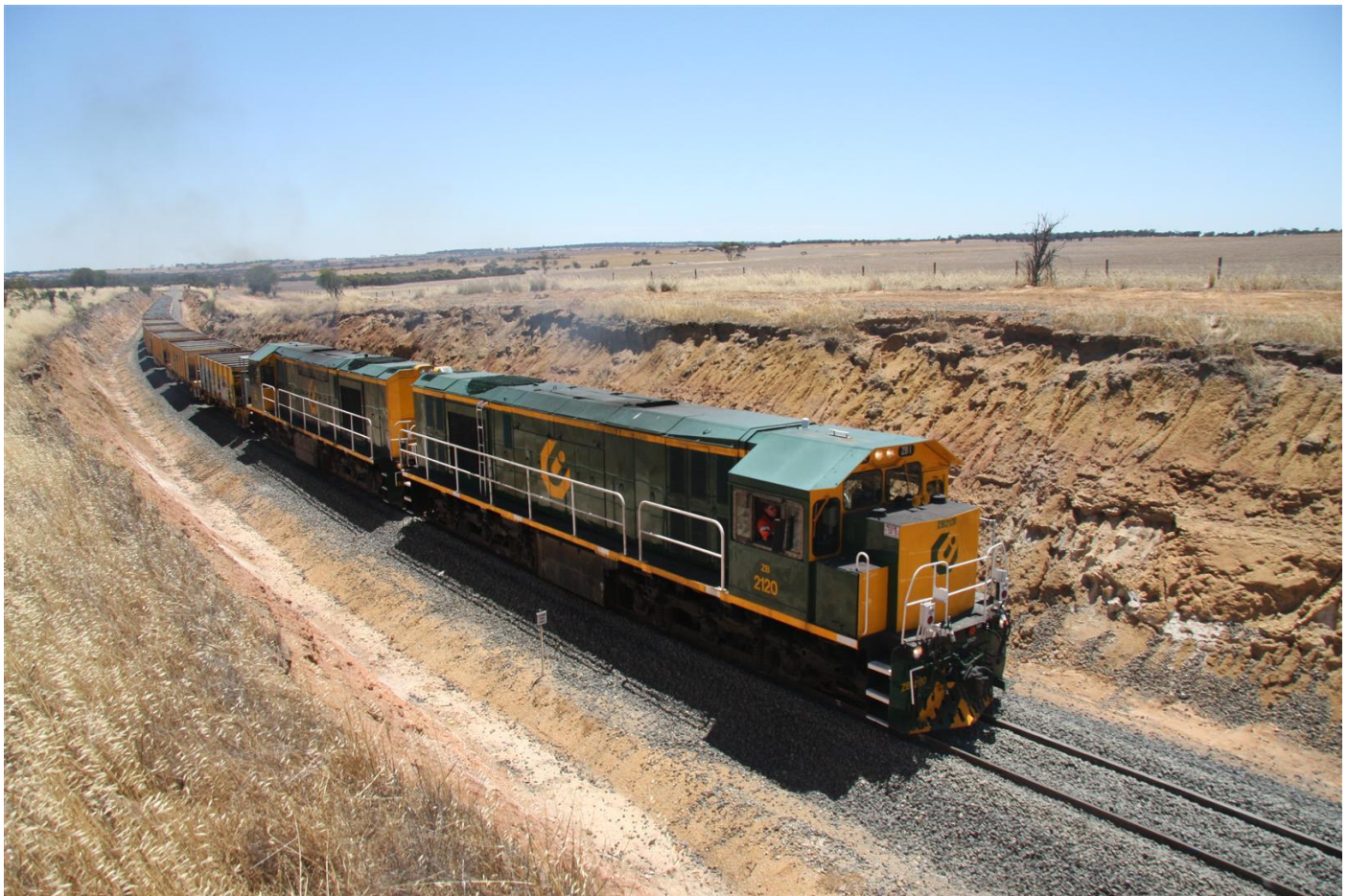
ZB2120 & ZB2125 on ballast train at Moojebing on December 12th.