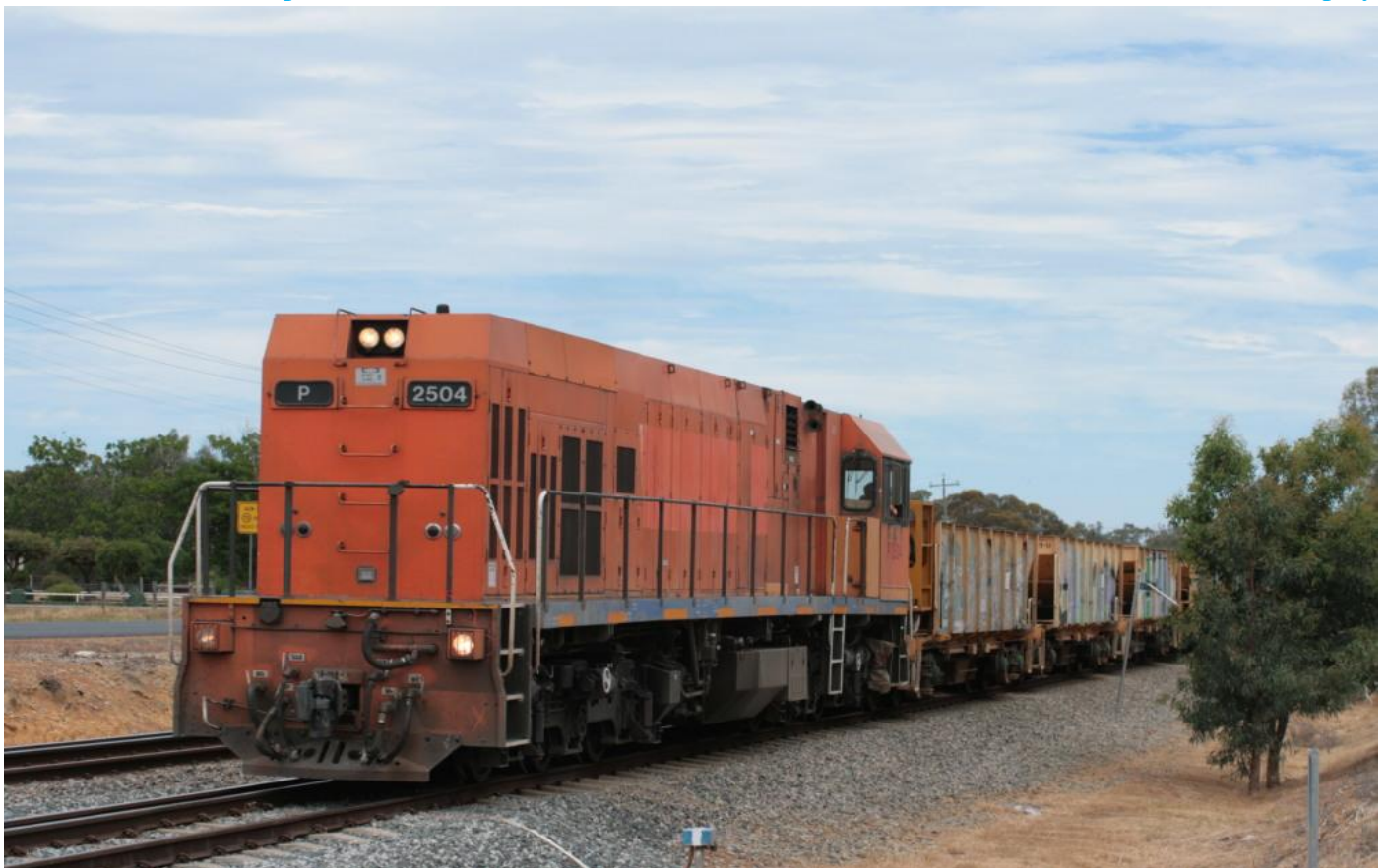
P2504 on 1BT3 empty ballast train at Oakover Road Middle Swan December 19th.