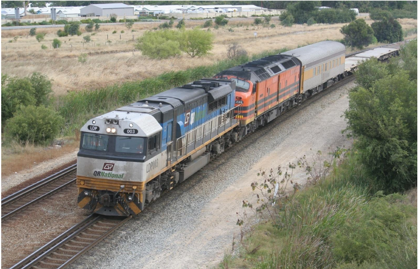
LDP003 & CLP9 run 2PM1 QRN intermodal at High Wycombe on December 13th. Photo Justin Brown

WWW.WESTERNRAILS.COM follow West Australian Railscene e-Mag on facebook Copyright Jim Bisdee © 2010