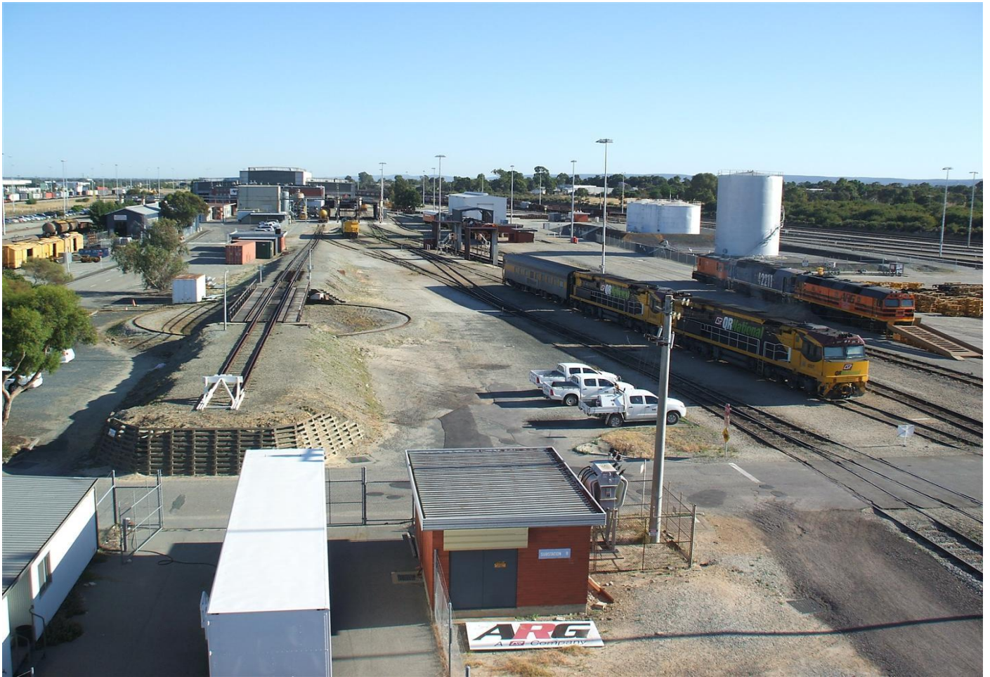
Forrestfield loco on November 25th looking north with maintenance depot in distance and above ground dual gauge turntable in the foreground with QRN locos stabled withdrawn locos stored.