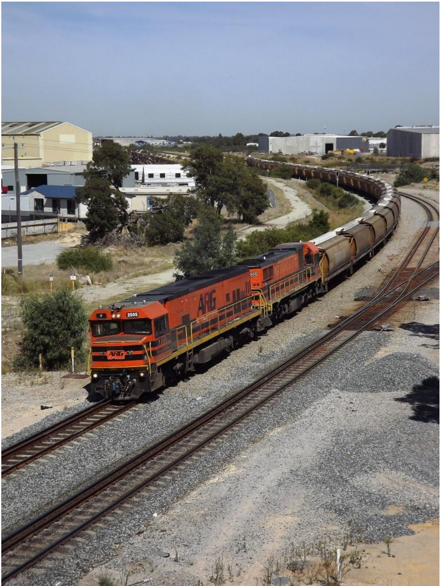
P2505 & DAZ1905 on 4313 empty grain at Kewdale April 11th. END page 10 of 10.