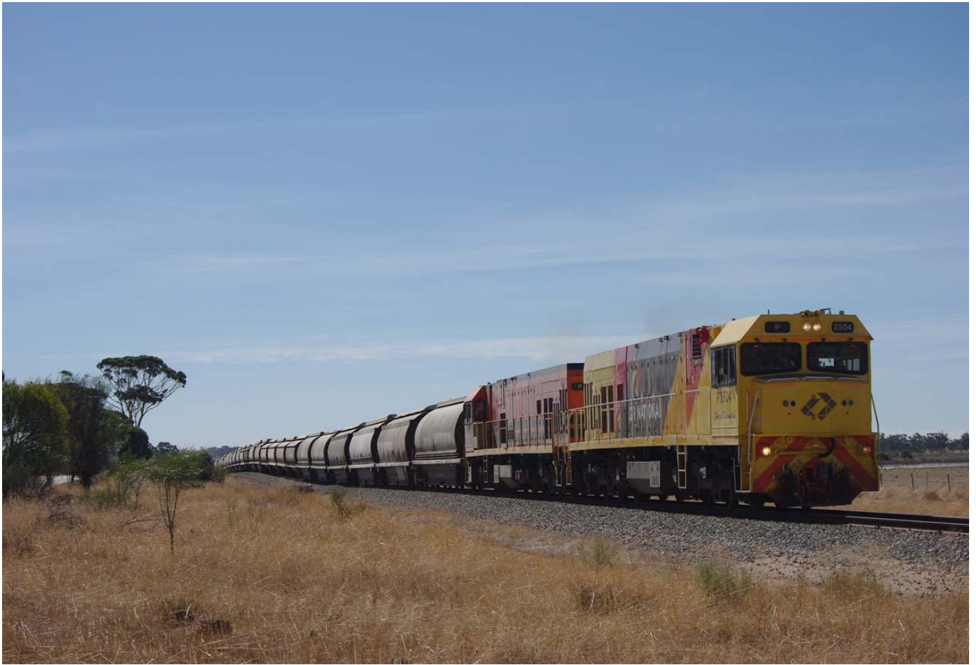
P2504 & P2517 on 4342 grain at Nambling April 11th.