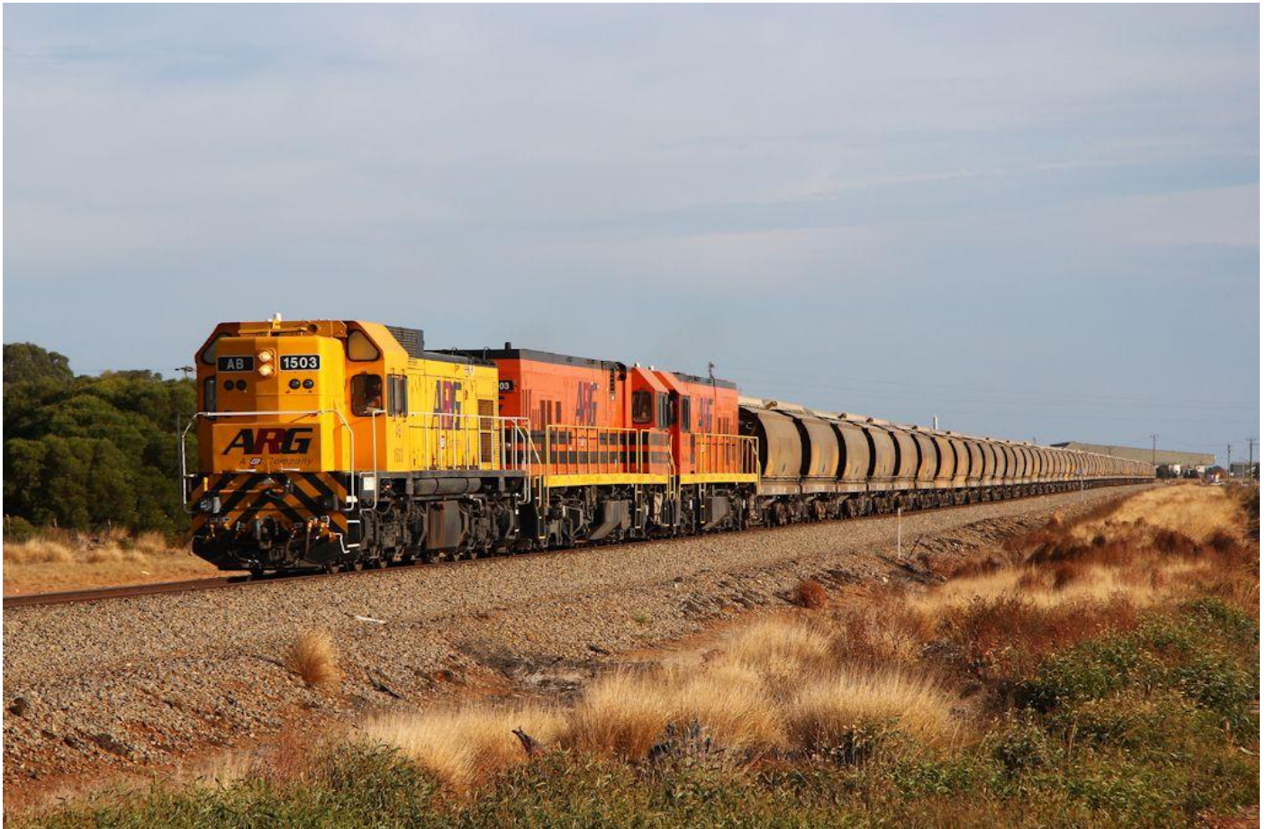
AB1503, P2503 & P2516 on empty grain at Narngulu South April 15th.