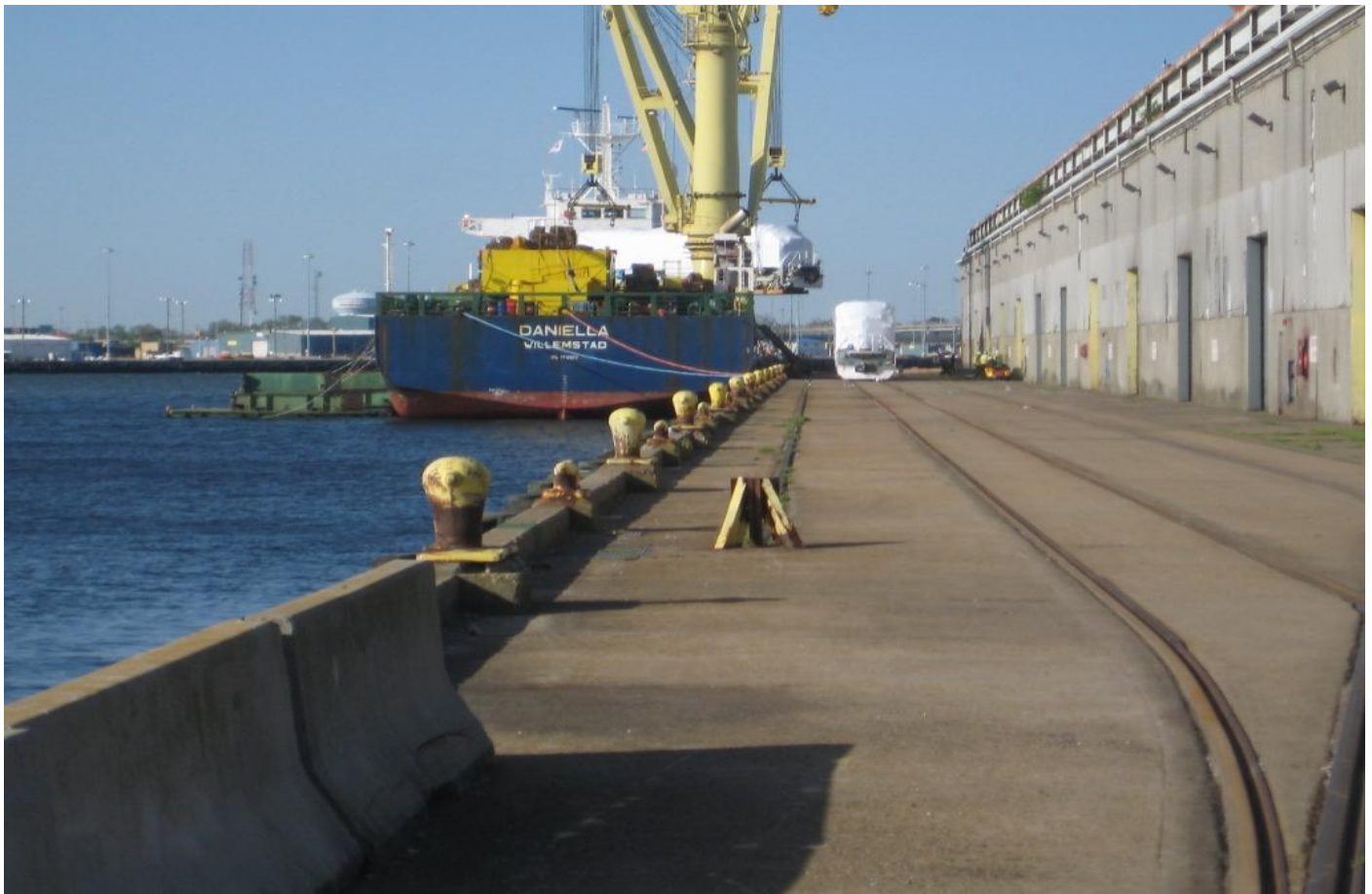
BHPBIO SD70ACel/c being loaded onto heavy lift ship MV Daniella while another locomotive waits to be hoisted on board at Lambert Point dock Norfolk Va March 27th.