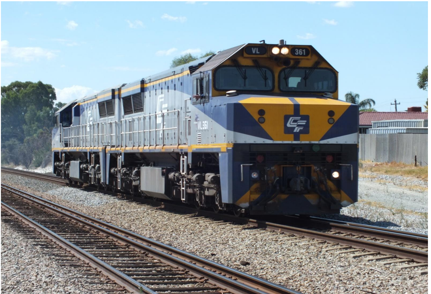
VL361 & VL357 on 5WG2 Watco light engine to CBH Kwinana at Thornlie March 29th.