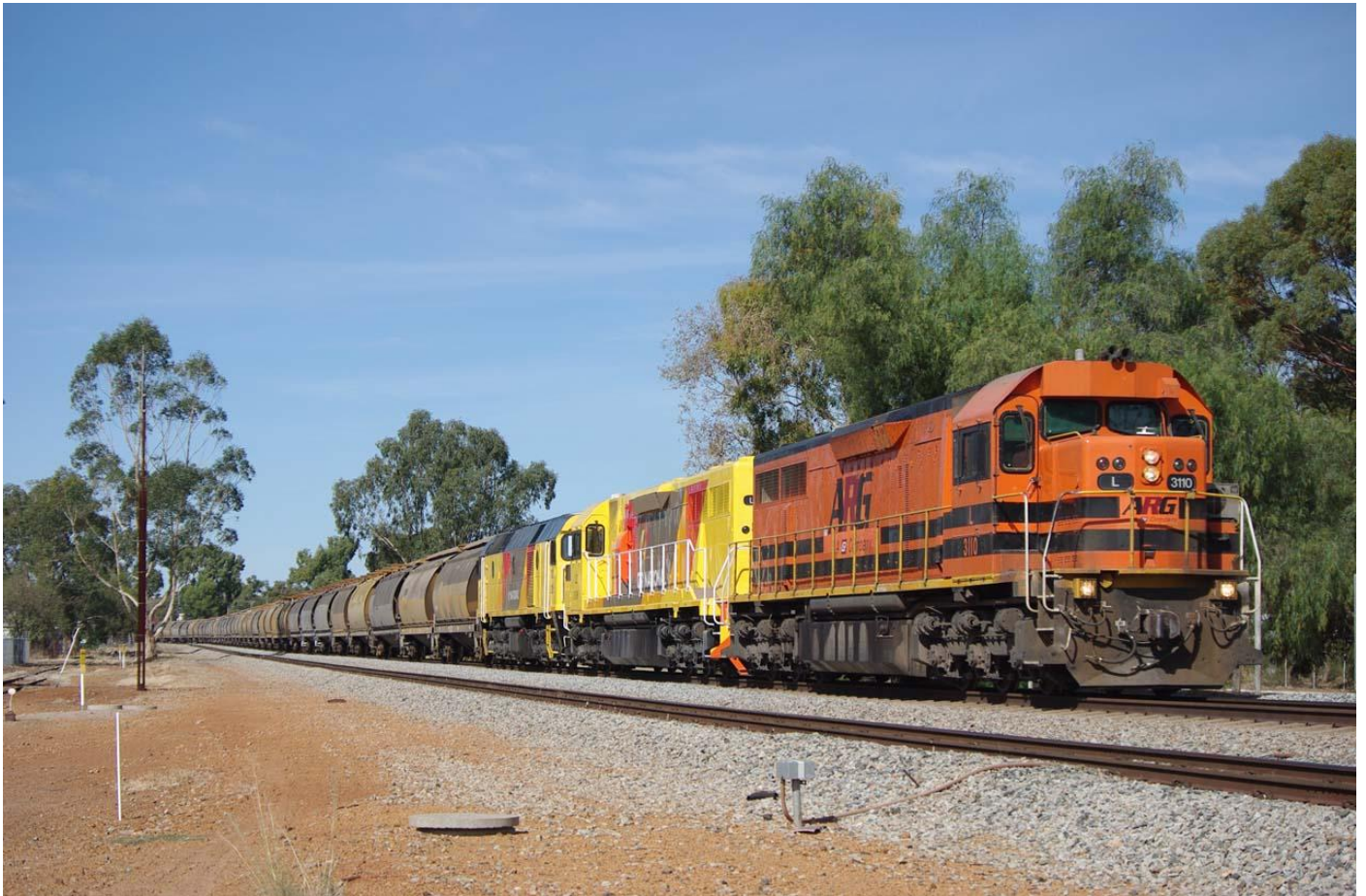
L3110, & DC2205 on 2058 grain train at Northam on April 9th.