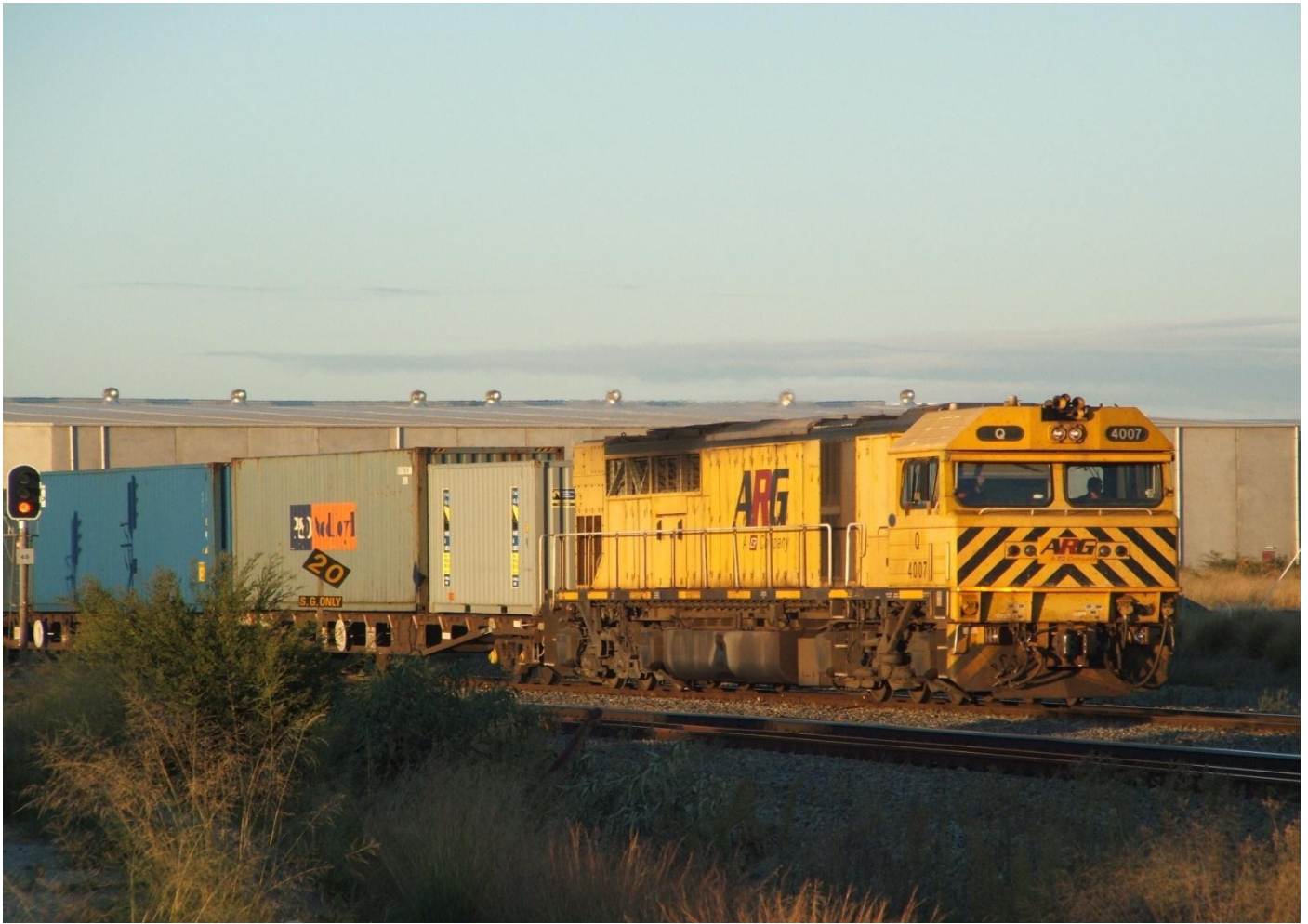
Q4007 on 7141 container train at Kewdale April 14th.