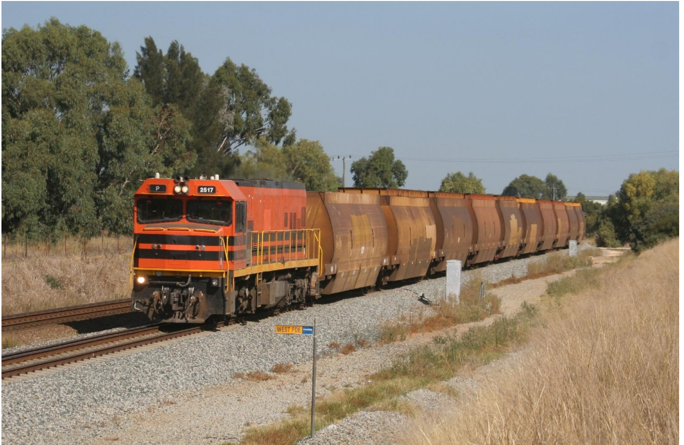
P2517 on 6283 empty woodchip wagons at South Guildford April 13th.