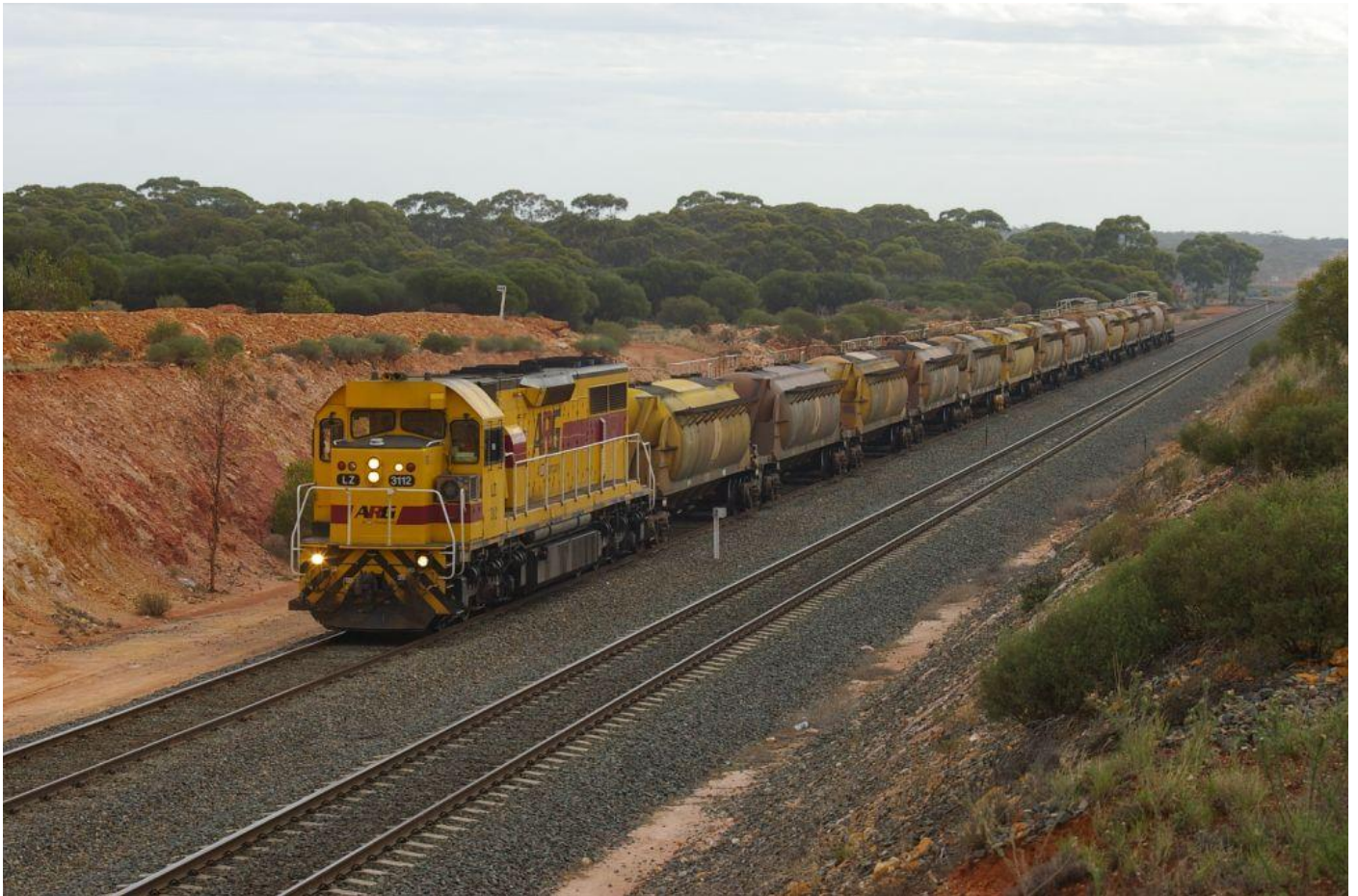
LZ3112 on 6478 empty nickel train at West Kalgoorlie March 31st.