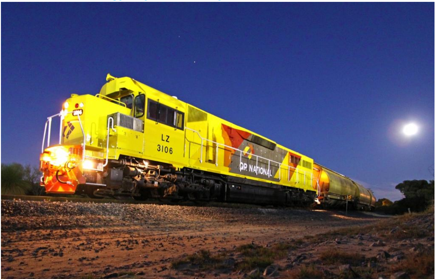
LZ3106 on 6056 grain on CBH Kwinana loop April 6th.