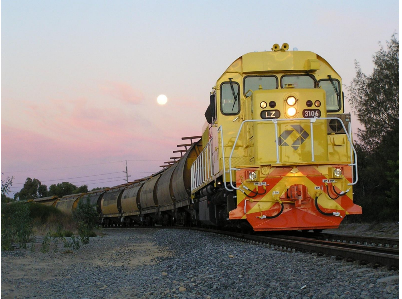
Full moon rises above LZ3106 on 6056 grain on CBH loop Kwinana April 6th.

WWW.WESTERNRAILS.COM follow West Australian Railscene e-Mag on facebook