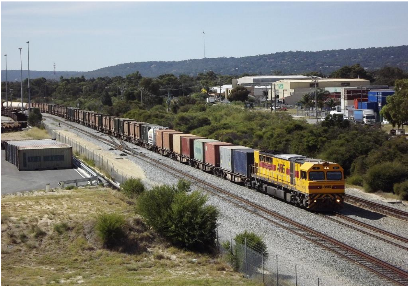
Q4019 on 3430 empty sulphur departing Forrestfield April 11th.