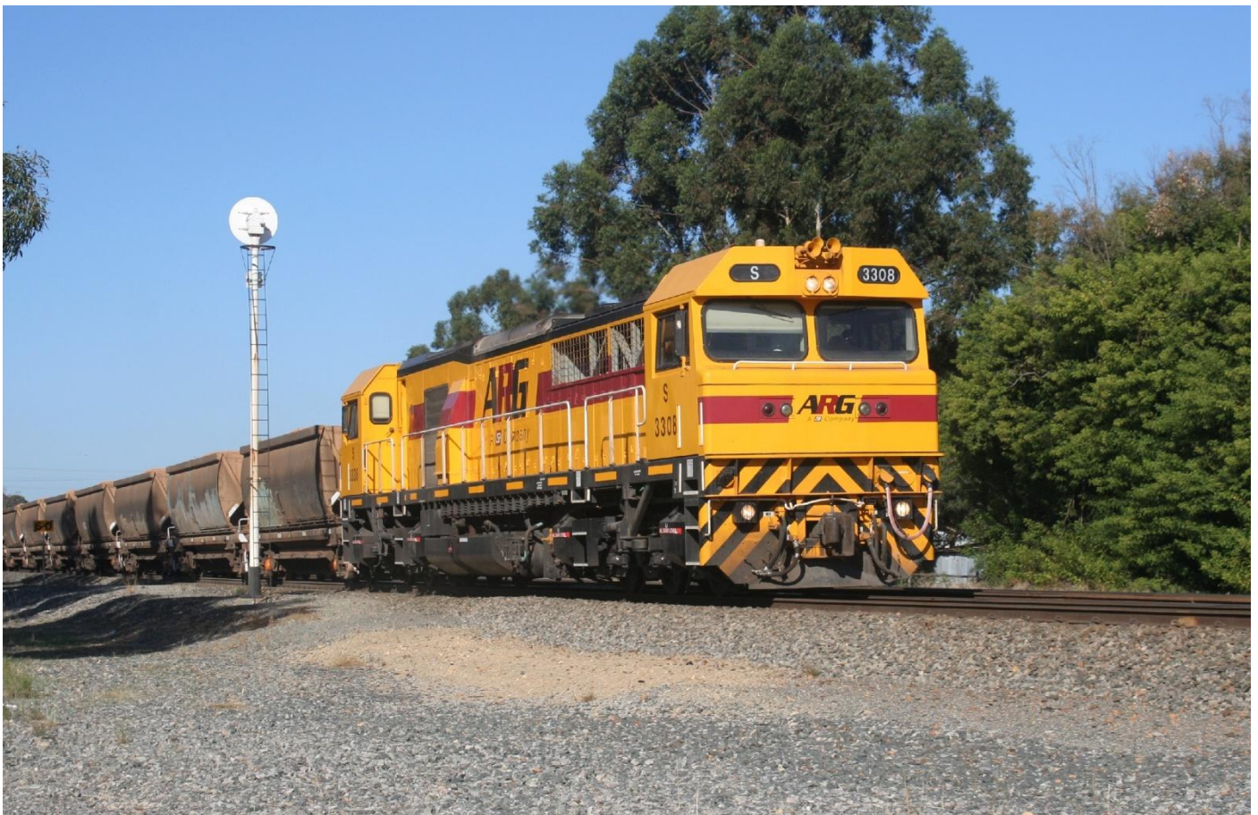
S3308 hauls bauxite train through Wellard April 15th.