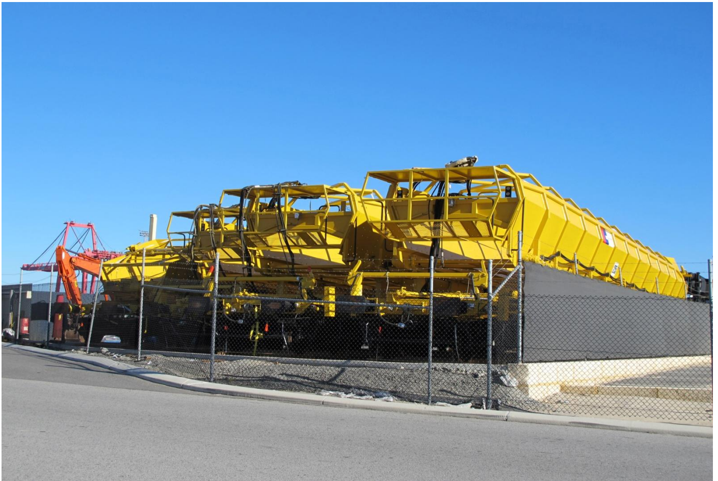
Imported ballast cleaner with hook and link couplers at #12 North Wharf April 15th.