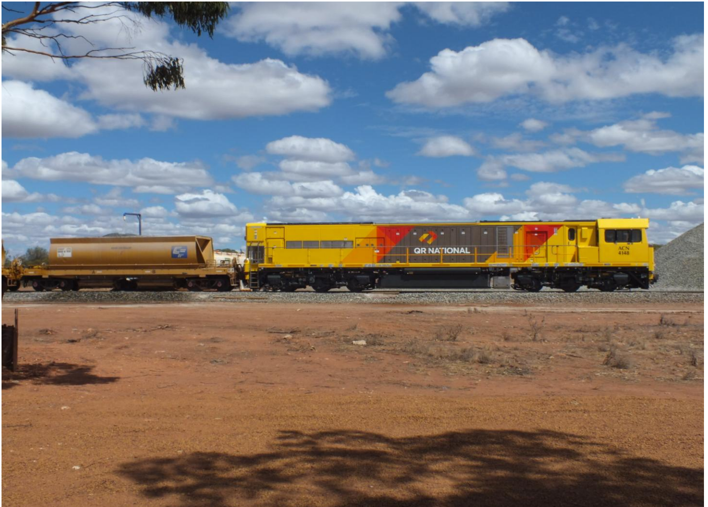
ACN4148 on Morawa line upgrading ballast train being watered at Tardun March 26th.