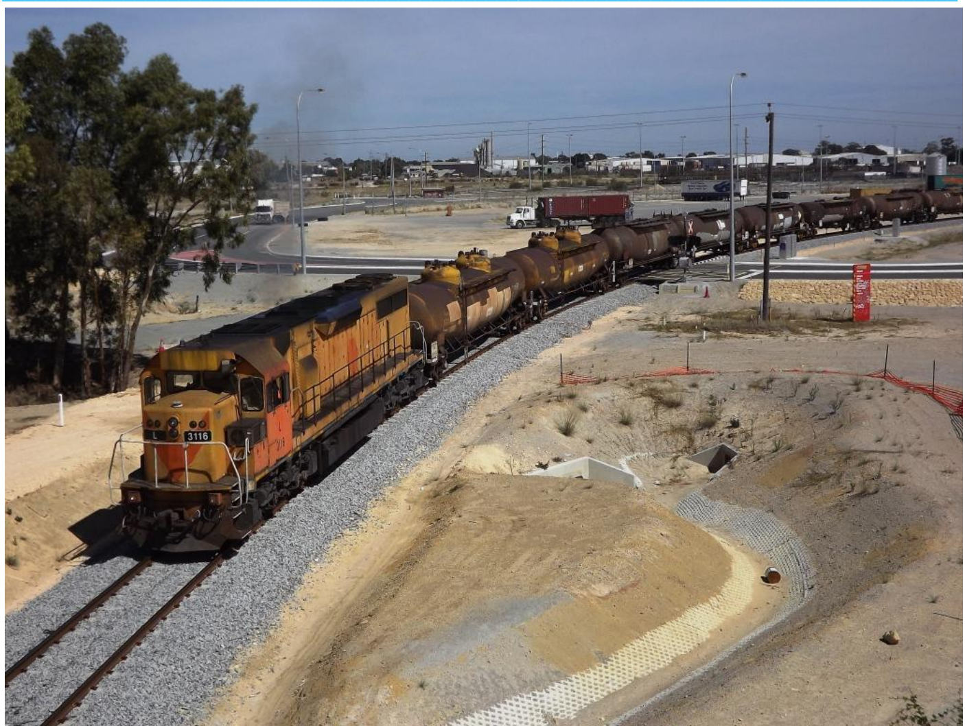
L3116 on 4SG4 tankers ex BP terminal Kewdale to Forrestfield April 11th.

Around 0800 on April 14th a contractor cut a feed cable where work on City Link Project is taking place west of Perth City Station. This cut power to the Clarkson line back to Whitfords where services could only operate Clarkson to Whitfords causing severe disruption to the suburban system for the third time in just over a month. This at least was a Saturday with far fewer people affected but it still caused huge disruption to services having trains only running on northern section of the line. Both Transperth and Adams Bus lines were called in to supply buses run to a rail replacement service Perth to Whitfords. Power was restored about 1050 with services returning to normal by 1230.