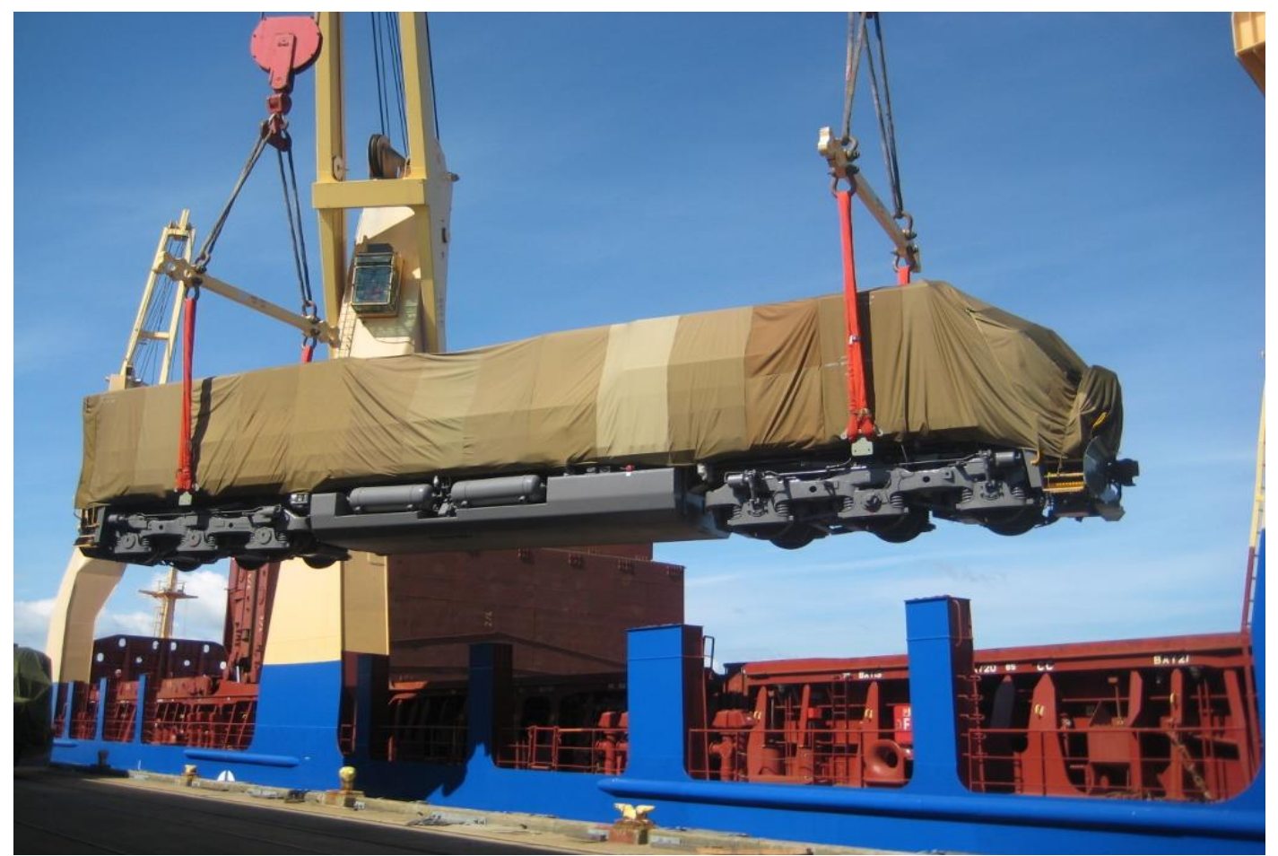
Rio Tinto ES44DCi locomotive being hoisted onboard BBC Nile Lamberts Point April 2nd.