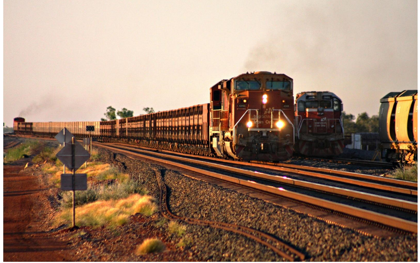
SD70ACel/c 4340 & 4346 with 113 ore car rake DPU remotes 4329 & 4354 further 113 ore cars on empty ore train bypassing SD40R 3088 on works train at Walla April 17th.

West Australian Railscene e-Mag is published weekly by Jim Bisdee on rail happenings on West Australian RailroadsWWW.WESTERNRAILS.COMfollow West Australian Railscene e-Mag on facebookCopyright Jim Bisdee © 2012