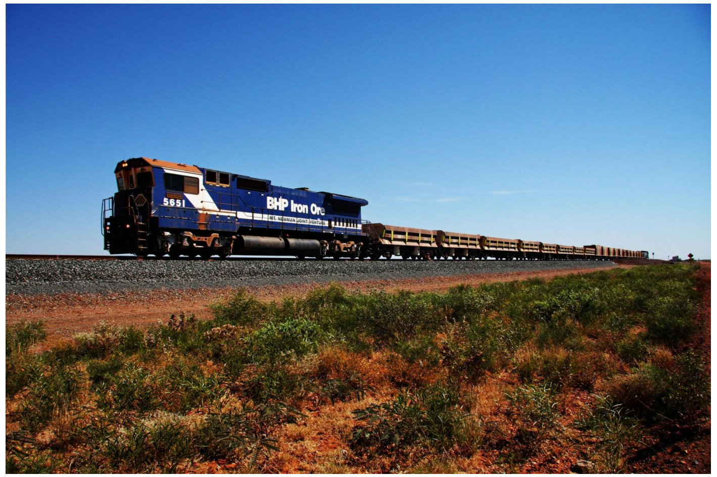
5651 on works train side dump cars and ballast wagons with 5657 on rear at Walla 19/04.