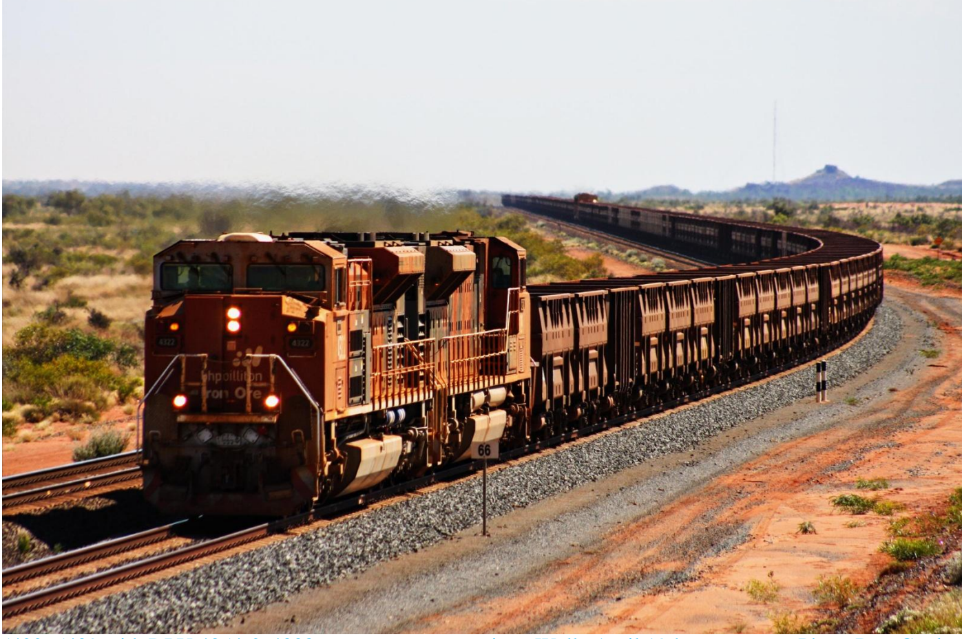
5422, 5409 with DPU 4354 & 4338 on an empty ore train at Walla April 19th.