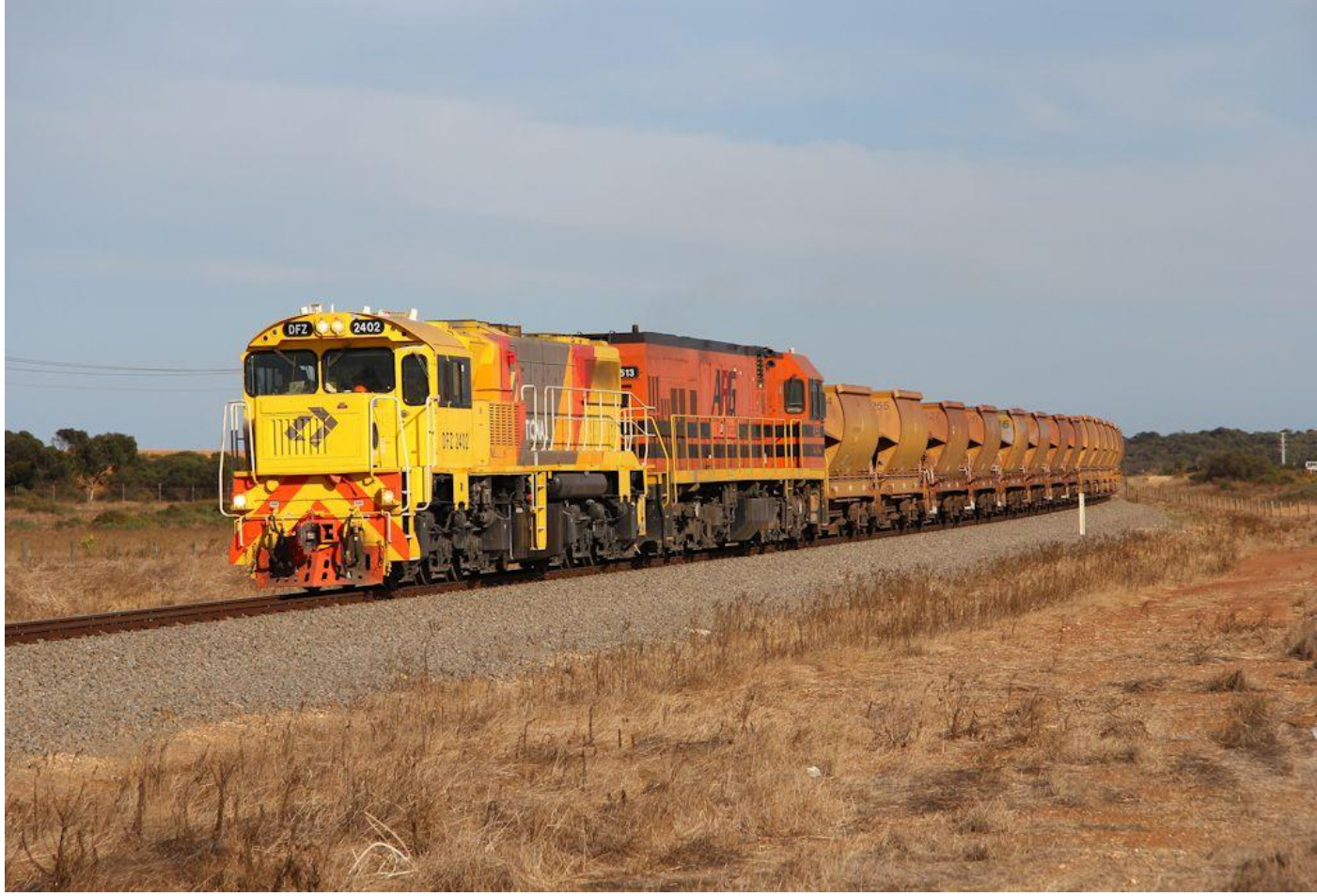
DFZ2402 & P2513 on empty ore train on way to Narngulu Yards from port April15th.