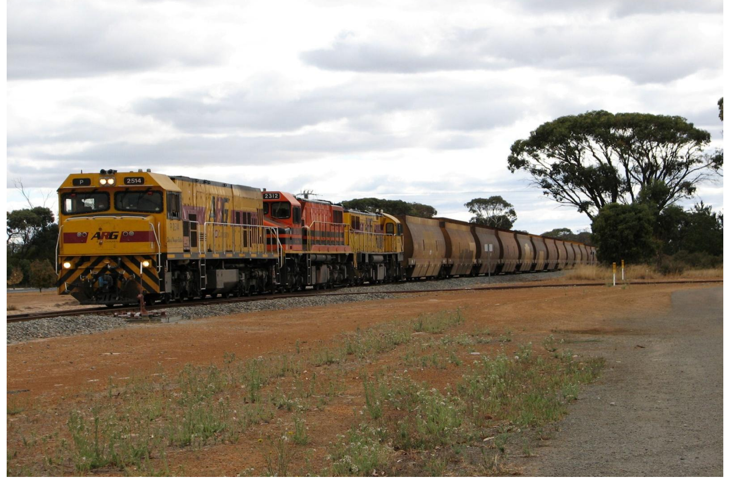
P2514, DBZ2312 & DD2356 on 5307 woodchip wagons at Tambellup April 19th.