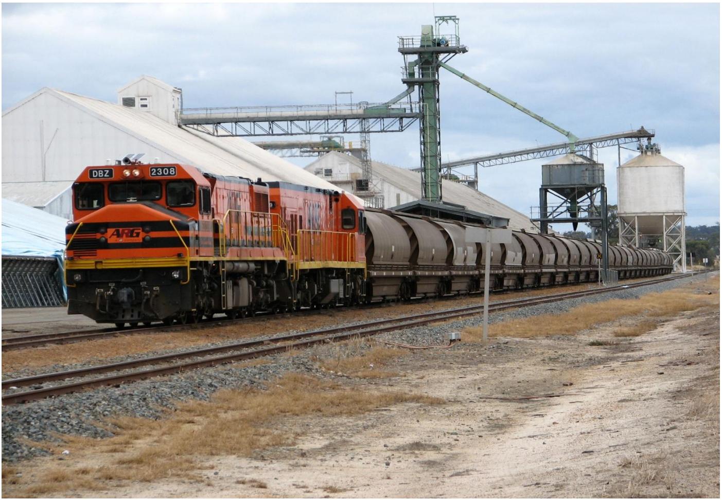
DBZ2308 & P2509 on 5372 grain loading at Cranbrook April 19th.