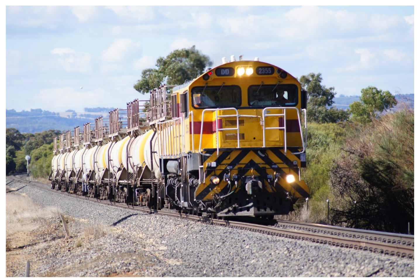
DD2355 on empty caustic tankers at Waterloo April 14th.