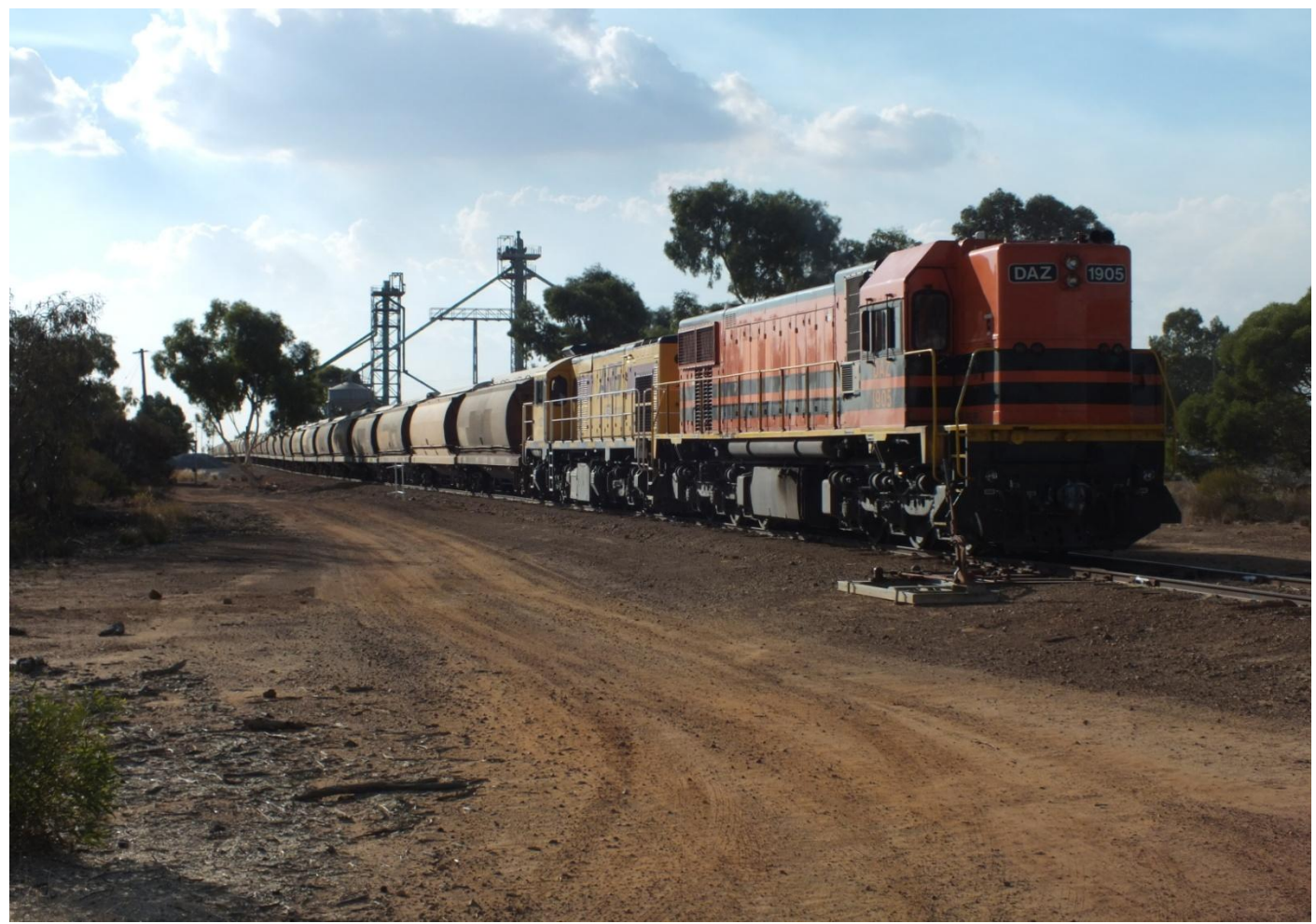
DAZ1905 & AD1520 shunt 2342 grain train at Ballidu March 26th.