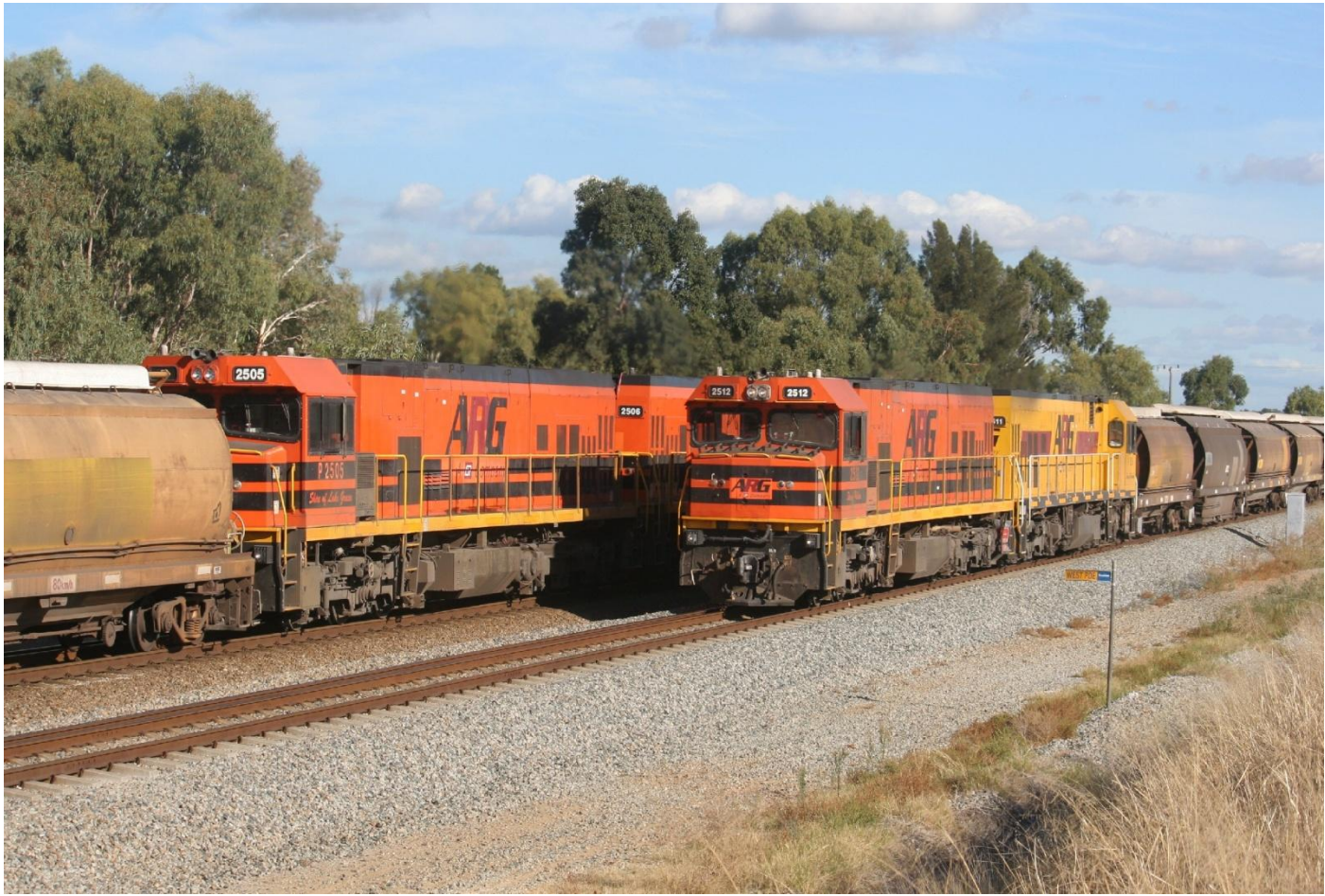
2512 & P2511 on empty grain crosses P2506 & P2505 on grain South Guildford 16/04.