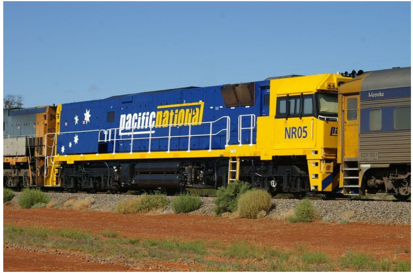
NR5 numbered as 05 remote unit on 6PM7 at Parkeston April 21st.