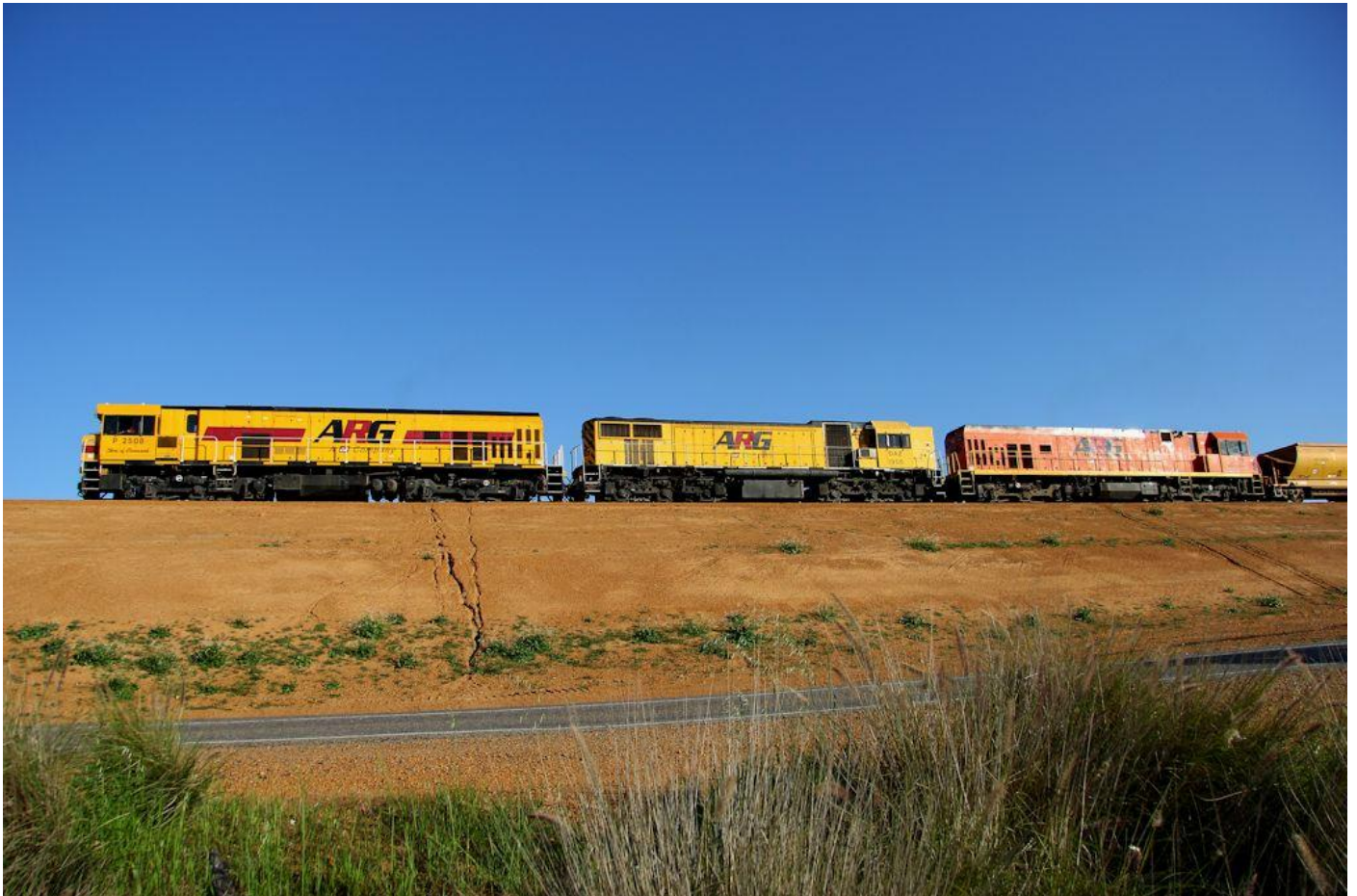
P2508, DAZ1906 & P2516 on 7720 empty ore to Perenjori west of Bringo August 25th.