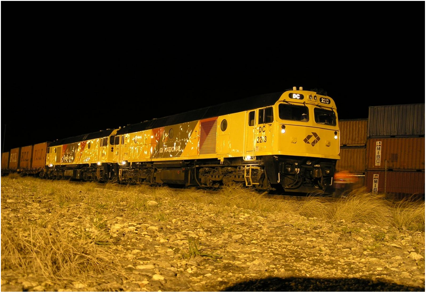
DC2213 & DC2205 on 3141 container train waiting to depart North Quay August 14th.