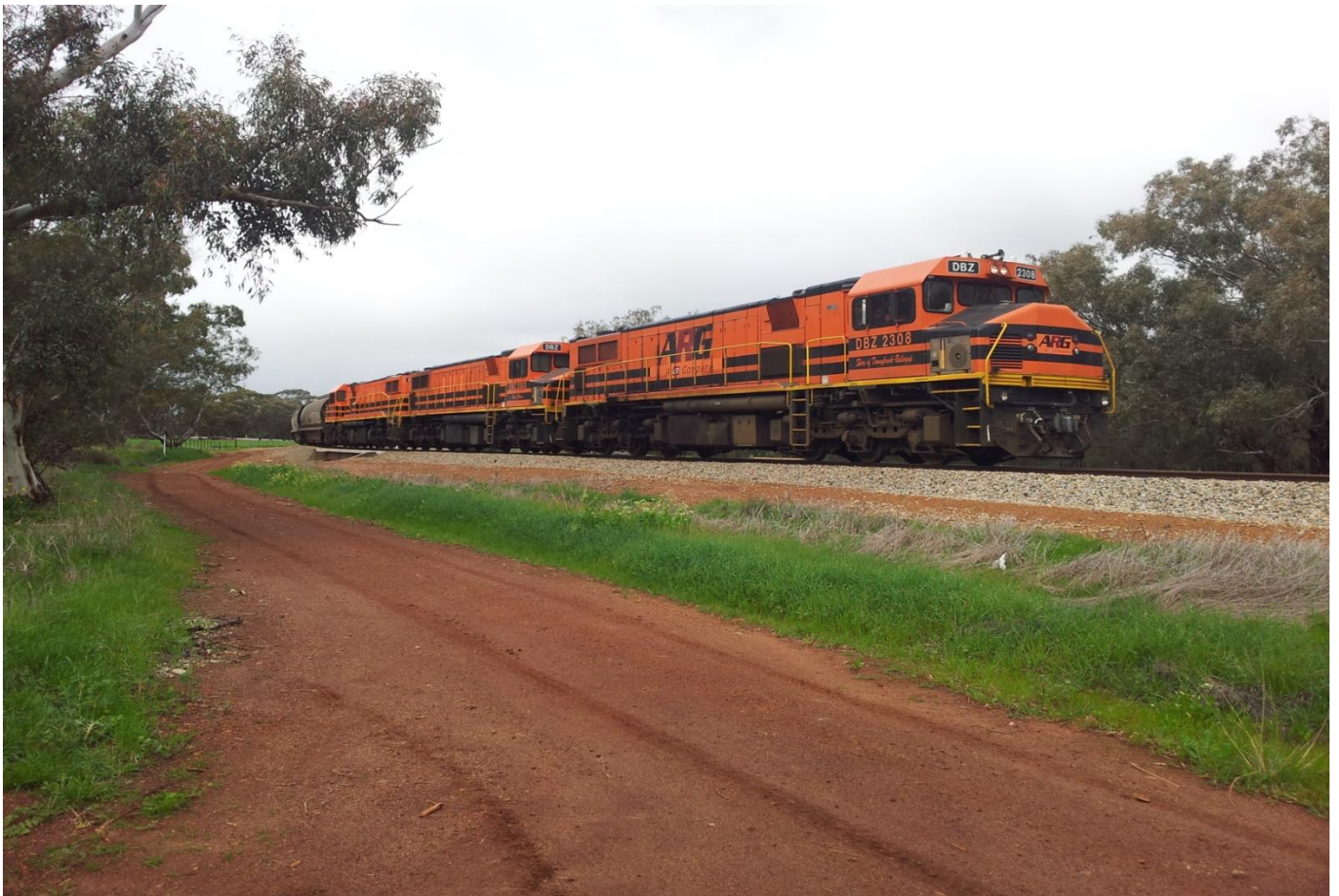
DBZ2308, DBZ2303 & DBZ2312 on 3363 empty grain outside Northam August 14th.