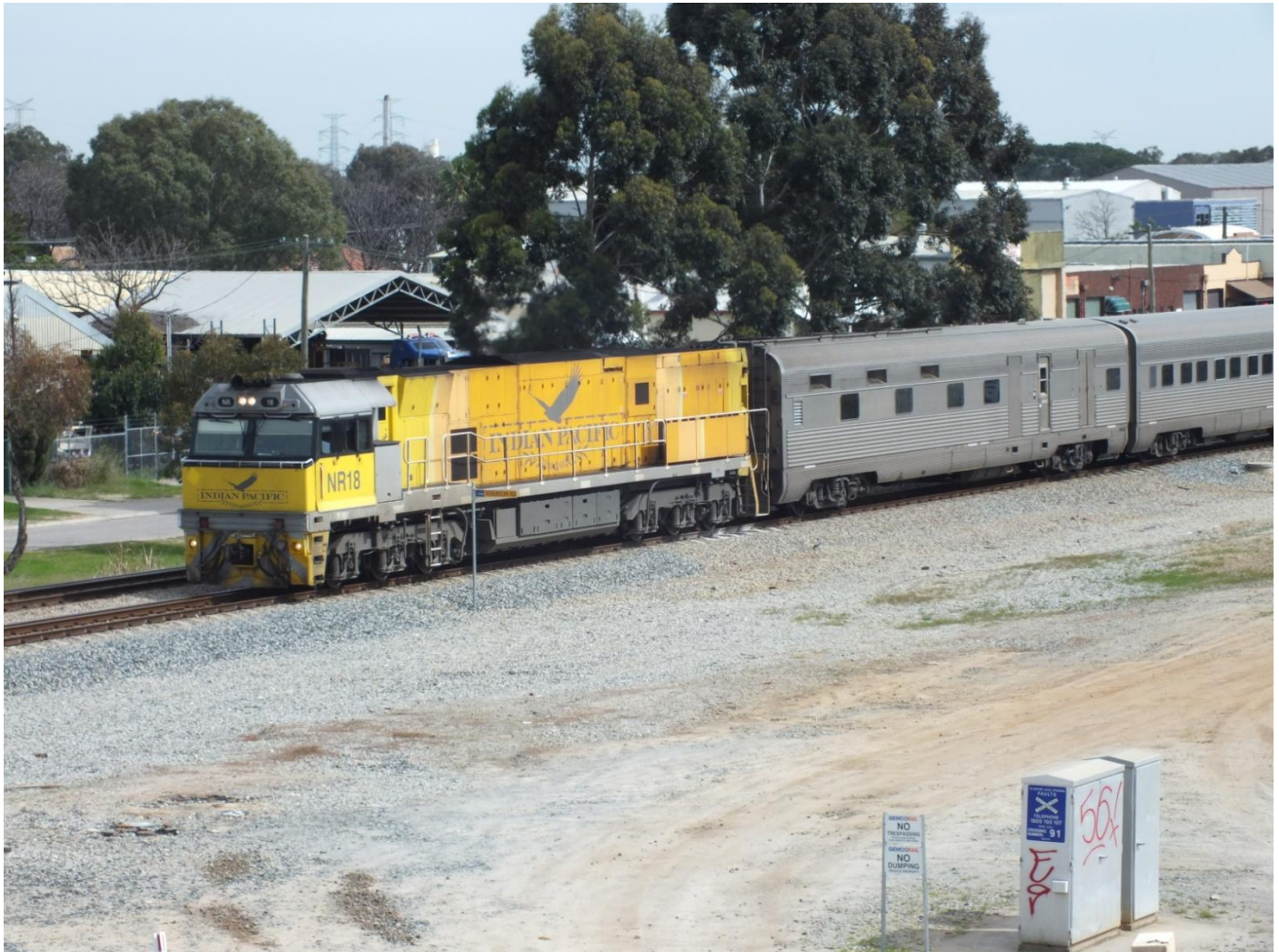
NR18 on 1PA8 Indian Pacific passenger train at Bellevue August 18th.

CBH011 the final MP27CN locomotive on order was railed at north Port Fremantle on August 25th then hauled to Gemco Forrestfield for commissioning. CBH012 thru CBH017 heavier MP33CN locomotives have all been completed by MotivePower and are in transit to WA. The five standard gauge MP33C locomotives have been numbered CBH118 thru CBH122 to differentiate and avoid confusion with the narrow gauge units also classed CBH.