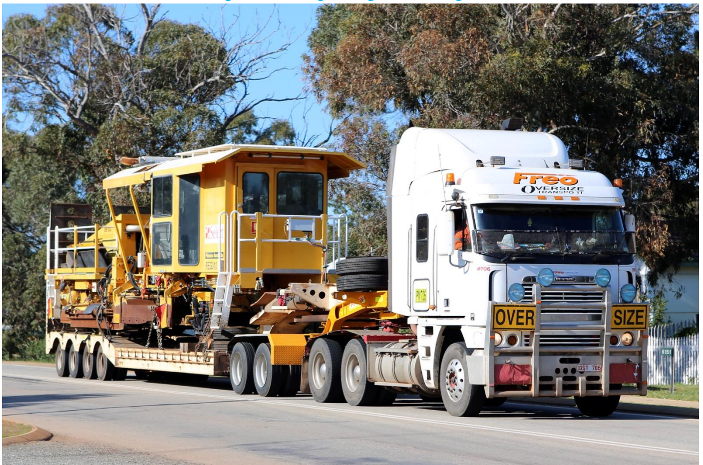
Plasser Australia ballast regulator being hauled through Bindoon August 25th.