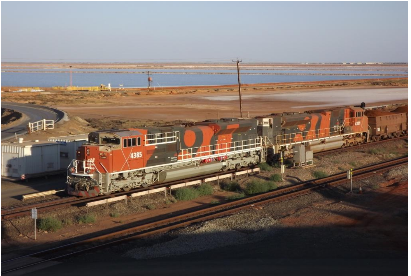
New SD70ACe/lc 4385 & 4311 on loaded ore train entering Nelson Point August 28th.