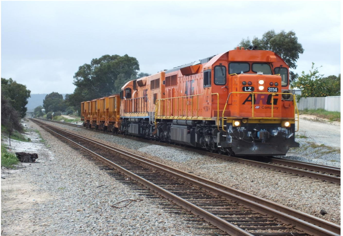
LZ3114 & L3118 on 3032 with 5 ore cars to Kwinana to dump at Thornlie August 28th.