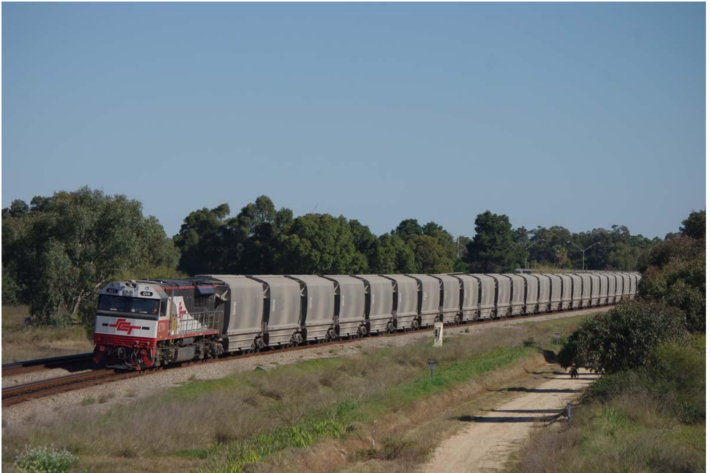
SCT014 on 7S57 empty grain at Welshpool August 18th.