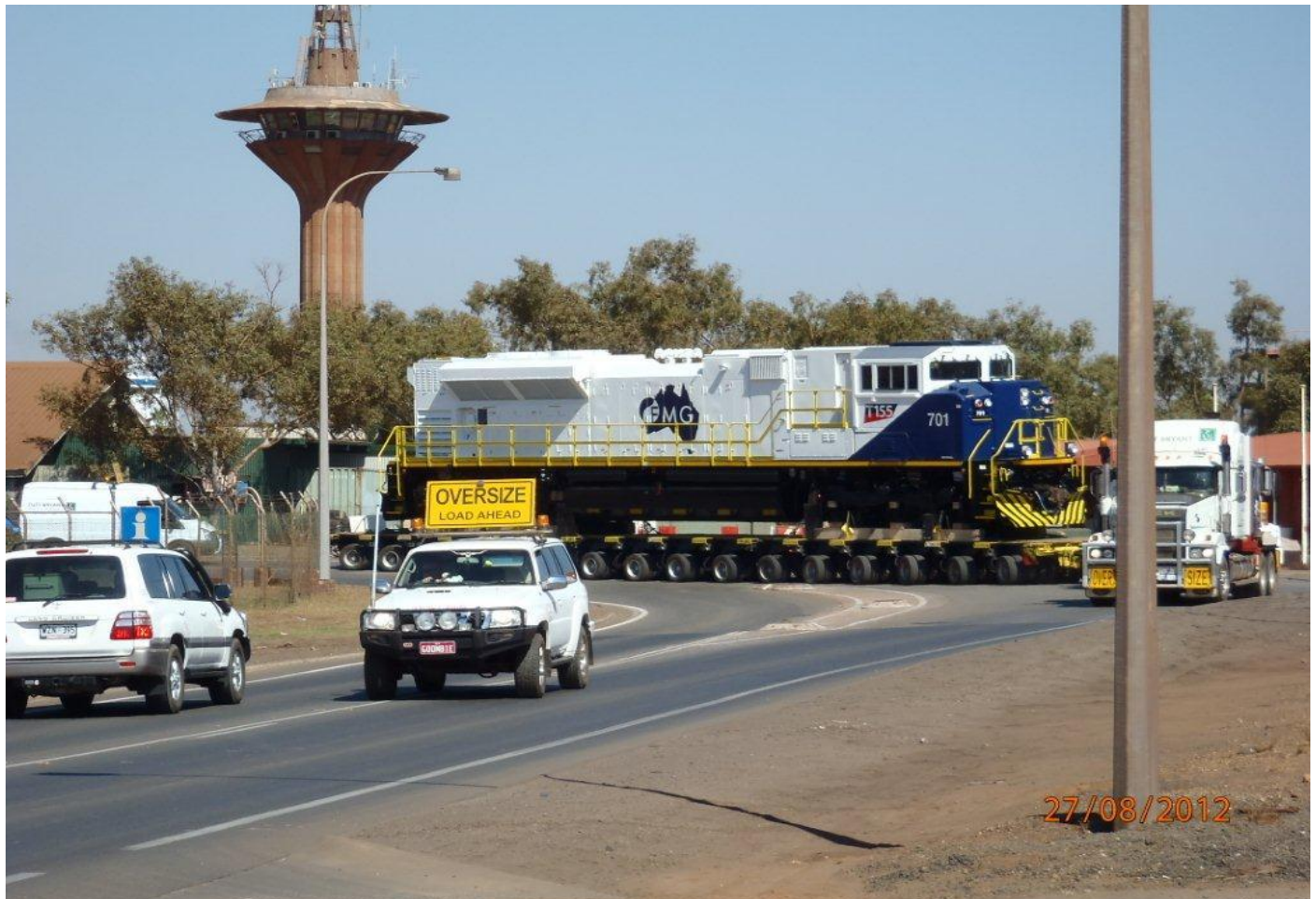
SD70ACe locomotive #701 being hauled out of Port Hedland port area to FMG yard 27/8.