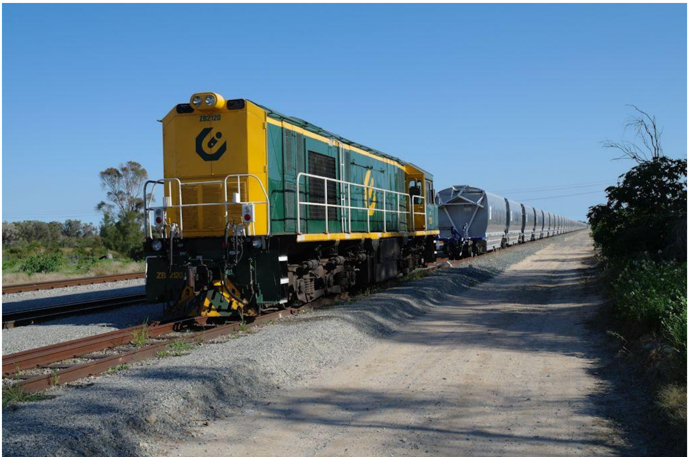
ZB2120 stabled at CBH Kwinana terminal with rake of CBHN wagons August 25th.