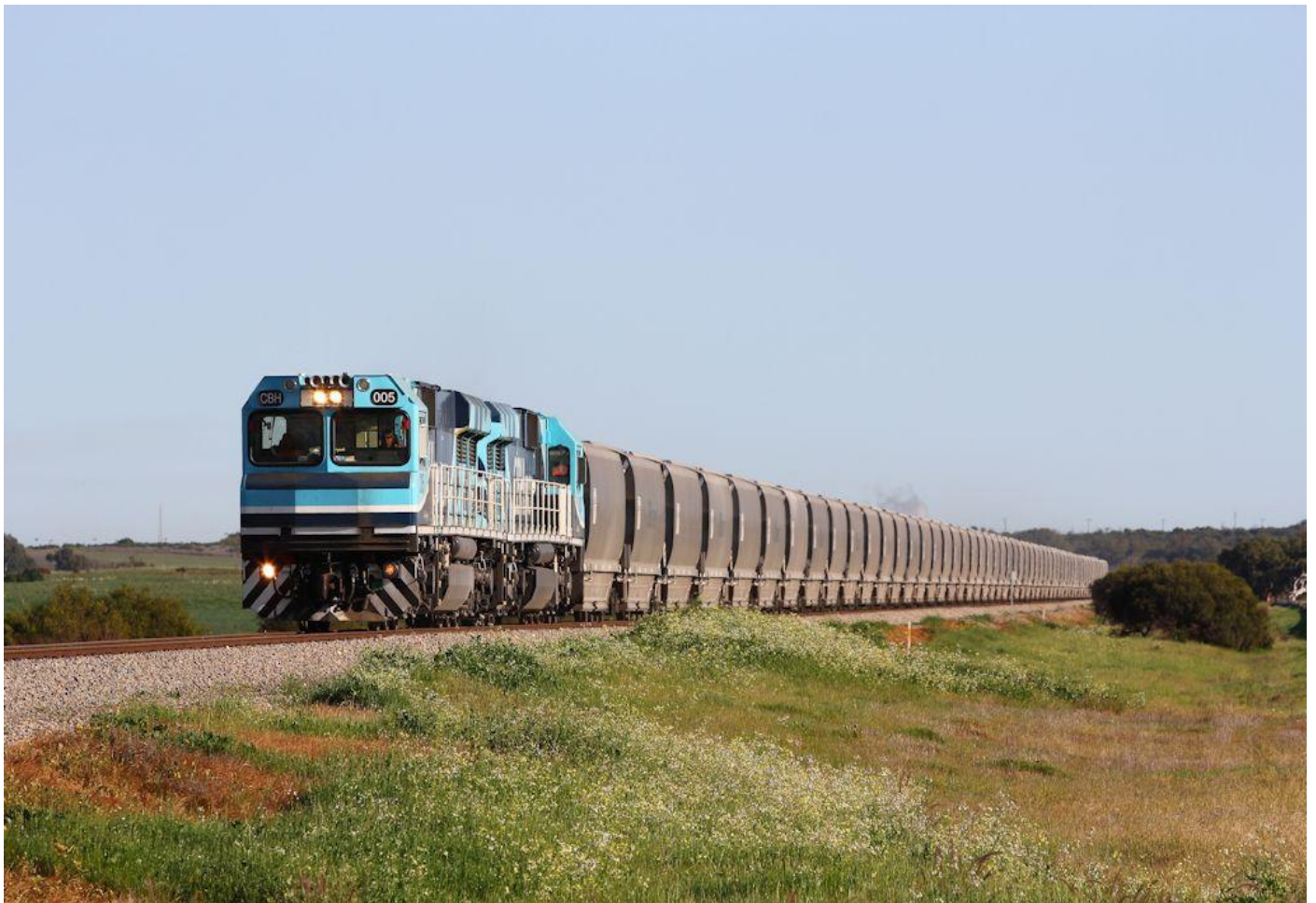
CBH005 & CBH003 on empty Watco grain train at Bootenal August 25th.