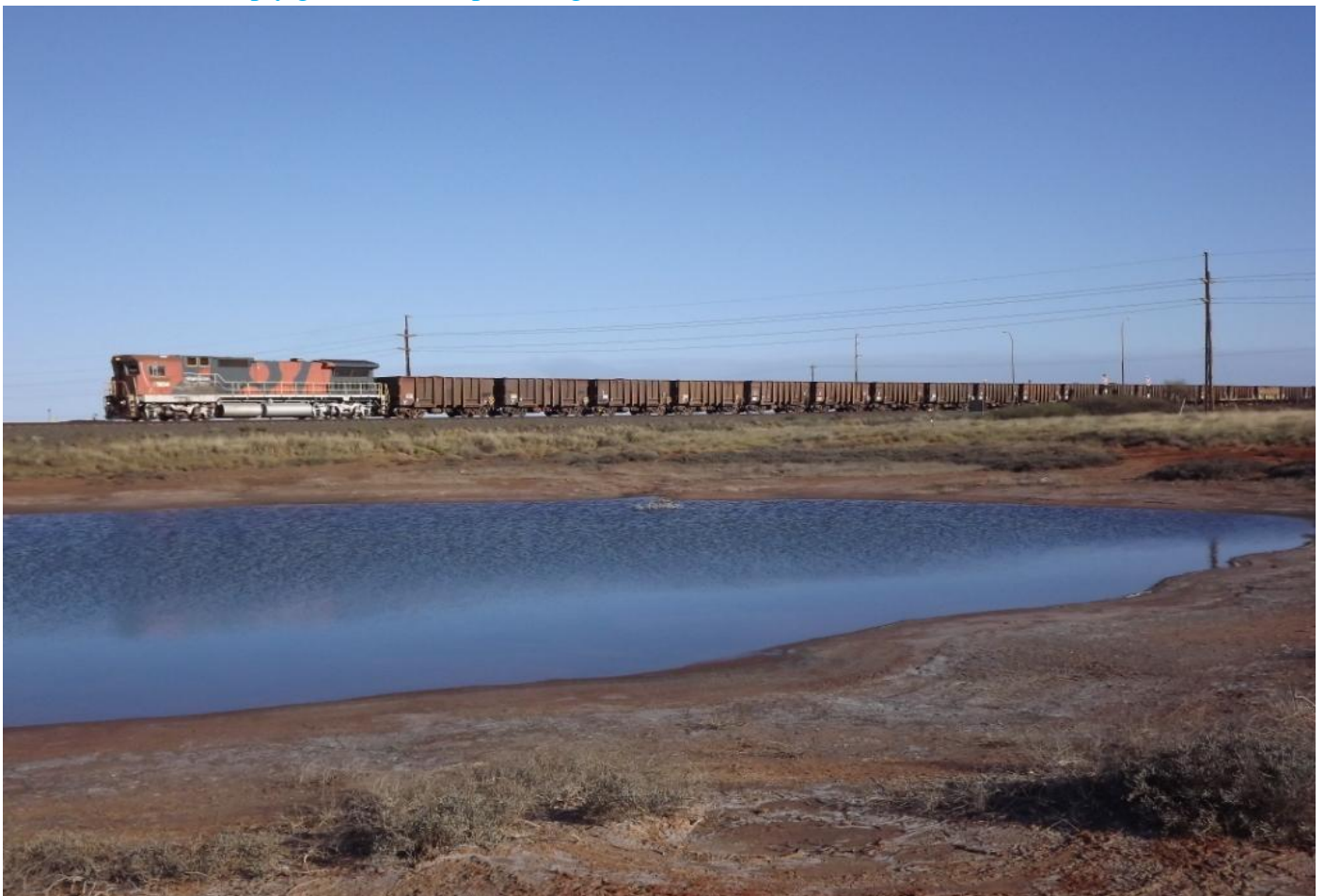
Yarrrie ore train passing the tidal flats as it approaches Port Hedland August 24th.