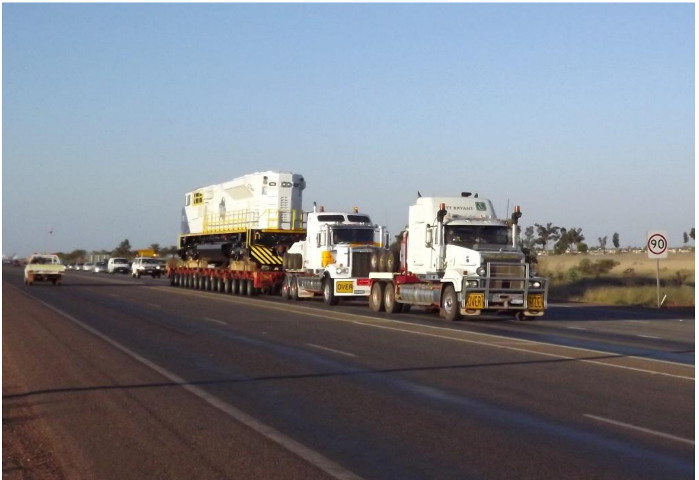
FMG SD70ACe #705 on float being hauled through Wedgefield on August 28th.