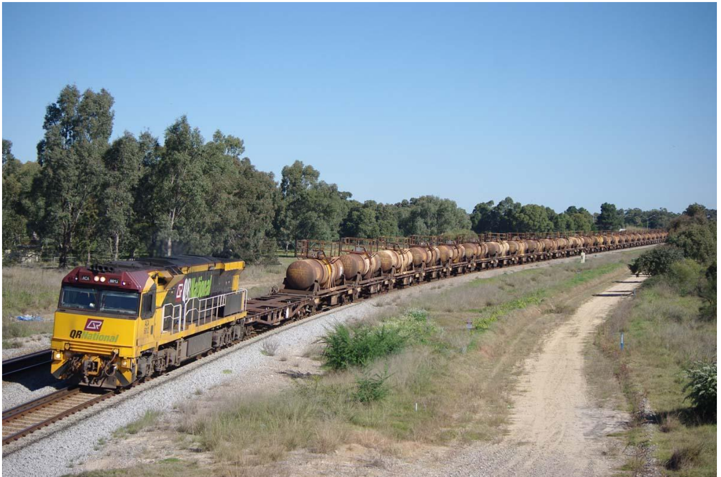
ACA6012 on 7167 empty acid tankers at Welshpool August 18th.