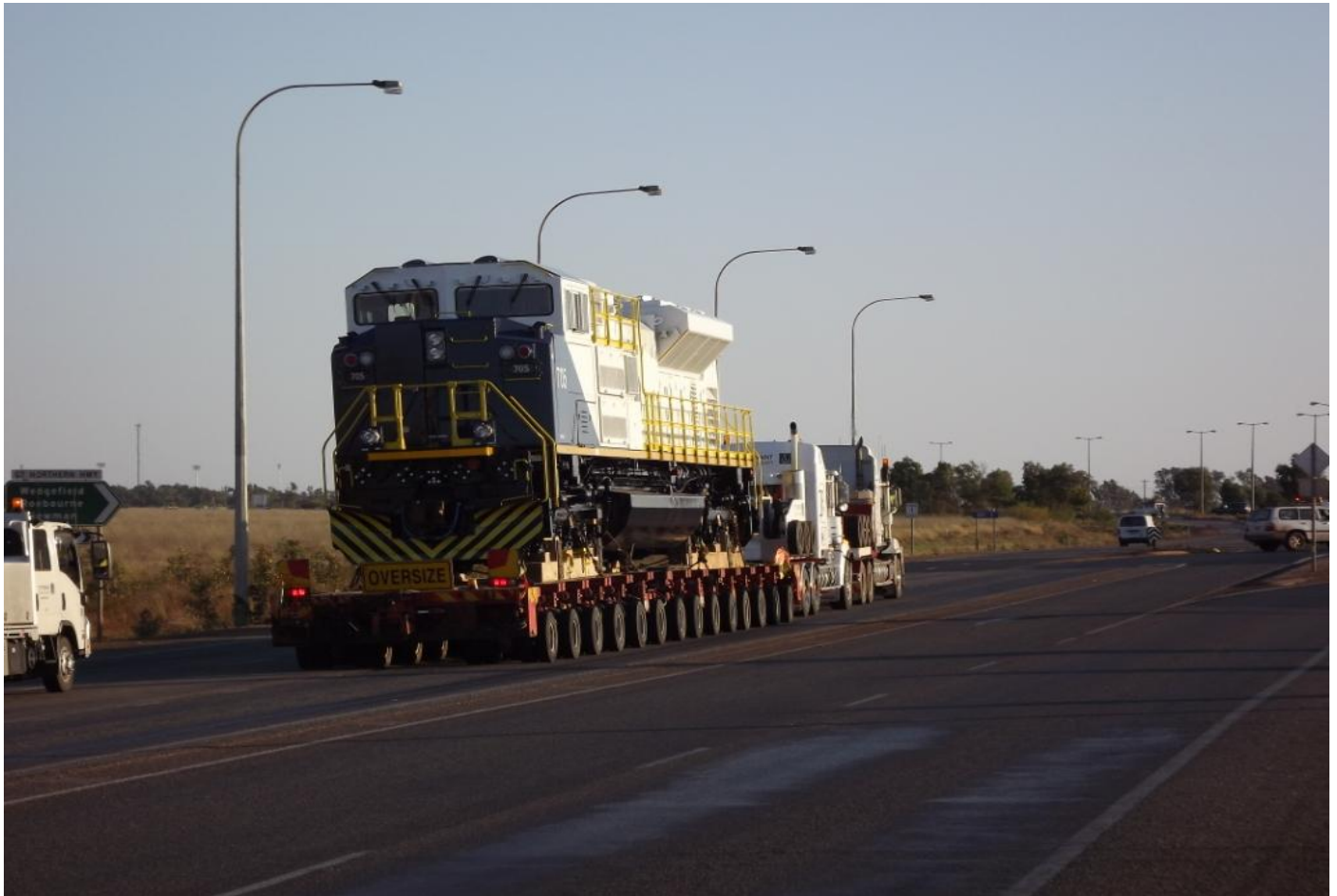
FMG SD70ACe #705 at Great Northern Highway turnoff Wedgefield on August 28th.