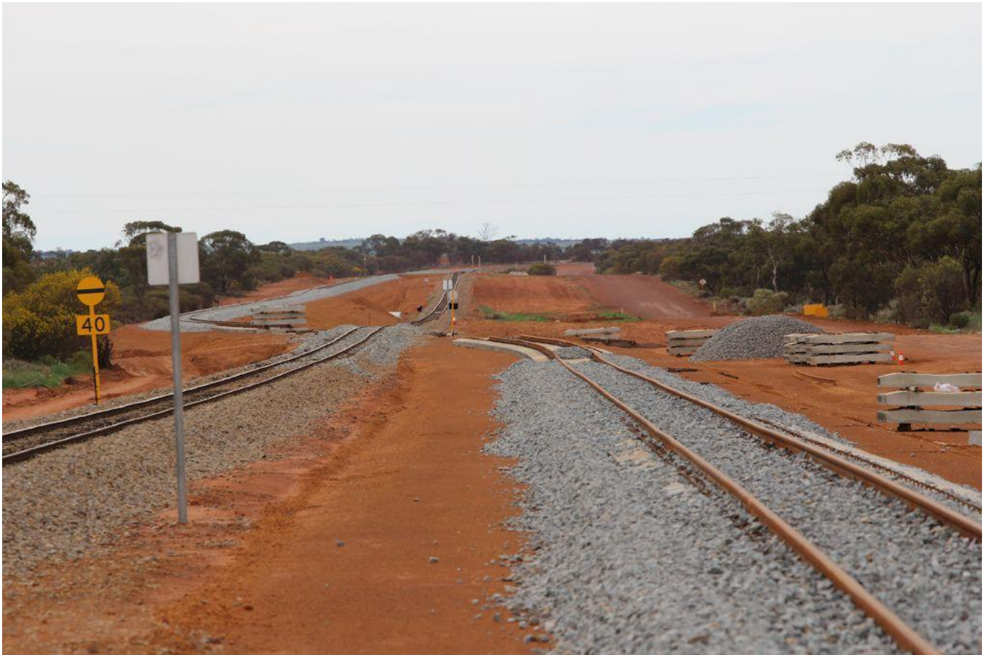
Evaside Road level crossing at Pintharuka with old Perenjori line still in use August 19th.