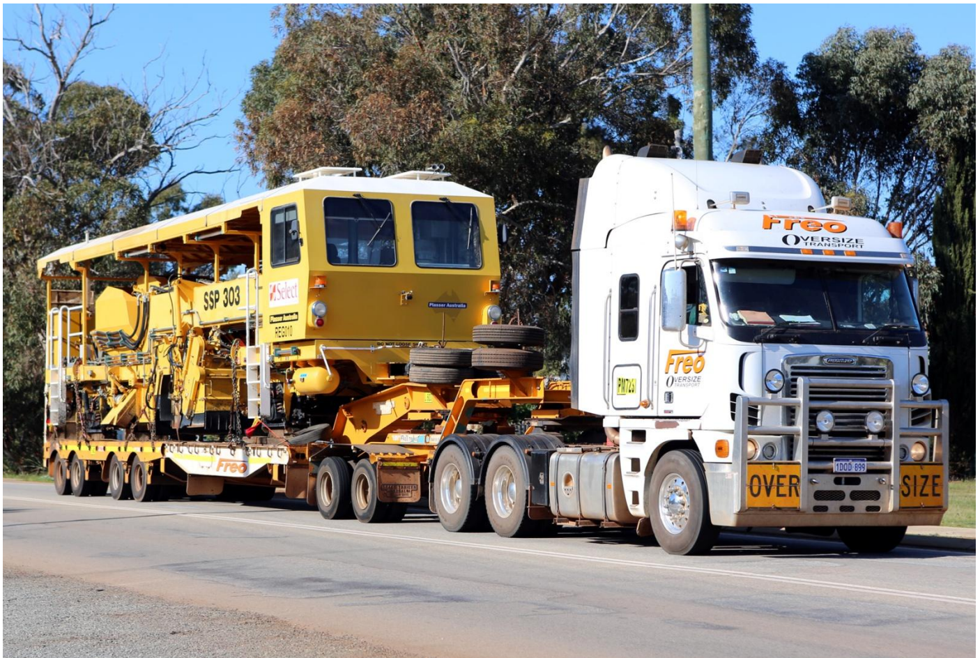
Plasser Australia tamper on road float at Bindoon on August 25th.