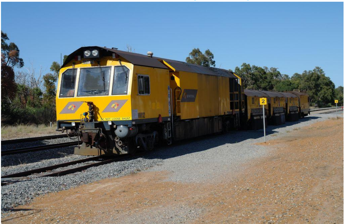
MMY32 rail grinder stabled at Mundijong siding August 25th.