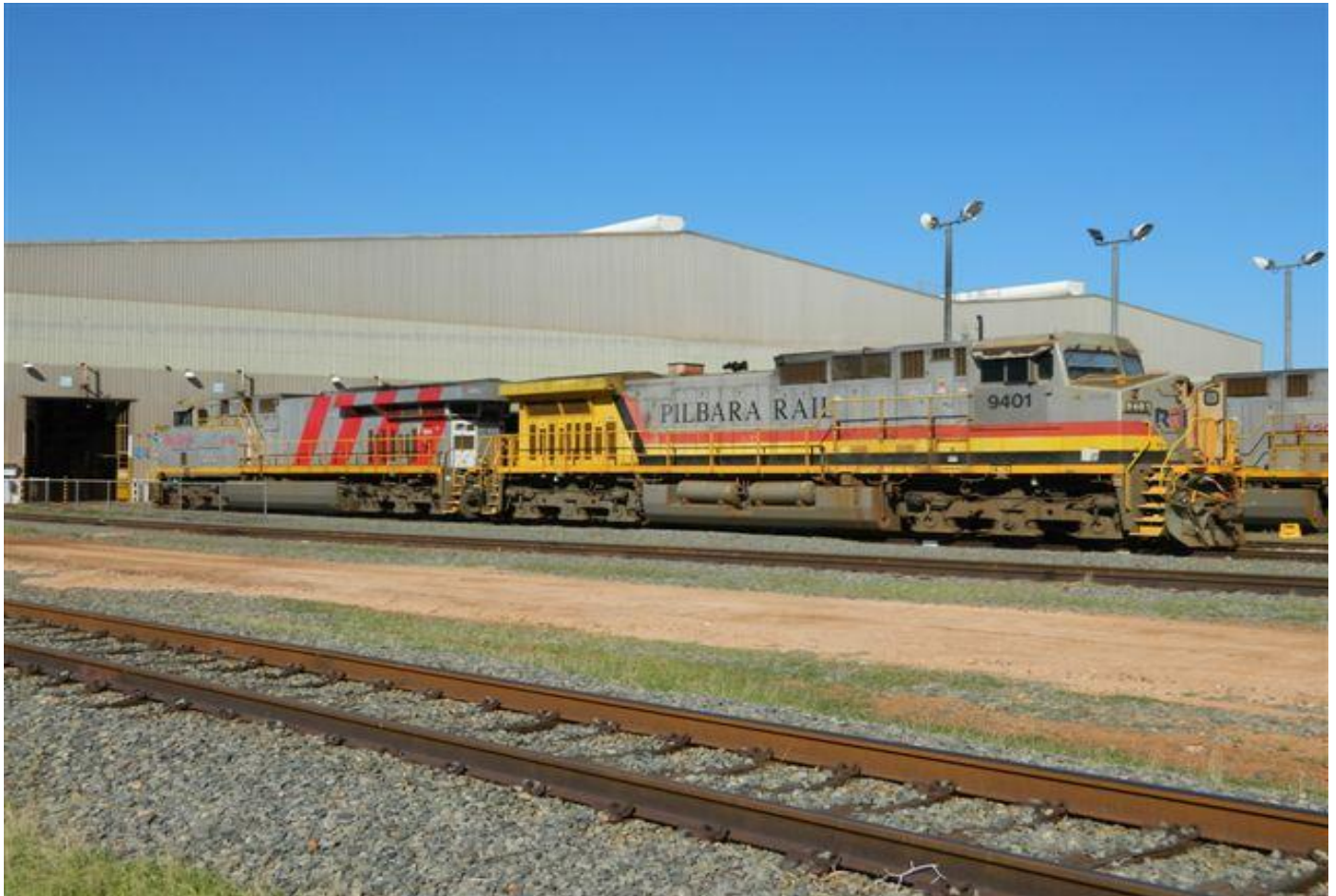
First dash9 obtained for Robe River after Rio Tinto takeover 9401 at 7 Mile yard 22/8.