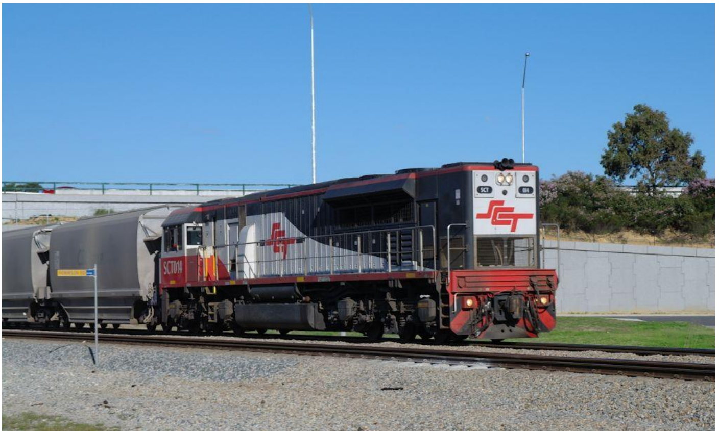
SCT014 long end leading on 1S56 Watco grain train at Bellevue August 26th.