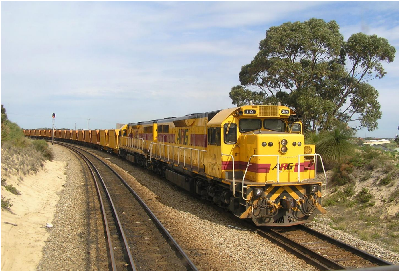
LQ2121 & LZ3112 on 6035 empty ore run through Cockburn Junction 17/8.