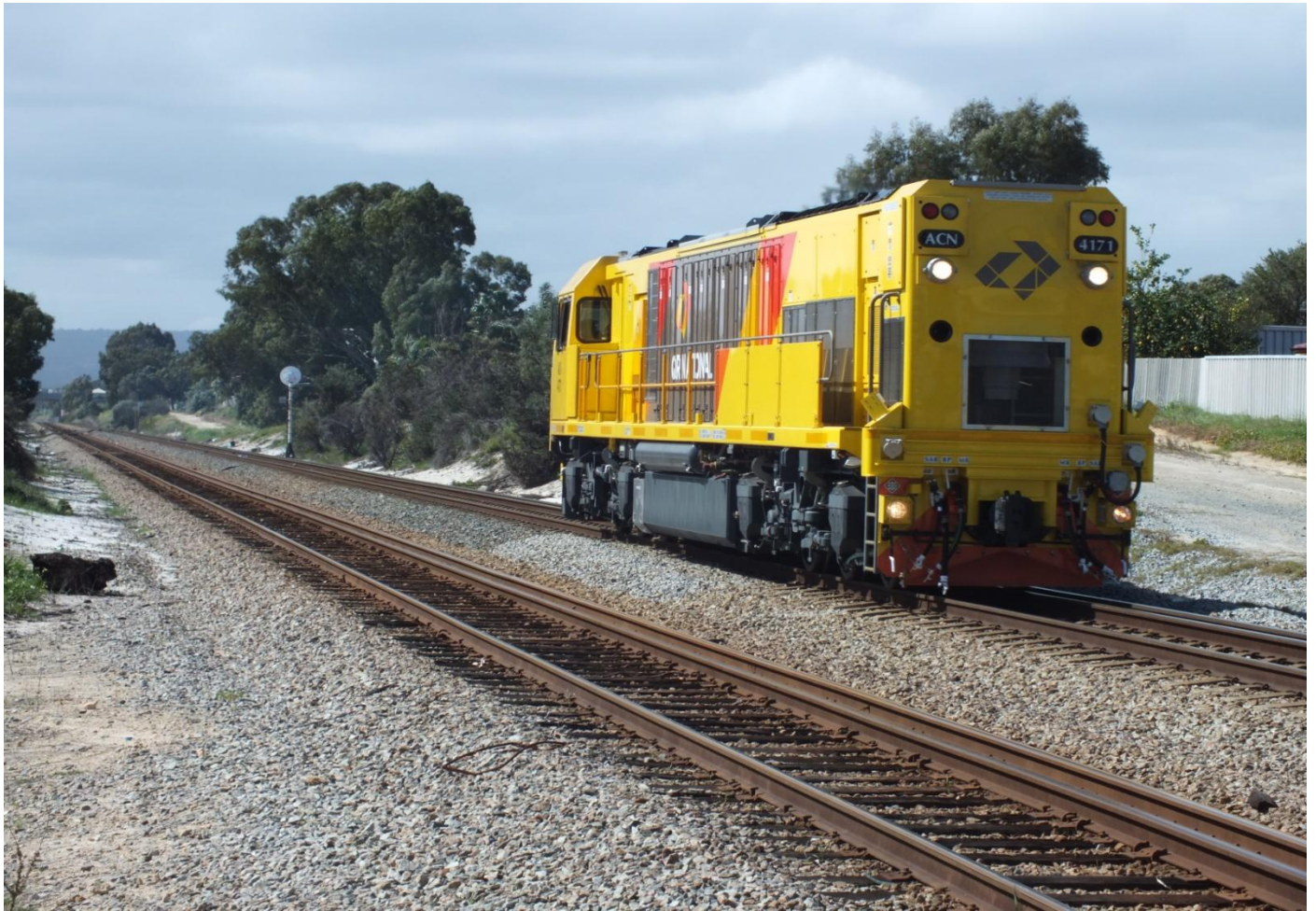
ACN4171 on 5122 light engine trial to Kwinana at Thornlie August 28th.