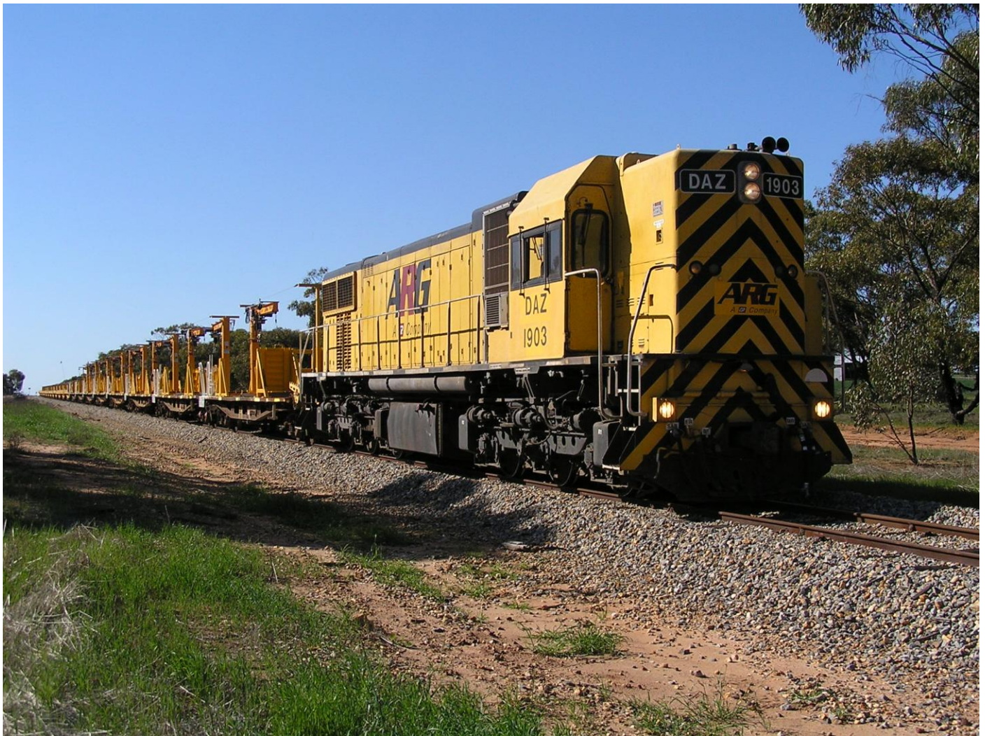
DAZ1903 on 5RT2 empty rail train departing Marchagee August 30th.