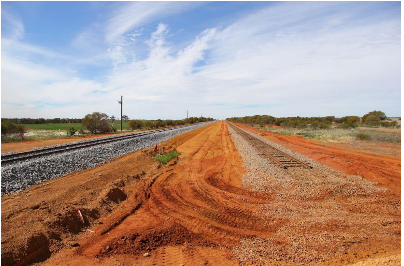
Williams Road level crossing south of Mullewa showing abandoned old line on right with new heavy duty Perenjori line now in use to the left August 19th.