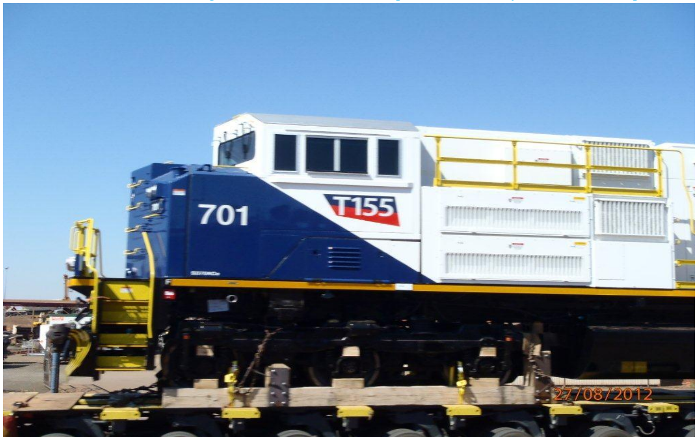
SD70ACe #701 at Port Hedland with T155 symbol on cab side being FMG anticipated tonnages following the expansion of it operations to 155 million tons pa capacity August 27th.