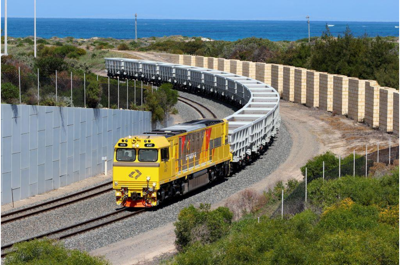
ACN4147 on 8 empty AOKF 2xpack ore cars to Geraldton Port to test car dumper 29/8.

Brookfield Rail commissioned the next section of the new Centralised Traffic Control on Narngulu Mullewa line between Grants [21km] and Eradu [70km] over week of 27th to 31st August. Now three aspect route signalling replaces the existing Train Order System and Self Restoring Points on this section of the line. MidWest Train Control will control this section from the Midland Train Control Centre.