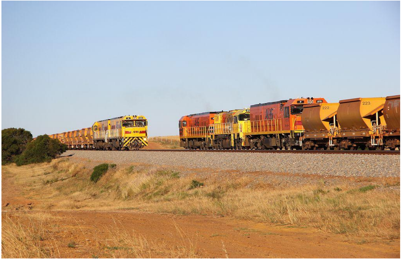
P2515 & P2514 on 1717 ore train crossing P2503, DFZ2402 & P2615 on 7722 empty ore train at Grants crossing loop on November 11th.