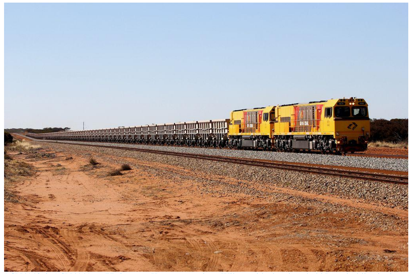
ACN4148 & ACN4141 on 7762 empty Karara ore train at Wilroy with abandoned old Perenjori line in the foreground note the improved gradient of the new line November 17th.