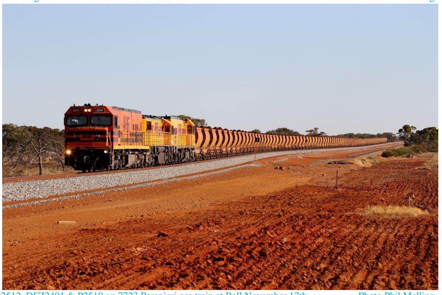
2512, DFZ2401 & P2510 on 7723 Perenjori ore train at Bell November 17th.