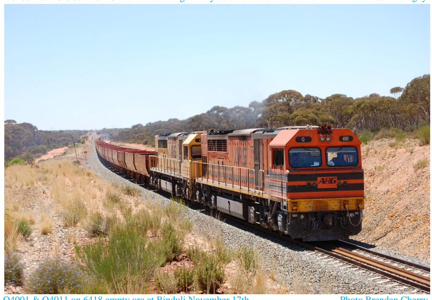
Q4001 & Q4011 on 6418 empty ore at Binduli November 17th.