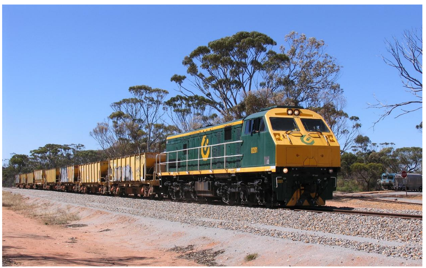
U201 on 1QB2 empty ballast passes Moora CBH with Watco grain November 11th.