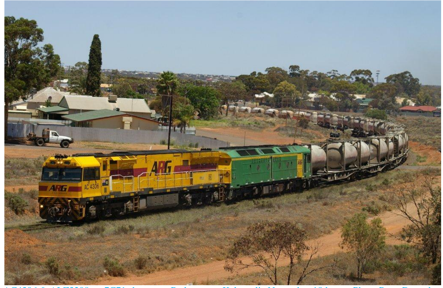
AC4306 & ALZ3208 on 7C71 shunter to Parkeston at Kalgoorlie November 18th.