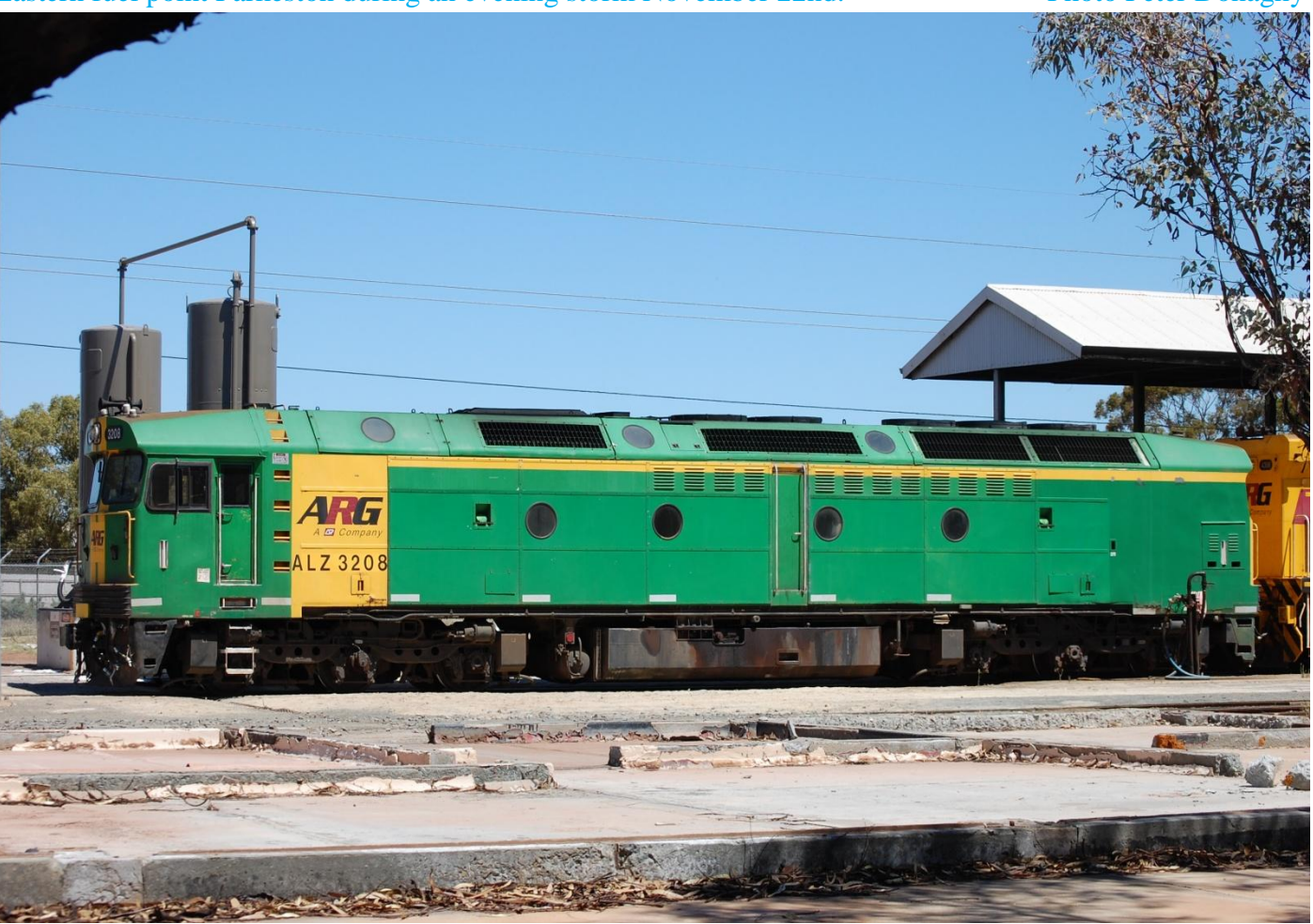
ALZ3208 at Kalgoorlie Loco November 17th.