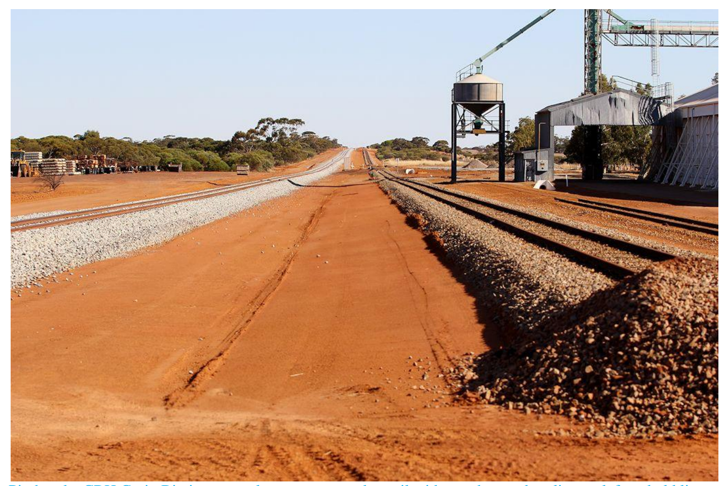
Pintharuka CBH Grain Bin is now no longer connected to rail with new heavy duty line on left and old line on the right still connected to the bin November 17th.