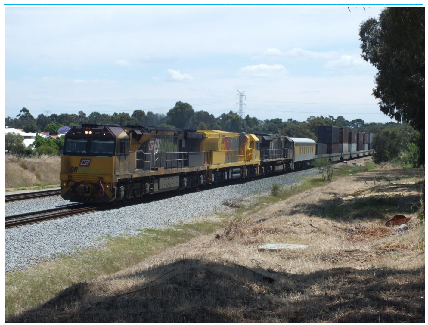
6007, 6023 & LDP005 on 3PM1 QRN intermodal at Woodbridge on November 22nd.

Overhaul and refurbishing of CFCLA CM40-8M CD4302 [ex Robe River 9421], CD4303 [ex Robe River 9423] and CD4304 [ex Robe River 9417] is still underway at UGR Bassendean. Completed CD4301 is in use on ballast trains on FMG Solomon extension.