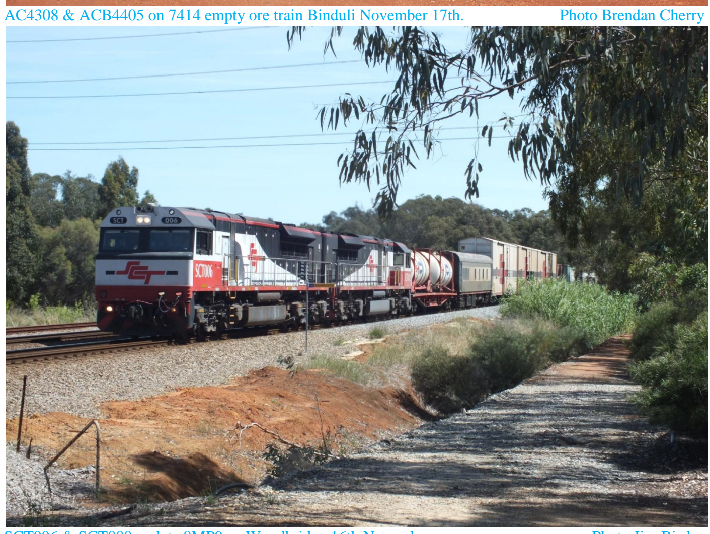
SCT006 & SCT000 on late 8MP9 ay Woodbridge 16th November.