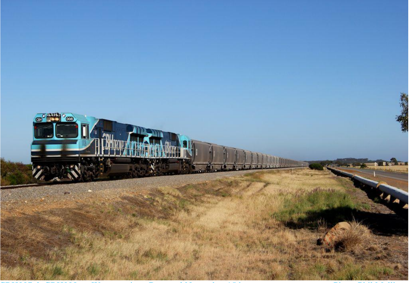
CBH007 & CBH008 on Watco grain at Bootenal November 15th.