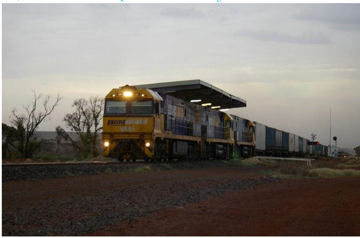
NR45, NR55 & NR15 on 3SP7 during storm at Parkeston November 22nd.