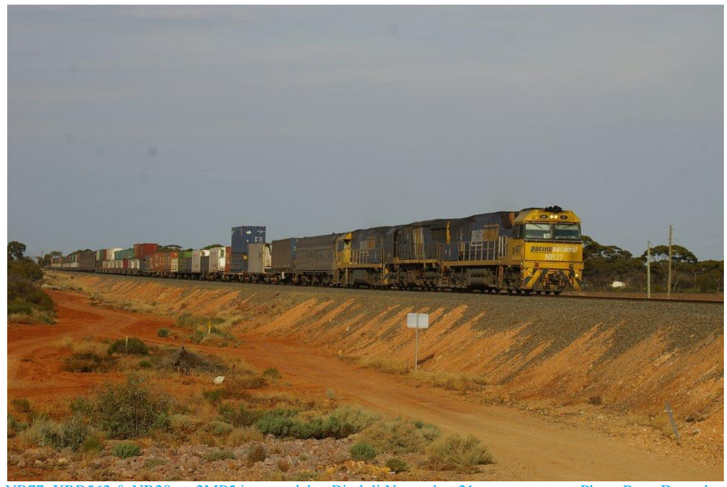
NR77, XRB562 & NR20 on 2MP5 intermodal at Binduli November 21st.