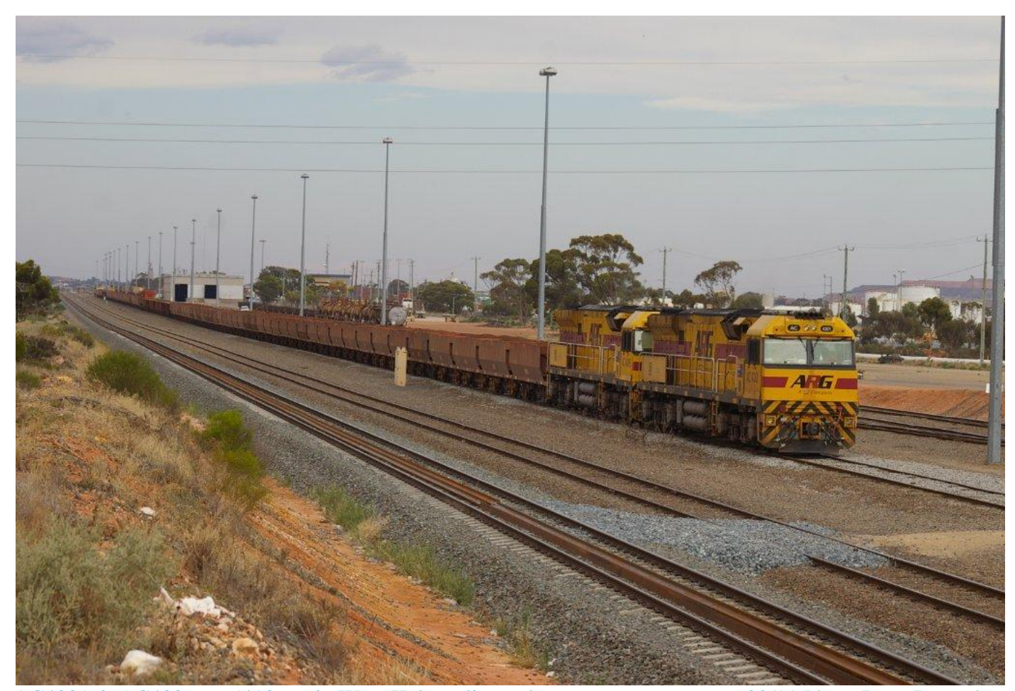
AC4301 & AC4306 on 5413 ore in West Kalgoorlie yard a now rare occurrence 22/11.