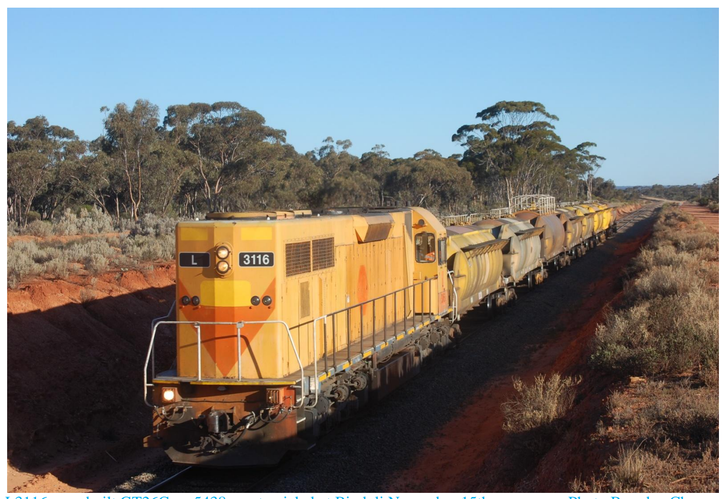
L3116 un-rebuilt GT26C on 5438 empty nickel at Binduli November 15th.