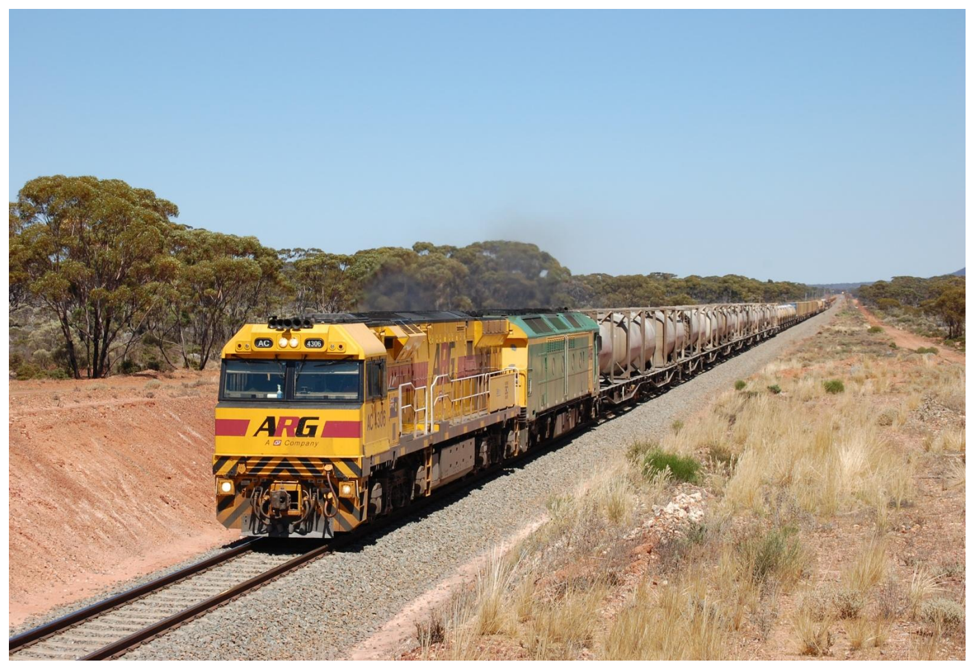
AC4306 & ALZ3208 on late 6025 mixed freight ex Forrestfield at Bonnie Vale 17/11.