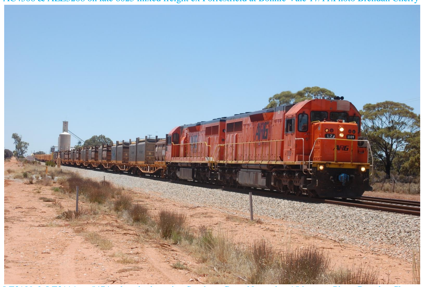
LZ3109 & LZ3114 on 5474 salt train departing Southern Cross November 15th.