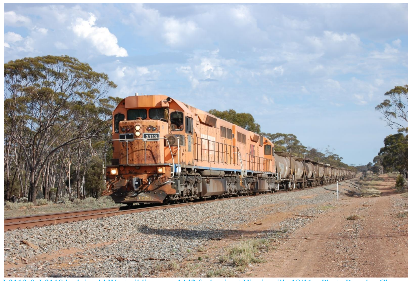
L3113 & L3118 both in old Westrail livery on 1442 fuel train at Higginsville 18/11.