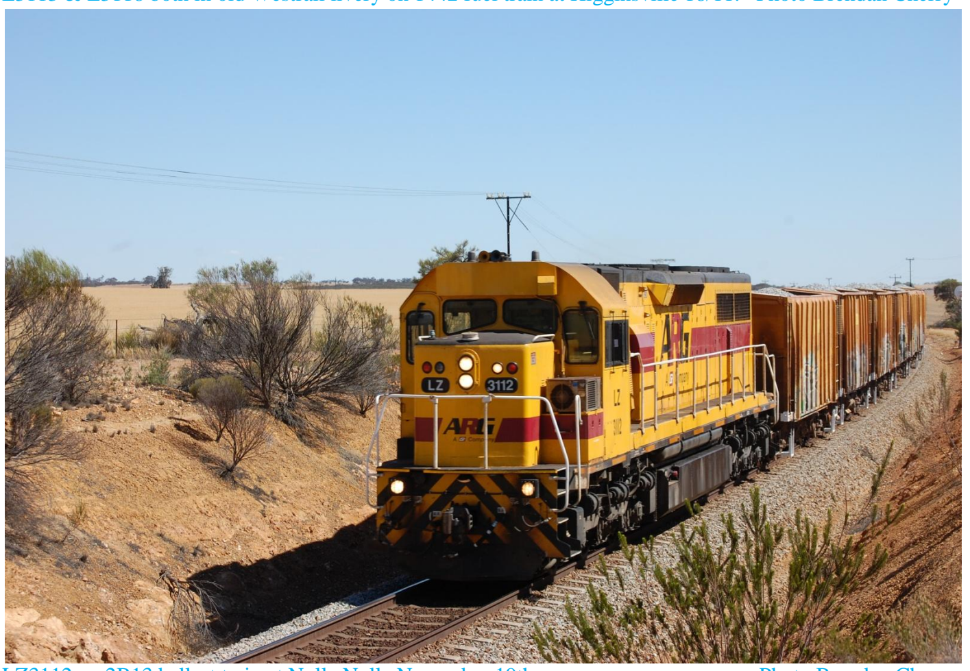
LZ3112 on 2B13 ballast train at Nulla Nulla November 19th.