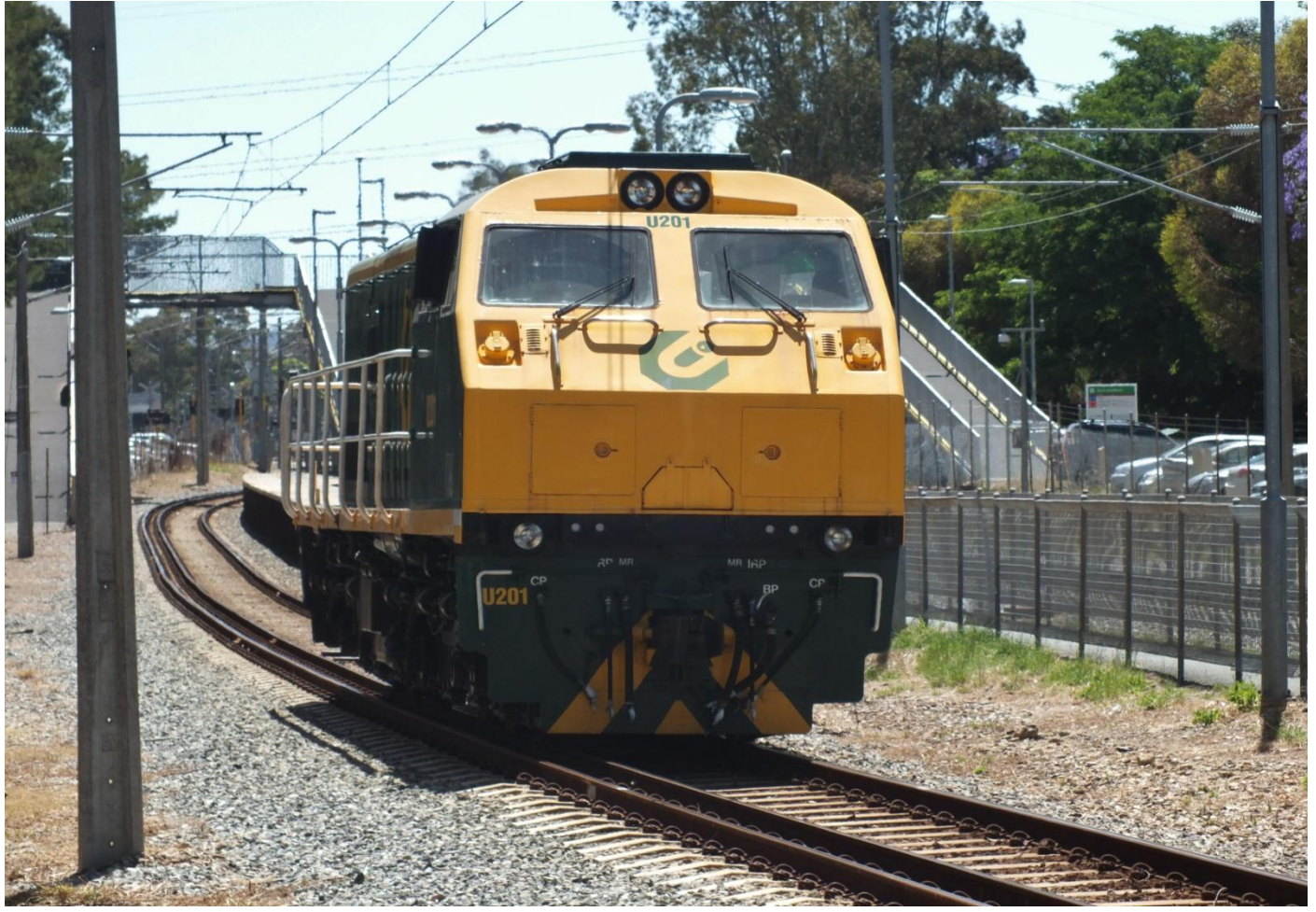
U201 on 6QB under the wires at East Guildford running to Forrestfield November 16th.

6024 & 6008 run 3MP1 QRN intermodal approaching Kalgoorlie on November 22nd.