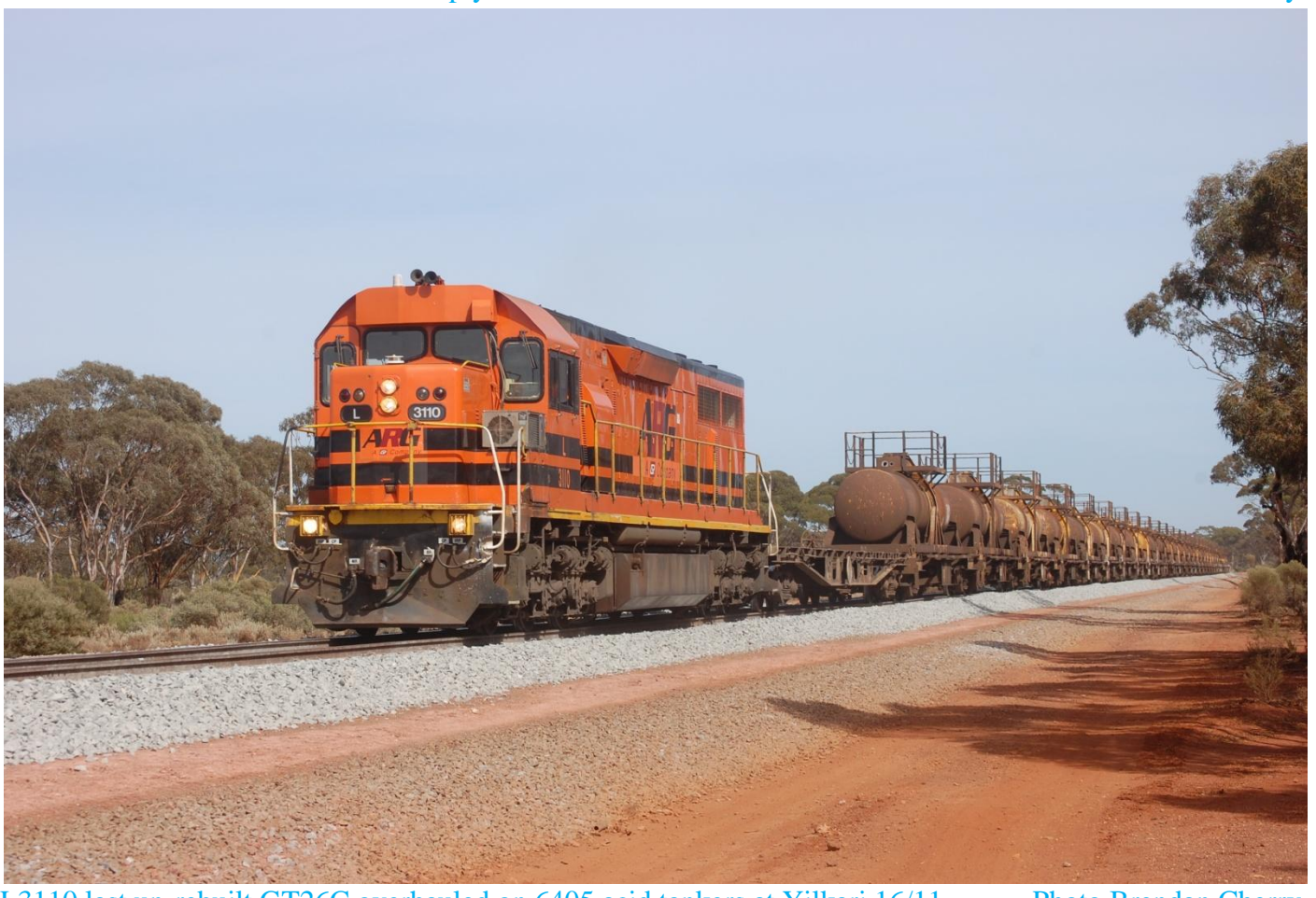
L3110 last un-rebuilt GT26C overhauled on 6405 acid tankers at Yilkari 16/11.