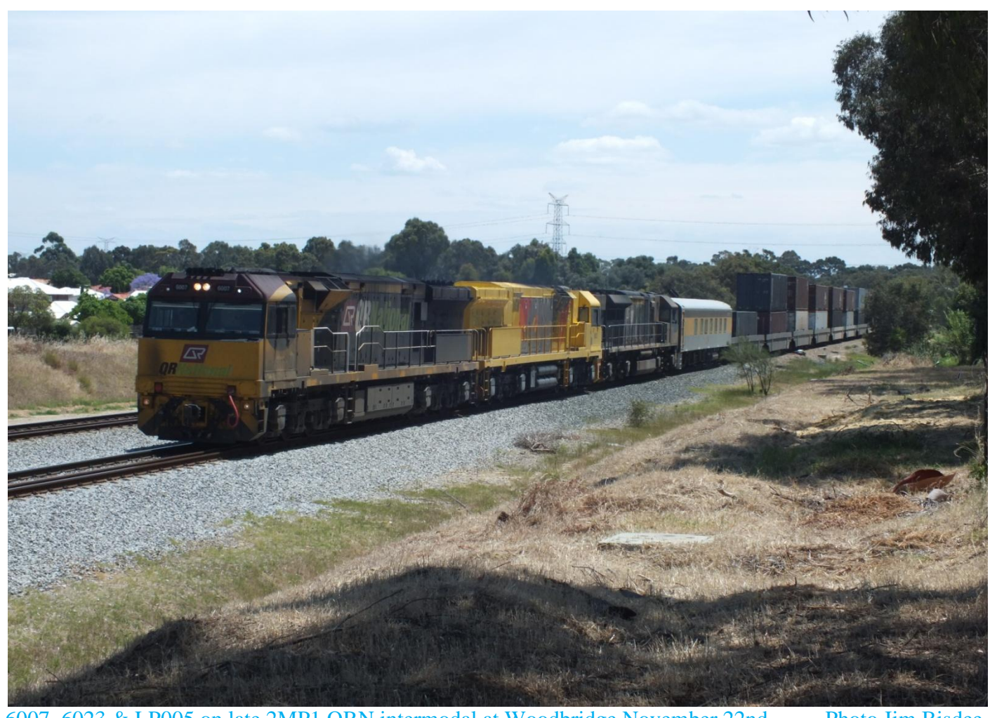
6007, 6023 & LP005 on late 2MP1 QRN intermodal at Woodbridge November 22nd.