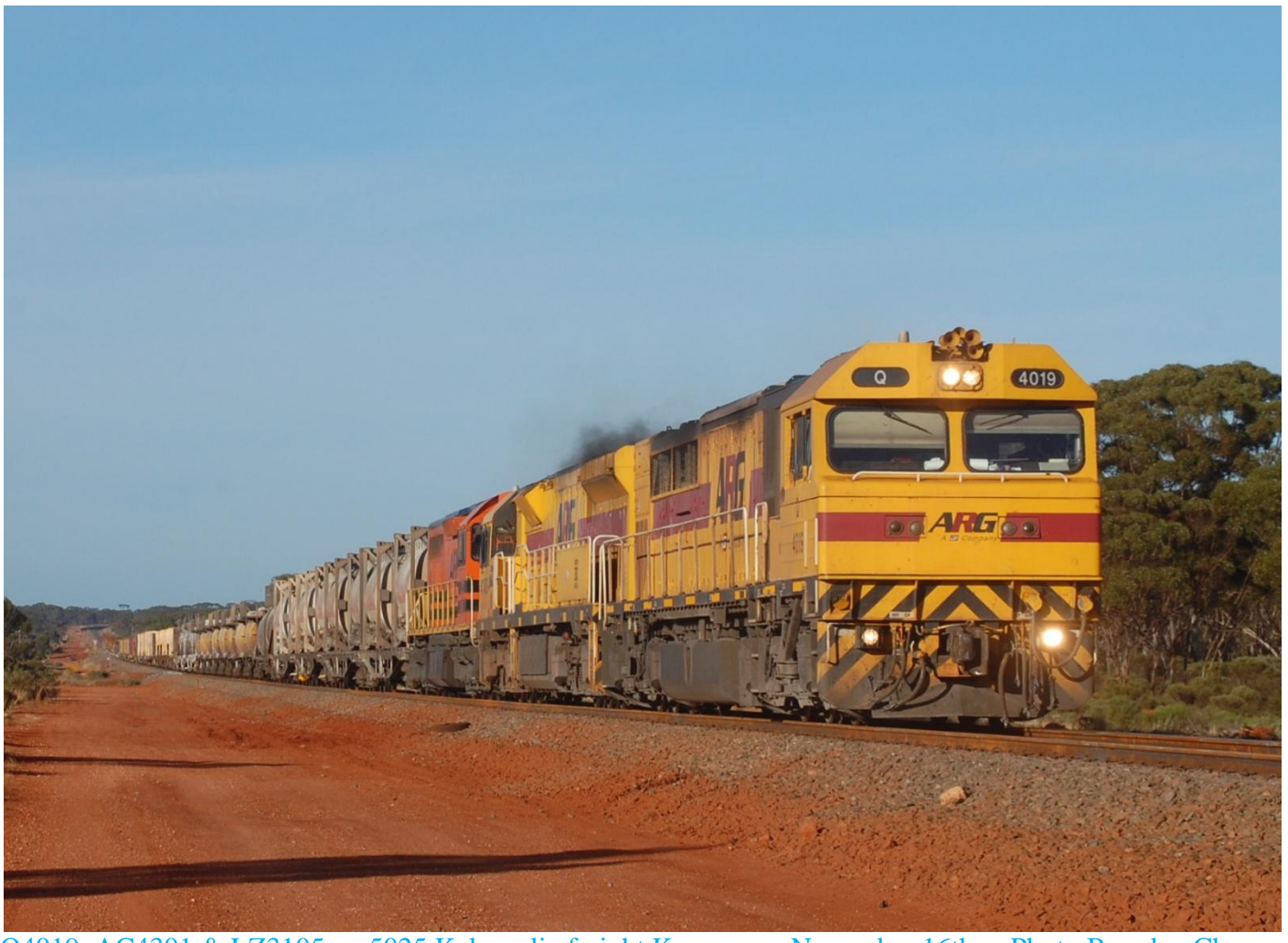
Q4019, AC4301 & LZ3105 on 5025 Kalgoorlie freight Kurrawang November 16th.