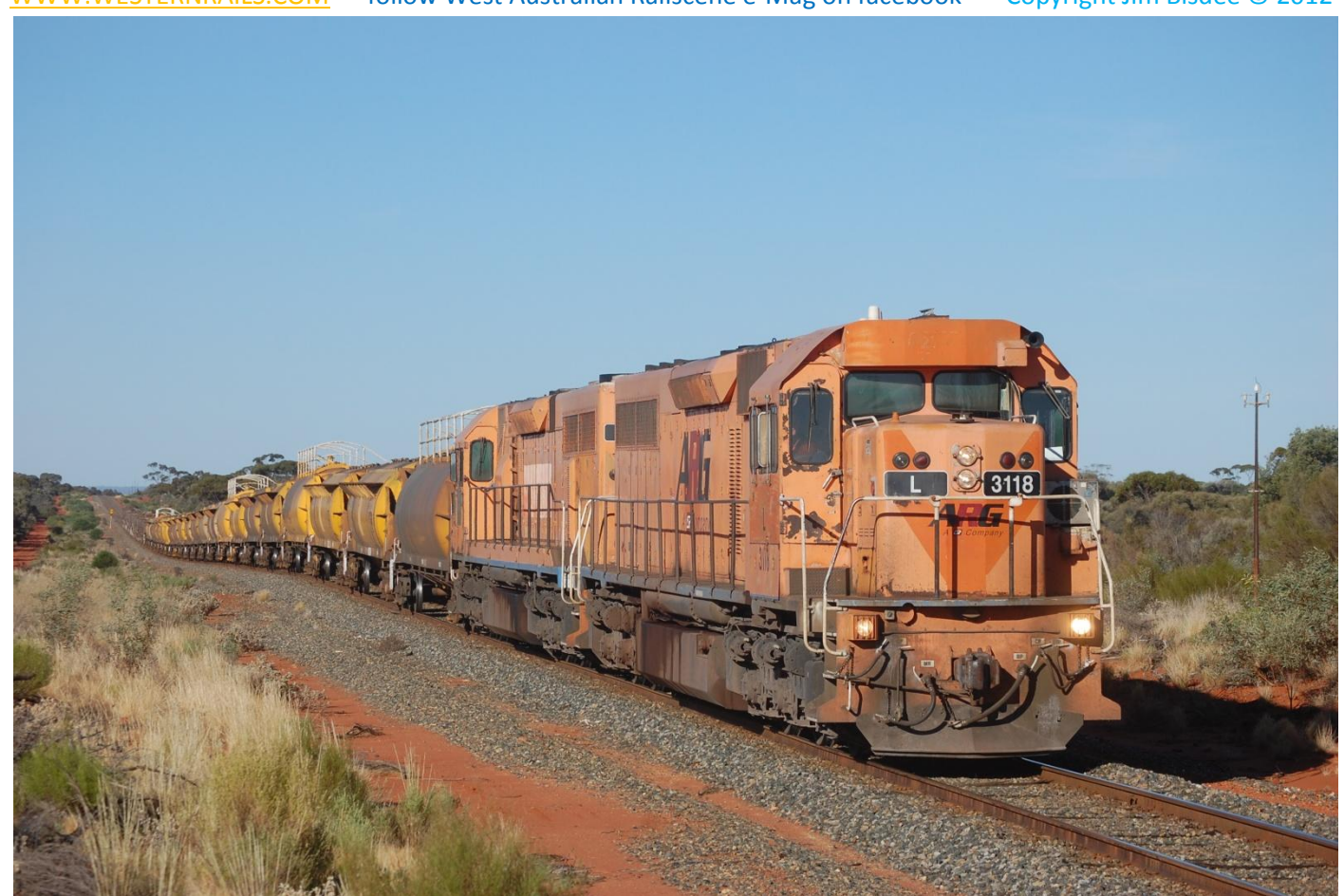
L3118 & L3113 original L class locomotives in very faded old Westrail livery run 6479 empty nickel north on the rolling grades of the Leonora line November 16th that held on long enough to see the nickel boom and be converted from narrow to standard gauge in 1974.

West Australian Railscene e-Mag is published weekly by Jim Bisdee on rail happenings on West Australian Railroads WWW.WESTERNRAILS.COM follow West Australian Railscene e-Mag on facebook Copyright Jim Bisdee © 2012