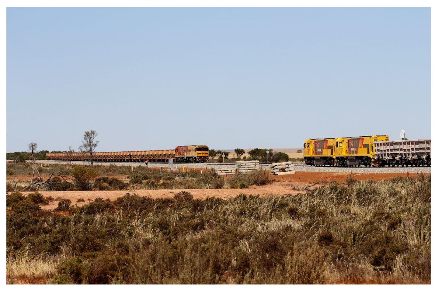
P2502 & P2513 on 7715 ore train crossing ACN4148 & ACN4151 on 7762 empty Karara ore train at new Tenindewa crossing loop on November 17th.