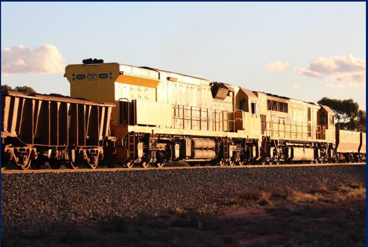
ACB4402 & Q4010 DPU on 7415 ore that had been held at mine owing to derailment, at Bonnie Vale 17/5.