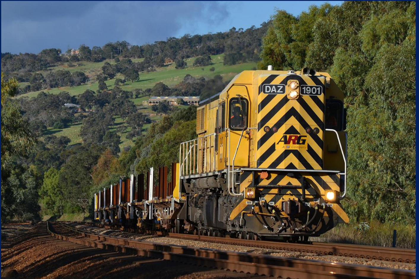
DAZ1901 on 6RT2 empty rail train on its way back to flashbutt at Brigadoon 16/5.