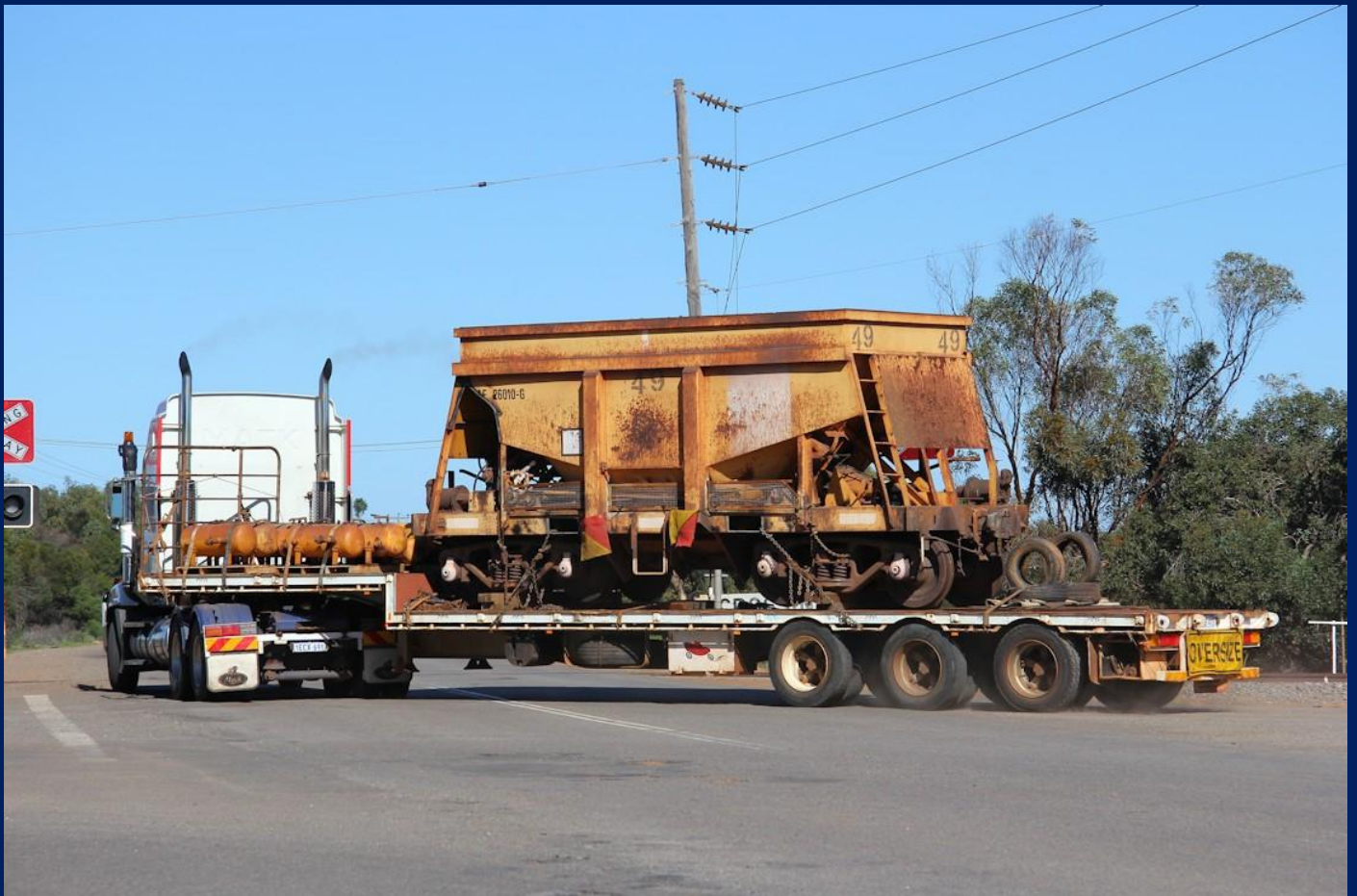
AHAF26010 being hauled away from Narngulu Synthetic Rutile siding to scrap on 30/5.