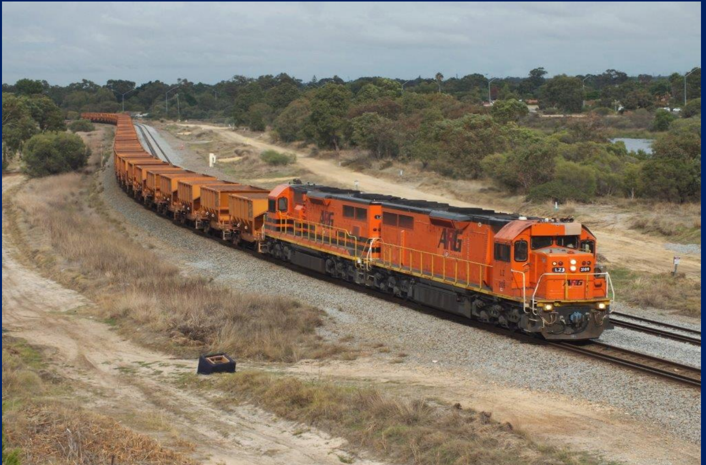
LZ3109 & LZ3117 on 4035 empty ore ex Kwinana running wrong line at Wattle Grove 7/5.