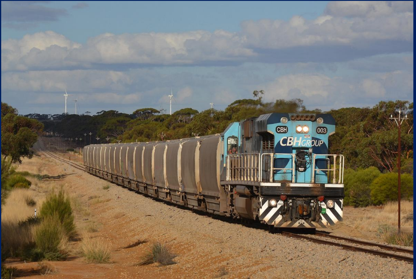
CBH003 on 2M53 Watco/CBH grain ex Narembreen at Collgar April 28th.