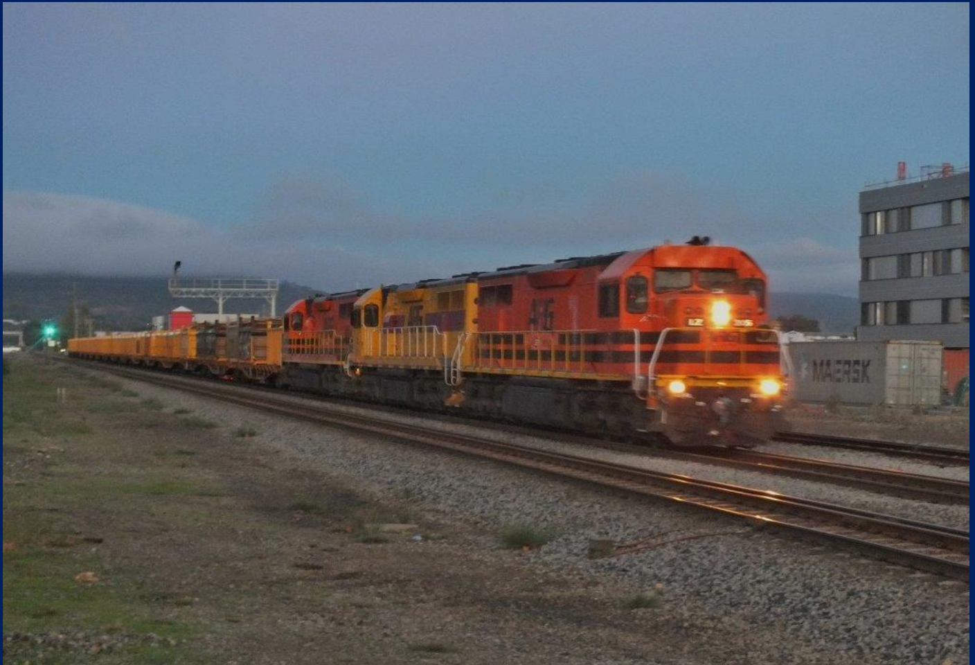
LZ3105, LQ3121 & LZ3117 on 2474 salt train at Midland on sunset May 19th.