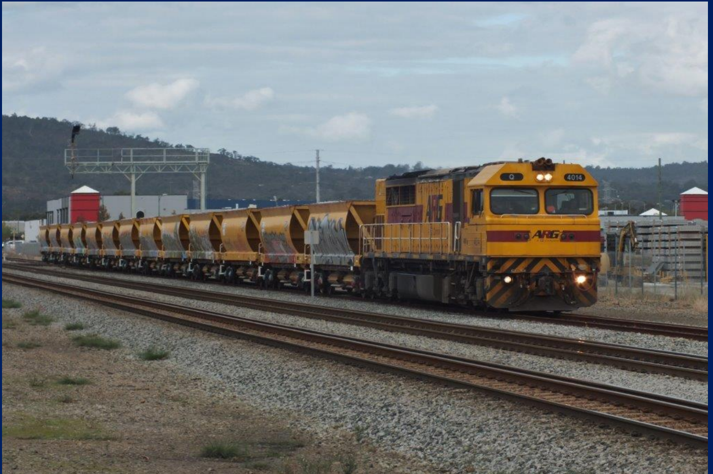
Q4014 on 5BT2 empty ballast in loop Midland about to set back into ballast siding 15/5.