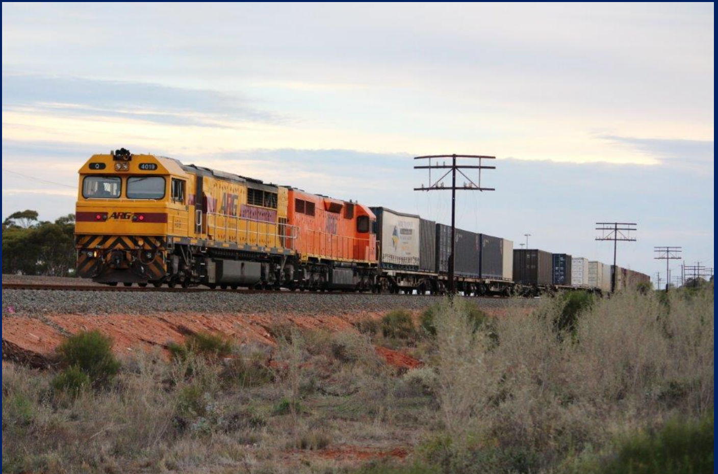
Q4019 & LZ3120 shunting 2PM1 after having tanks on reefers refilled 15/5.