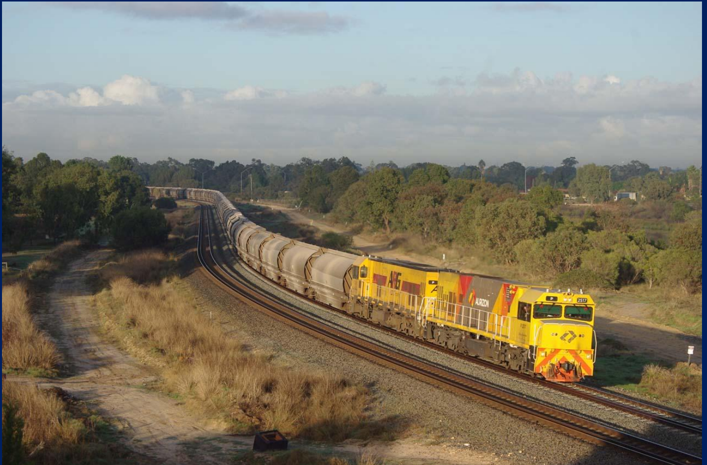
P2517 & P2511 on 6K93 empty Watco/CBH grain at Wattle Grove May 16th.