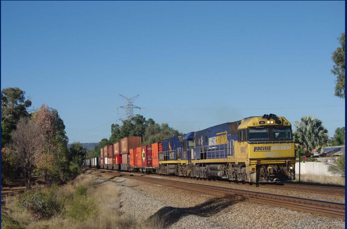
NR41 & NR28 on 1PS6 intermodal at Swan View May 11th.