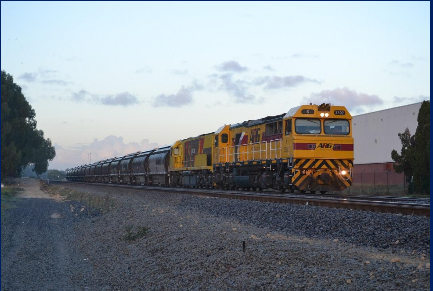
S3302 & ACN4143 on 6121 empty XU wagon movement at Canning Vale 16/5.