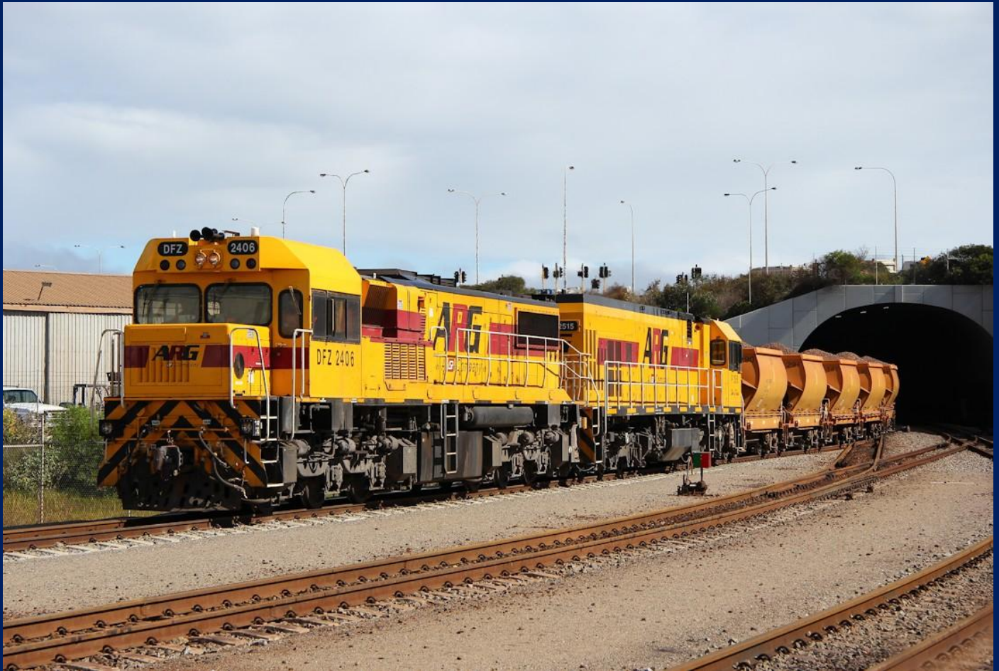
DFZ2406 & P2515 on loaded ore entering Geraldton Port May 6th.