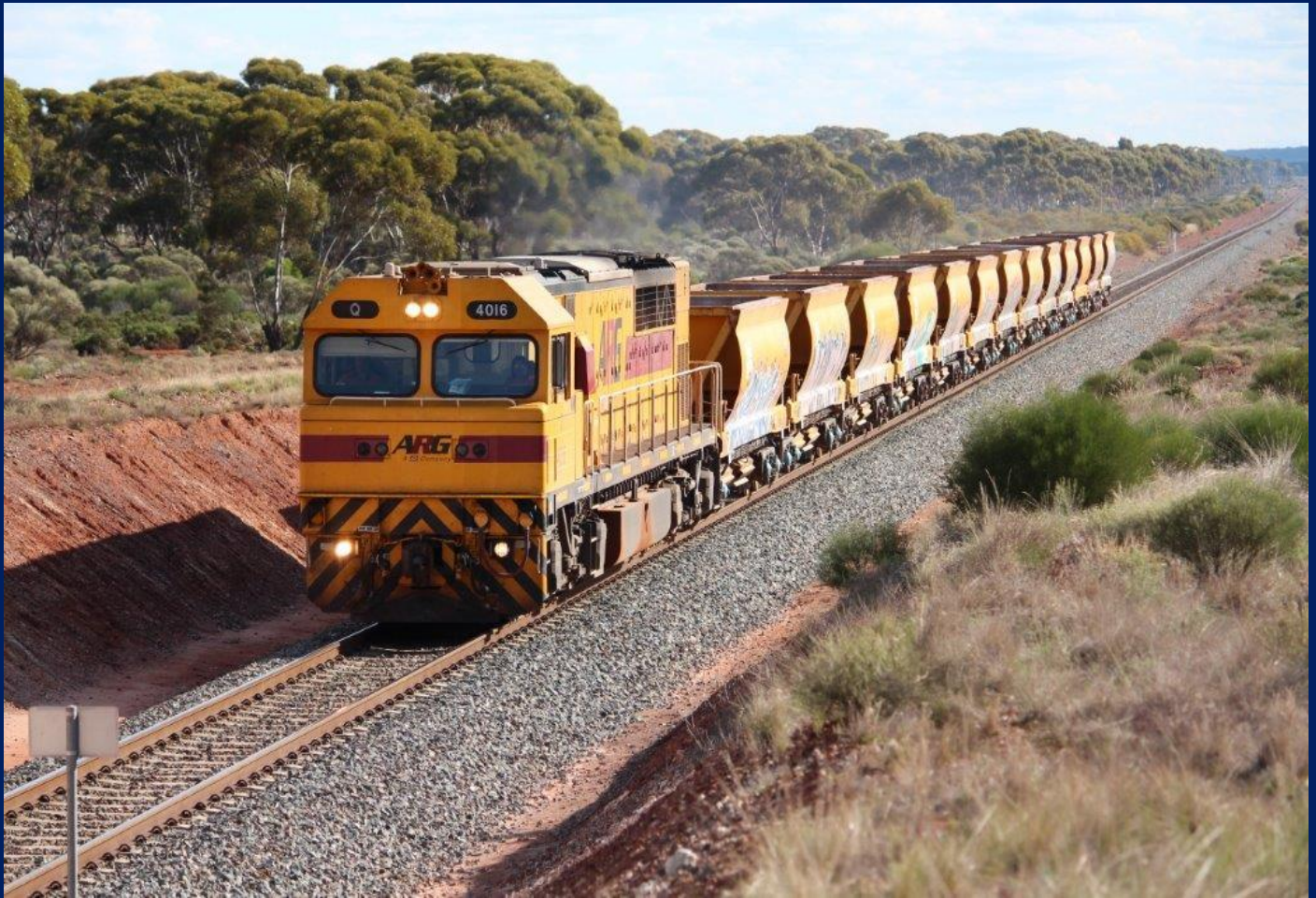
Q4016 on 6BT9 empty ballast ex derailment site to Hampton to reload 17/5.