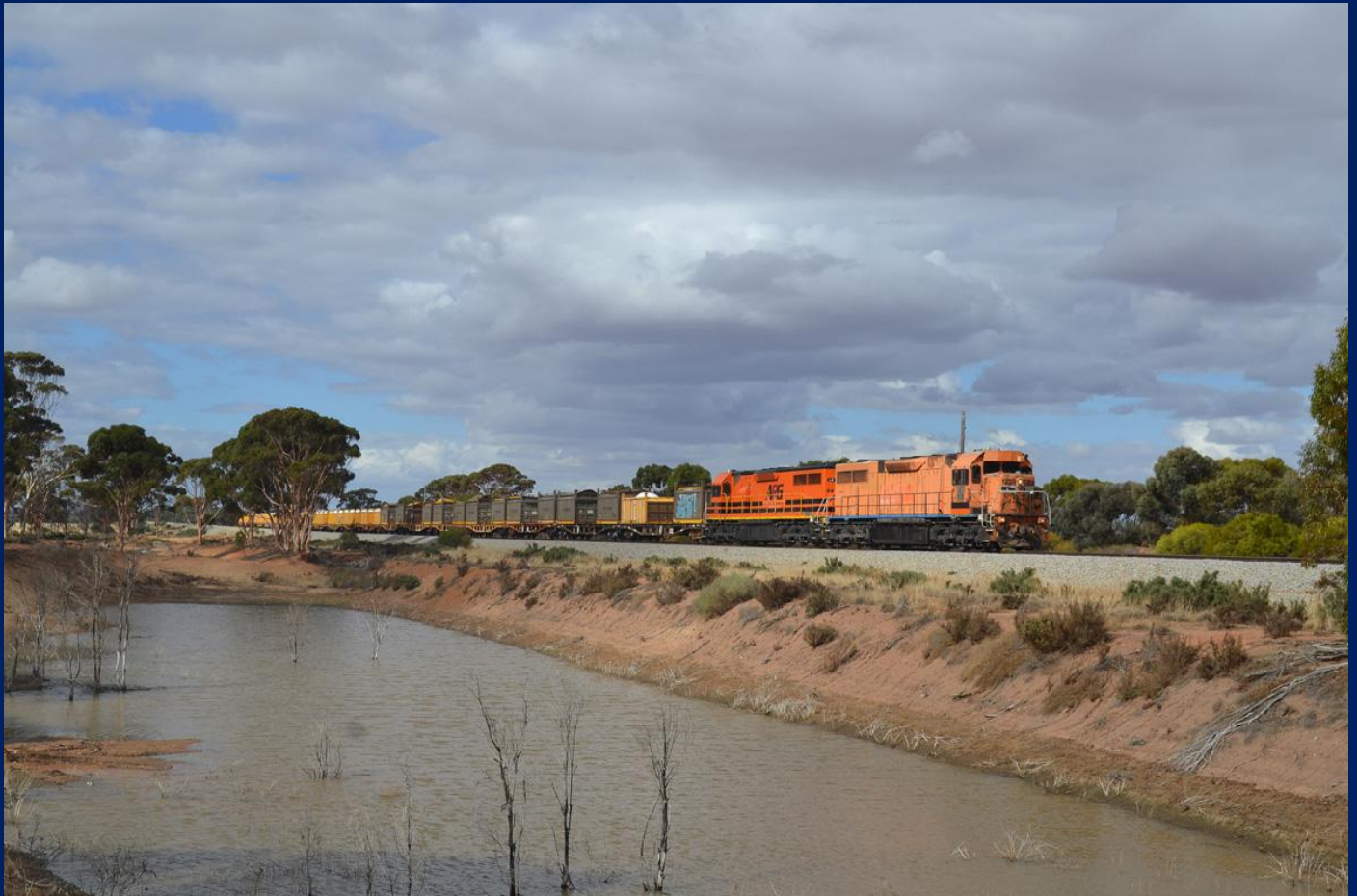
L3113 & LZ3105 on 2474 salt near Kellerberrin on April 28th.