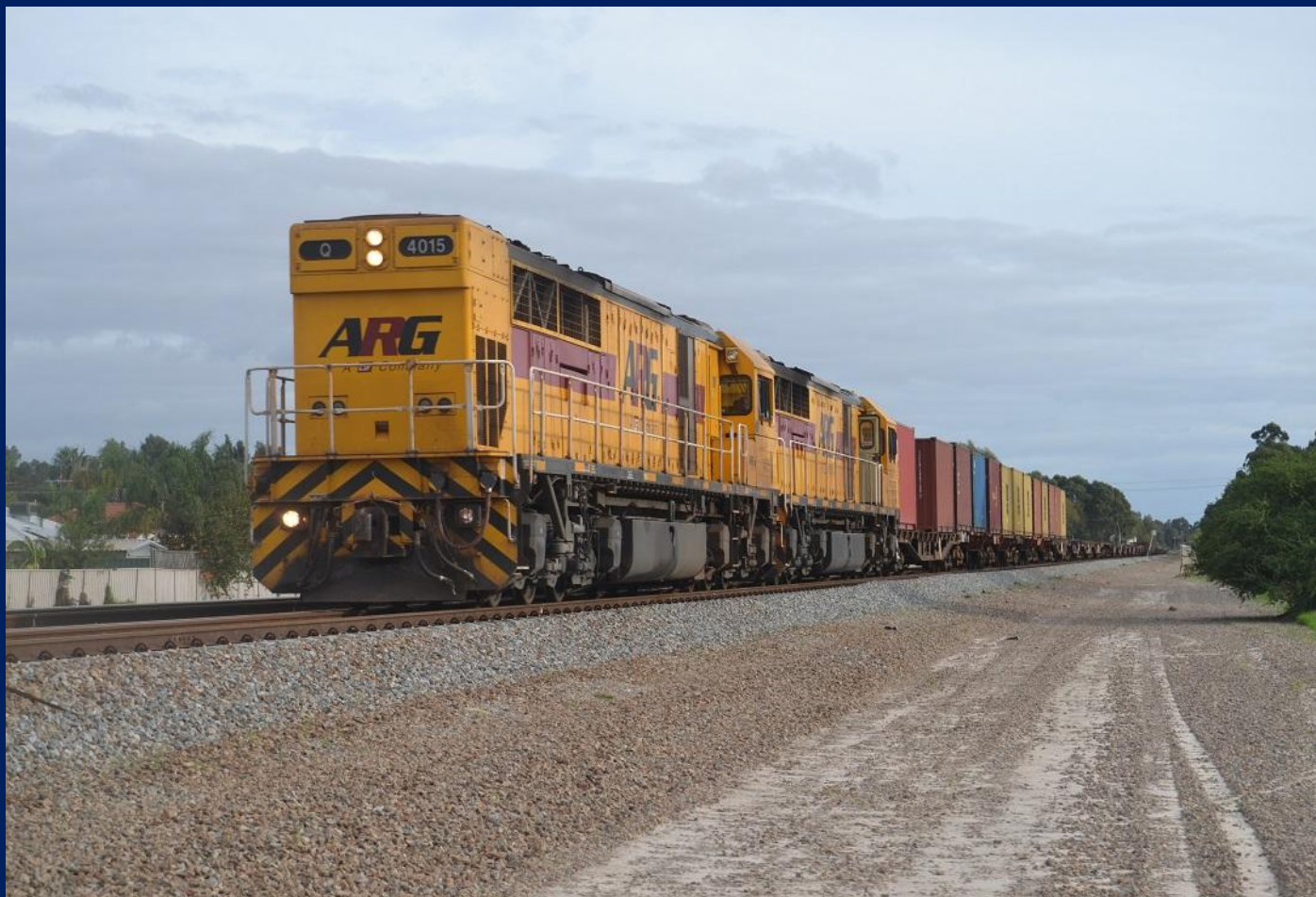
Q4015 with failed Q4006 on 2195 container train at Thornlie May 26th.