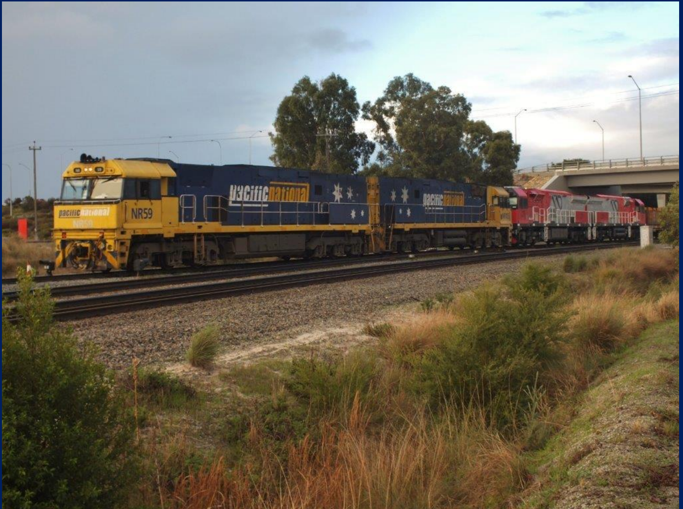
NR59 & NR105, [dead] MRL001 & MRL003 on 4WP2 about to enter PFT Kewdale 25/5.