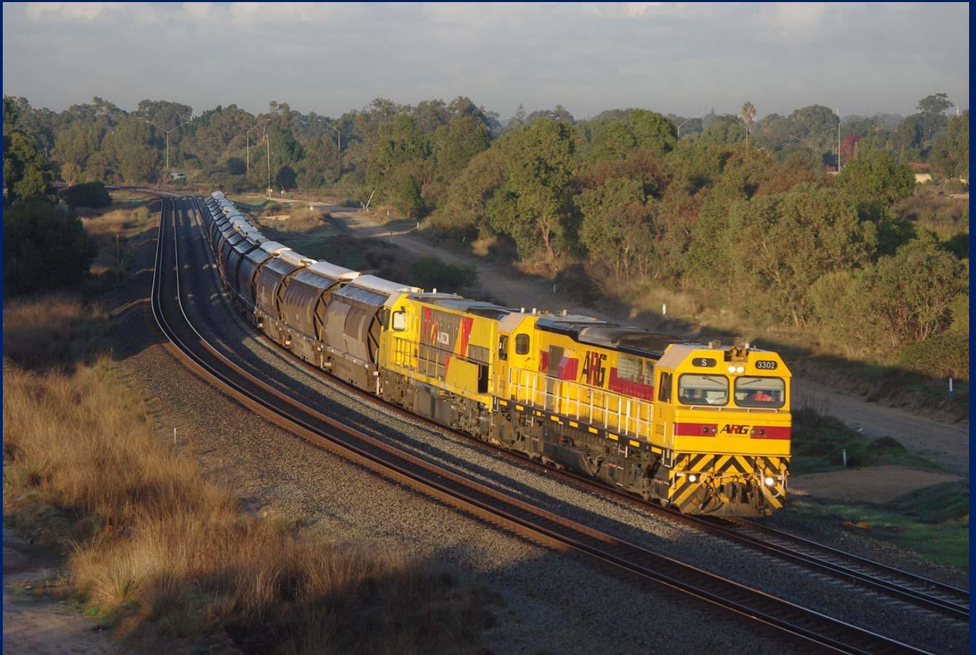
S3302 & ACN4163 on 6121 empty XU grain wagon movement at Wattle Grove 16/5.