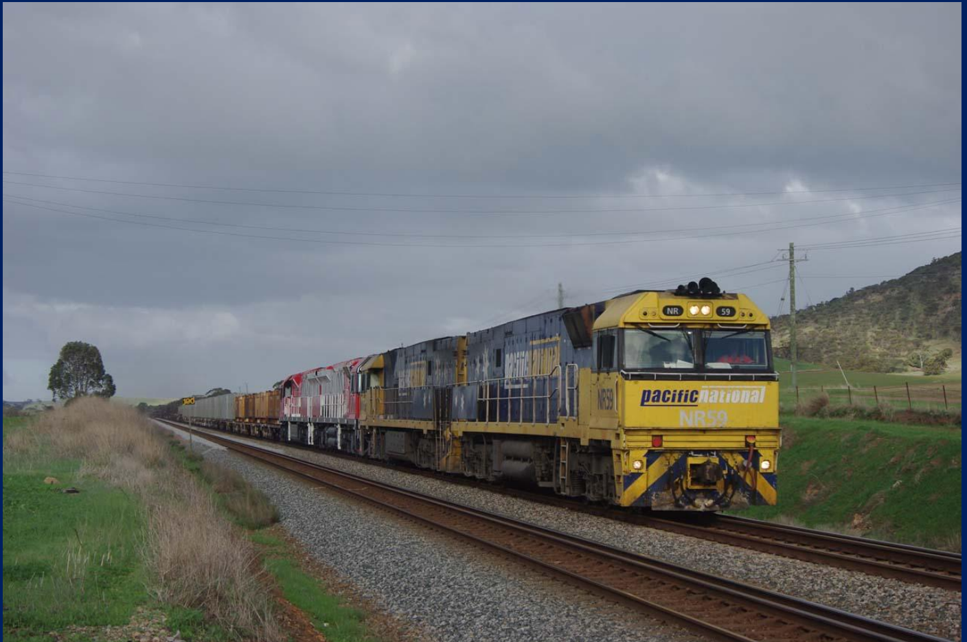
NR59, NR105 [dead] MRL001 & MRL003 on delivery run to WA on 4WP2 Katrine 25/5.