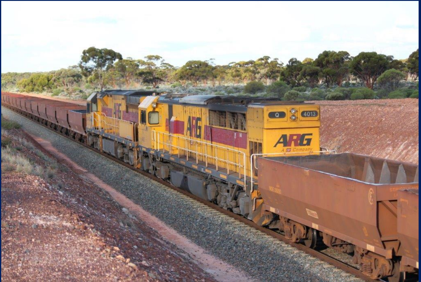
DPU units Q4013 and AC4305 on 7416 empty ore at Bonnie Vale May 17th.