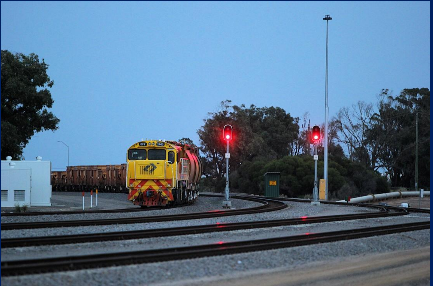
DFZ2402 shunting stored wagons at Narngulu being readied for scrapping 27/5.