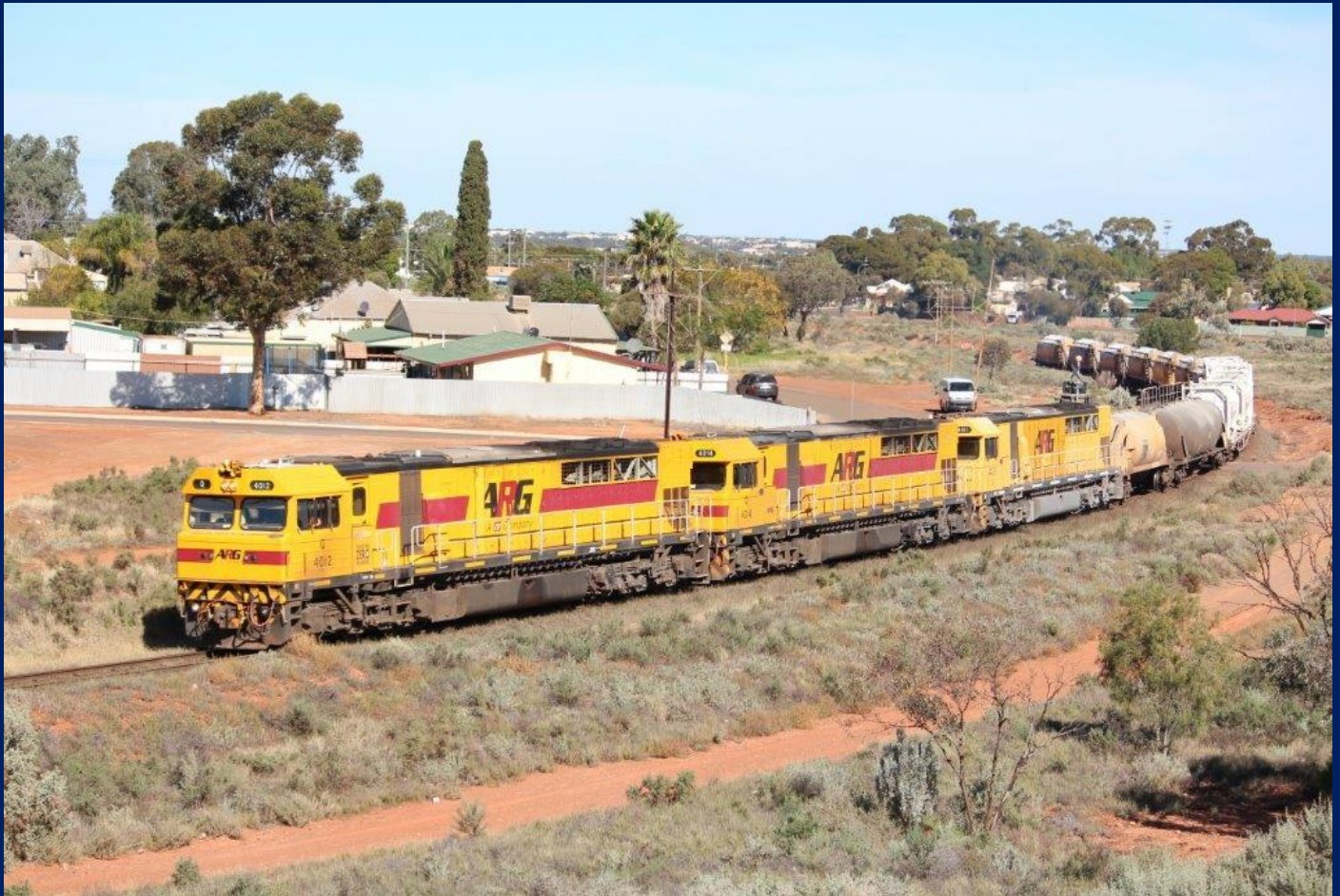
Q4012, Q4014 & Q4011 on 1C71 Parkeston shunter departing Kalgoorlie 18/5.