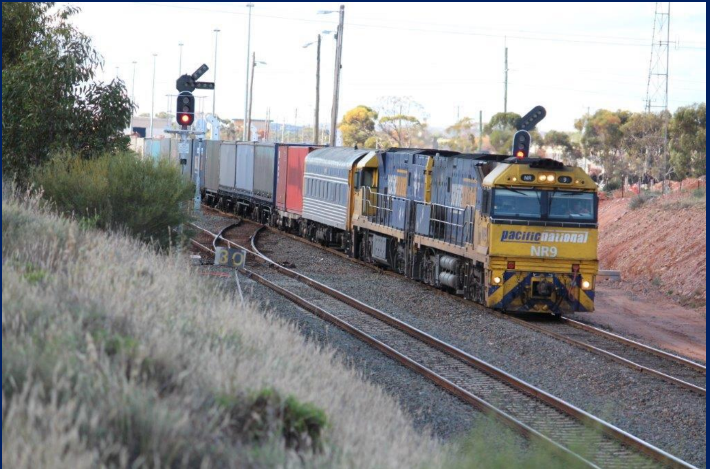
NR9 & NR21 on 7MP7 on Esperance line as is longer than loop in West Kalgoorlie yard 18/5.