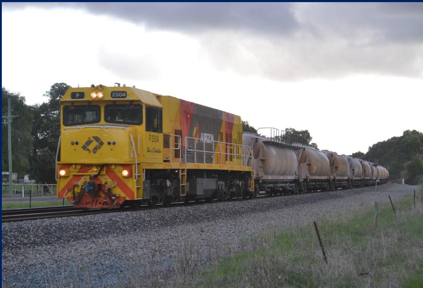
P2504 on 7271 lime train at Wellard May 10th.