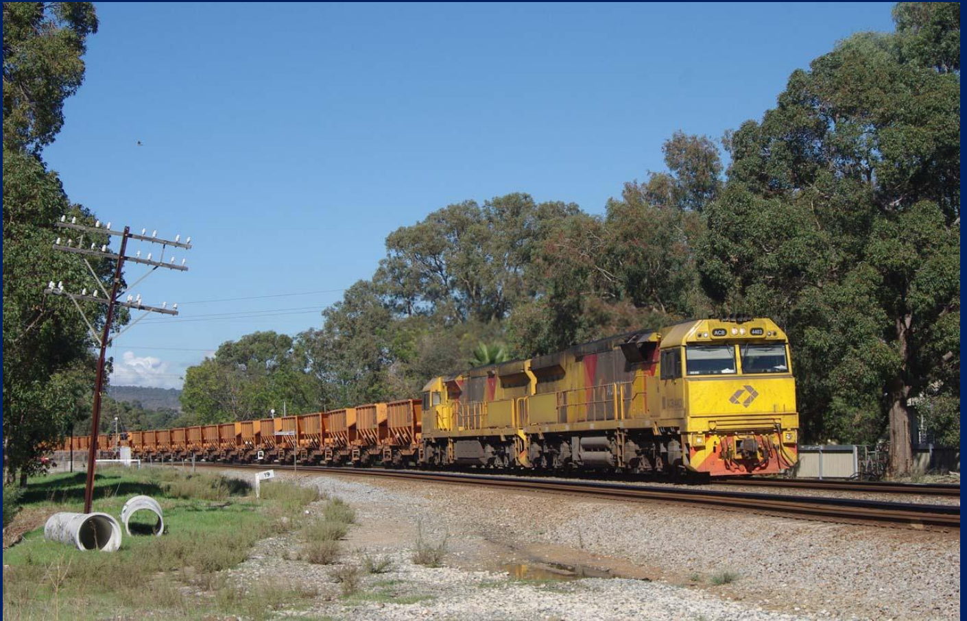
ACB4404 & ACC6031 on 1035 Polaris ore at Swan View May 11th.