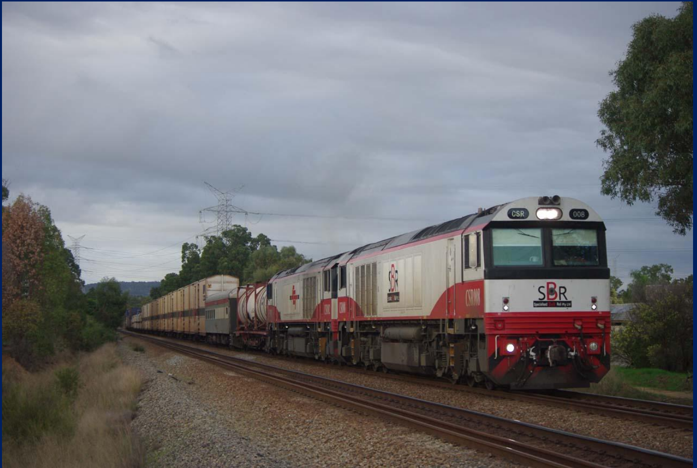
CSR008 & CSR002 on very late 1PM9 SCT freight at Swan View on May 19th.