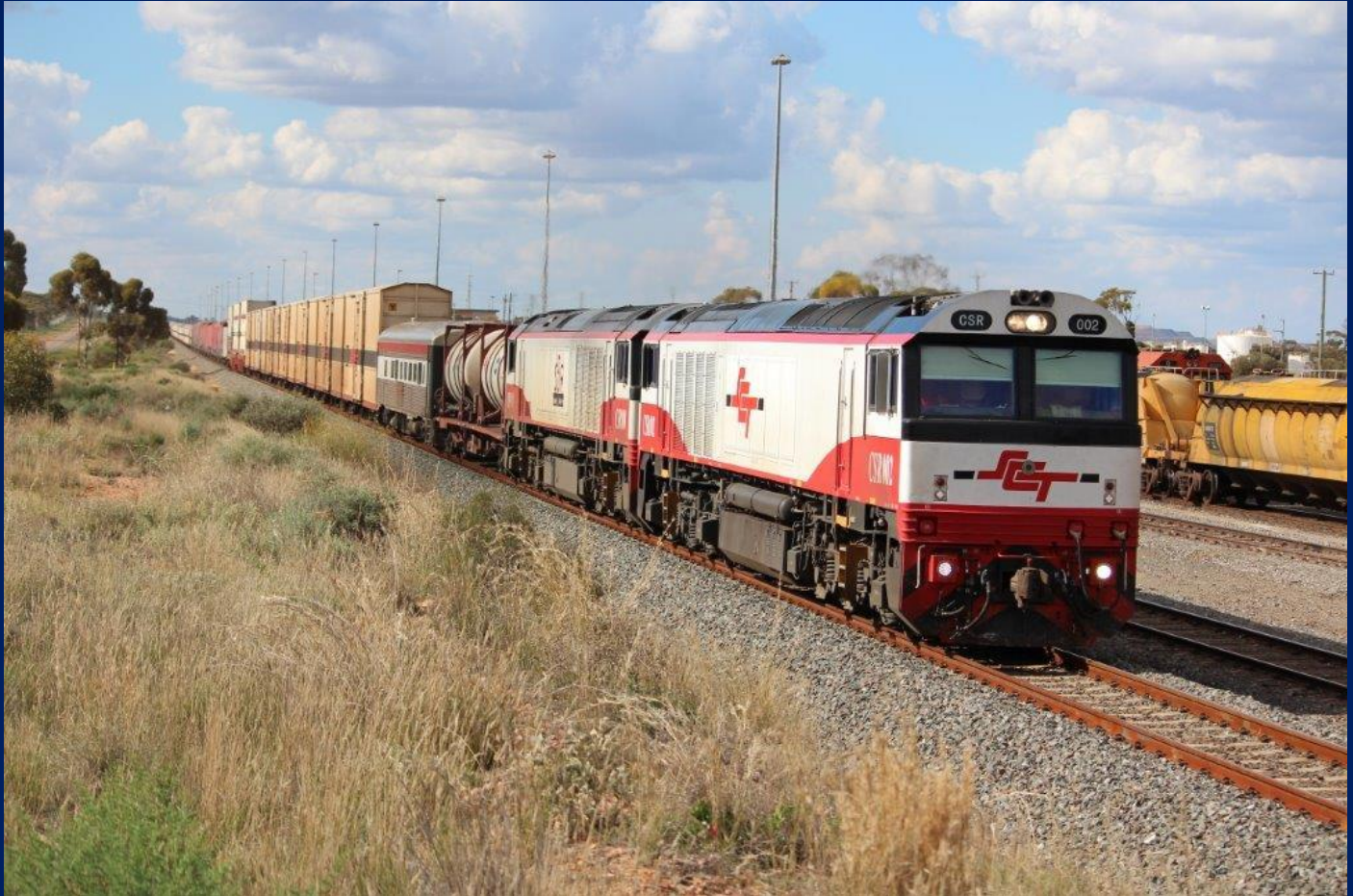
CSR002 & CSR008 on 2MP9 SCT freight that had been held owing to derailment east of Stewart 14/5 on Brookfield EGR line about to depart West Kalgoorlie May 17th.