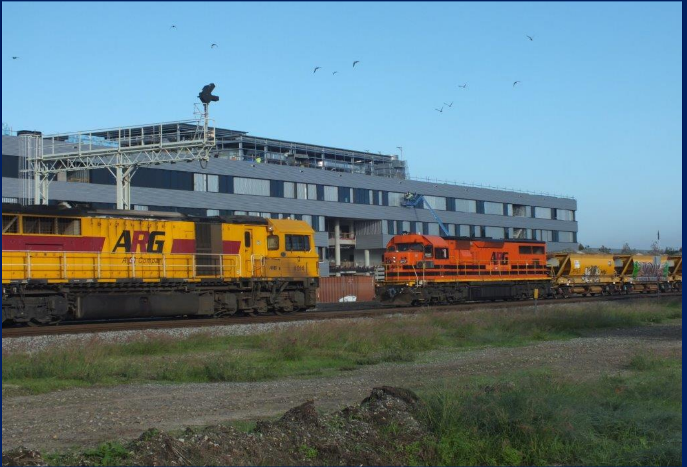
Q4014 on 4430 crossing LZ3117 on 5BT9 ballast train in Midland loop May 29th.