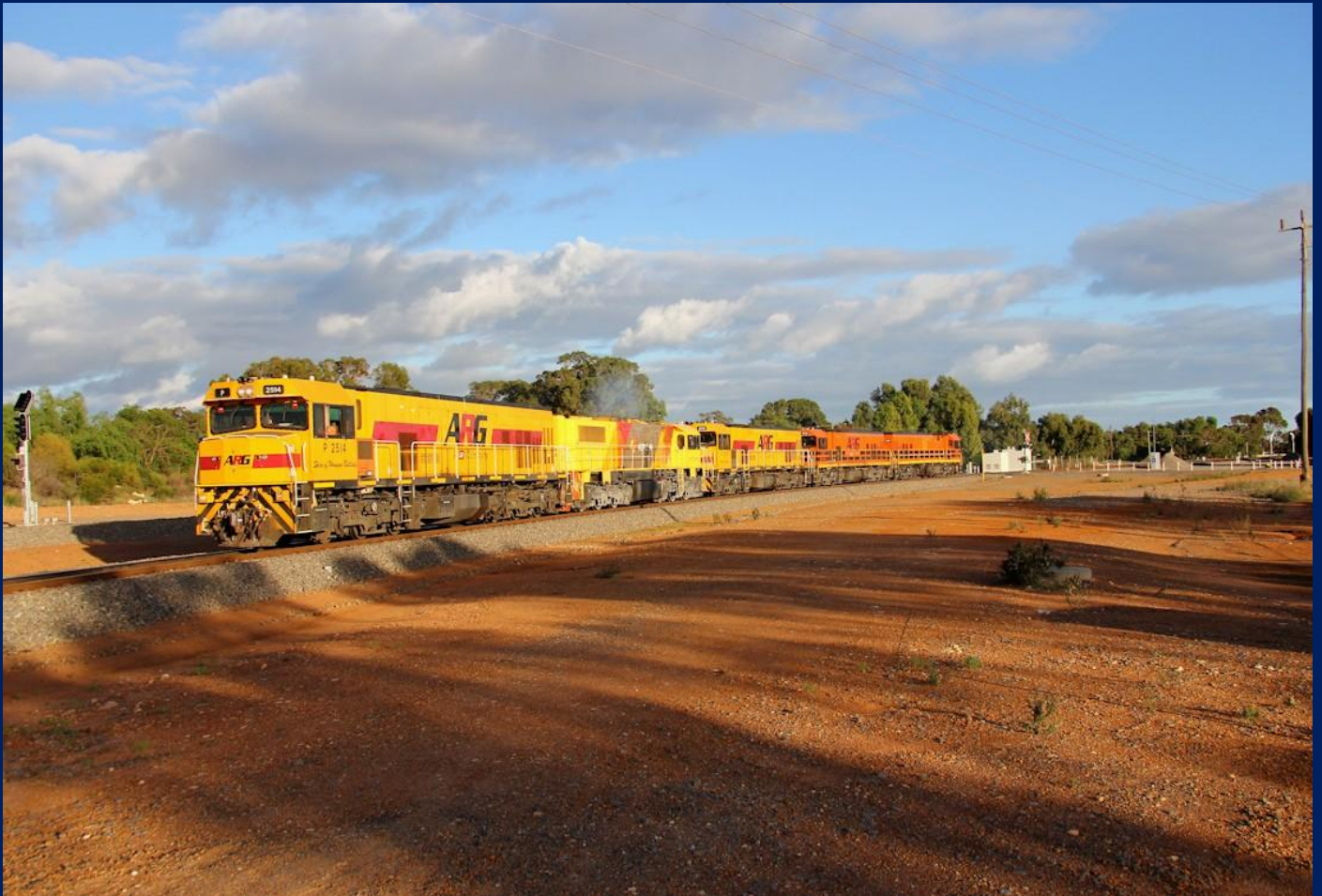
P2514, DFZ2402, P2510, 2512 & P2507 light engine move from Narngulu to Narngulu East for service 27/5.