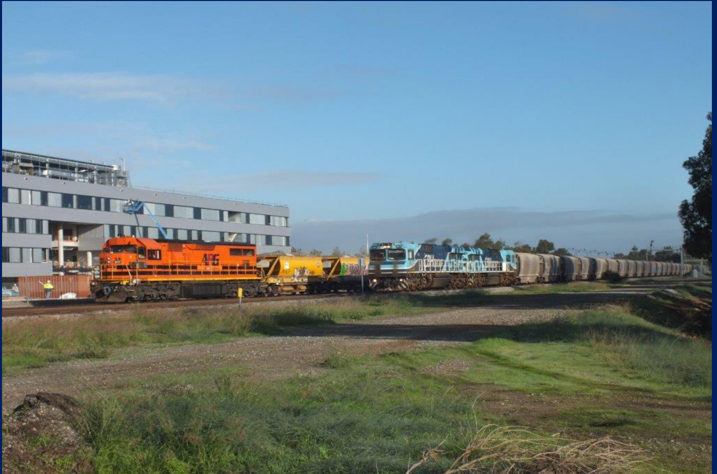
CBH011 & CBH010 on 5K53 empty grain bypassing LZ3117 on 5BT9 in loop Midland 29/5.