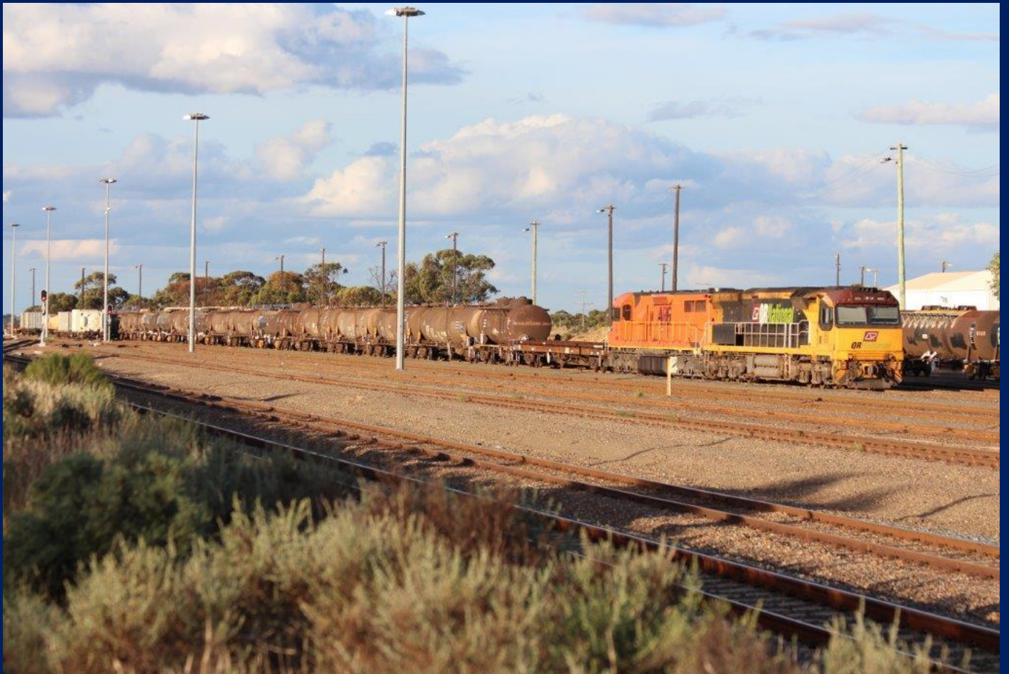
ACA6005 & LZ3119 on 2443 empty fuel train to Esperance at West Kalgoorlie 28/4.