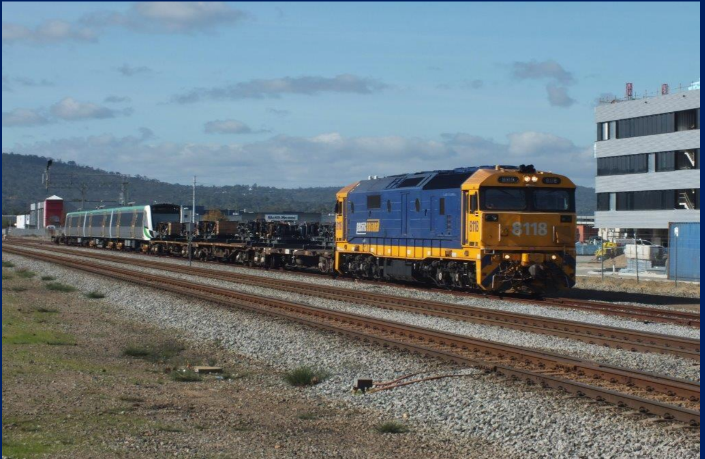
8118 on 6P31 EMU set #100 movement PFT to old workshops Midland in loop May 30th.