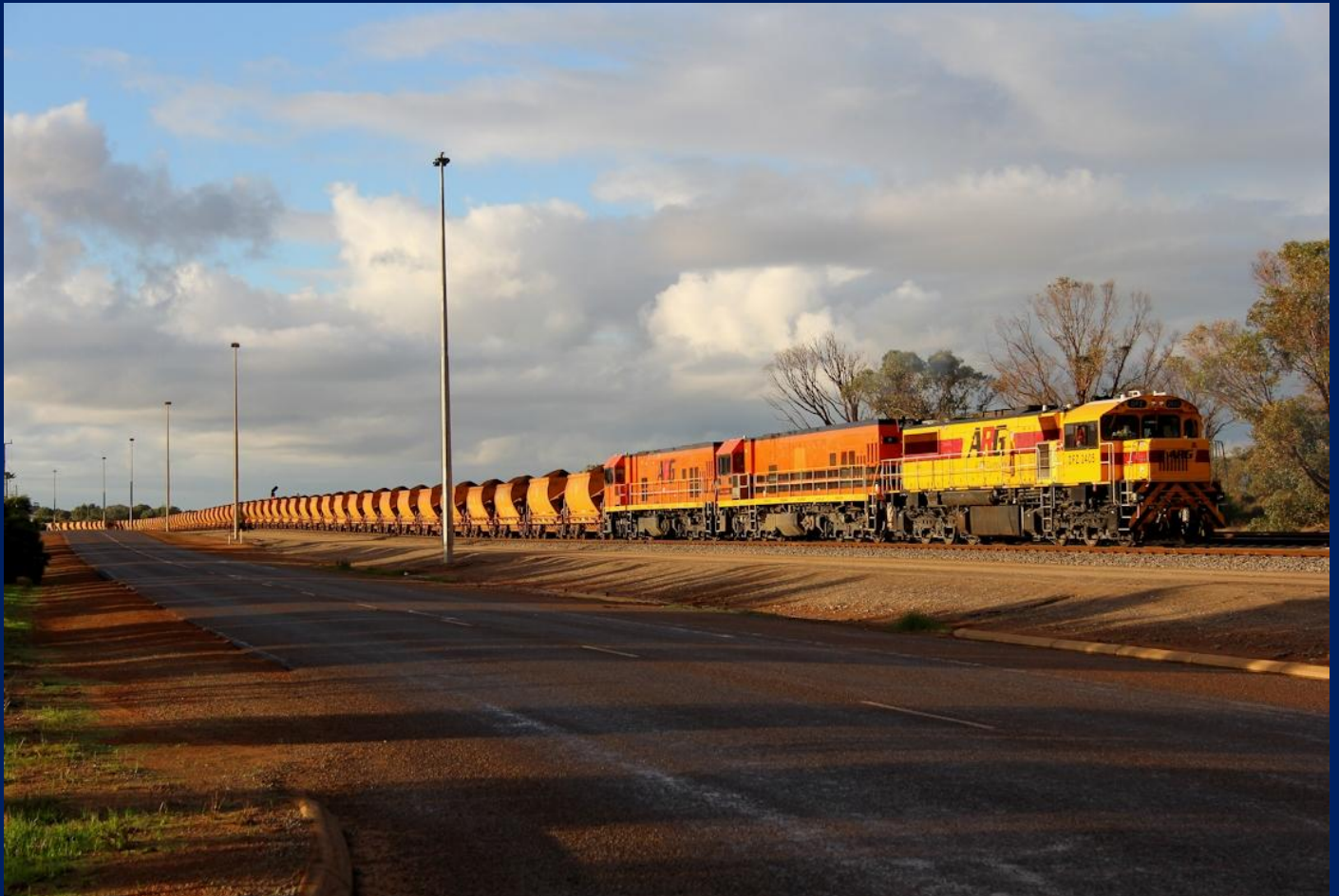
DFZ2404, P2505 & P2516 on Perenjori ore arriving at Narngulu May 10th.