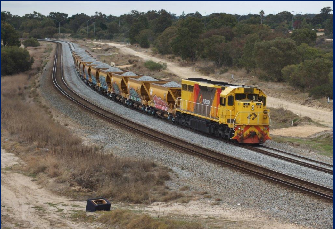
LZ3103 on 3134 at Wattle Grove propelling ballast train to work site up main upgrading 6/5.