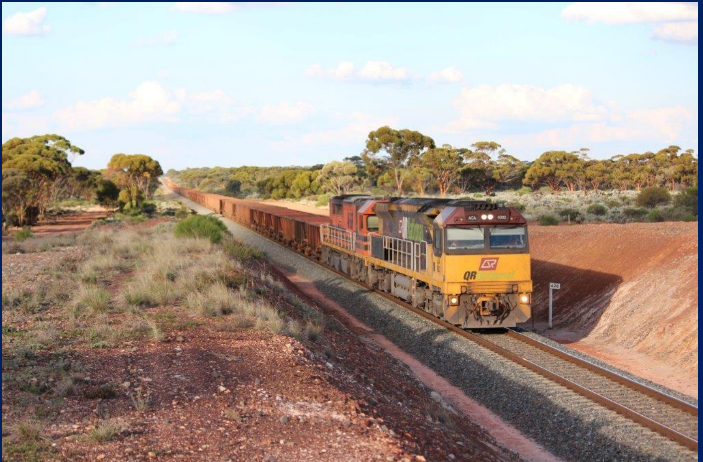
ACA6002 & Q4003 with DPU Q4013 & AC4305 on 7414 empty ore at Bonnie Vale 17/5 moving after being held for 3 days at Hampton owing to derailment closing line further west.