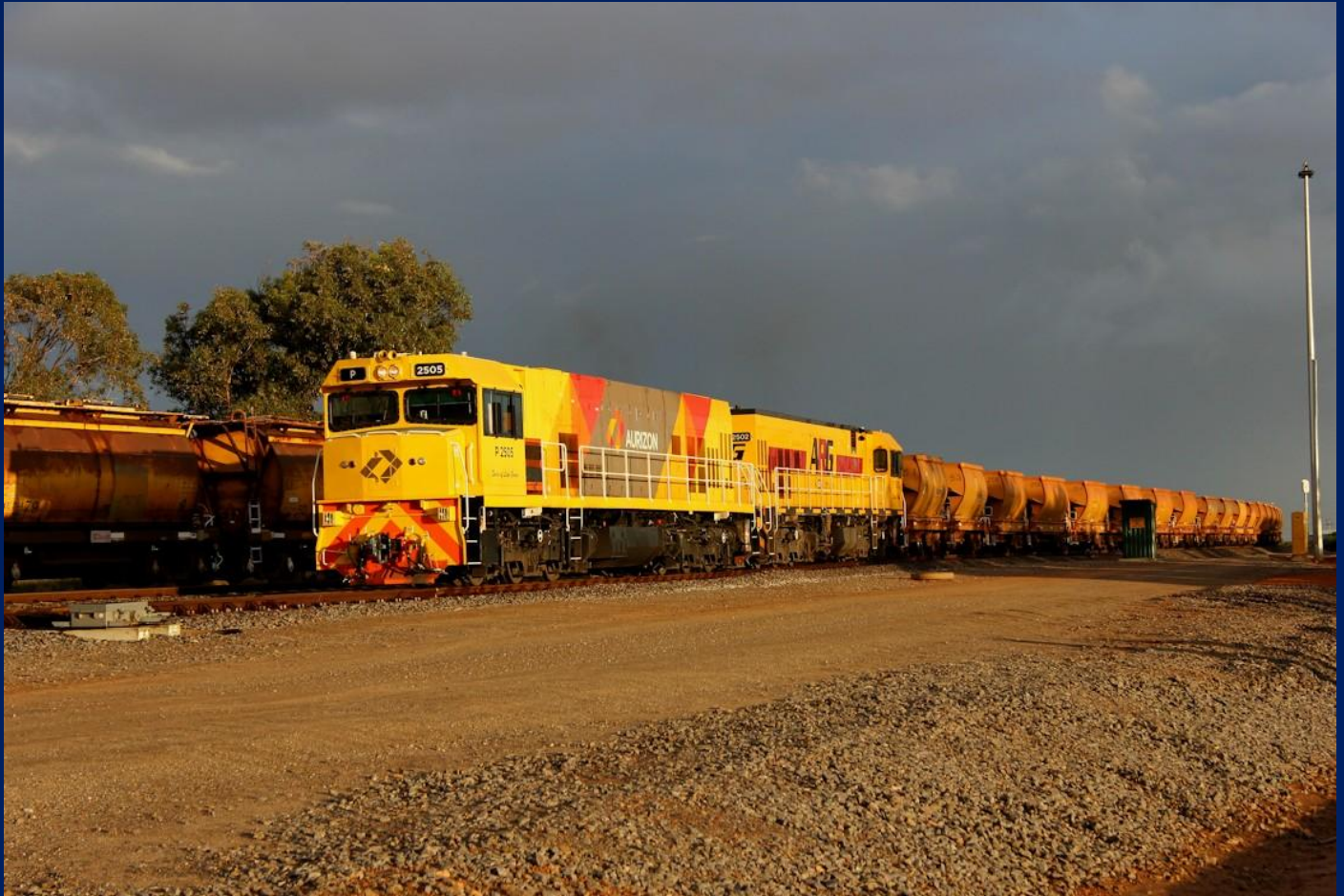
P2505 & P2502 on empty ore departing Narngulu for mines May 10th.