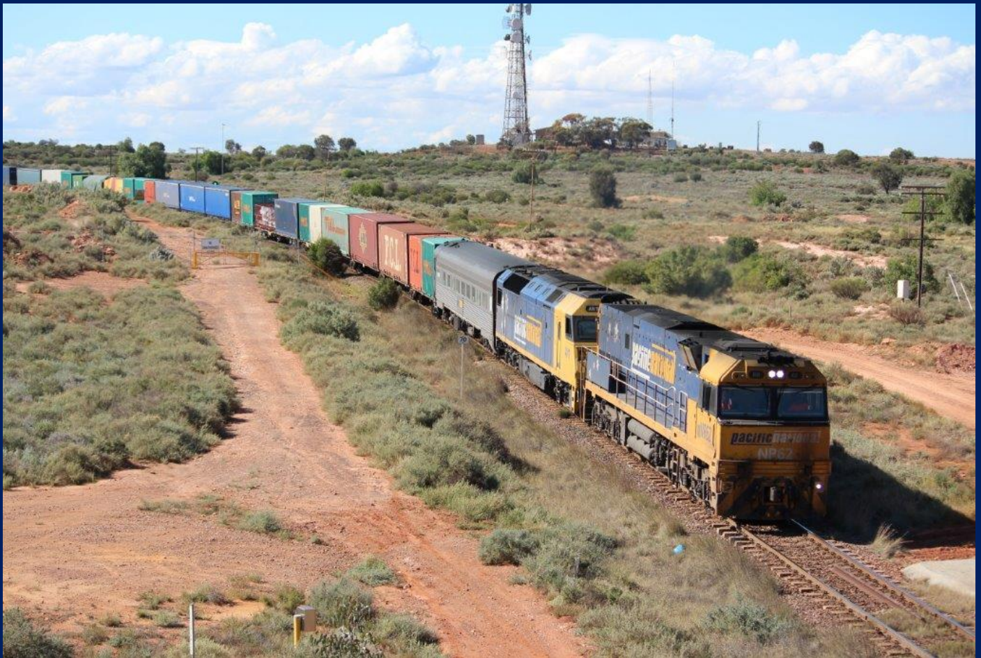
NR63 & AN11 on 5SP5 intermodal approaching Kalgoorlie May 18th.