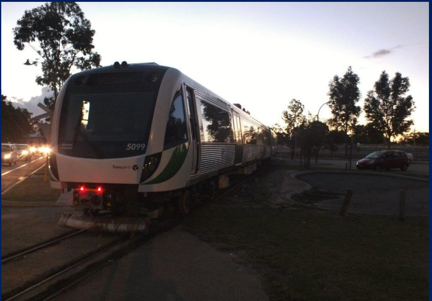
End of train lights on rear EMU set #099 being hauled thru car park Midland May 16th.