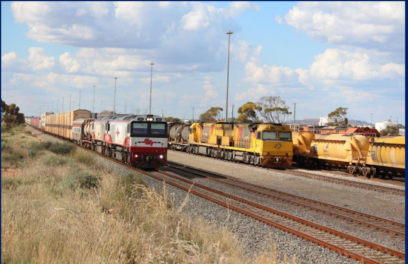
CSR002 & CSR008 on 2MP9 SCT freight, passing 6028 & 6029 on 2PM1 Aurizon intermodal stalled in West Kalgoorlie yards waiting line to Perth to reopen following repair 17/5.