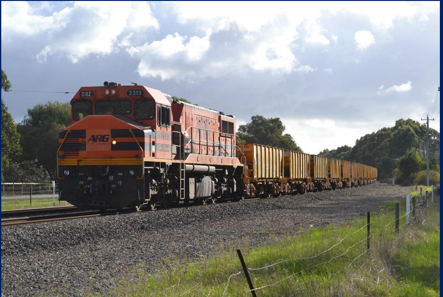
DBZ313 on 7BT3 ballast in loop Wellard May 10th.