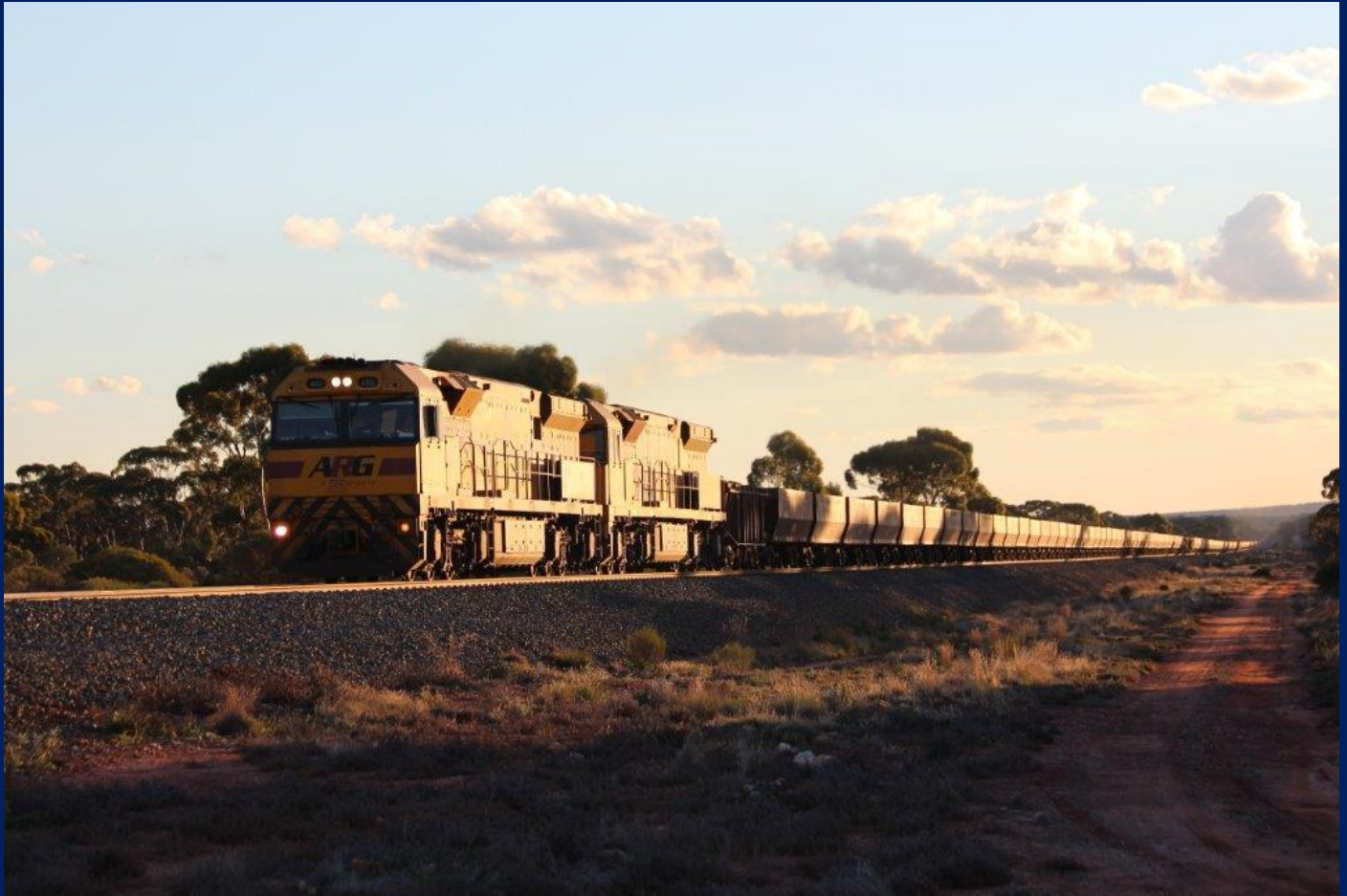
AC4302 & AC4301 on 7415 ore had been held at mine for 3 days, at Bonnie Vale 17/5.