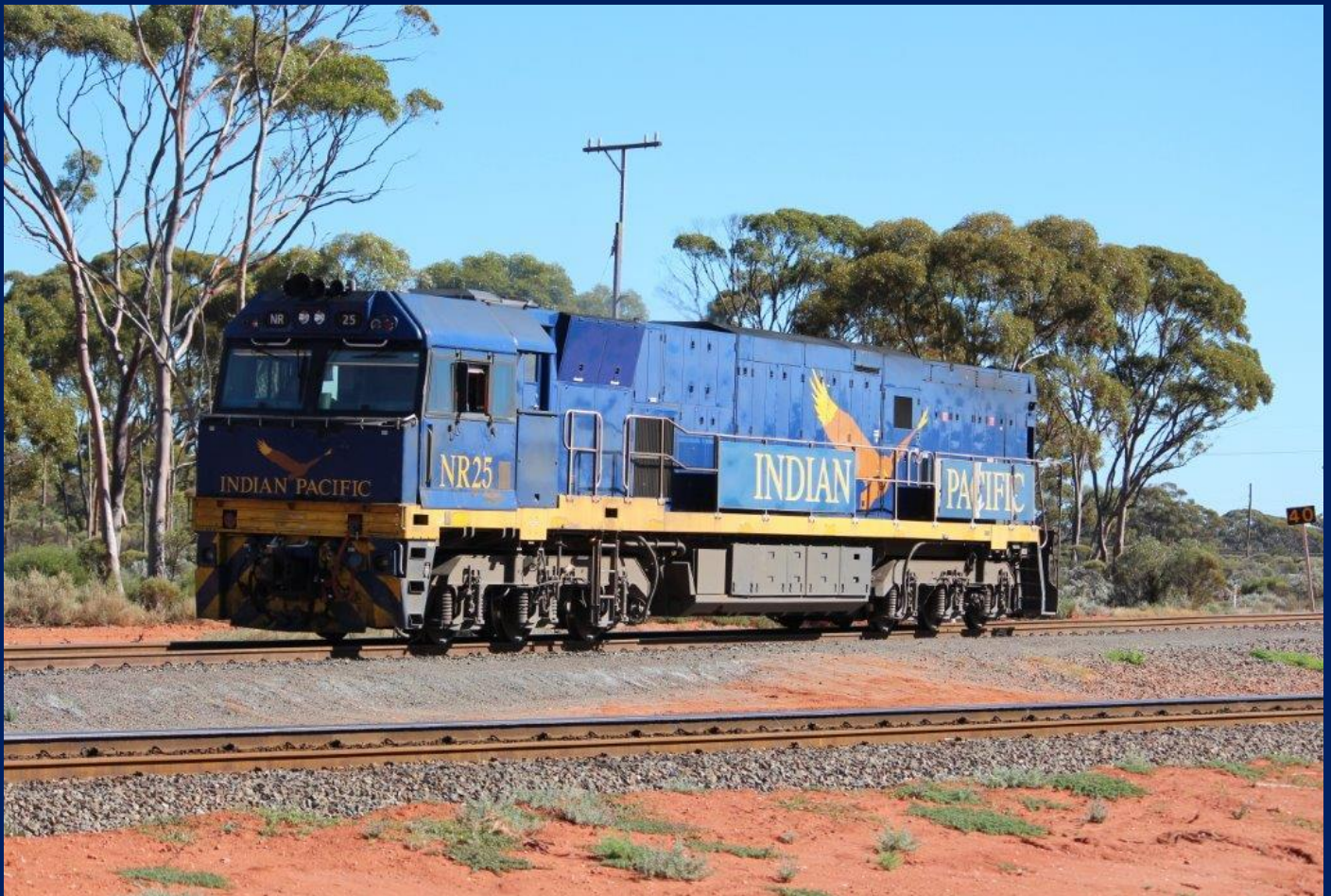
Rare movement of NR25 Indian Pacific loco being turned on the Binduli triangle 18/5.