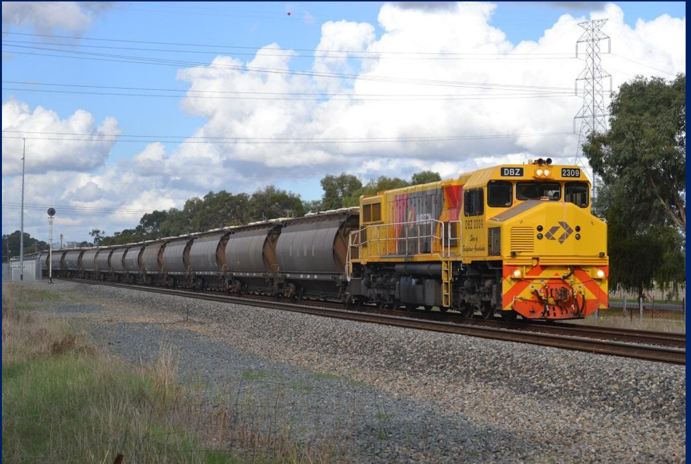
DBZ2309 on late 7222 alumina in loop Wellard May 10th.