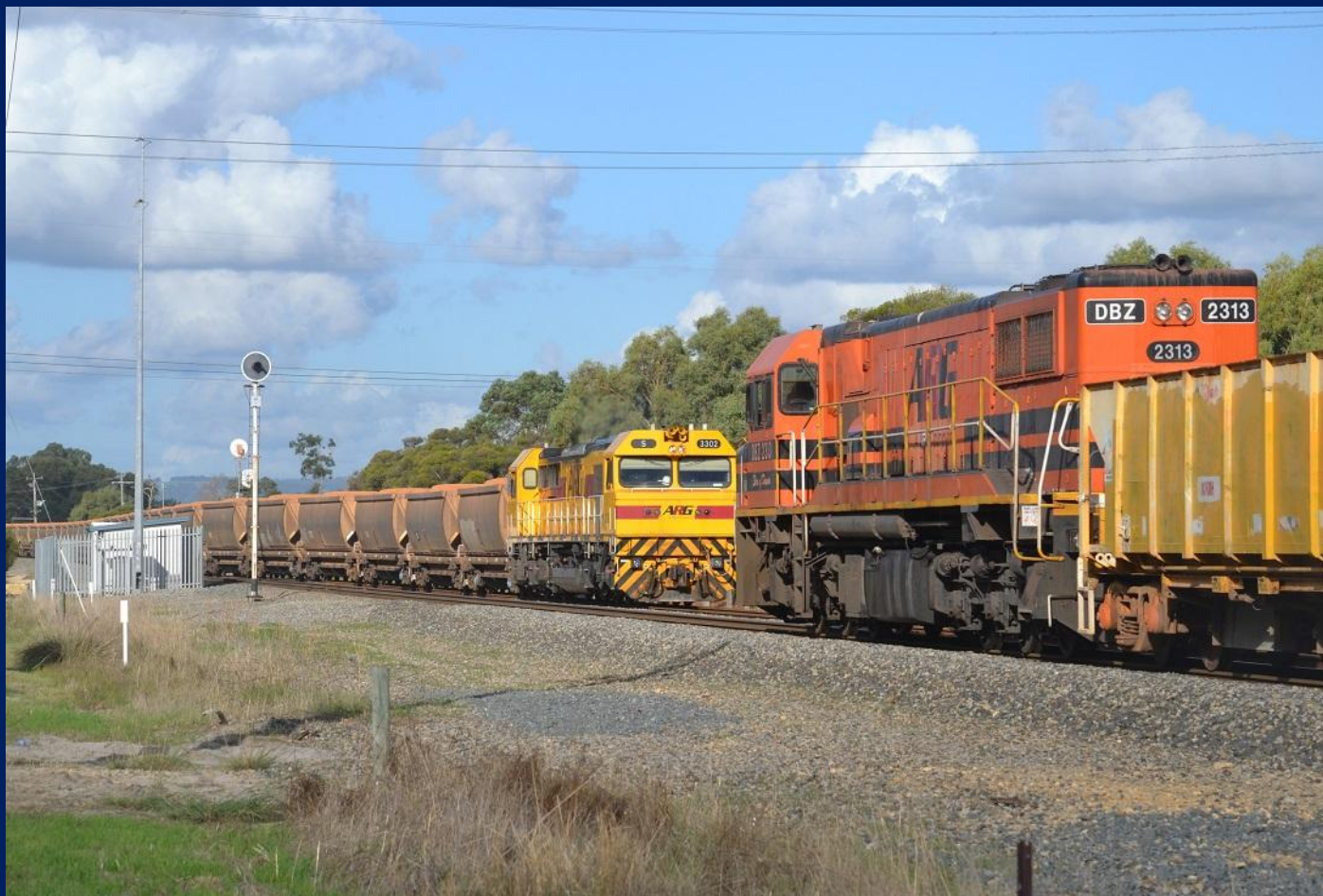
S3302 on bauxite crosses DBZ2313 on ballast in loop Wellard May 10th.