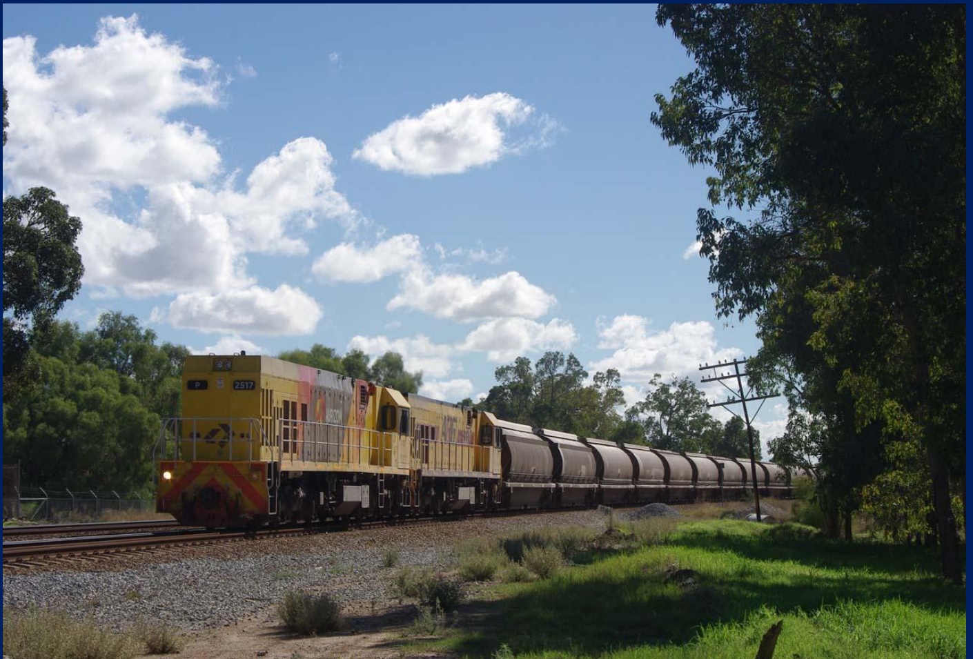
P2517 & P2511 on hire to Watco/CBH run K94 grain ex Kulin thru Swan View 11/5.