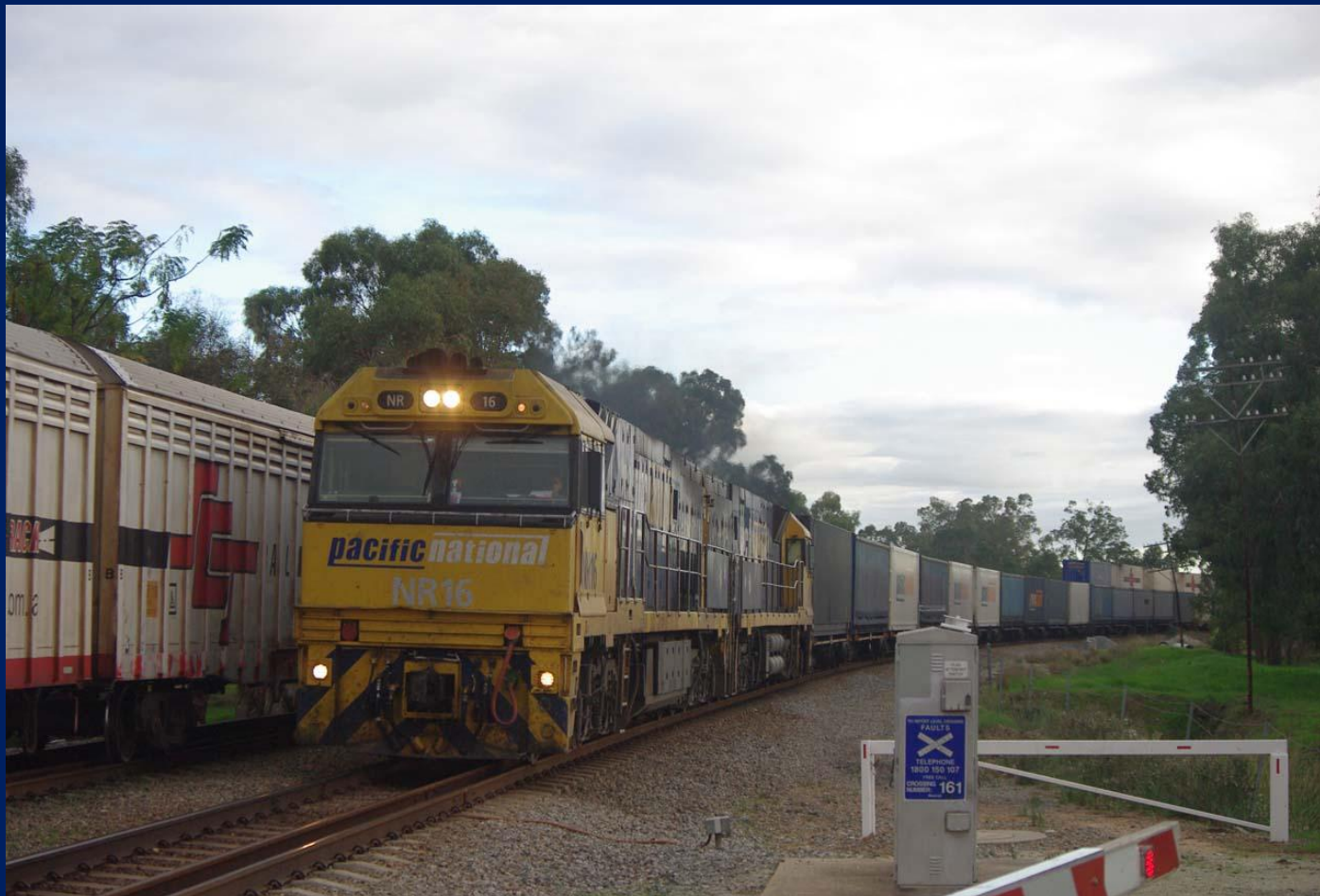
NR16 & NR4 on 6SP7 crossing late 1PM9 SCT freight at Swan View May 19th.