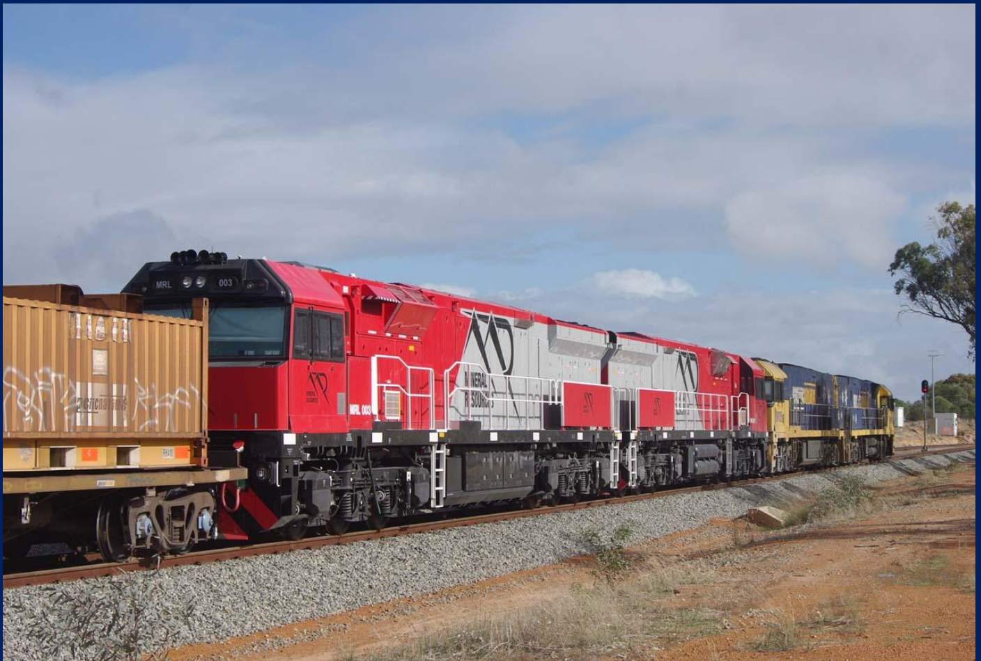
MRL003 and MRL001 behind NR105 & NR59 on 4WP2 at Meckering 25/5.