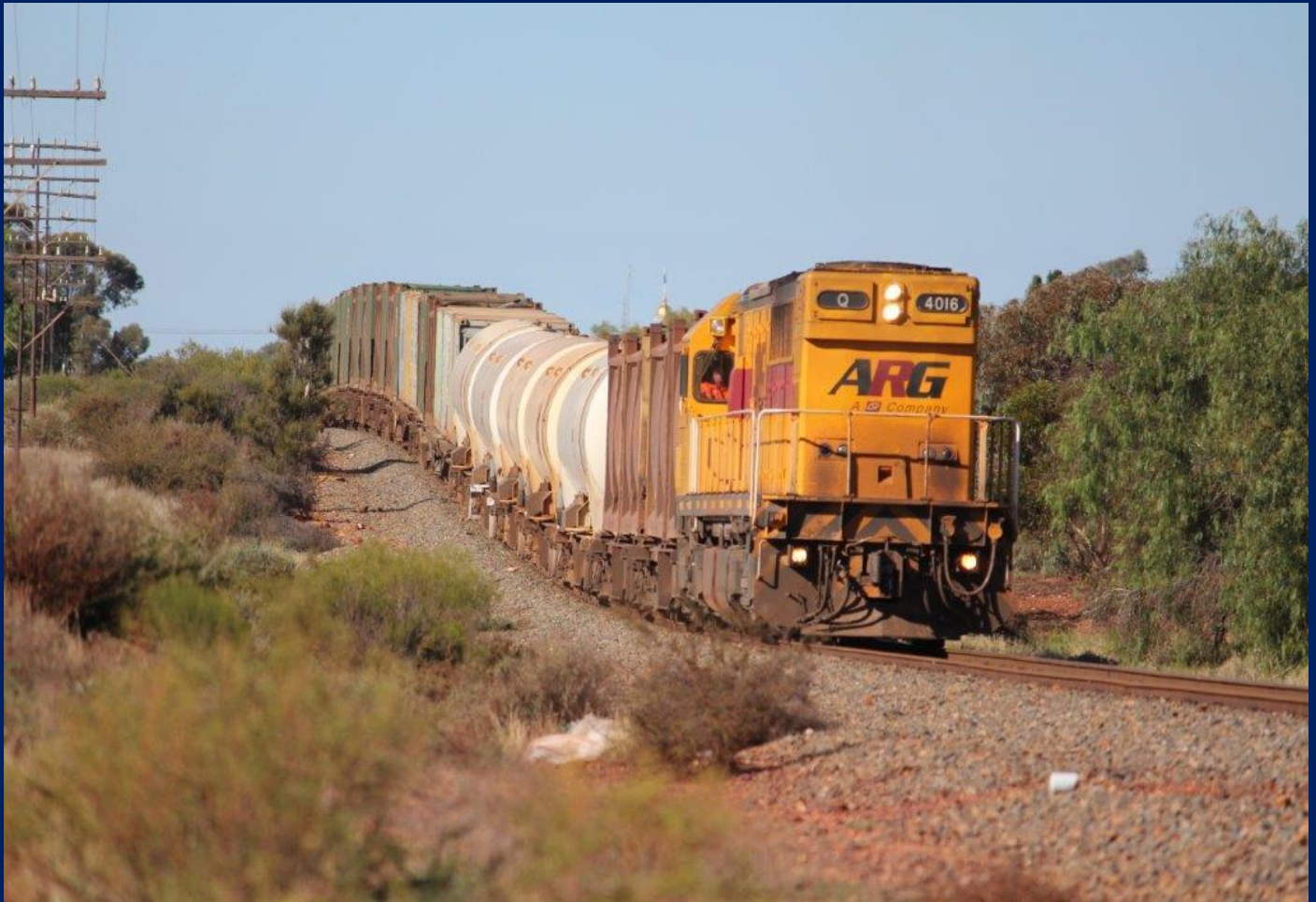
Q4016 on 1027 sulphur and ammonia to Malcolm on roller coaster Leonora line outside Kalgoorlie 18/5.