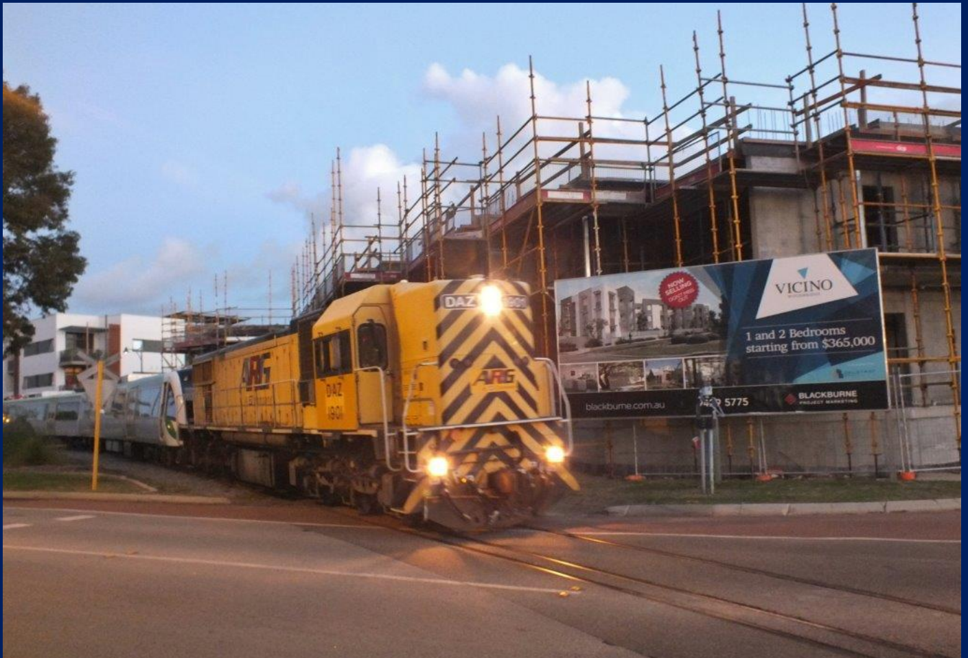
DAZ1901 hauls EMU set #99 out of old workshops Midland for transfer to PTA May 16th.