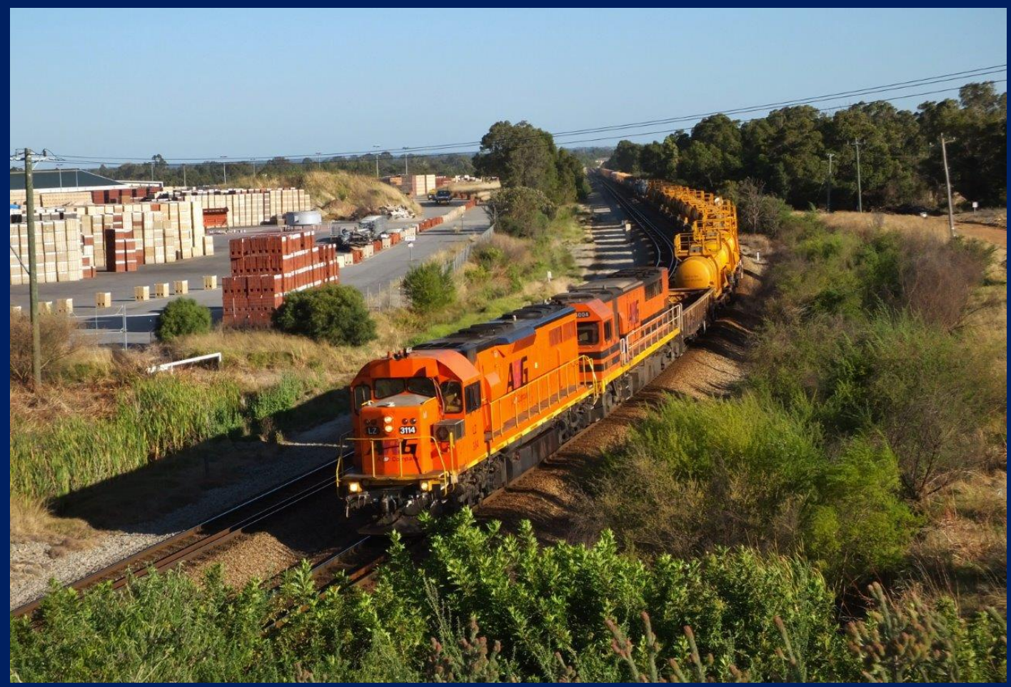
LZ3114 leads Q4004 on 4426 freight ex Kalgoorlie at South Guildford December 18th.