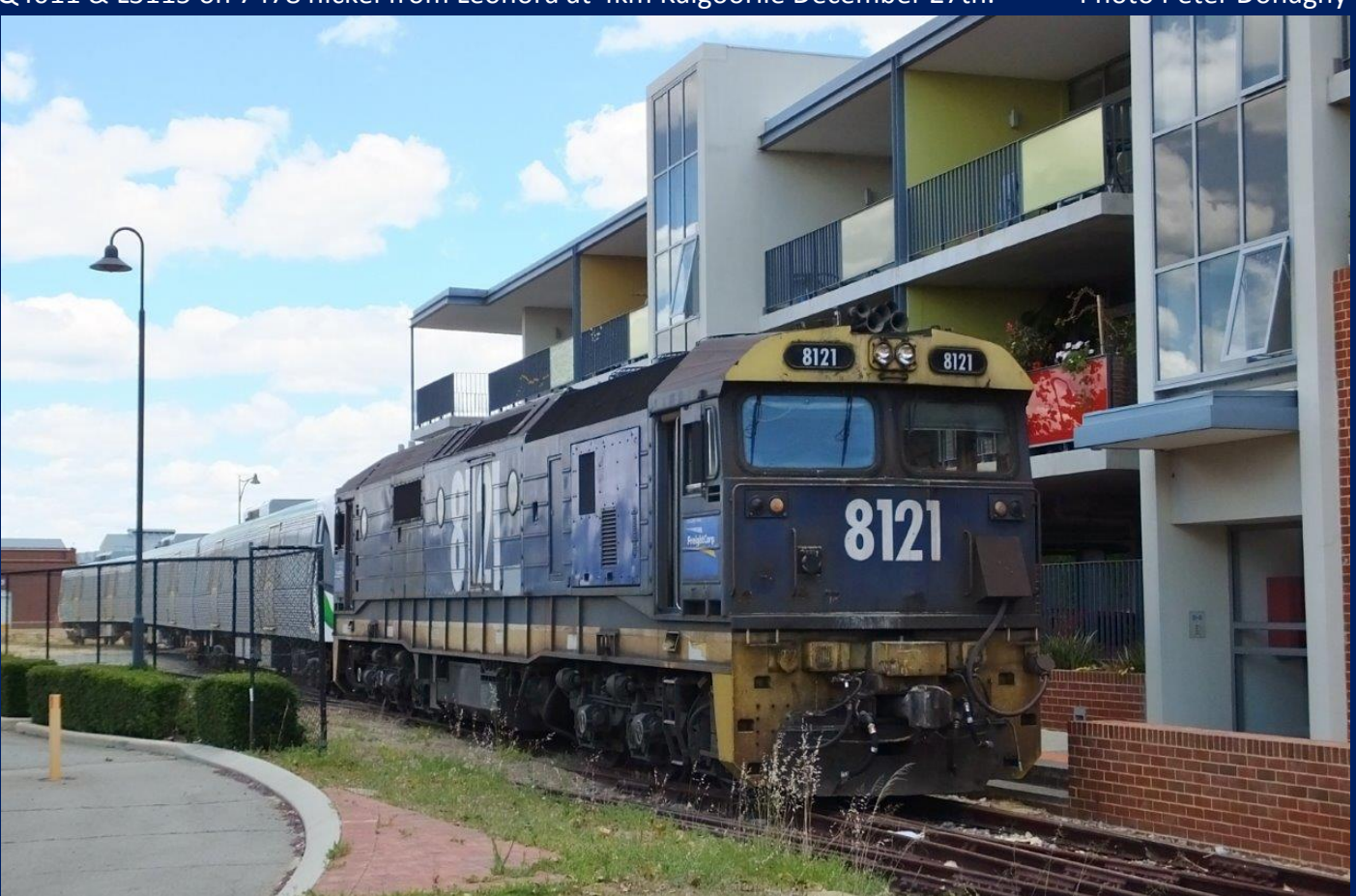
8121 pushing new Transperth EMU set into old workshops Midland December 22nd. END