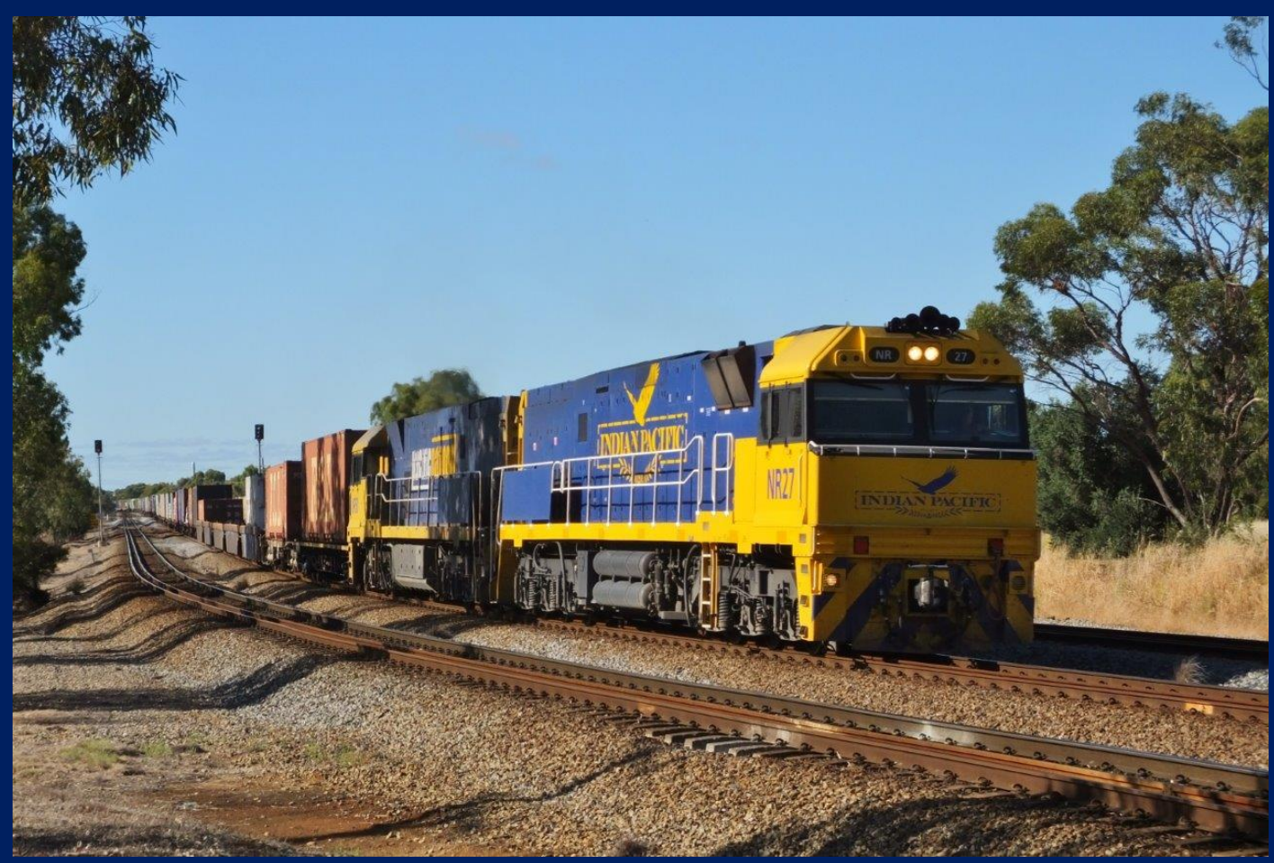
NR27 & NR50 on 1PS6 intermodal at Woodbridge December 21st.