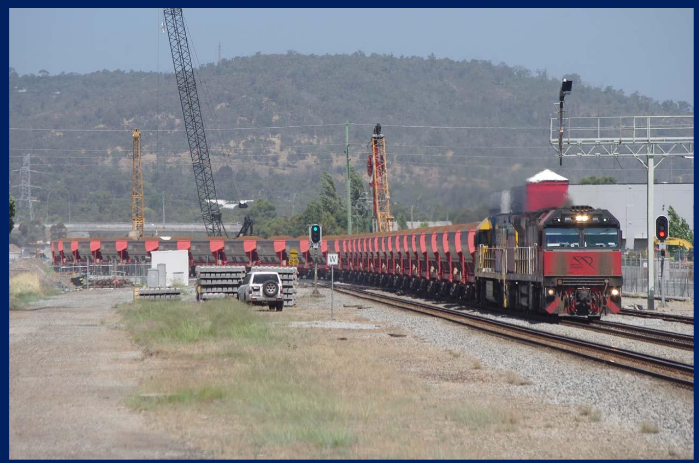
MRL003 & NR111 on 6030 Polaris ore at rounding the deviation at Midland 12/12.