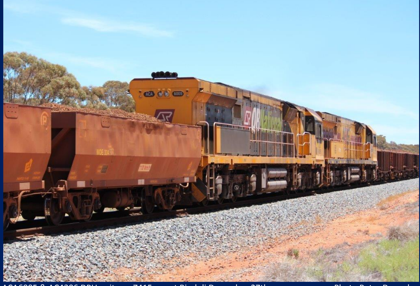
ACA6005 & AC4306 DPU units on 7415 ore at Binduli December 27th.