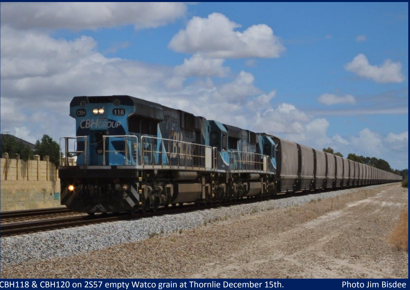
CBH118 & CBH120 on 2S57 empty Watco grain at Thornlie December 15th.