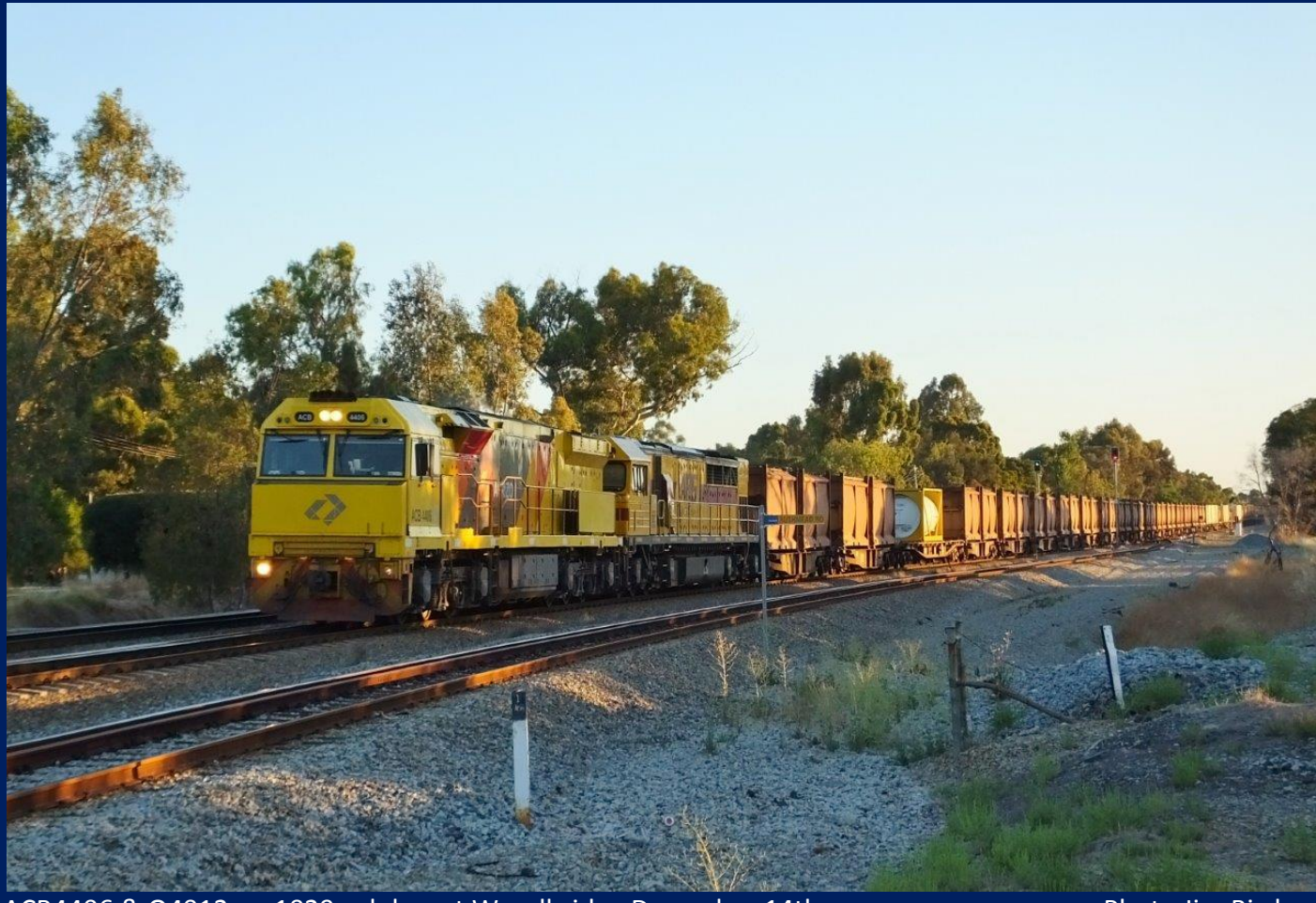
ACB4406 & Q4012 on 1029 sulphur at Woodbridge December 14th.