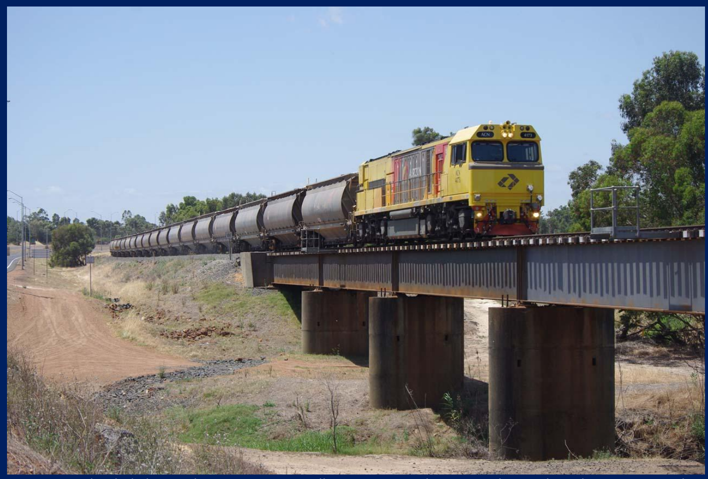
ACN4173 on loaded alumina hoppers crosses Collie River at Burekup December 20th.