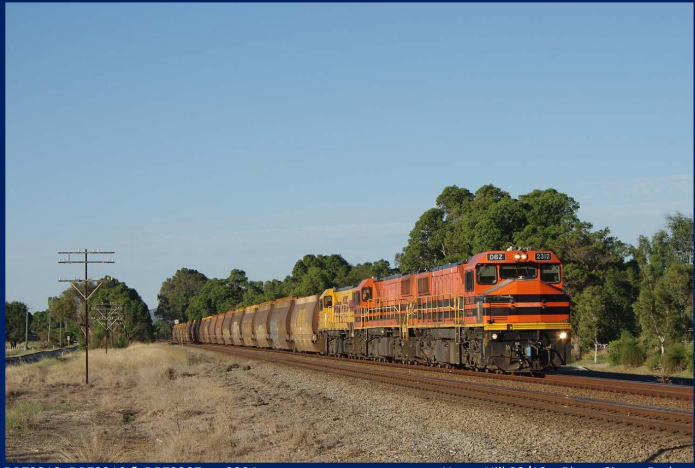
DBZ2312, DBZ2310 & DBZ2307 on 3304 empty wagon movement at Herne Hill 23/12.