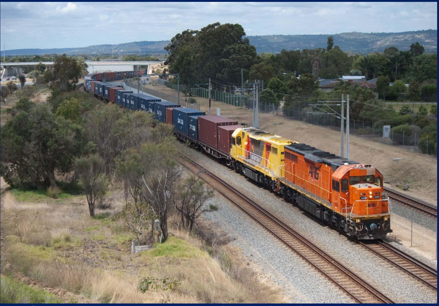
LZ3109 & LZ3106 on 2144 ILS container train at Kenwick on December 15th.