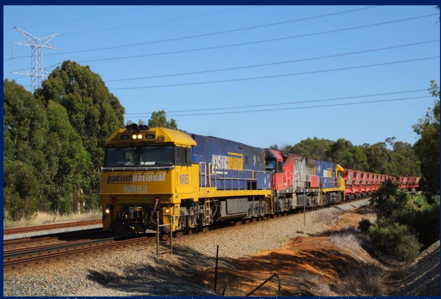
NR83, MRL003 & failed NR111 on late 5032 Polaris ore at Woodbridge December 19th.