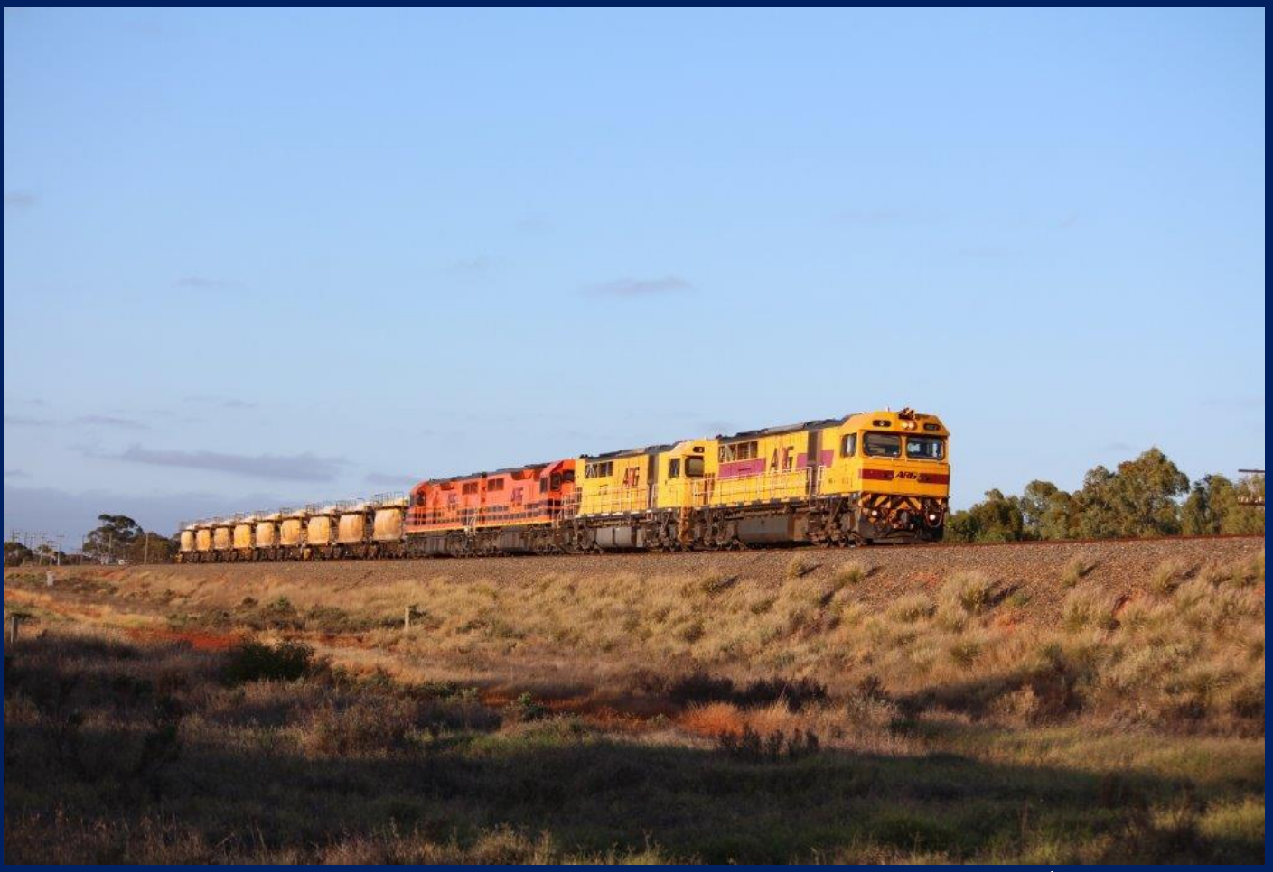
Q4012, Q4011, LZ3117 & LZ3111 on 7C71 Parkeston shunter departing West Kalgoorlie 6/12.