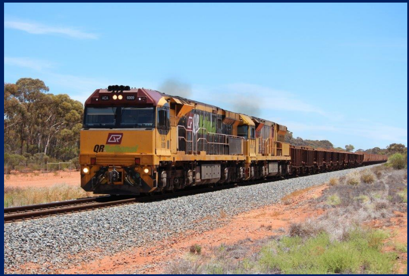
ACA6009 & ACC6031 on 7415 ore Koolyanobbing to Esperance at Binduli 27/12.