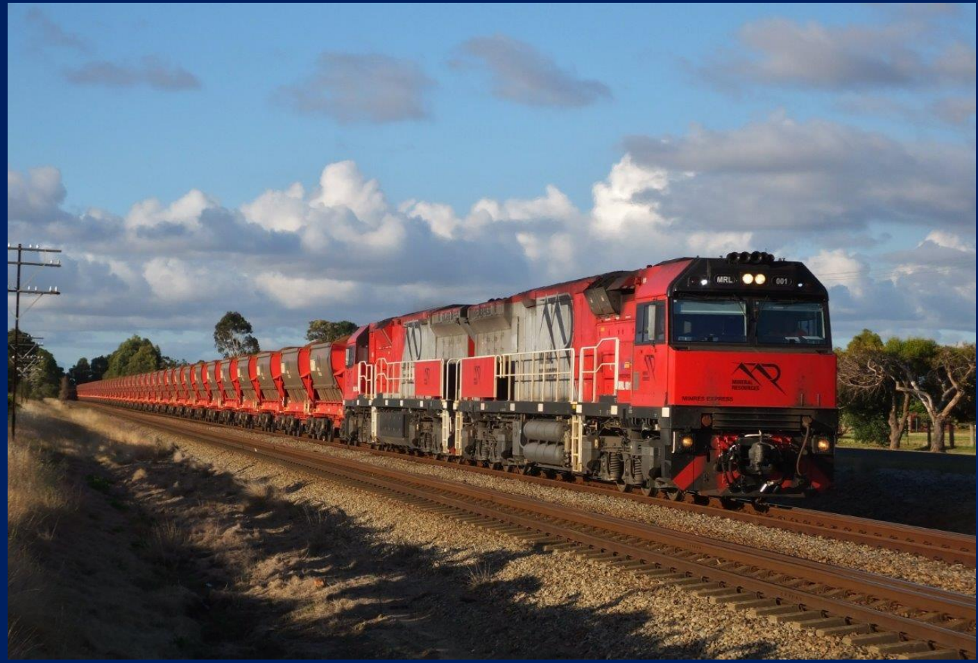
MRL001 & MRL004 on 2032 Polaris ore at Herne Hill December 1st.