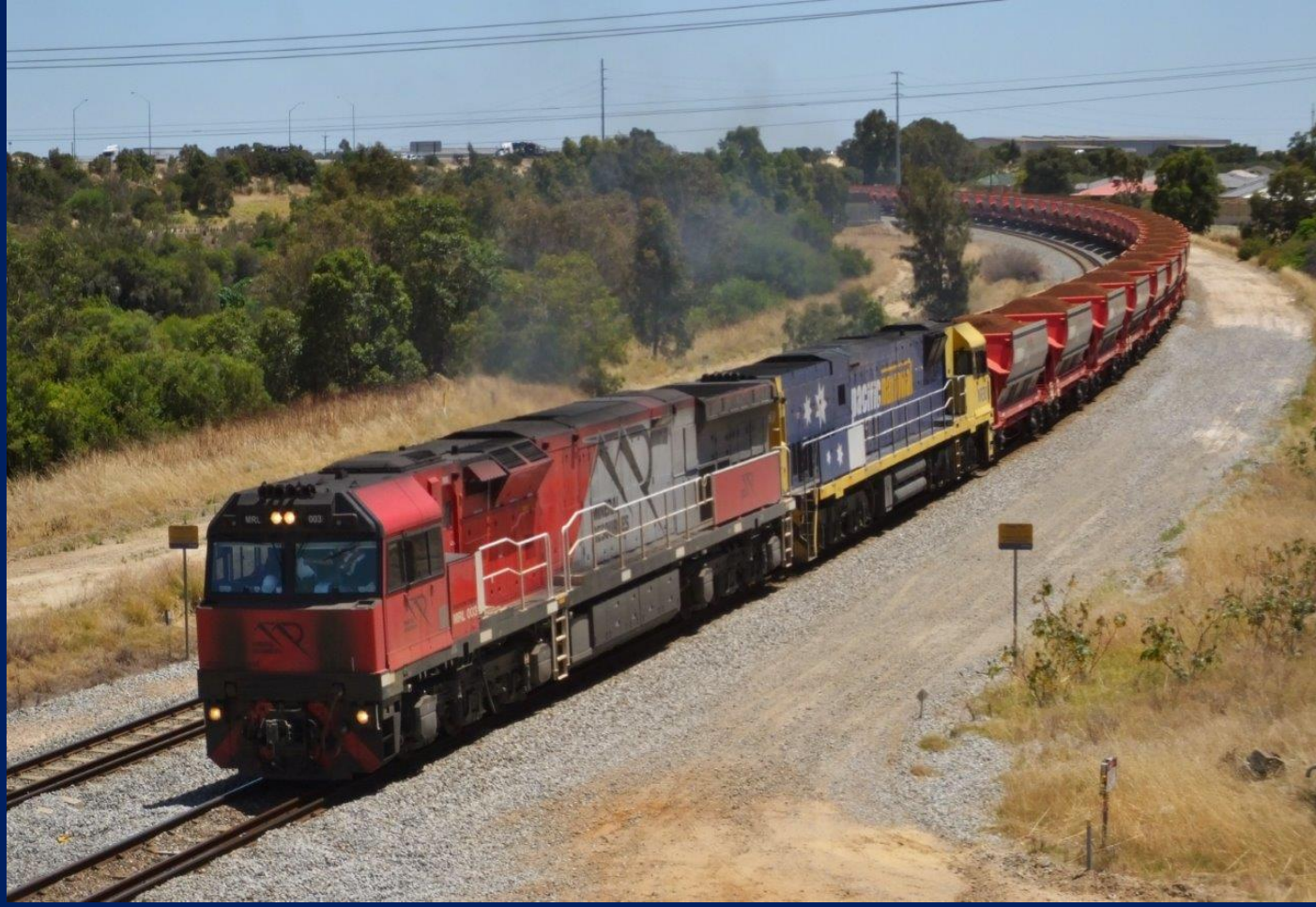
MRL003 & NR30 on late 5032 Polaris ore at Welshpool after loco swap December 19th.