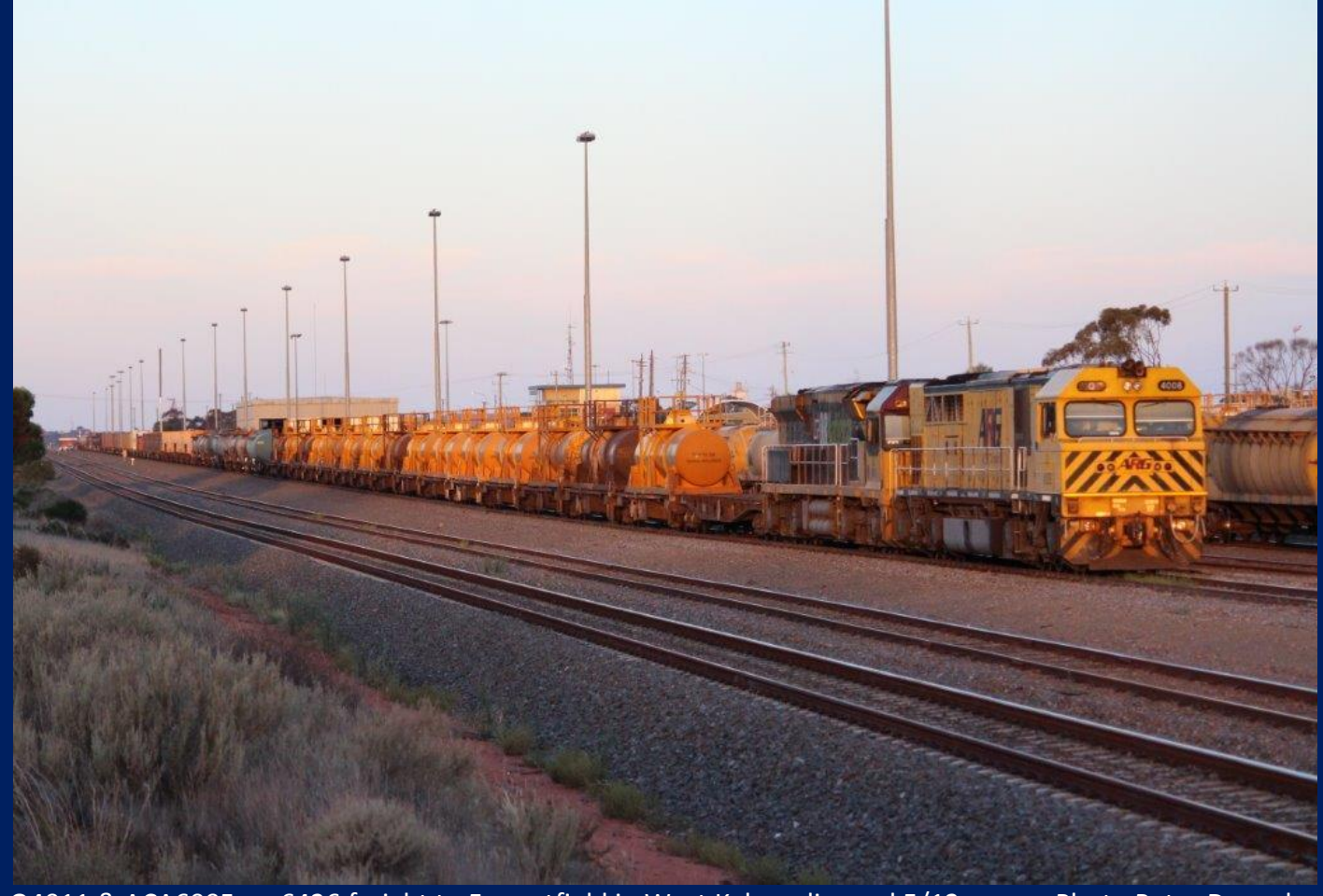
Q4011 & ACA6005 on 6426 freight to Forrestfield in West Kalgoorlie yard 5/12.