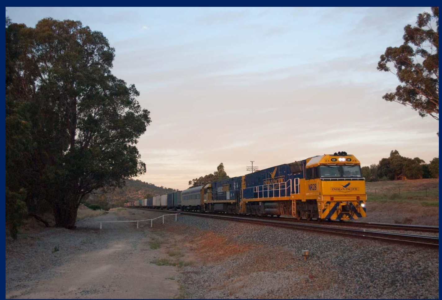
NR28 & NR30 on 7SP3 intermodal leaving Avon Valley at Brigadoon December 8th.