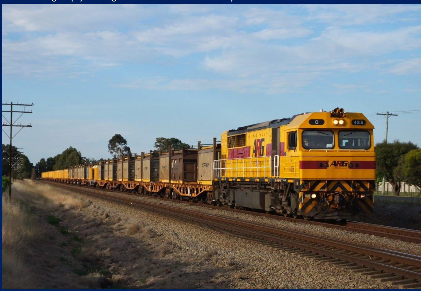
Q4016 on 5474 now discontinued salt train at Herne Hill December 4th.