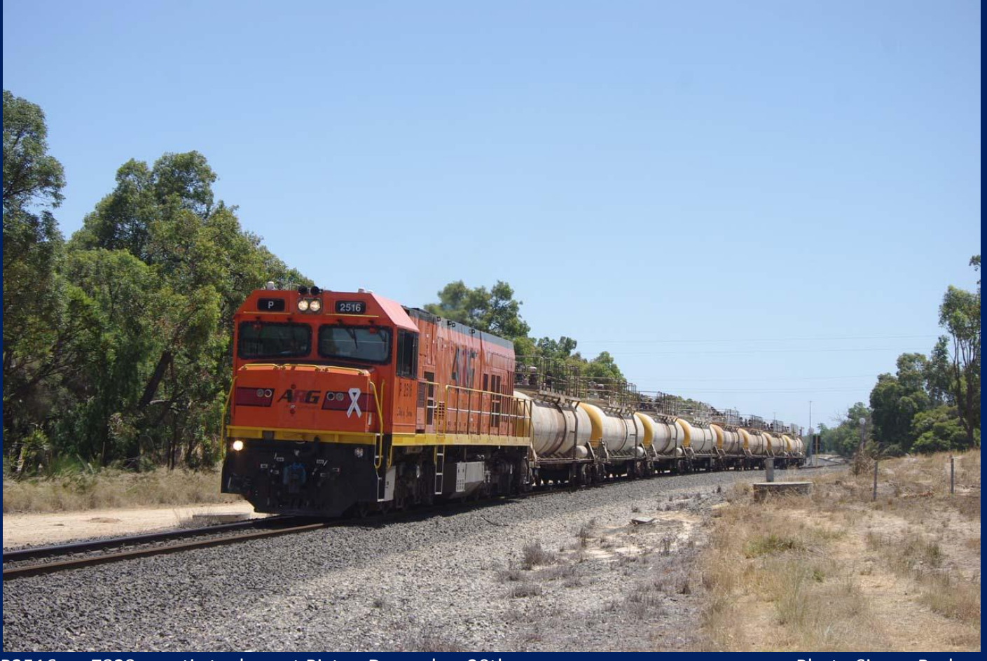
P2516 on 7823 caustic tankers at Picton December 20th.