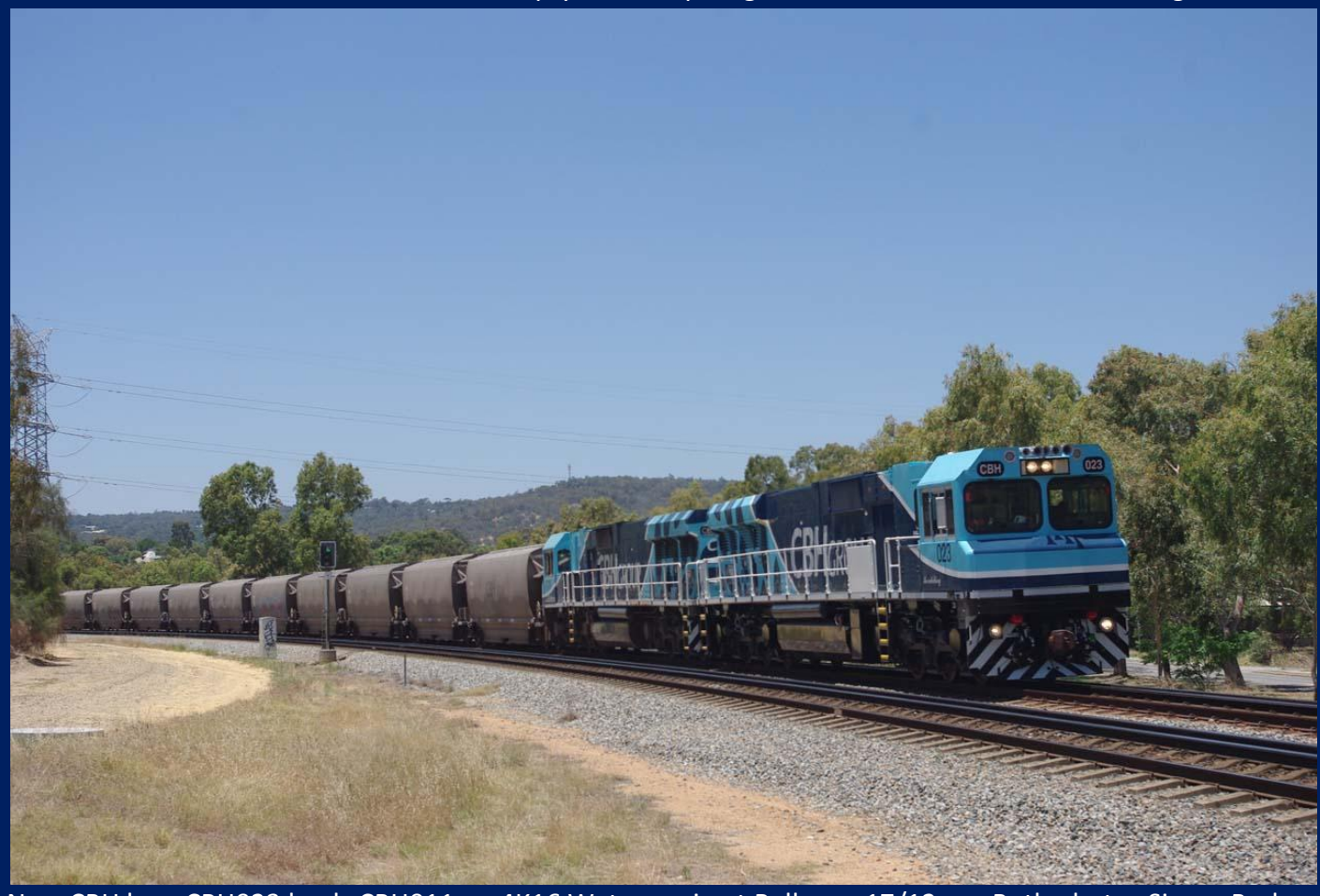
New CBH loco CBH023 leads CBH011 on 4K16 Watco grain at Bellevue 17/12.