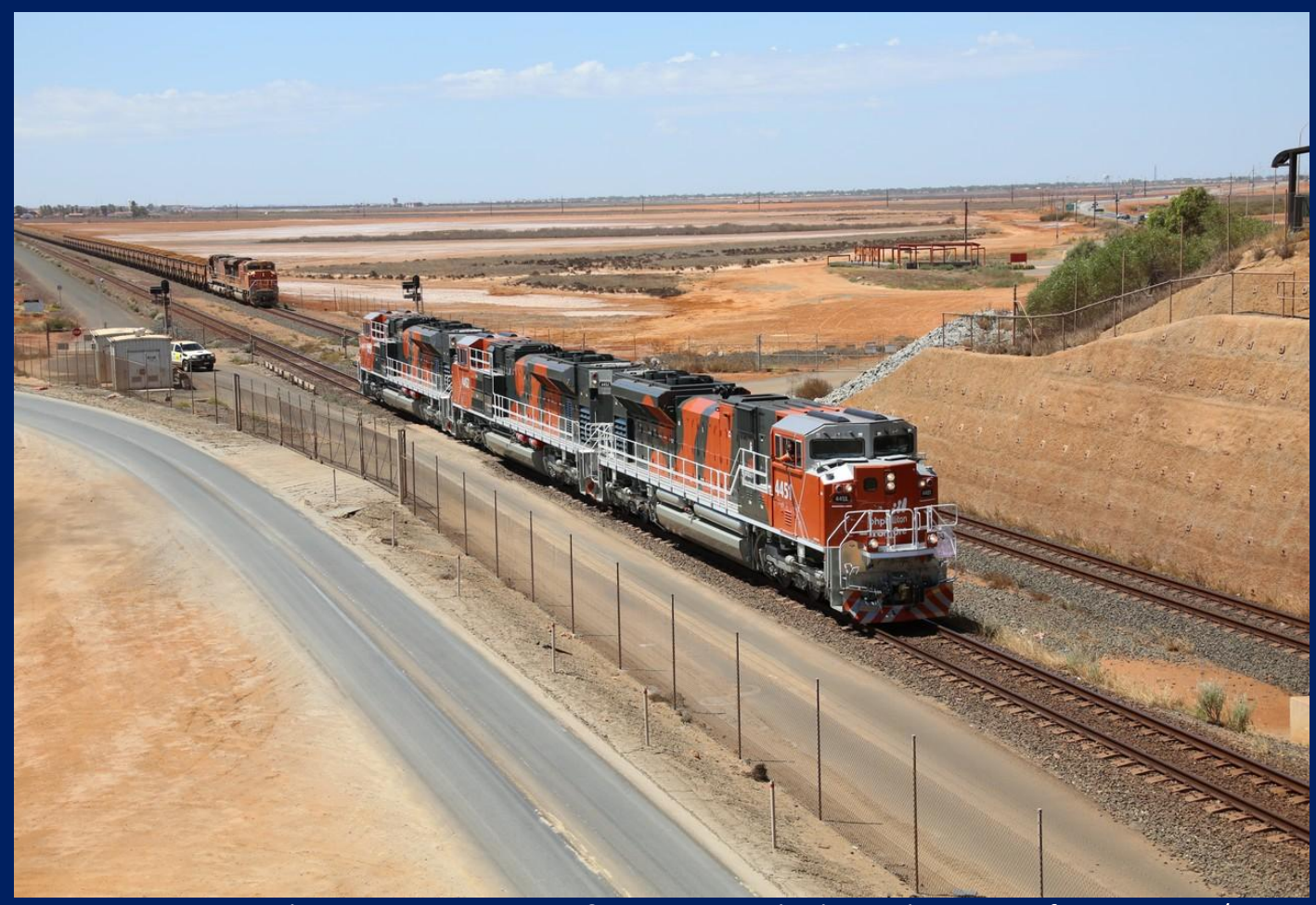
New BHPBIO SD70ACe locomotives 4451, 4452 & 4453 running back to Nelson Point after testing 20/12.