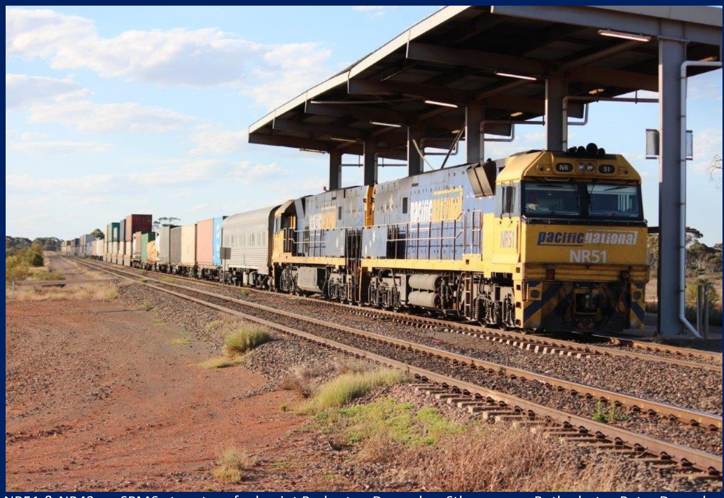
NR51 & NR43 on 6PM6 at eastern fuel point Parkeston December 6th.