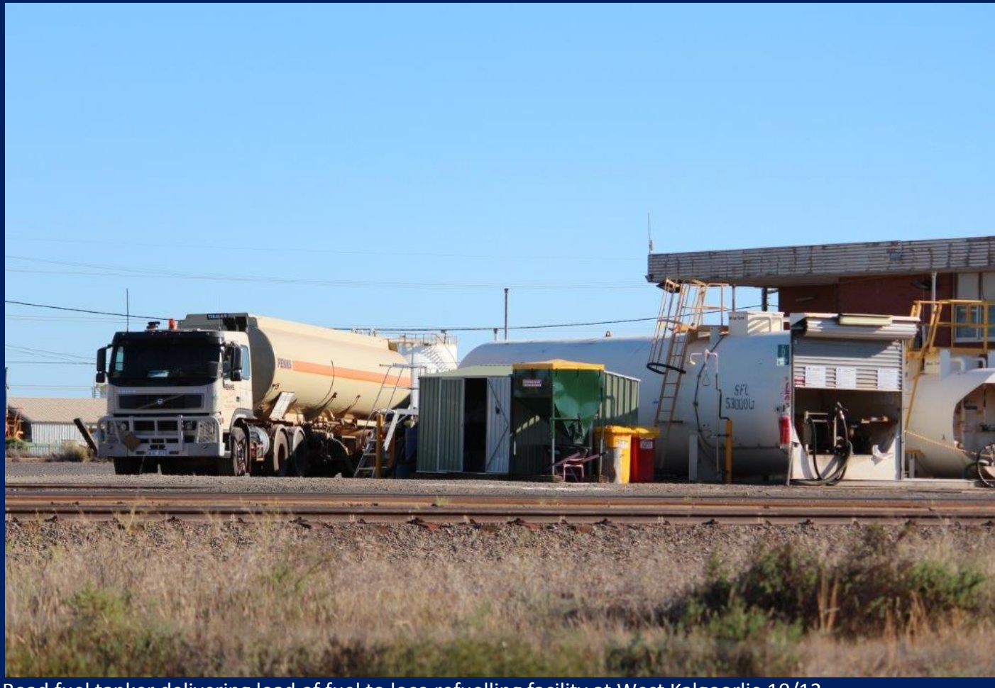
Road fuel tanker delivering load of fuel to loco refuelling facility at West Kalgoorlie 10/12.