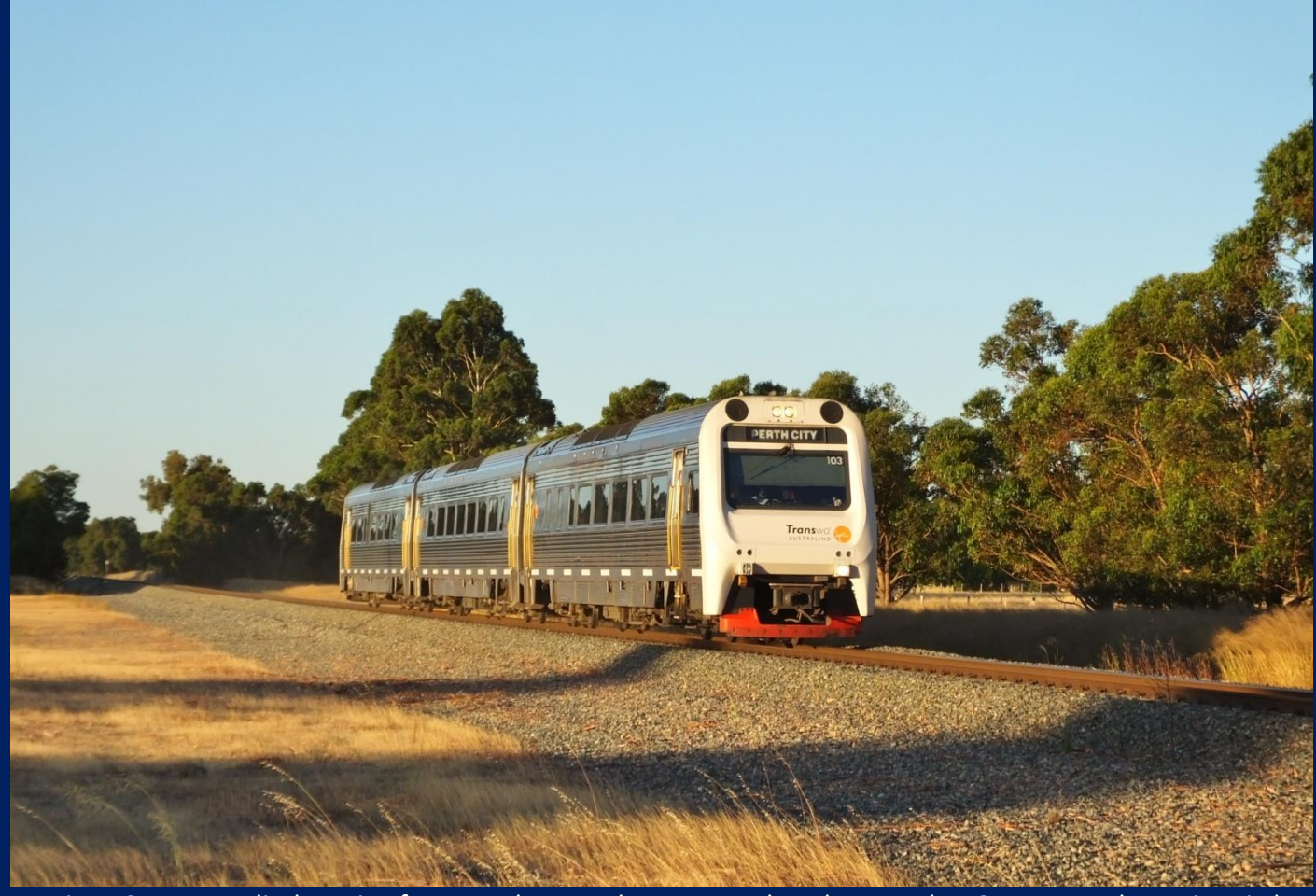
Evening 4215 Australind service from Perth to Bunbury at Keysbrook December 31st.