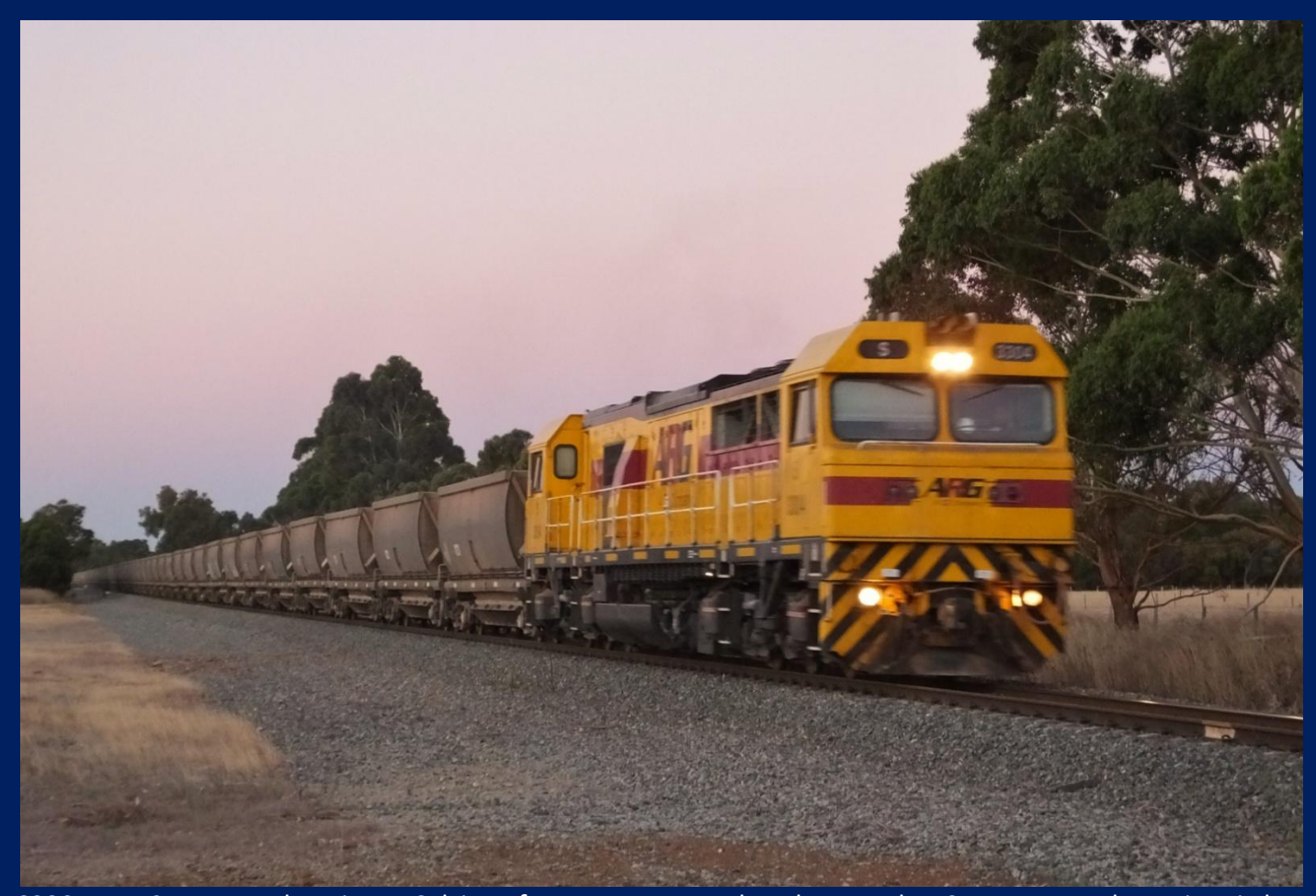
S3304 on 4945 empty bauxite to Calcine after sunset at Keysbrook December 31st.