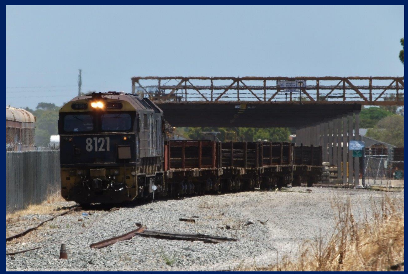
8121 shunting empty rail wagons out of Midland flashbutt yard December 19th.