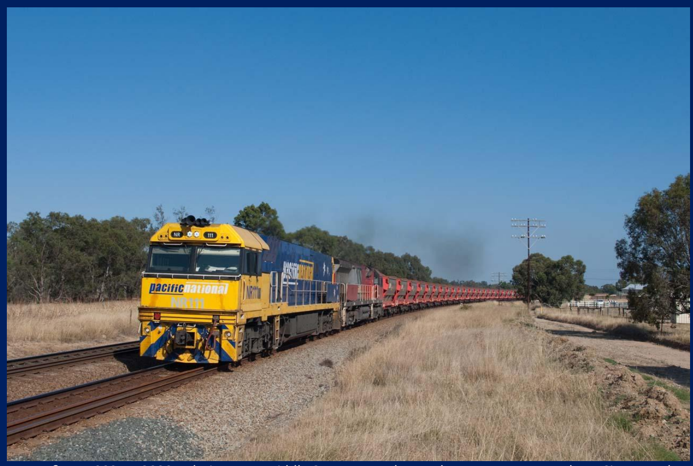
NR111 & MRL003 on 3030 Polaris ore at Middle Swan December 17th.