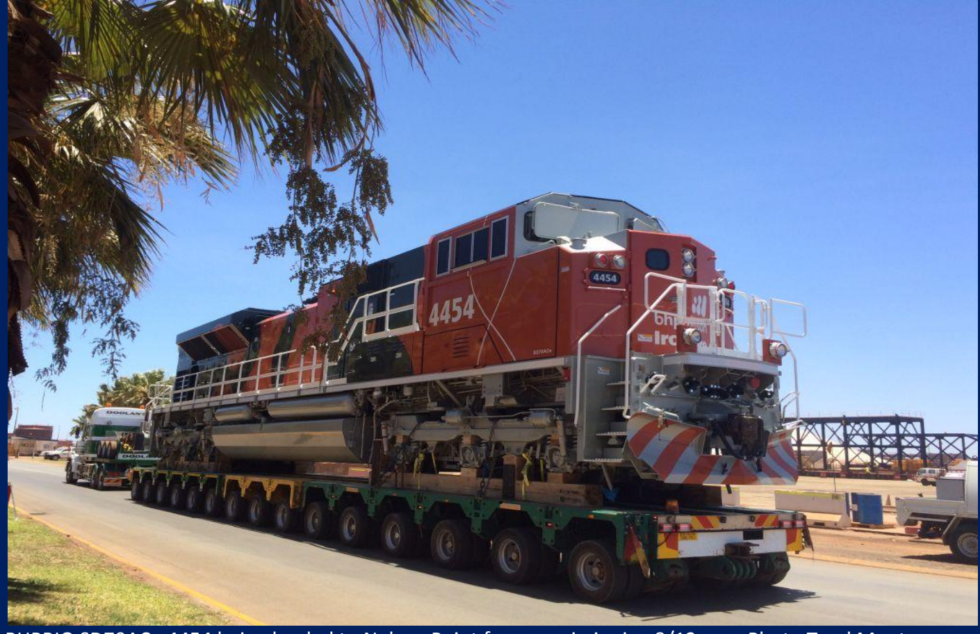
BHPBIO SD70ACe 4454 being hauled to Nelson Point for commissioning 8/12.