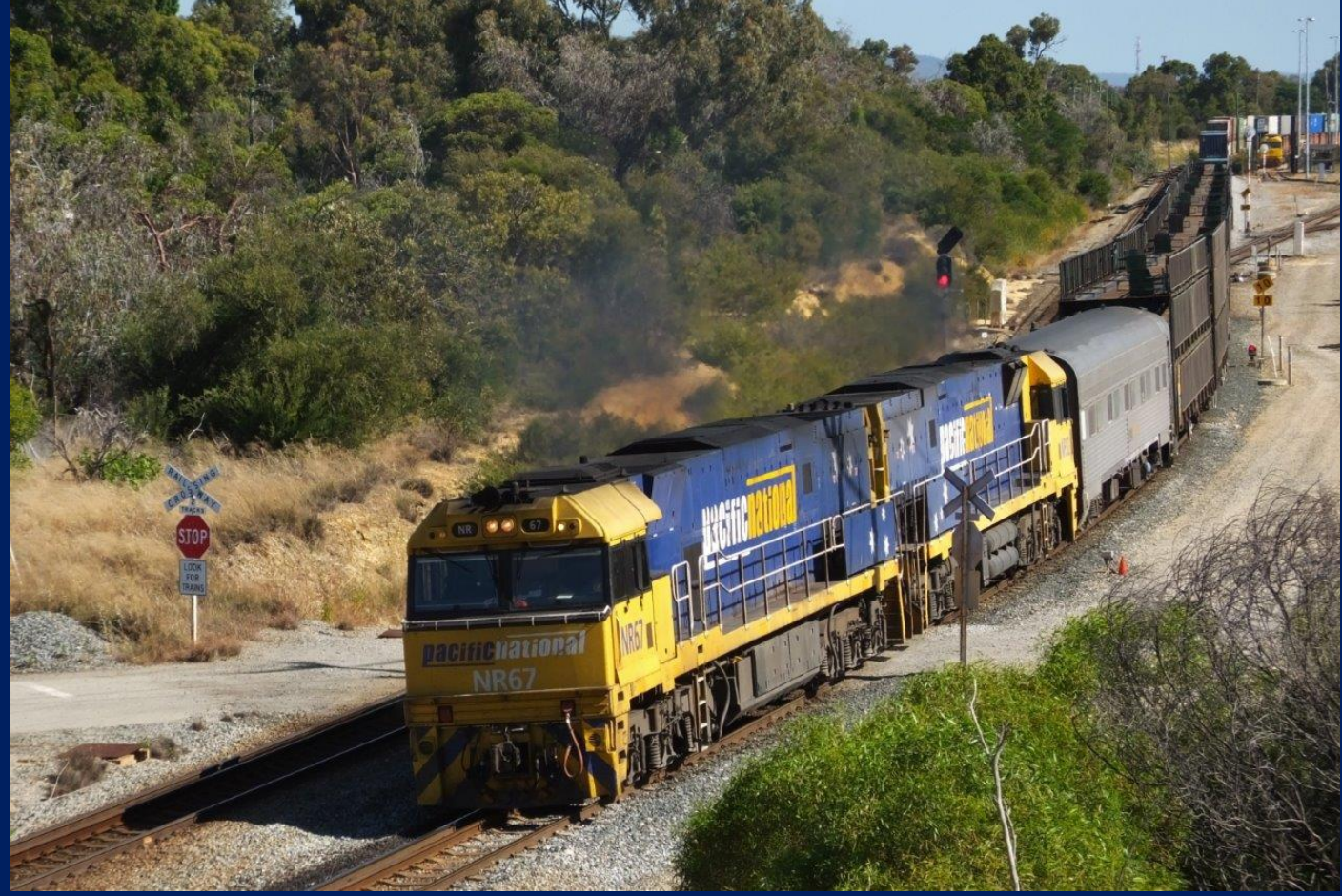
NR67 & NR92 on 1PM5 intermodal with 10x triple deck car carriers departing Forrestfield on 14/12.