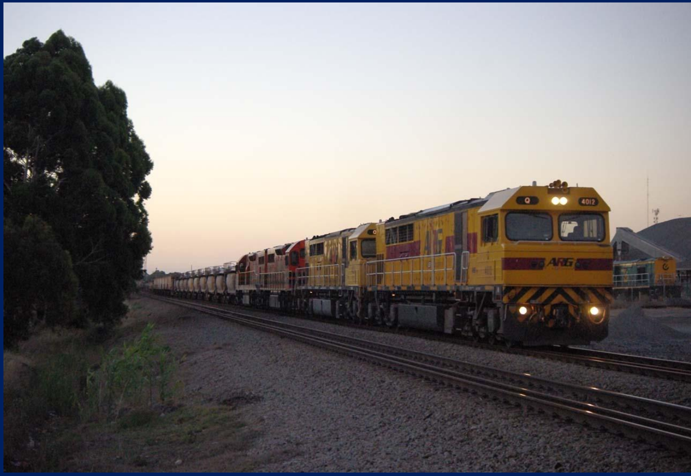
Q4012, Q4011, LZ3117 & LZ3111 on 6025 freight to Kalgoorlie at Bellevue on 12/12.