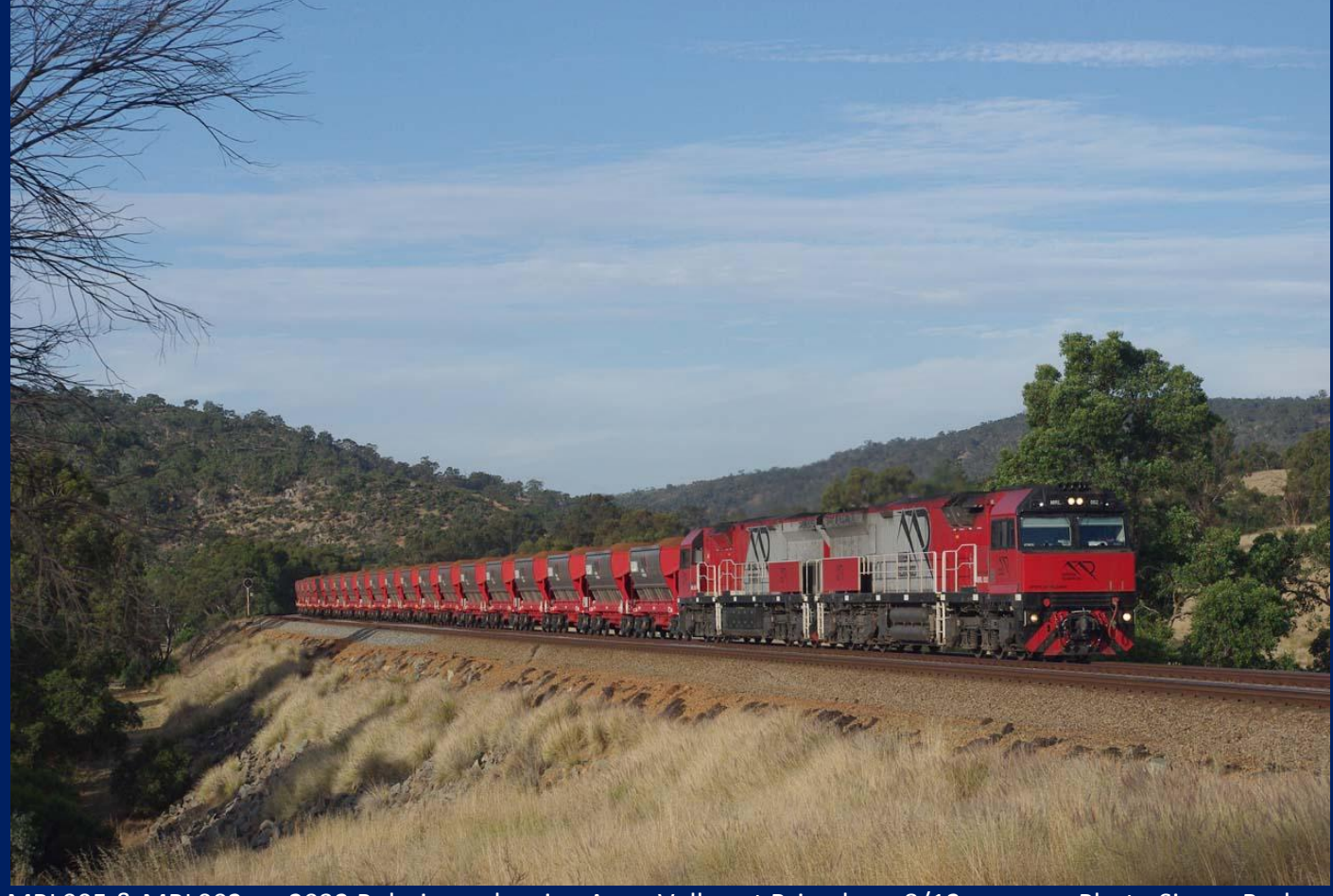
MRL005 & MRL002 on 2032 Polaris ore leaving Avon Valley at Brigadoon 8/12.