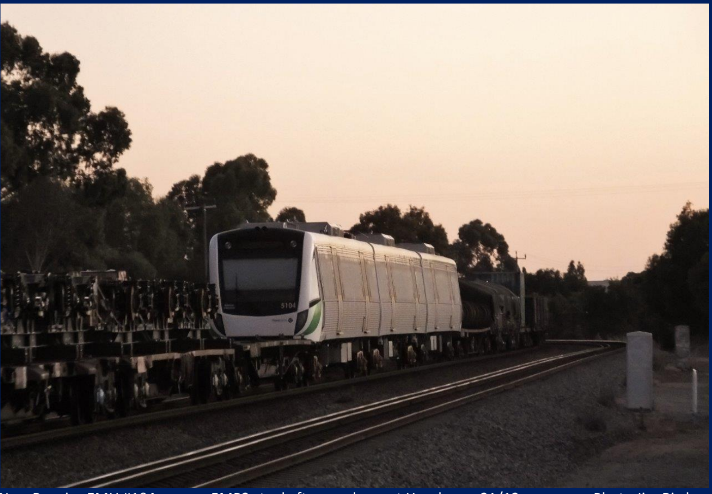
New B series EMU #104 on rear 5MP2 steel after sundown at Hazelmere 21/12.