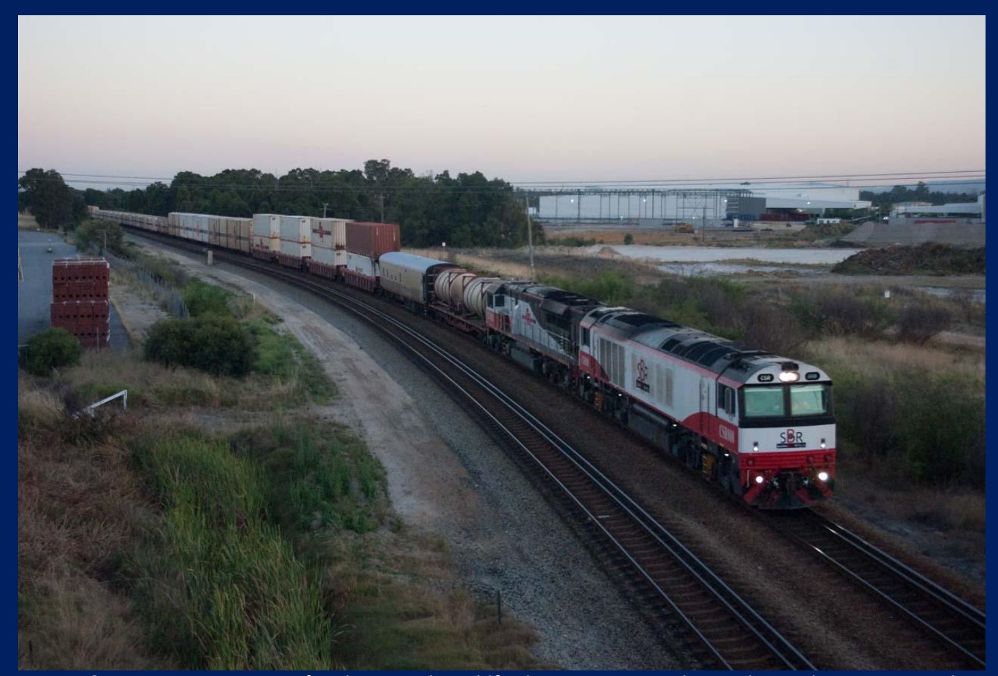
CSR008 & SCT003 on 3MP9 SCT freighter South Guildford at sunup December 12th.