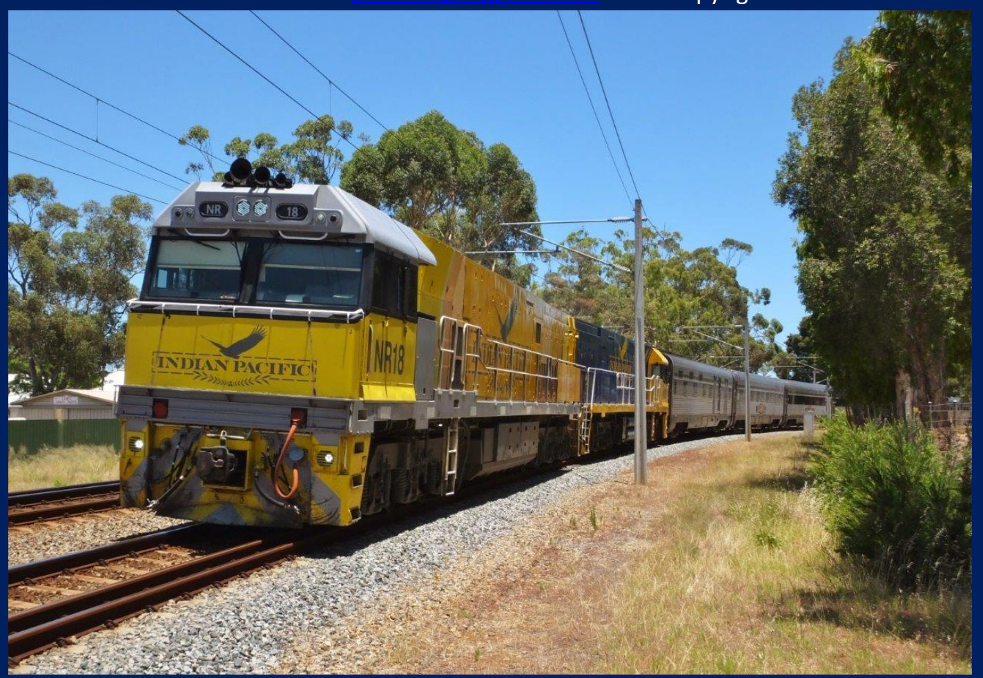
NR18 & NR27 on 1PA8 Indian Pacific under the wires at East Guildford December 28th.