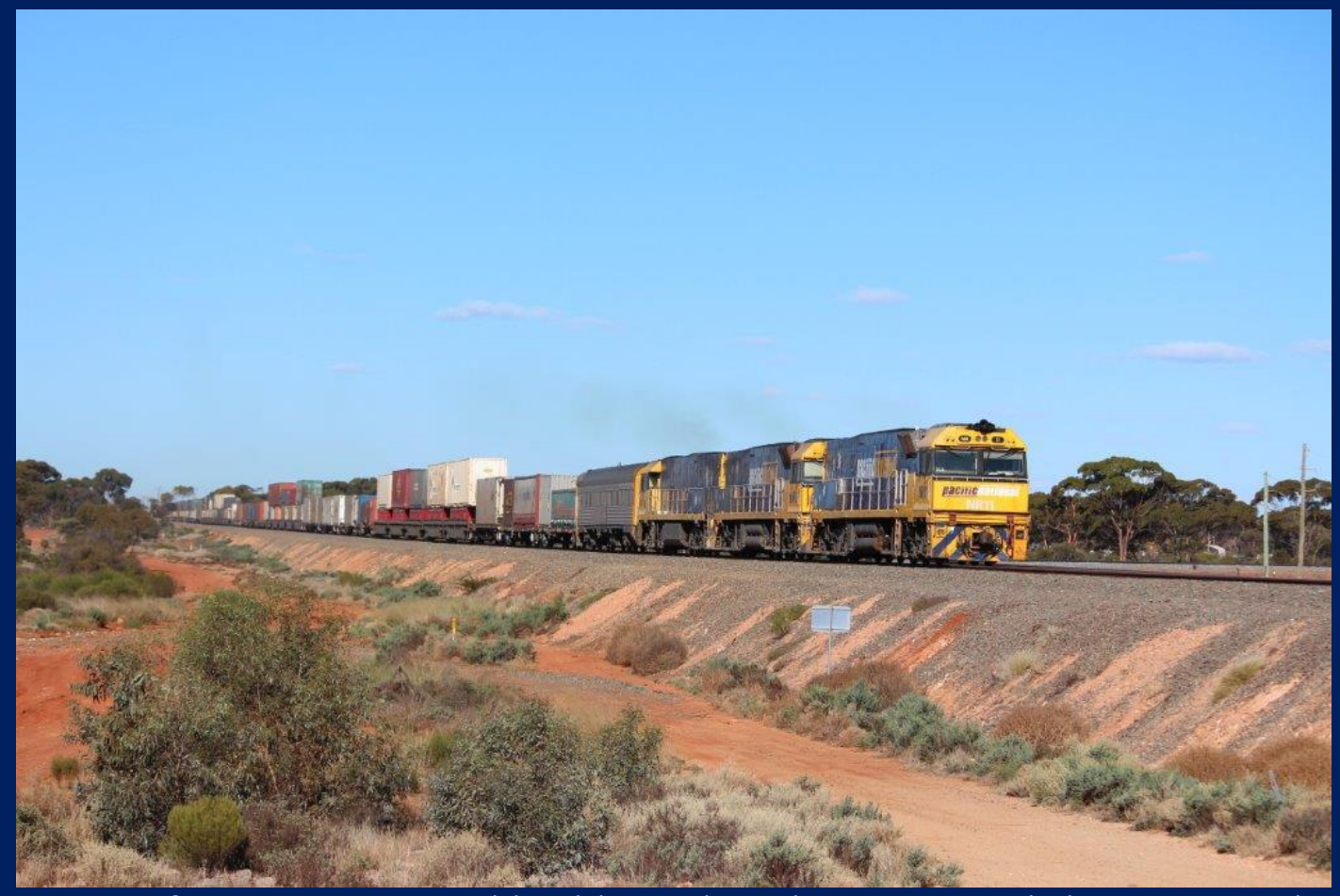
NR11, NR13 & NR81 on 3MP5 intermodal Binduli December 27th.