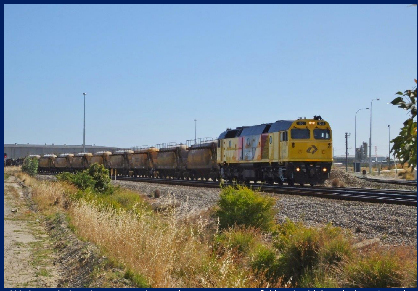
DC2213 on 7197 Soundcem cement shunter about to enter Forrestfield yards 13/12.