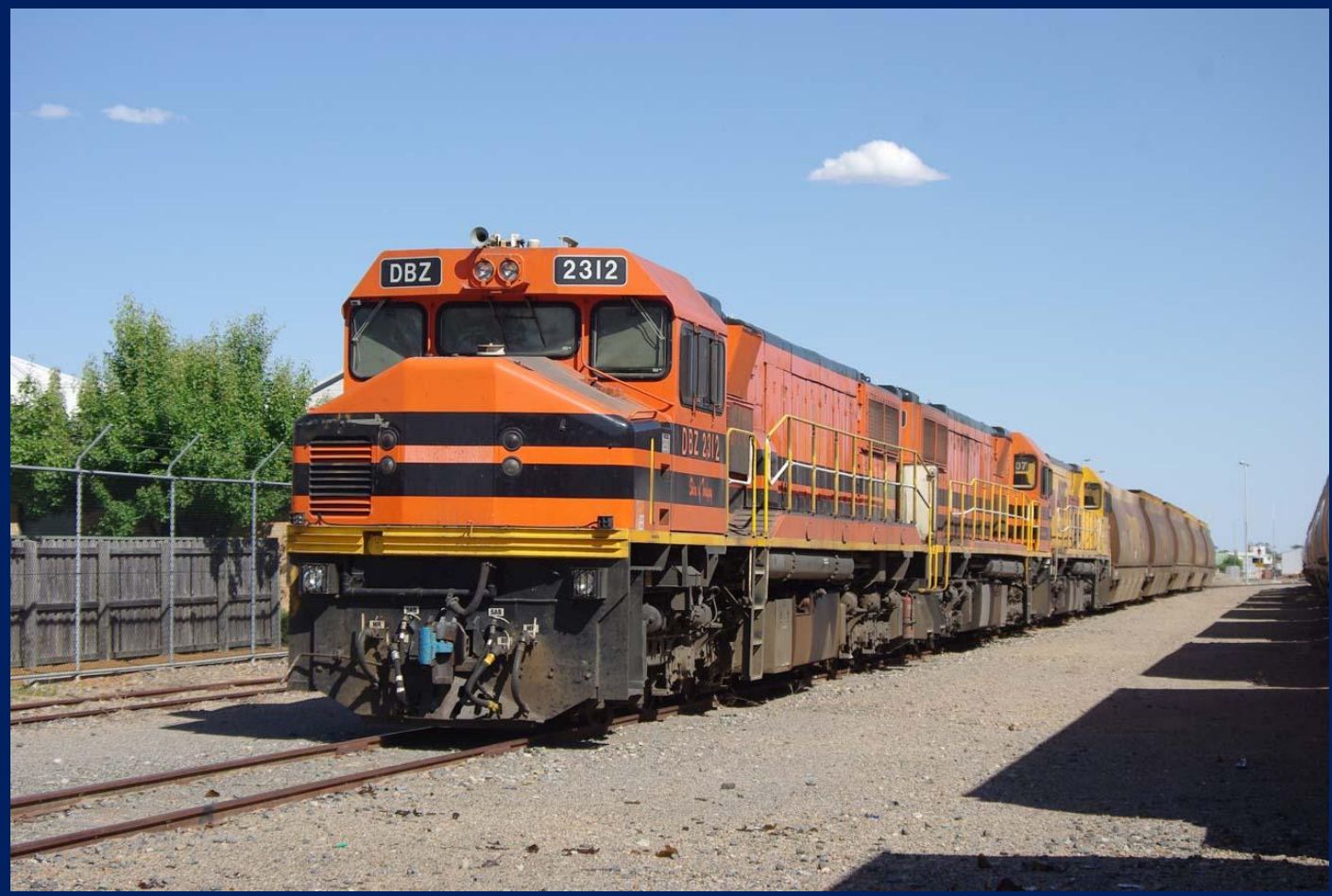
DBZ2312, DBZ2310 & DBZ2307 on 6304 empty woodchip wagon movement stabled at Katanning 19/12.