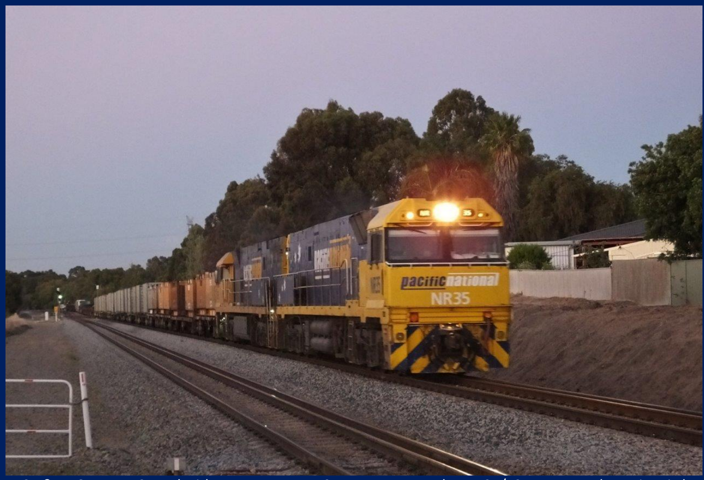
NR35 & NR6 on 5MP2 steel with new EMU set #104 on rear at Hazelmere 21/12.