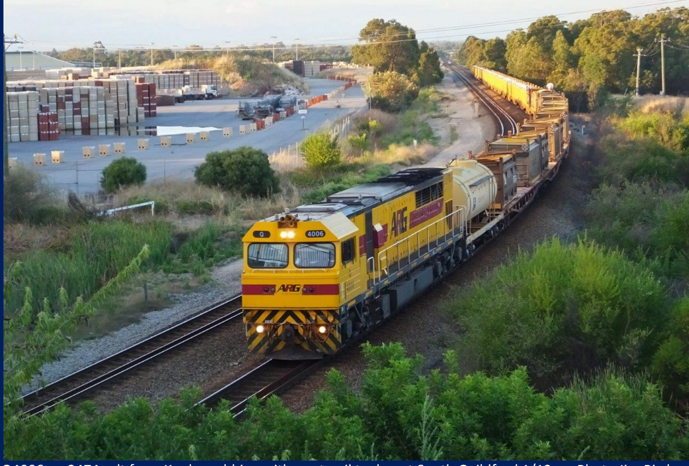
Q4006 on 2474 salt from Koolyanobbing with waste oil tanker at South Guildford 1/12.