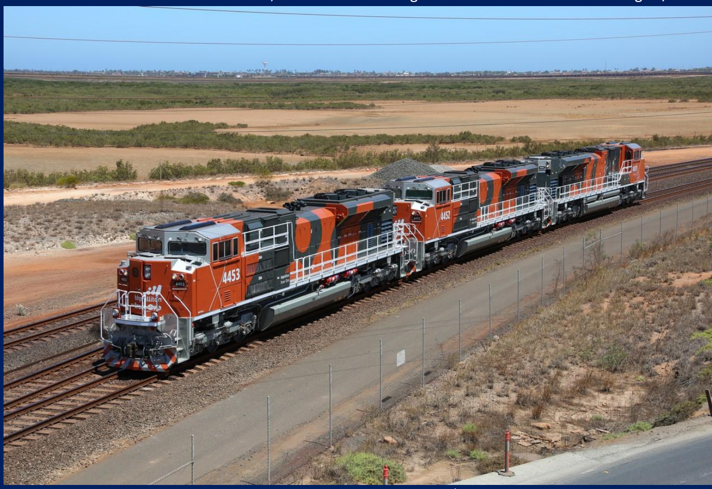
SD70ACe 4453, 4452 & 4451 entering Nelson Point after tests on 20/12.