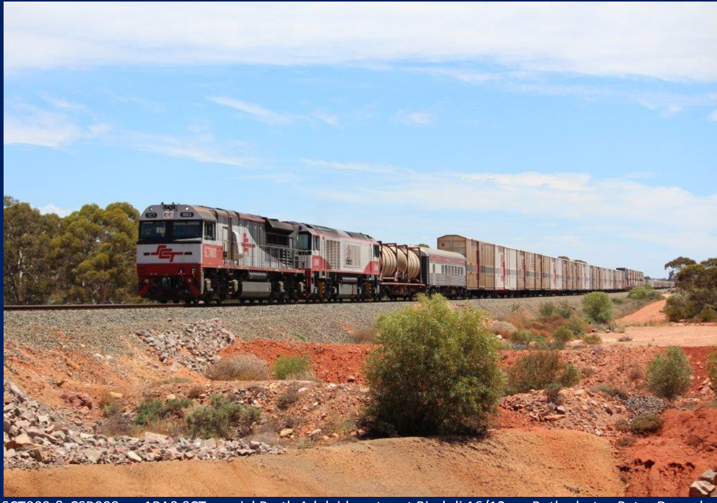
SCT003 & CSR008 on 1PA9 SCT special Perth Adelaide extra at Binduli 16/12.