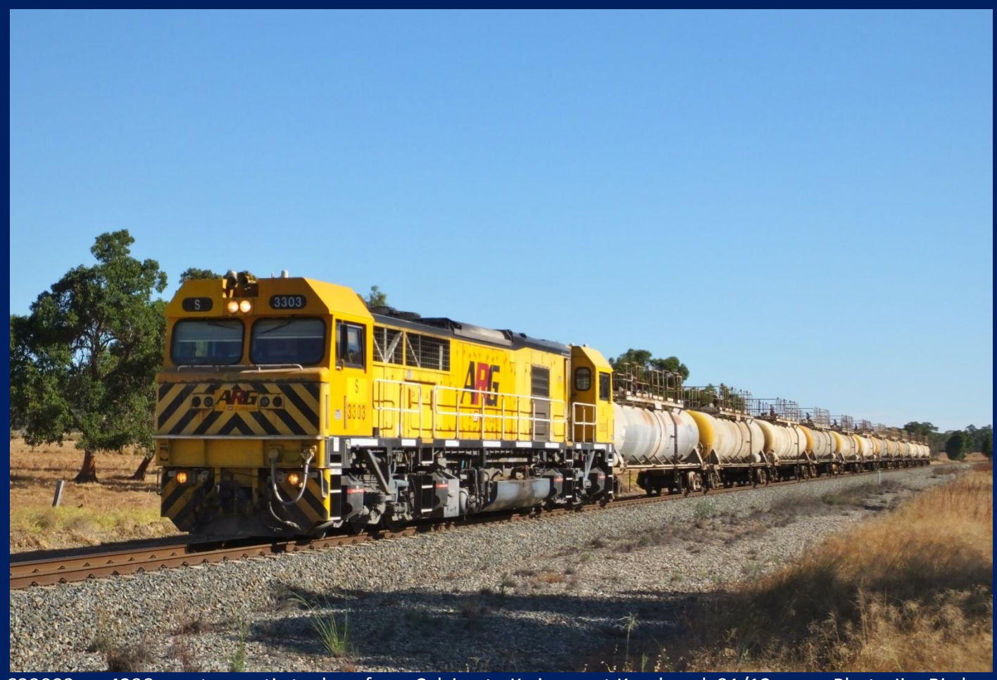
S33003 on 4238 empty caustic tankers from Calcine to Kwinana at Keysbrook 31/12.