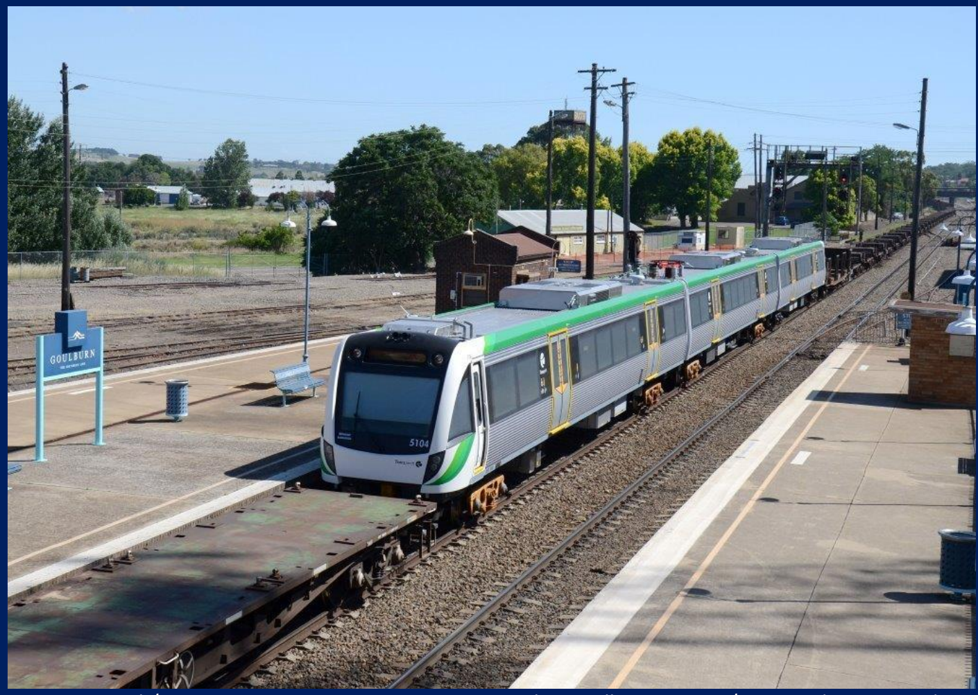
New Transperth/PTA B series EMU 5104 on rear 4NY3 steel at Goulburn NSW 17/12.