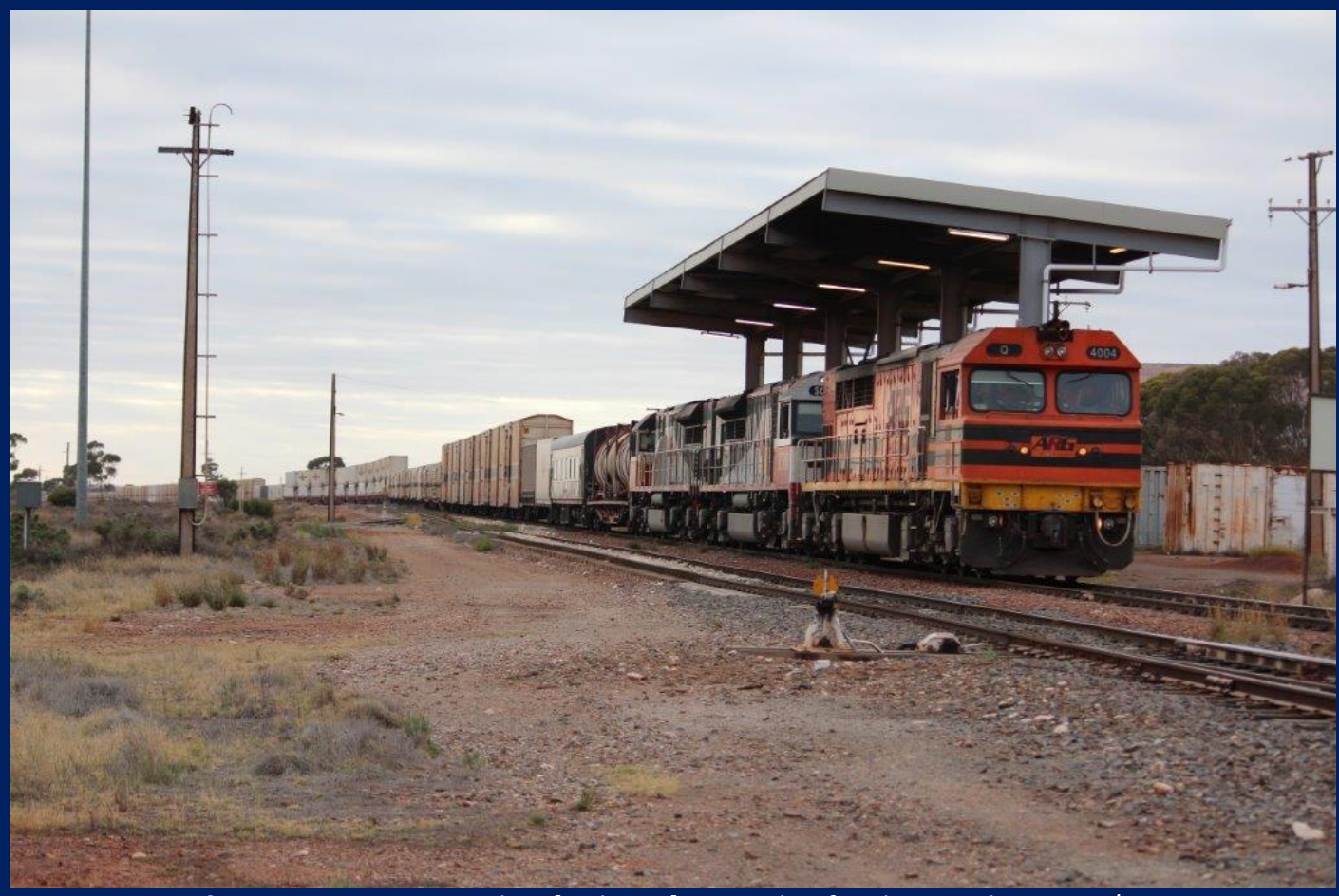
Q4404, SCT008 & SCT006 on 7PG1 very late [19 hours] SCT Parkes freight at Parkeston 16/12.