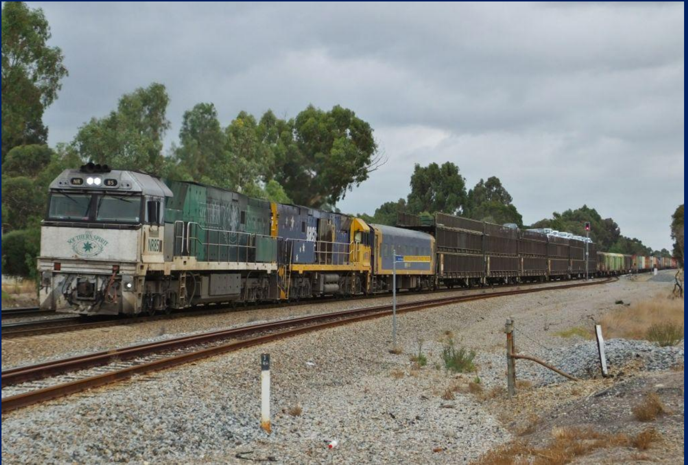
NR85 & NR79 on 7PM5 Perth Melbourne intermodal at Woodbridge March 21st.