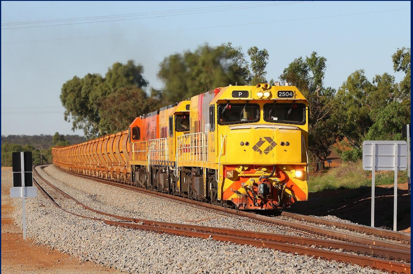
P2504, P2502 & P2509 run late 7721 ore thru Mullewa March 28th.