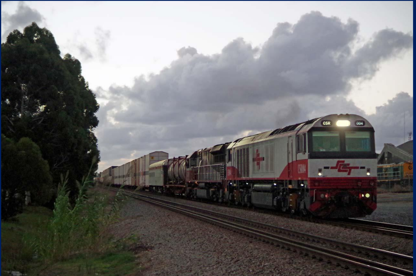
CSR004 & SCT001 on 1PM9 Perth Melbourne SCT freight at Bellevue March 15th.