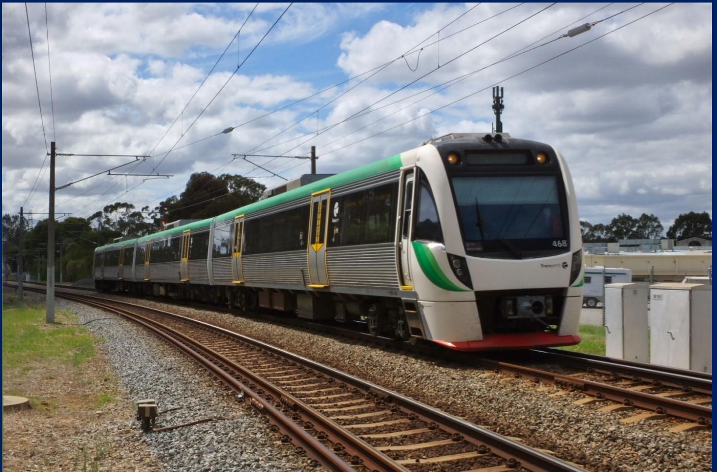
EMU B series set 68 at East Guildford on Midland line March 22nd.