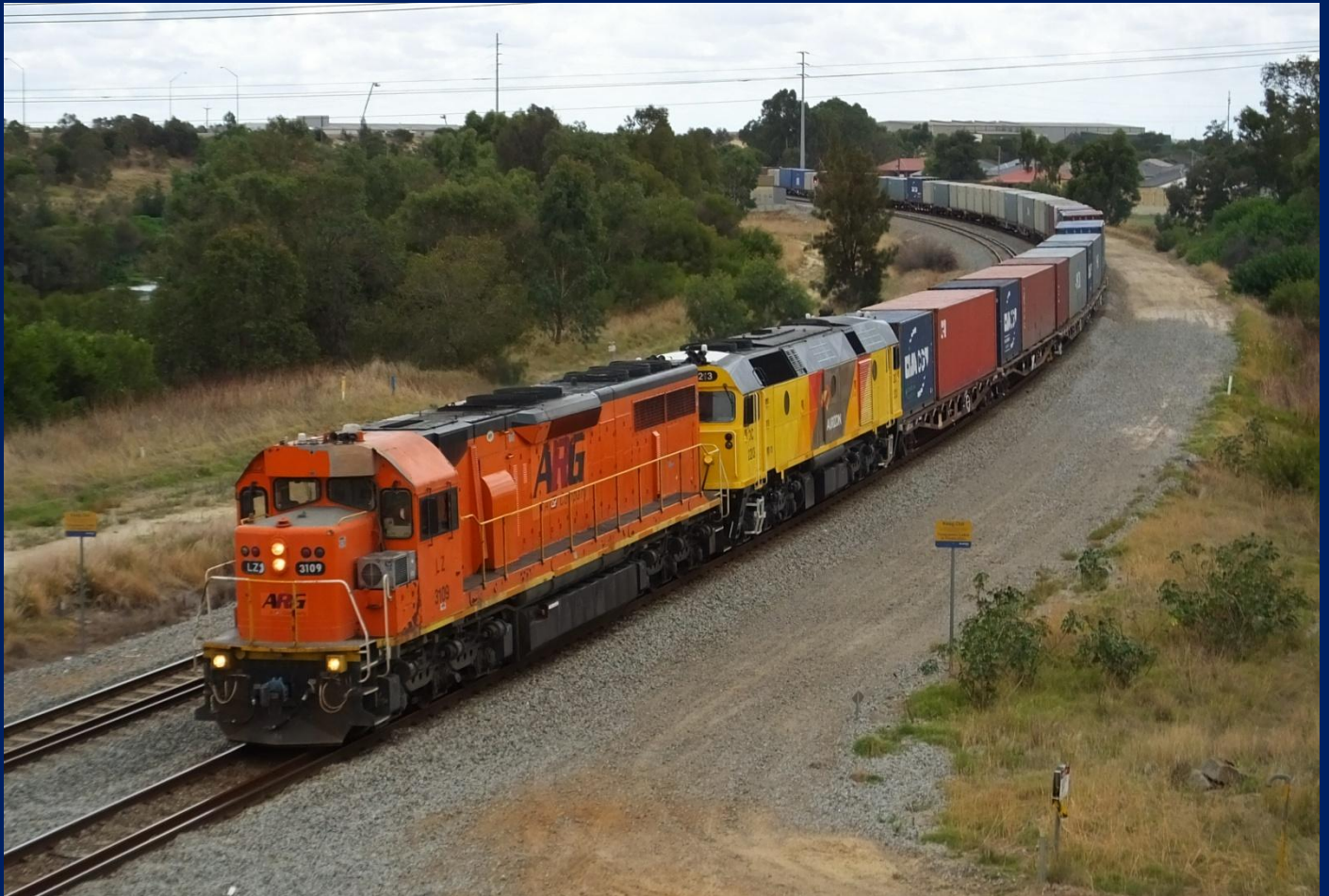
LZ3109 & DC2213 on 3144 IMG Forrestfield North Port container train Wattle Grove 17/3.