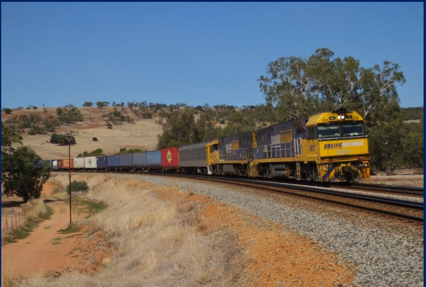
NR11 & NR107 on 6SP5 Sydney Perth intermodal at Northam March 29th.