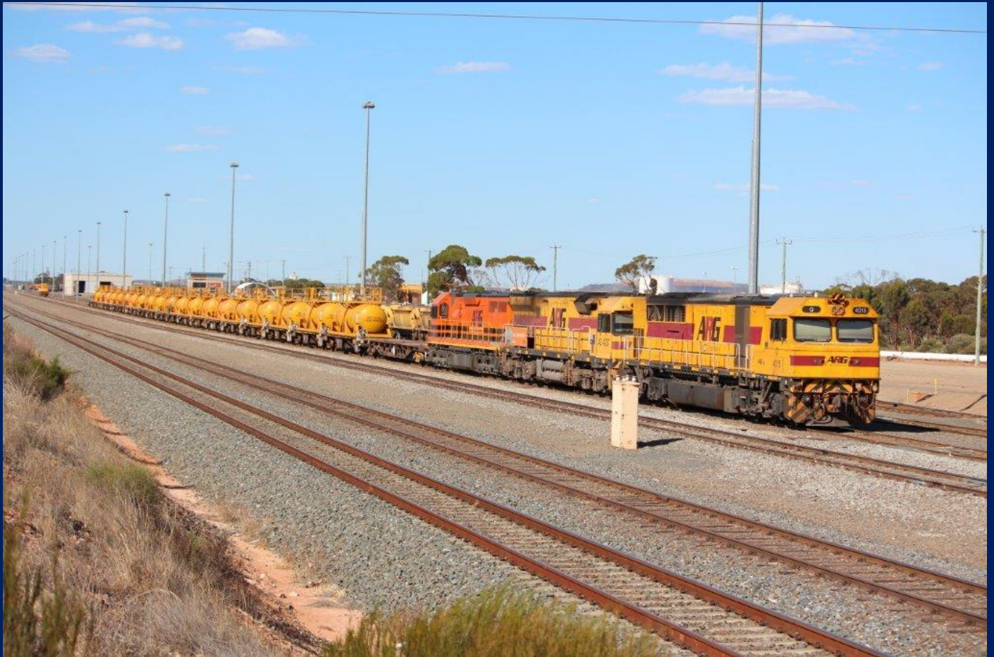
Q4015, AC4307 & [dead] LZ3107 setting up 5426 freight to Forrestfield at WEK 12/3.