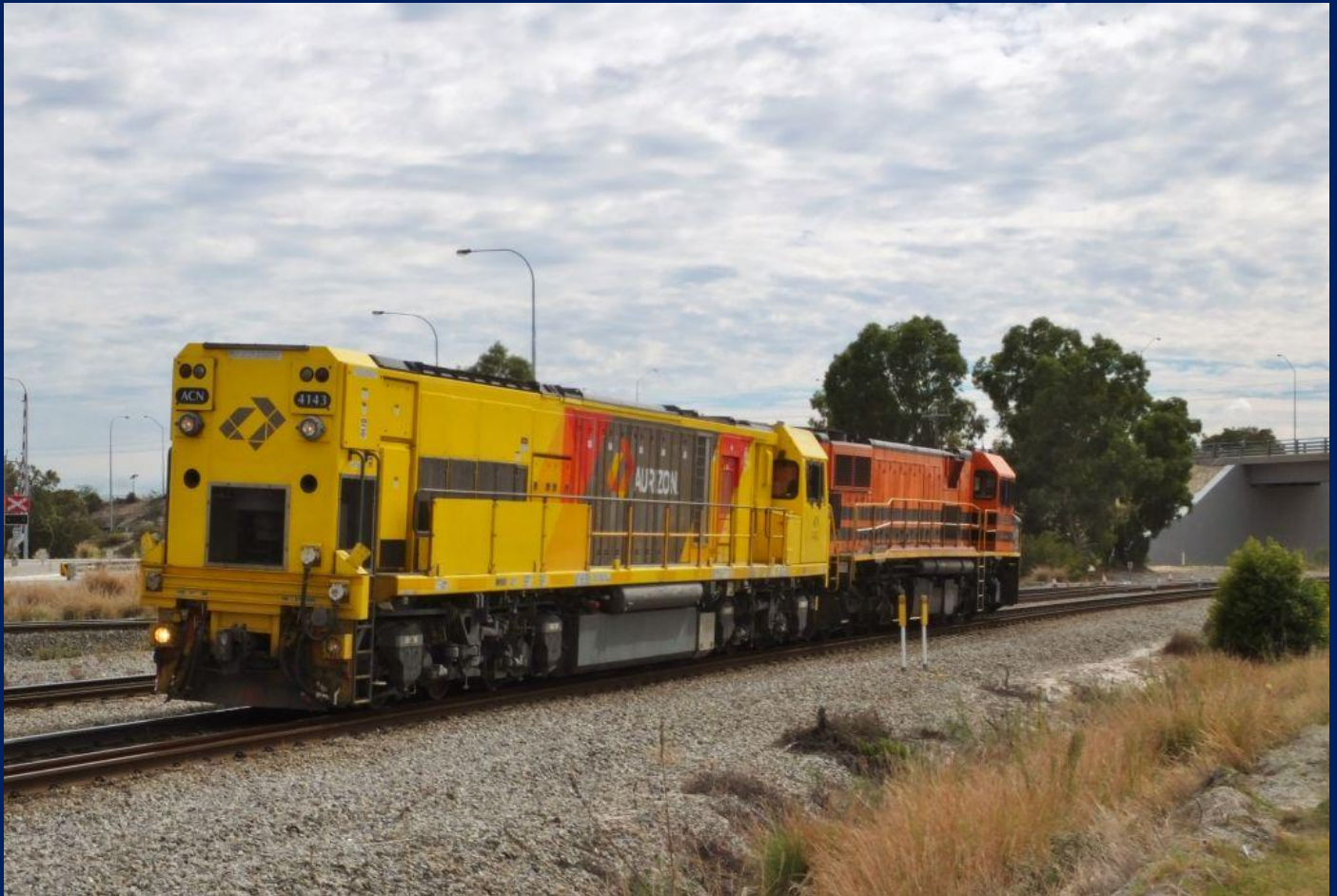
ACN4143 & DBZ2304 on 3120 light engine movement Forrestfield to Kwinana at Kewdale March 31st.