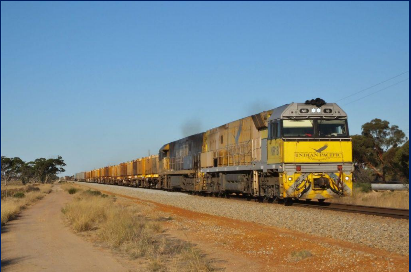
NR18 & NR64 on 5MP2 steel train with Transperth EMU set 106 on rear Cunderdin 29/3.