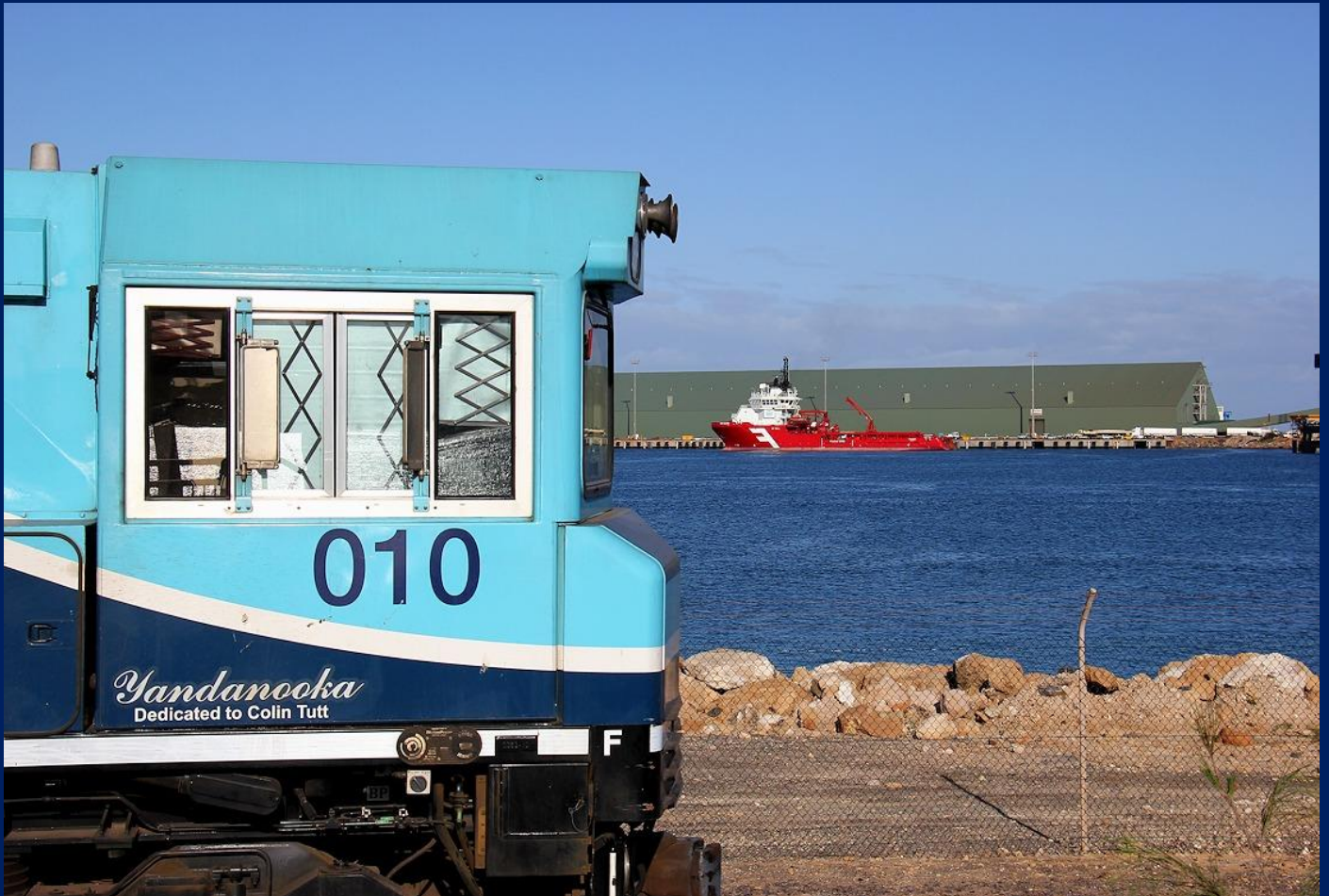
CBH010 with oil rig support vessel "Far Sound" berthed in Geraldton Port March 19th.