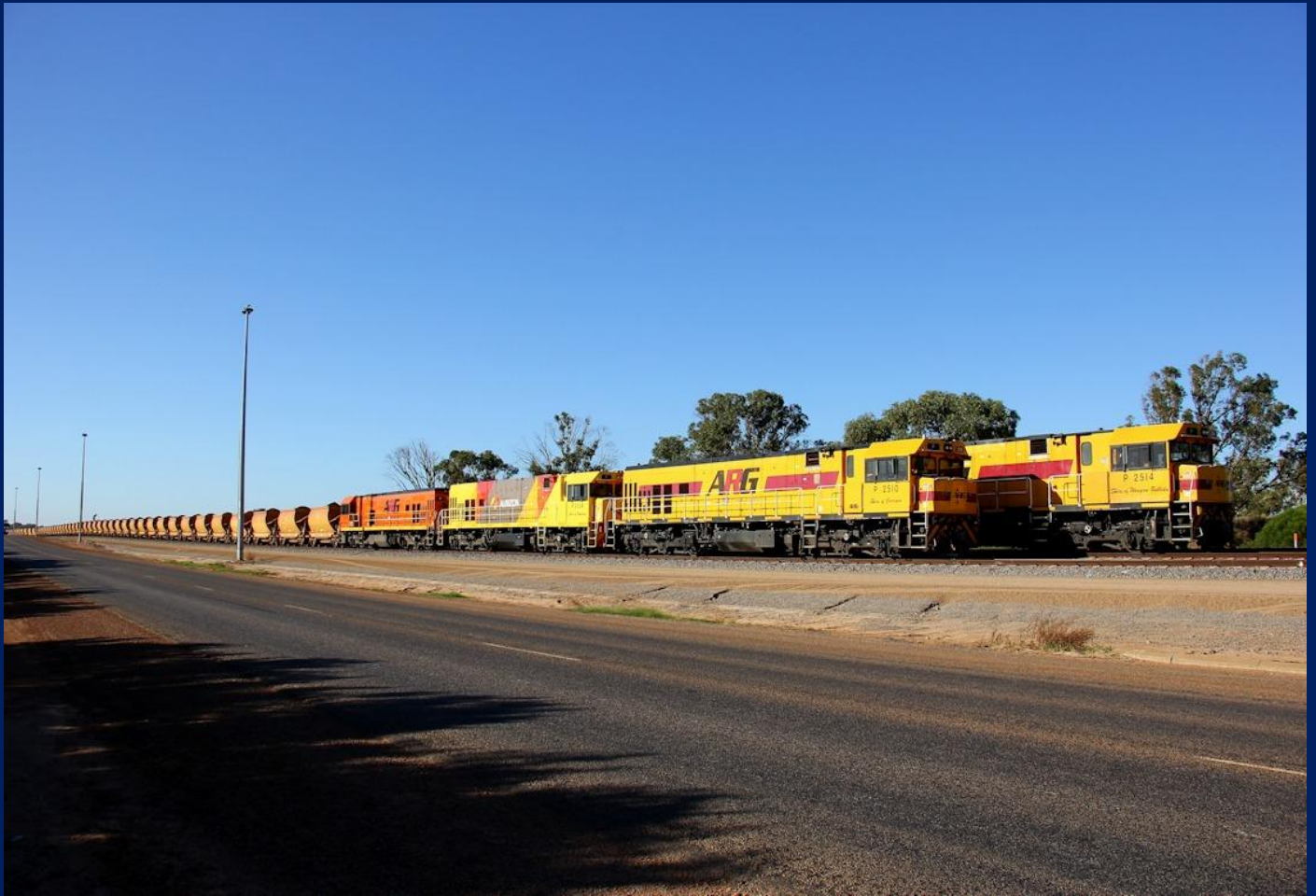
P2510, P2504 & P2509 stabled next to P2514, P2506 & P1515 on ores Narngulu 11/3.