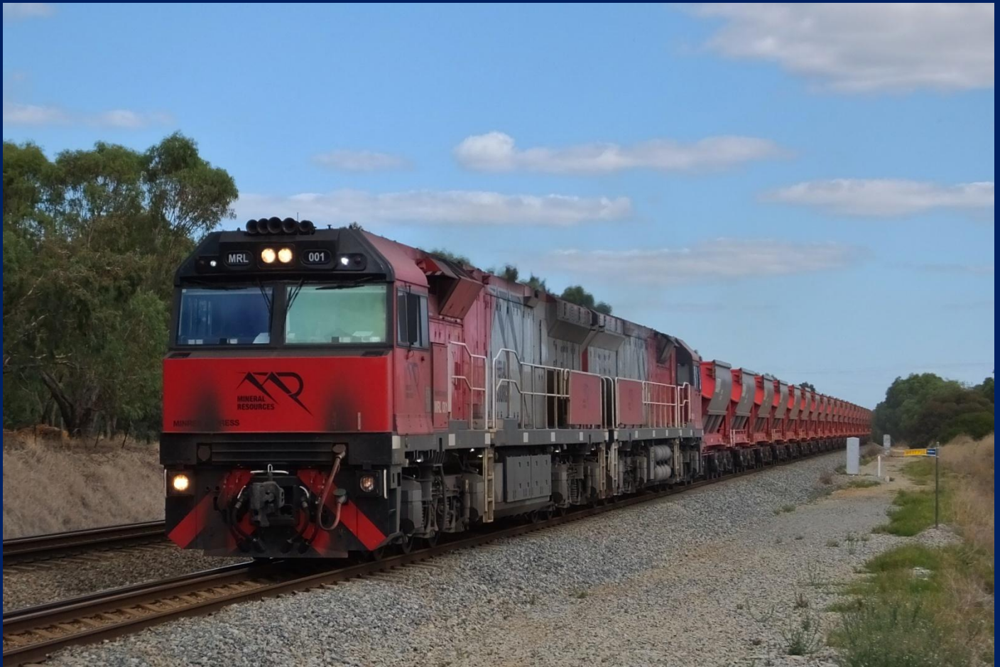
MRL001 & MRL005 on 1035 empty Polaris ore to Mt Walton Hazelmere March 22nd.