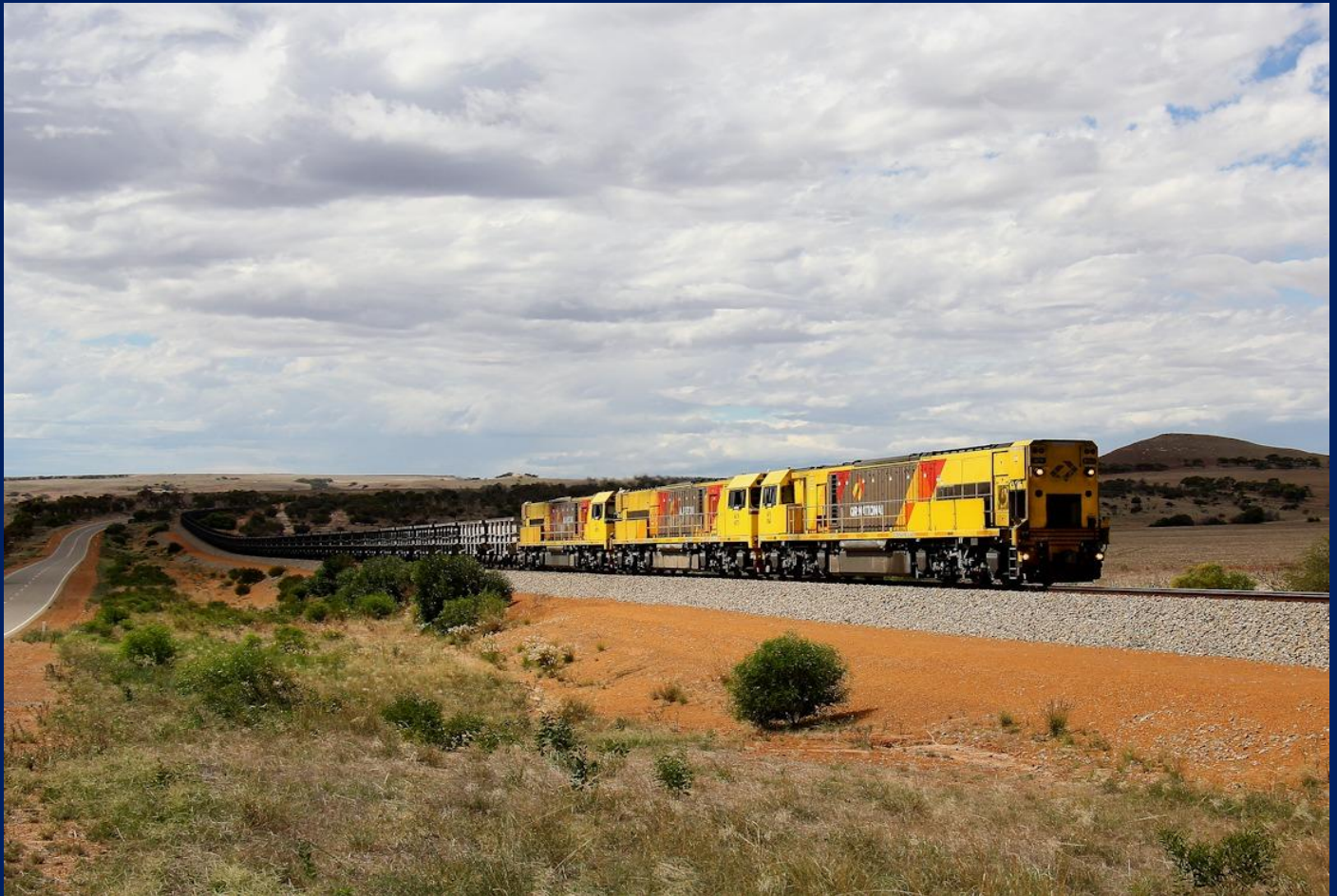
Long end ACN4168, ACN4171 & ACN4170 on 5761 ore Moonyoonooka 26/3.