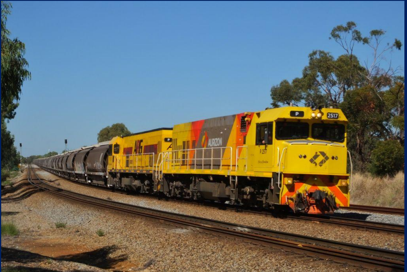
P2517 & P2511 on 7K05 empty grain leased XU rake at Woodbridge March 28th.