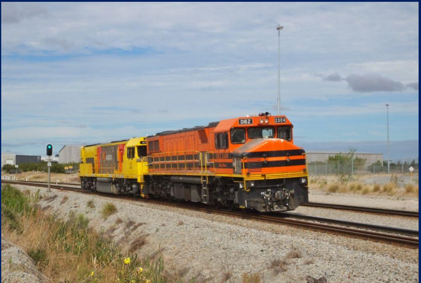
ACN4143 hauling DBZ2304 on 3120 light engine at Kewdale March 31st.