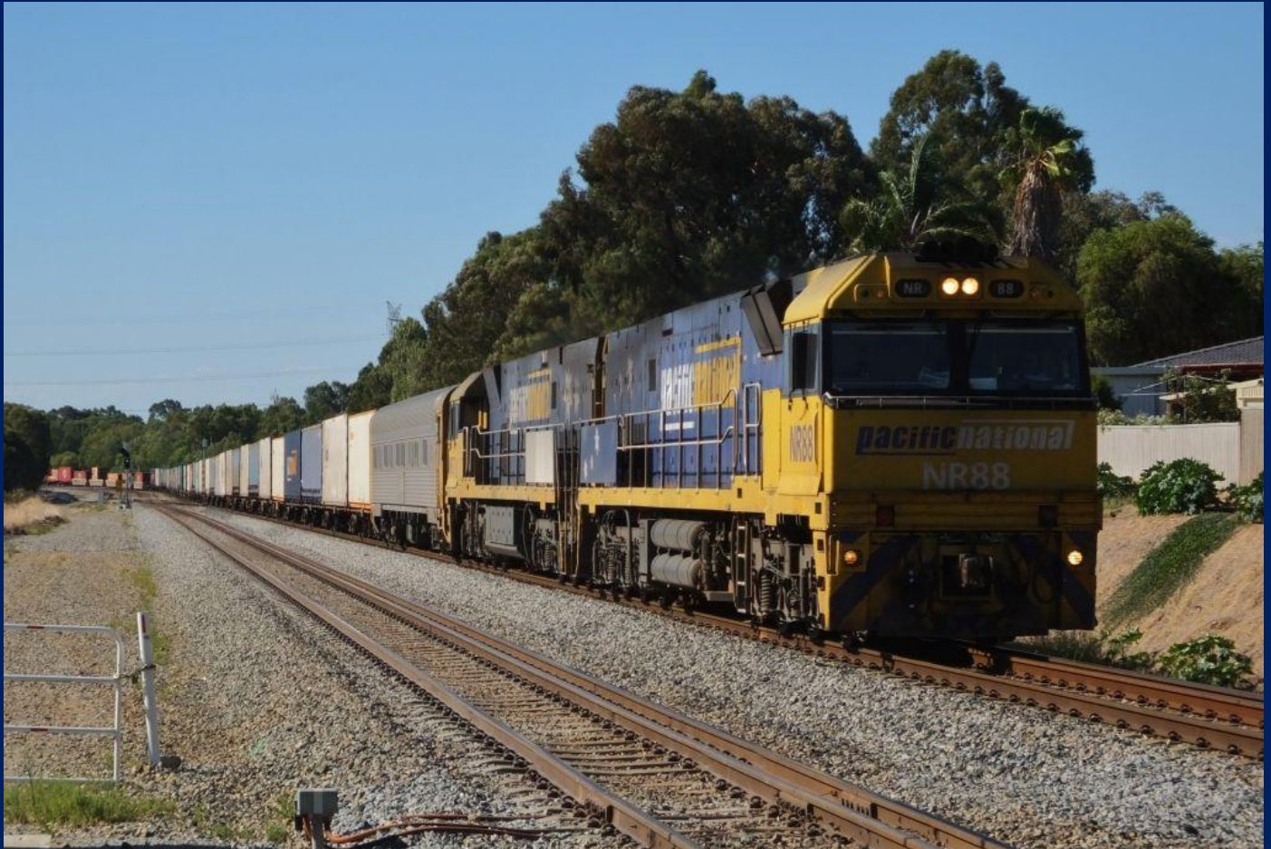
NR88 & NR37 on 6SP5 Sydney Perth intermodal at Hazelmere March 8th.