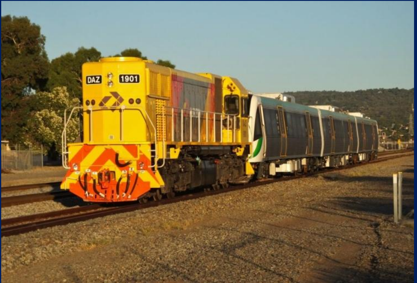
DAZ1901 propelling EMU set 105 thru Midland loop to old yard March 6th.