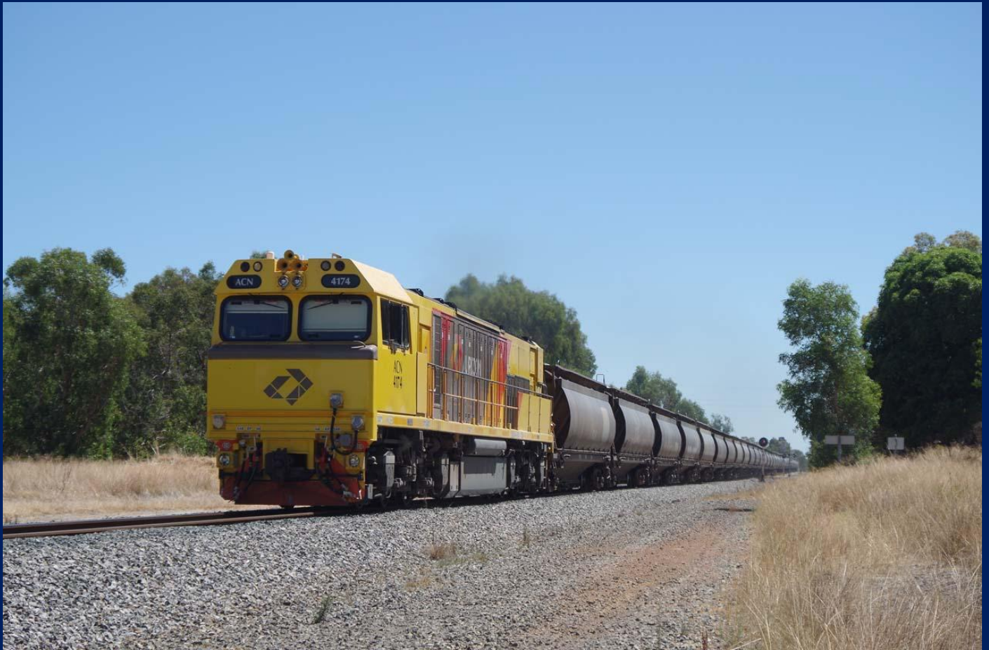
ACN4175 on 1873 Alcoa alumina to Inner Harbour Bunbury at Coolup March 8th.