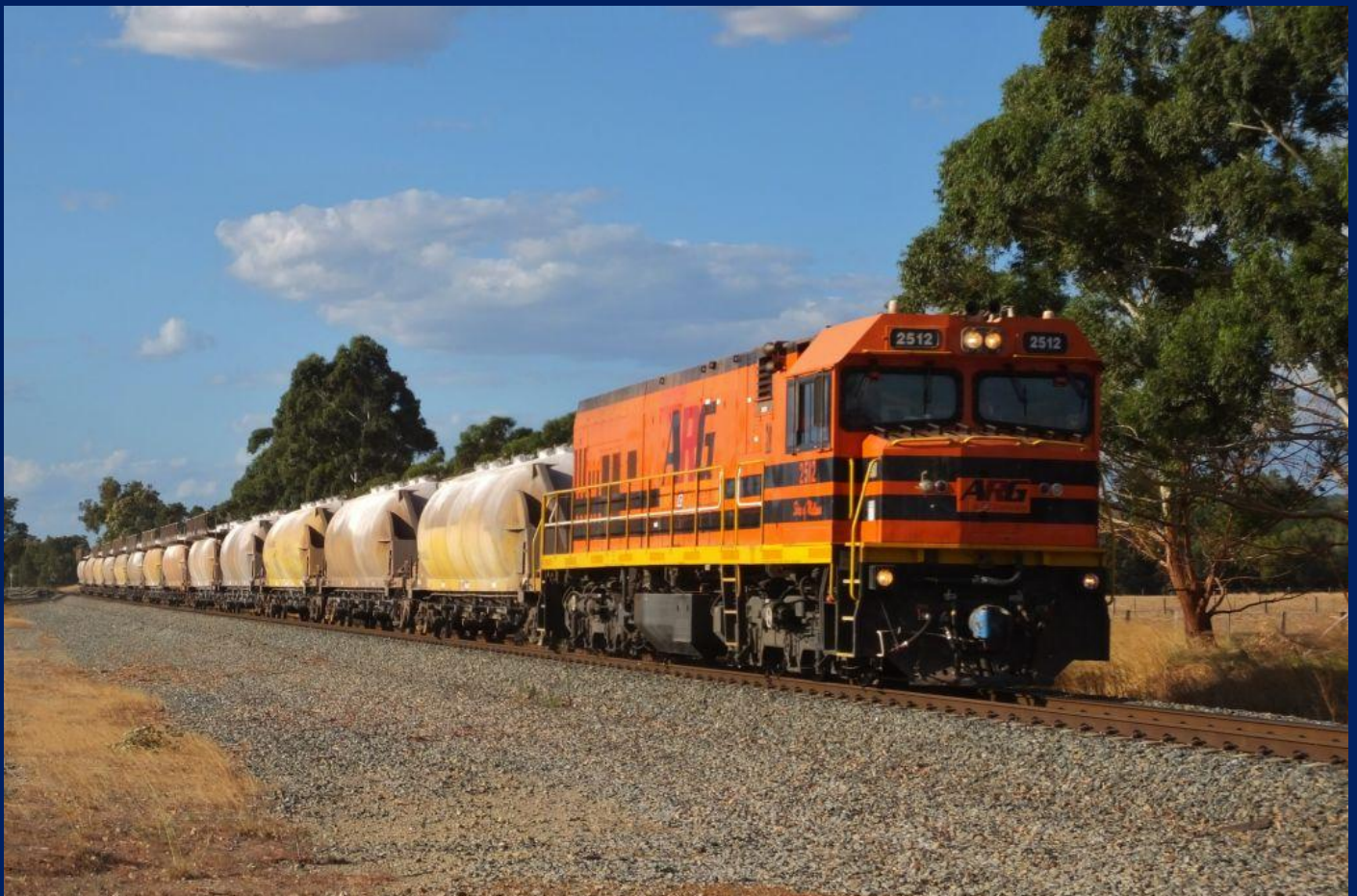
2512 on 3271 Kwinana to Hamilton lime train at Keysbrook on March 3rd.