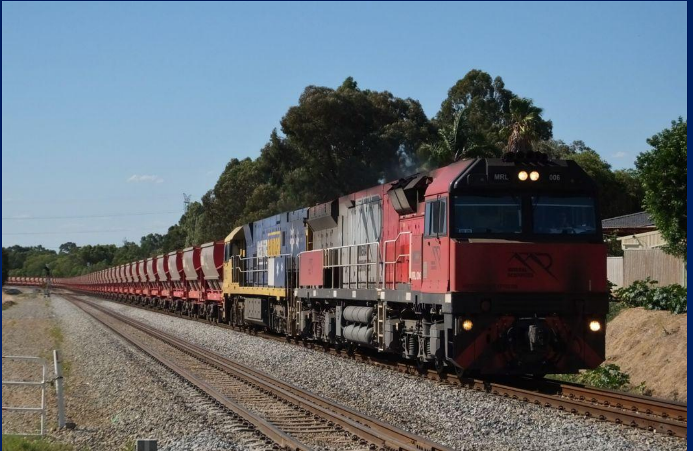
MRL006 & NR22 on 1030 Polaris ore Hazelmere March 8th.