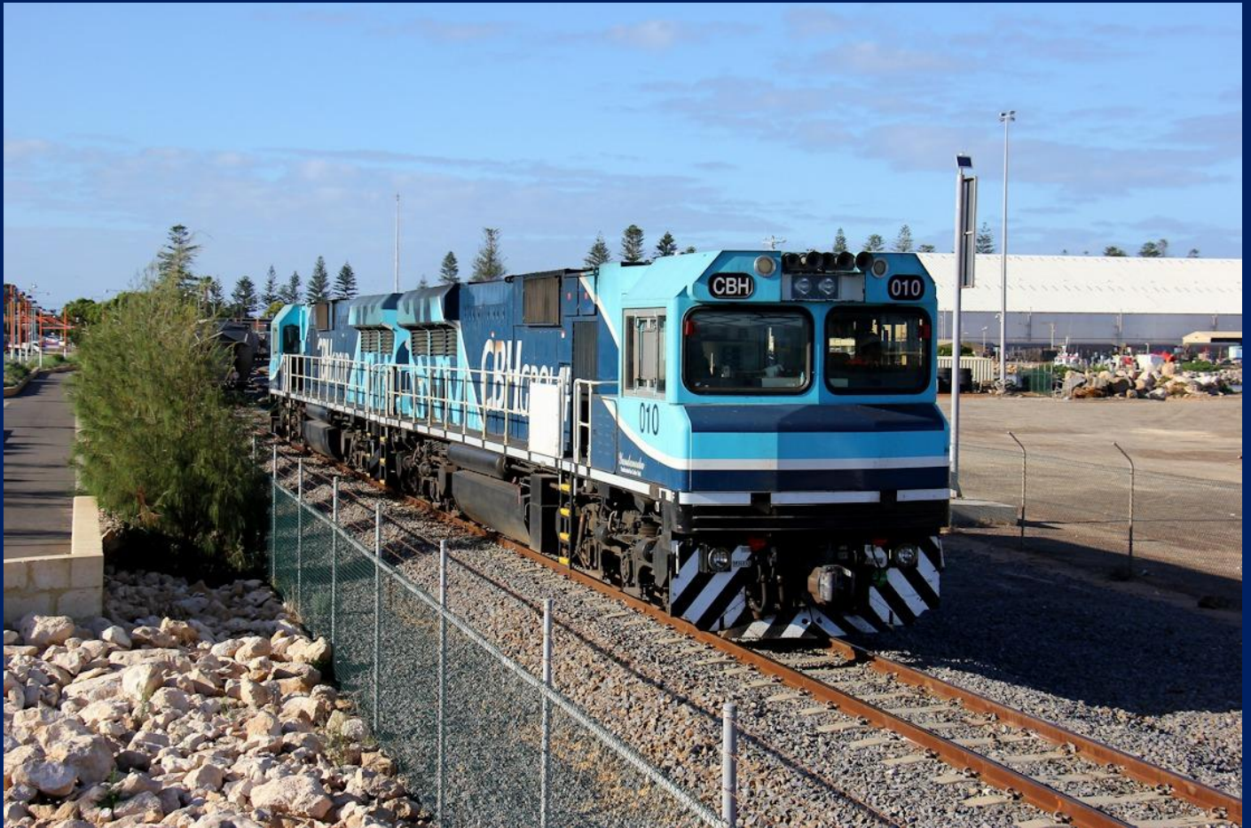
CBH010 & CBH002 run round their train at Geraldton Port March 19th.