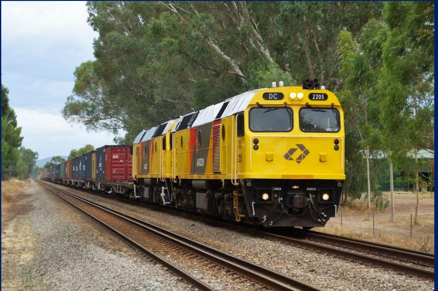
DC2205 & DC2213 on 7162 wagon movement Herne Hill March 14th.