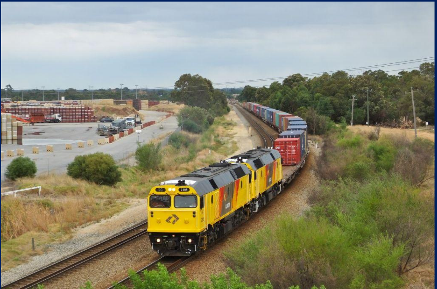
DC2205 & DC2213 on 7162 wagon movement at South Guildford March 14th.