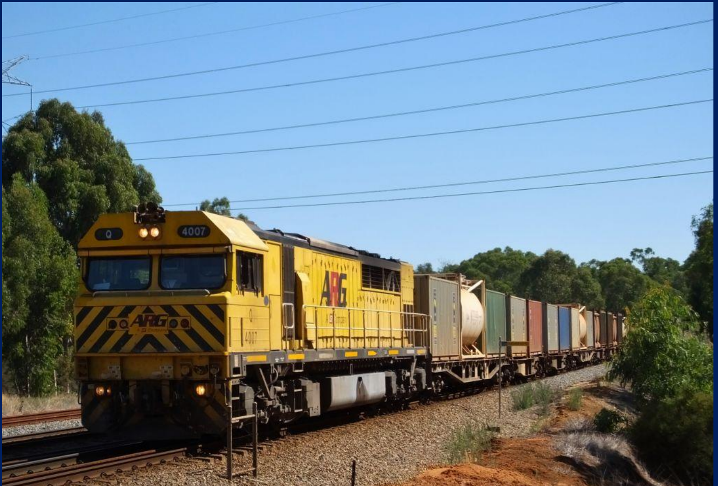
Q4007 on 7430 empty sulphur at Woodbridge March 28th.