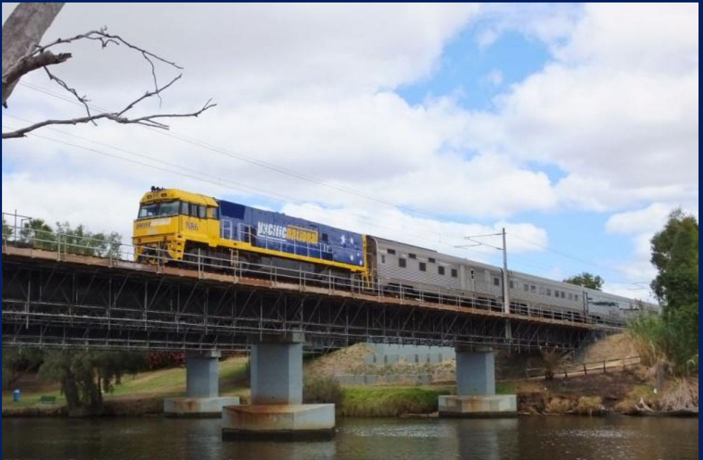
NR6 on 1PA8 Indian Pacific Perth Sydney passenger crossing Swan River Guildford 22/3.