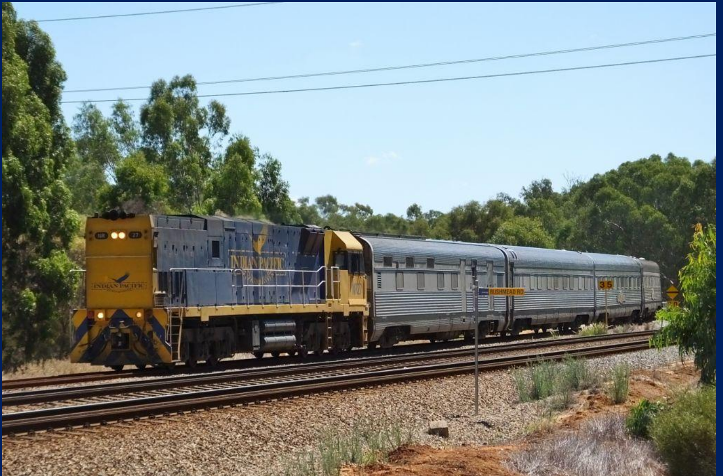
NR27 on 7003 empty Indian Pacific cars at Woodbridge March 28th.