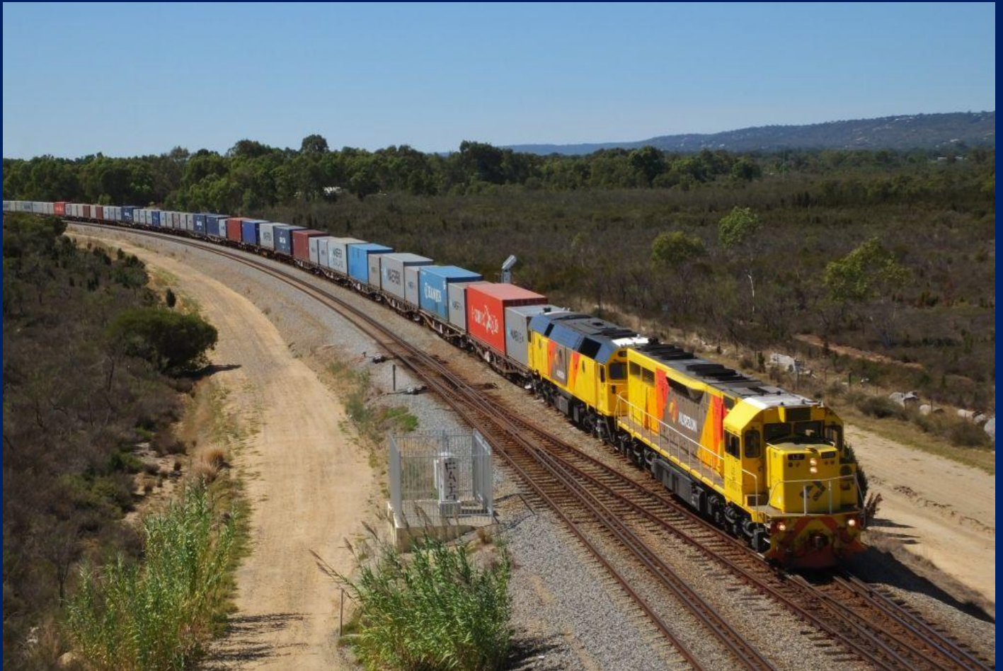
Now withdrawn LZ3103 & DC2213 on 3144 IMG container train Kenwick March 26th.