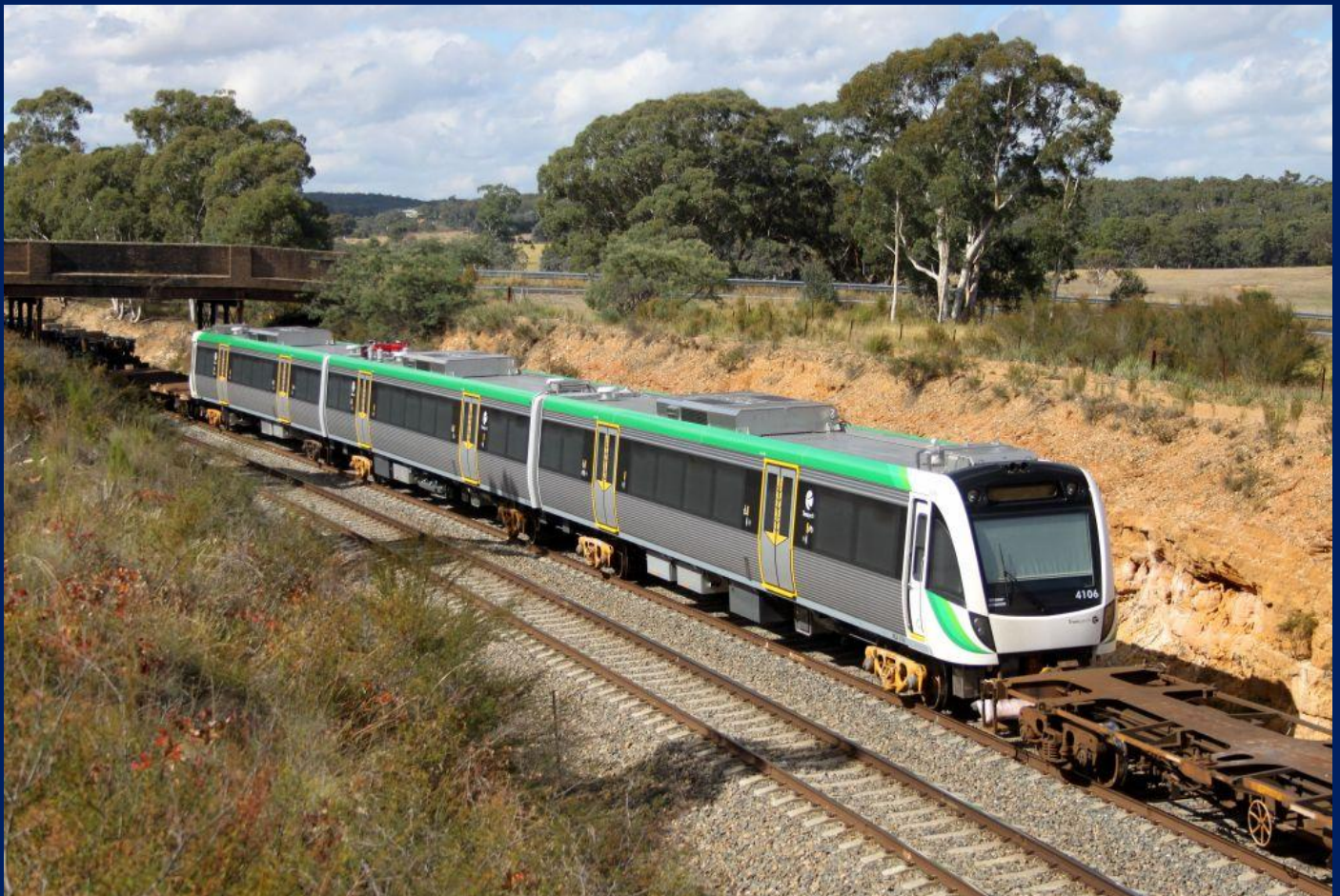
New Transperth EMU set 106 on rear 4NY3 steel at Towrang NSW March 25th.