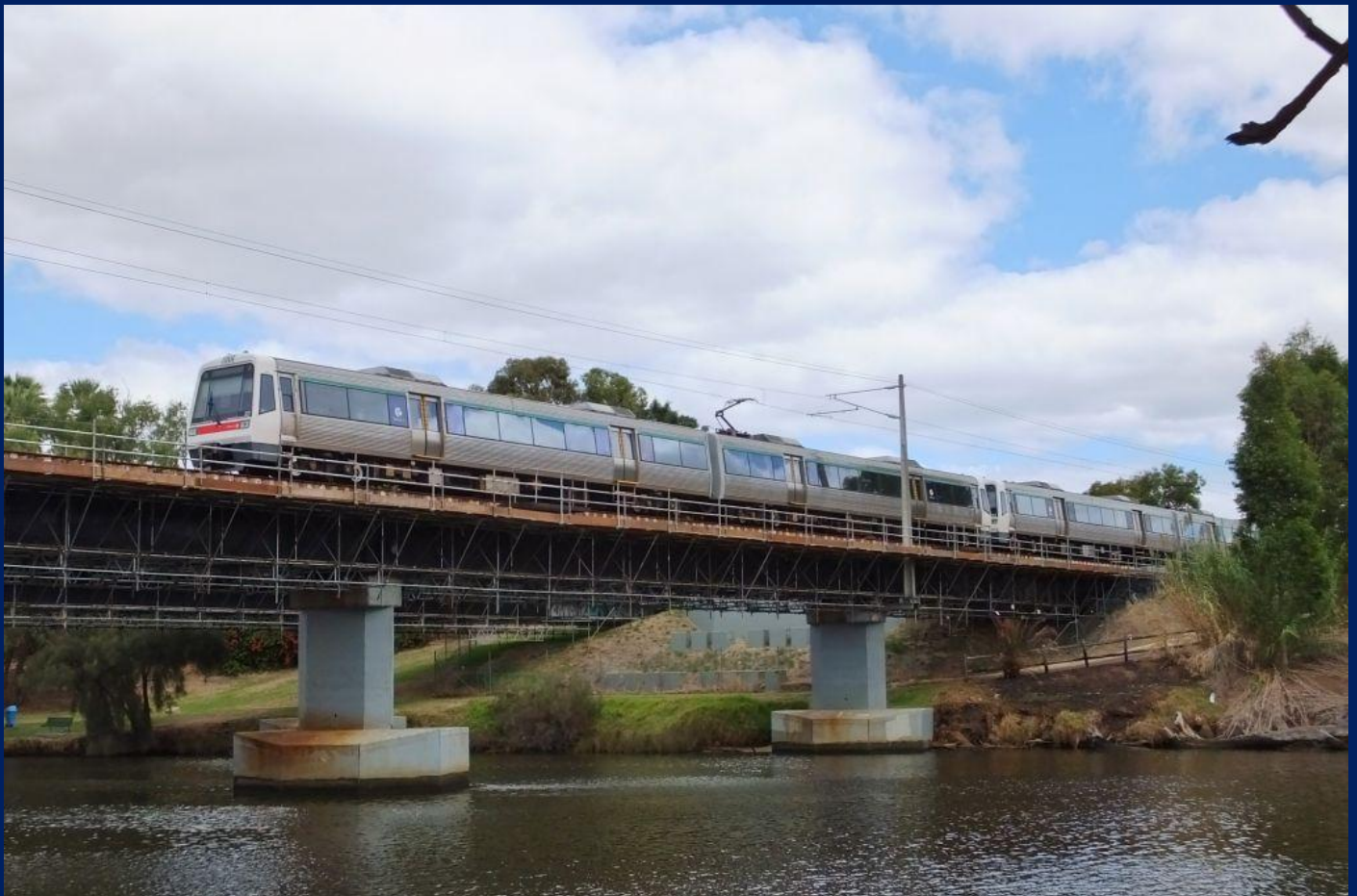
EMU A series sets 21 & 32 cross Swan River on Guildford Rail Bridge March 22nd.