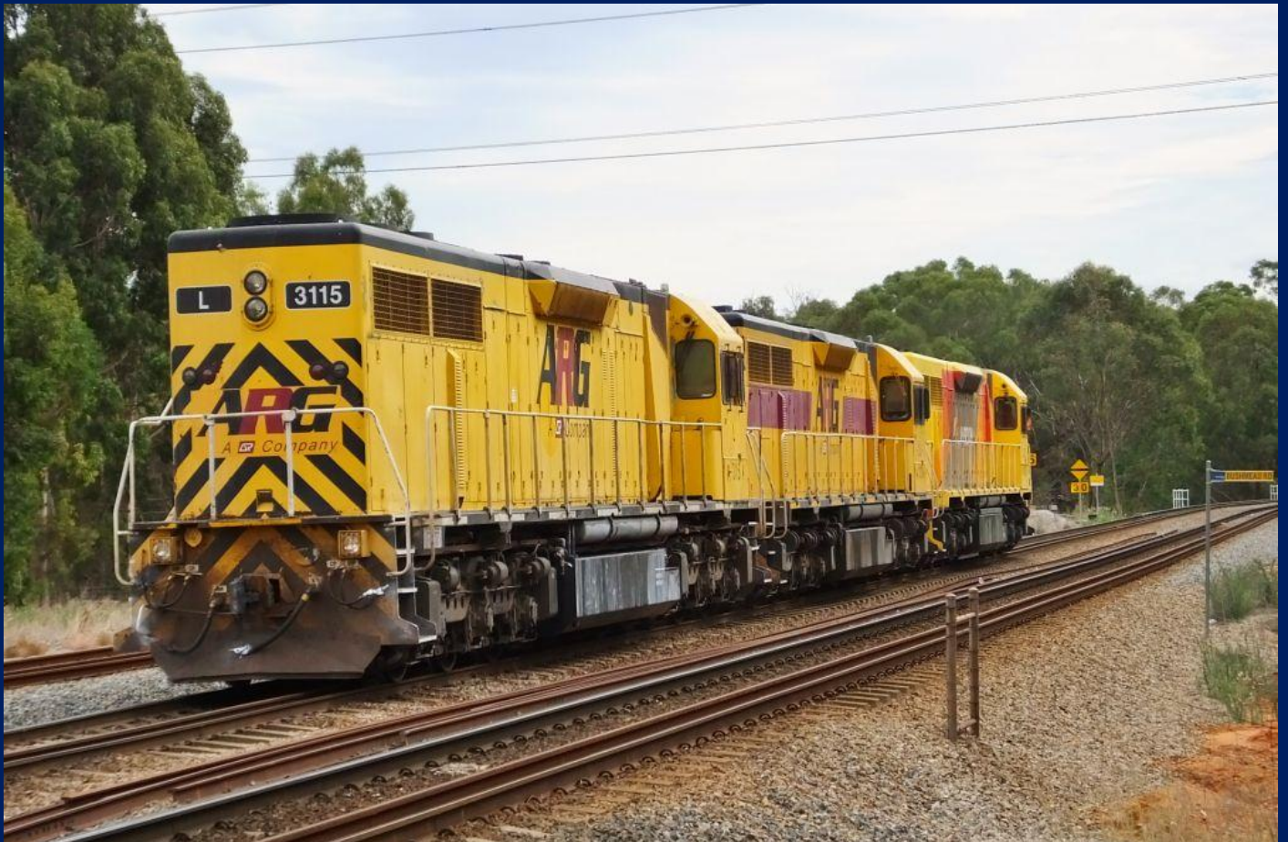
LZ3103 hauling LQ3121 & L3115 on 3071 light engines Woodbridge on March 31st.