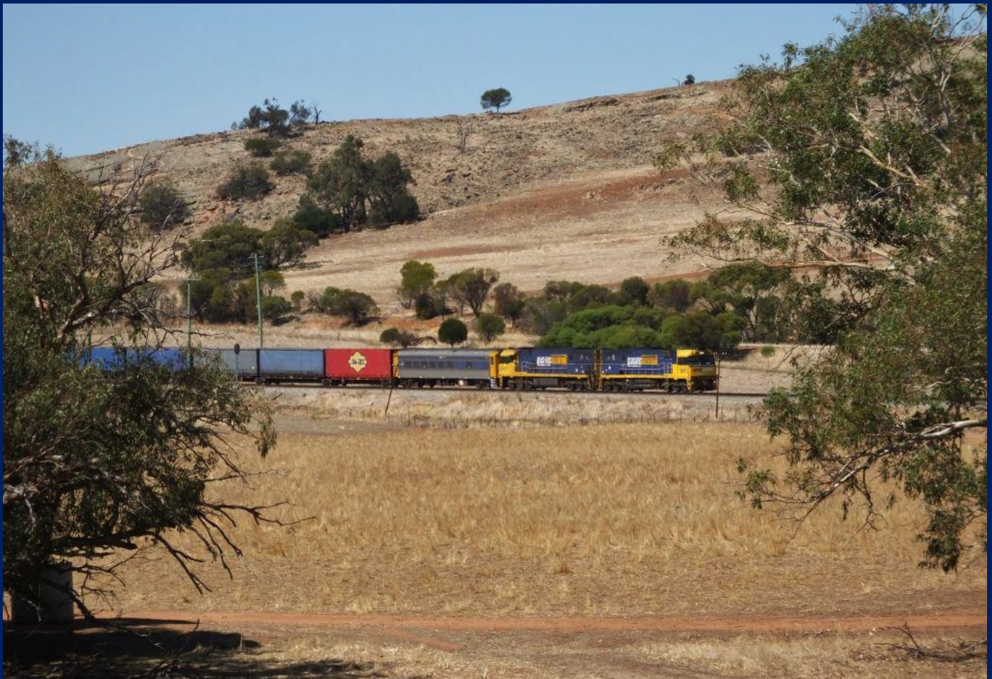
NR11 & NR107 on 6SP5 descending the grade out of Avon Yard Northam March 29th.