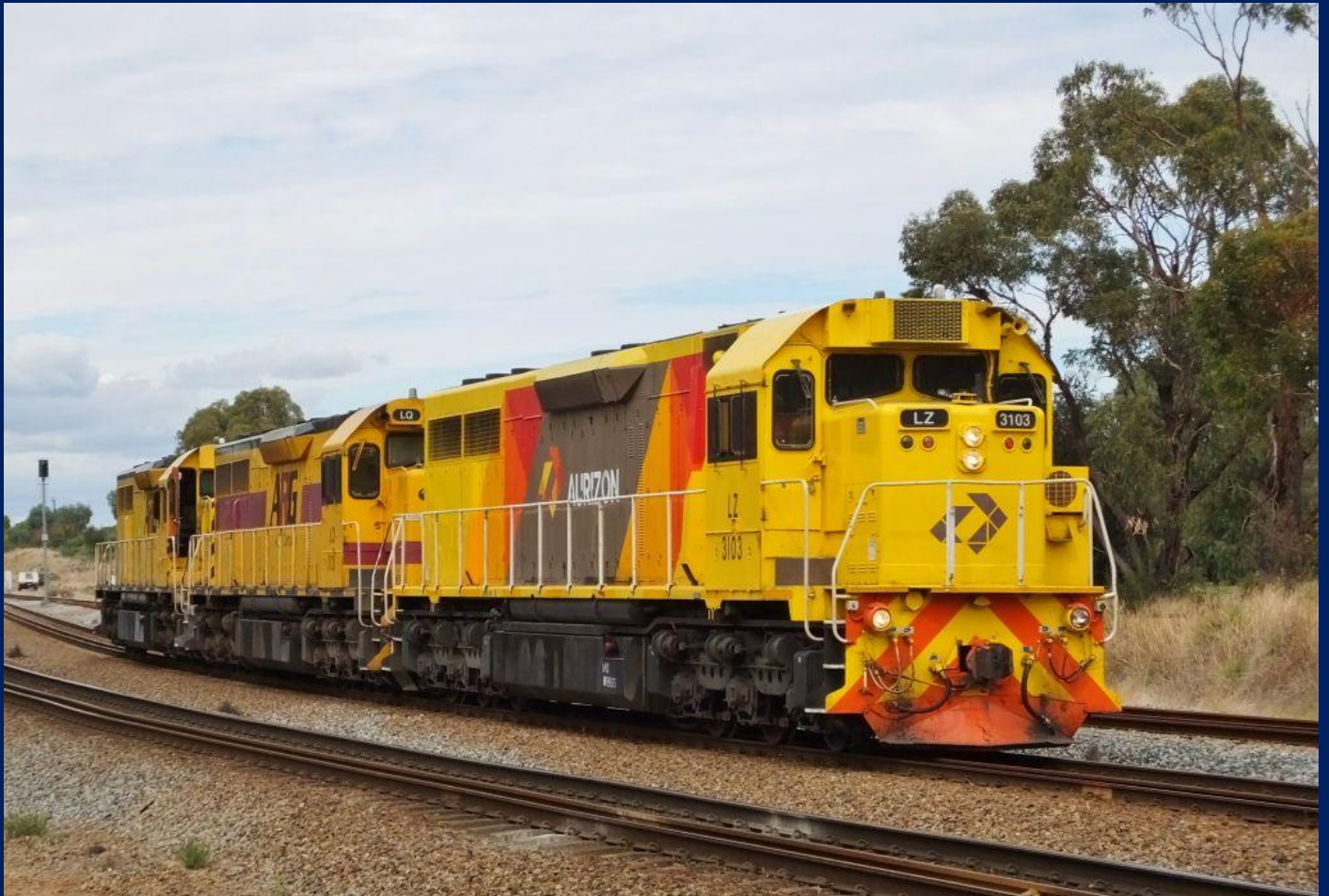
LZ3103 hauling LQ3121 & L3115 to storage at Avon Yard Northam on its last run at Woodbridge 31/3.