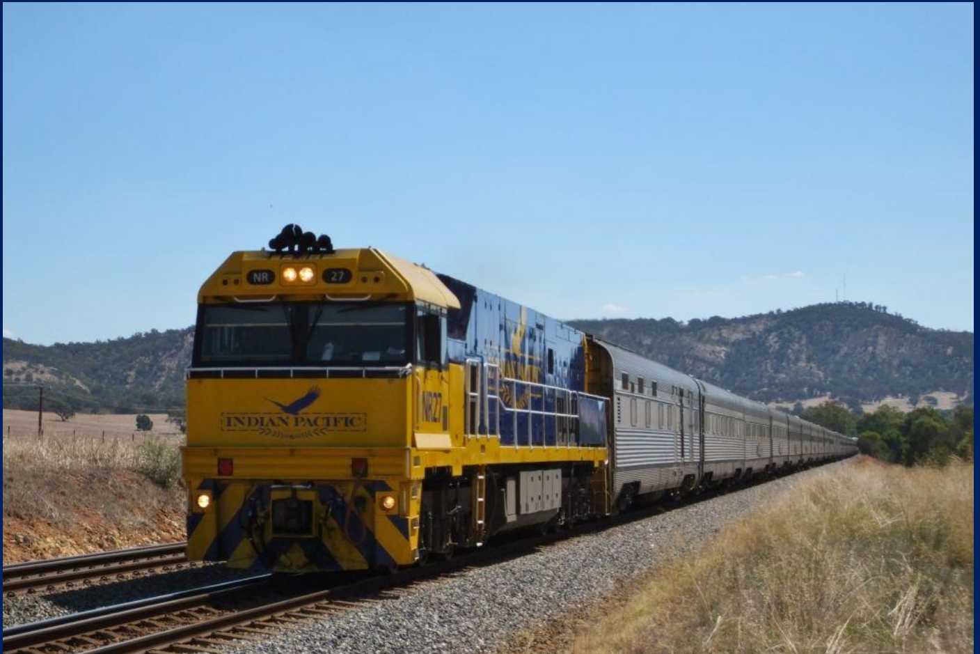
NR27 on 1PA8 Indian Pacific in Avon Valley at Katrine Mach 29th.