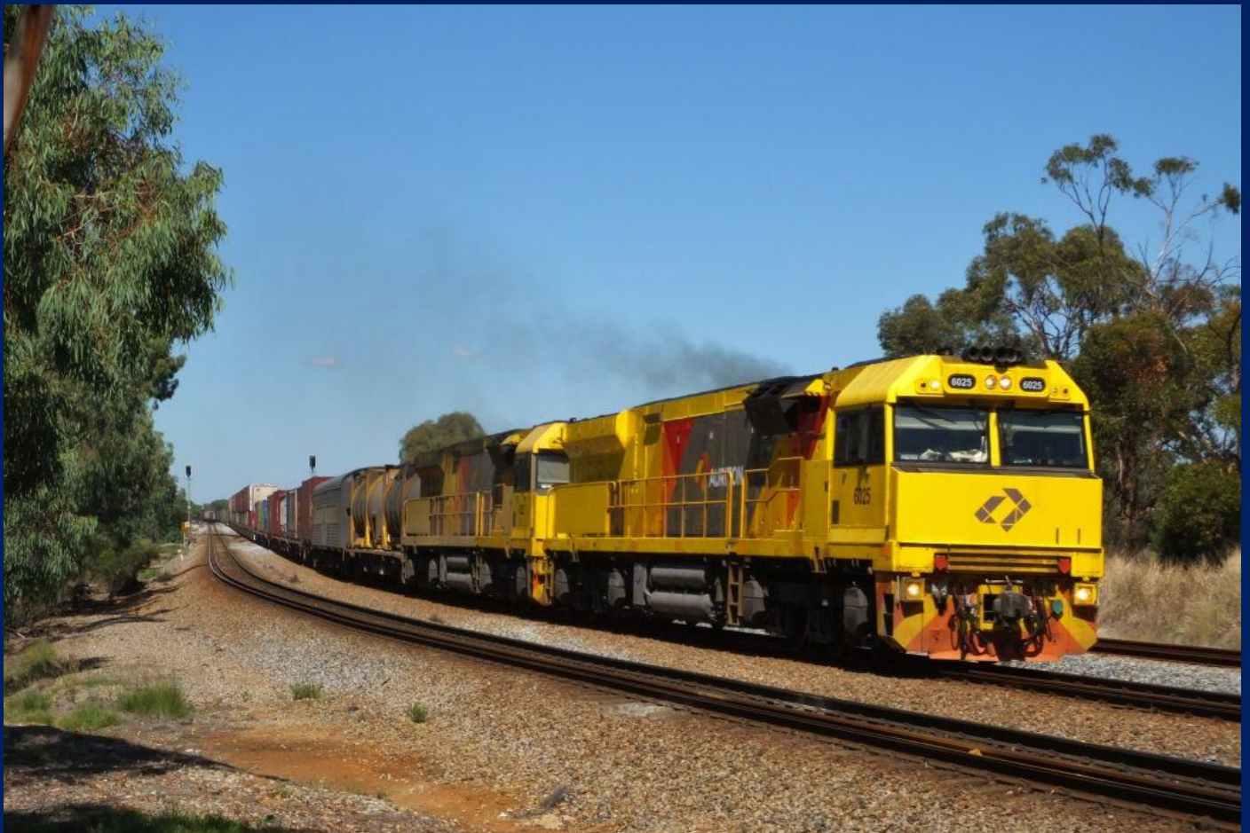
6025 & 6022 on 7PM1 Perth Melbourne Aurizon intermodal Woodbridge March 28th.