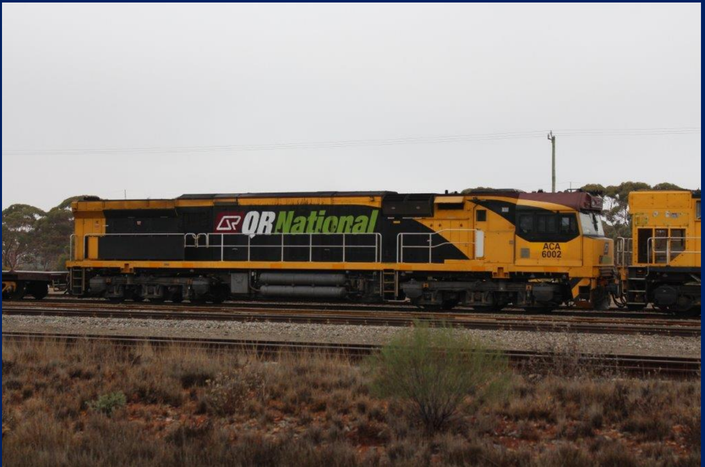
Converted back to ACA6002 from 6002 to again be captive in WA at WEK 28/3.