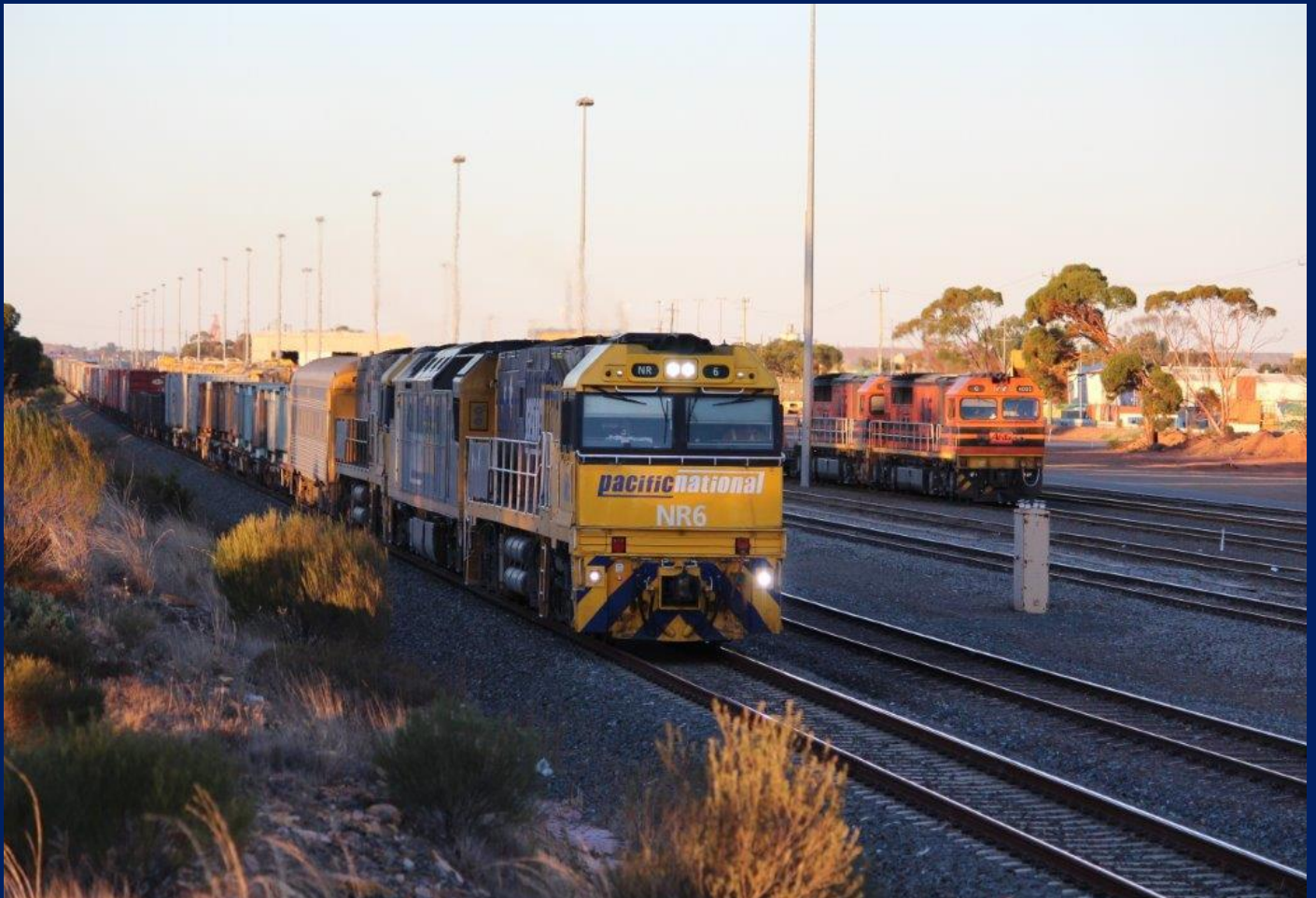
NR6, AN5 & NR71 on 2SP7 freight passing Q4003 & Q4005 on 4426 WEK 25/3.