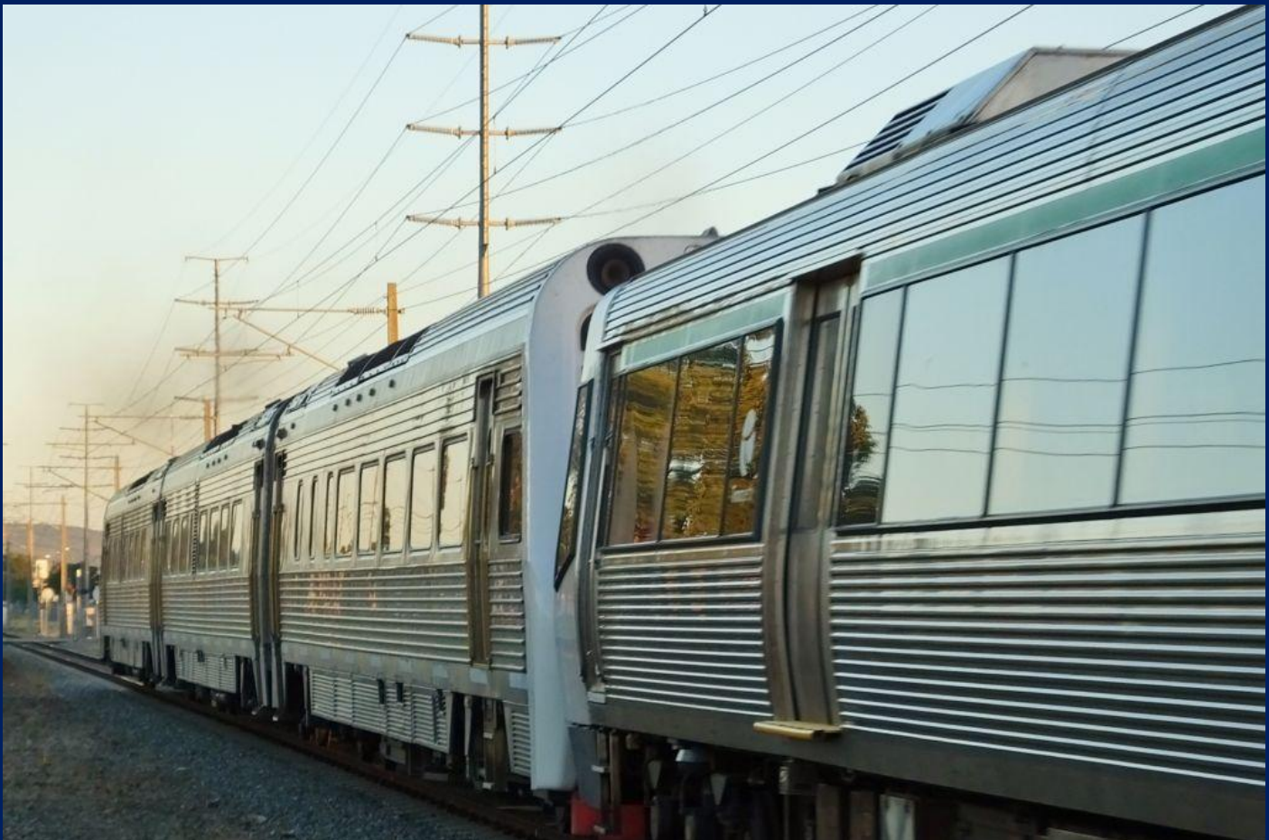
Australind railcar propels 4xcar EMU set thru Queens Park following failure March 23rd.