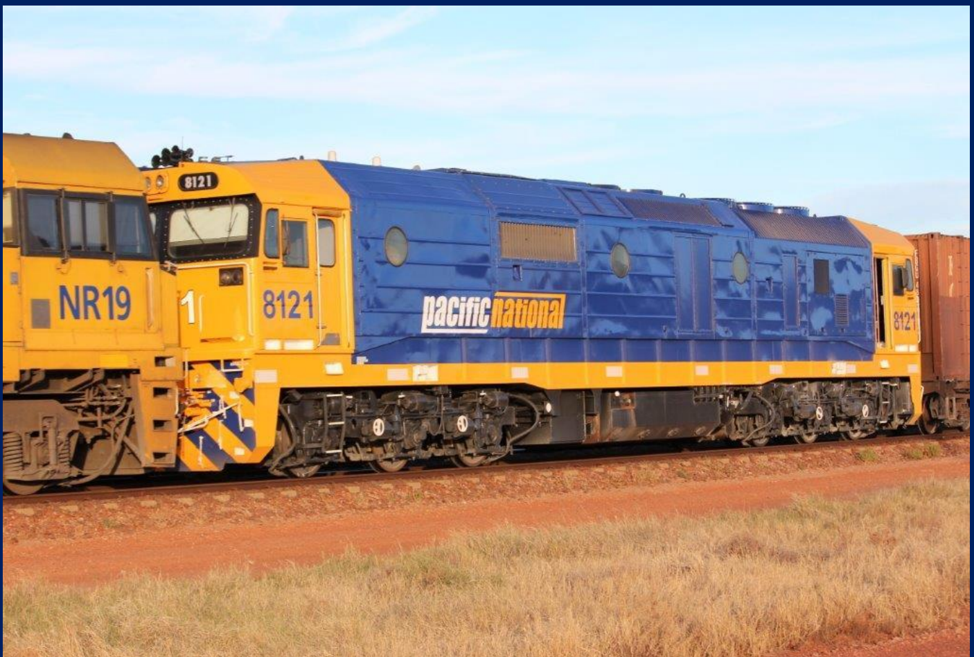
Overhauled and repainted P/N Kewdale shunter at Parkeston on return to WA 26/3.