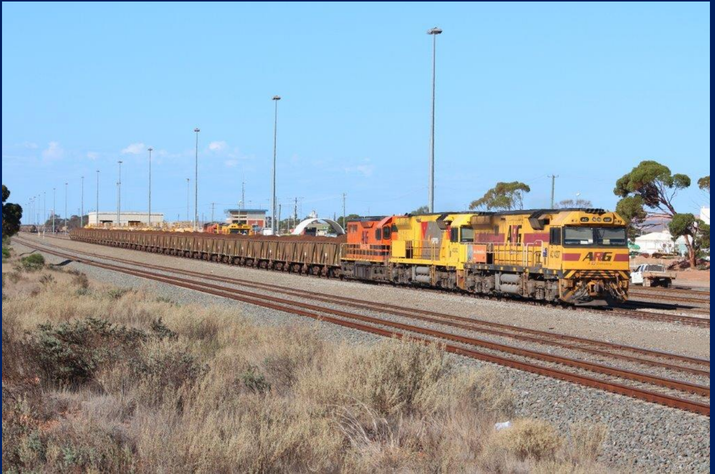
AC4307, ACC6032 & L3110 on 6443 small ore with empty fuel tankers [to be attached] at WEK 20/3.