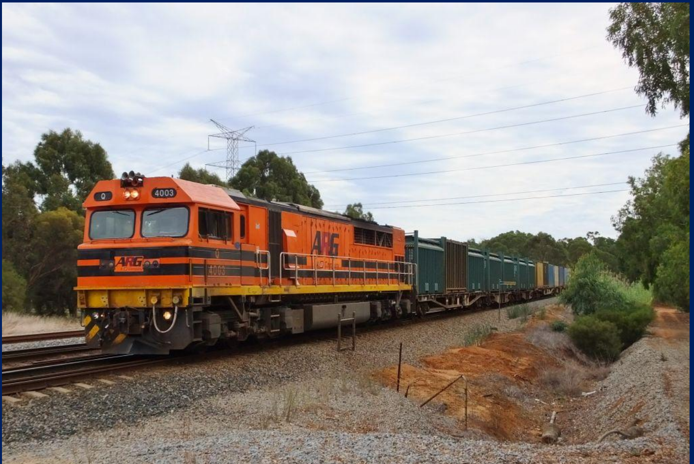
Q4003 on 2430 empty sulphur Leonora to Kwinana at Woodbridge March 31st.