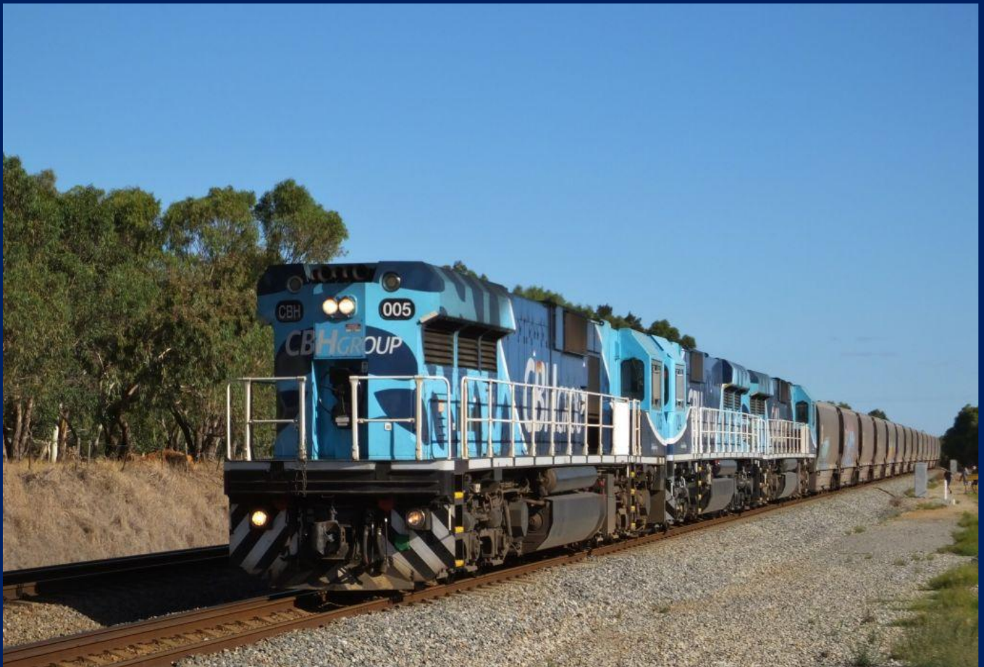
CBH005, CBH024 & CBH011 on 1K05 empty Watco grain at Hazelmere March 22nd.