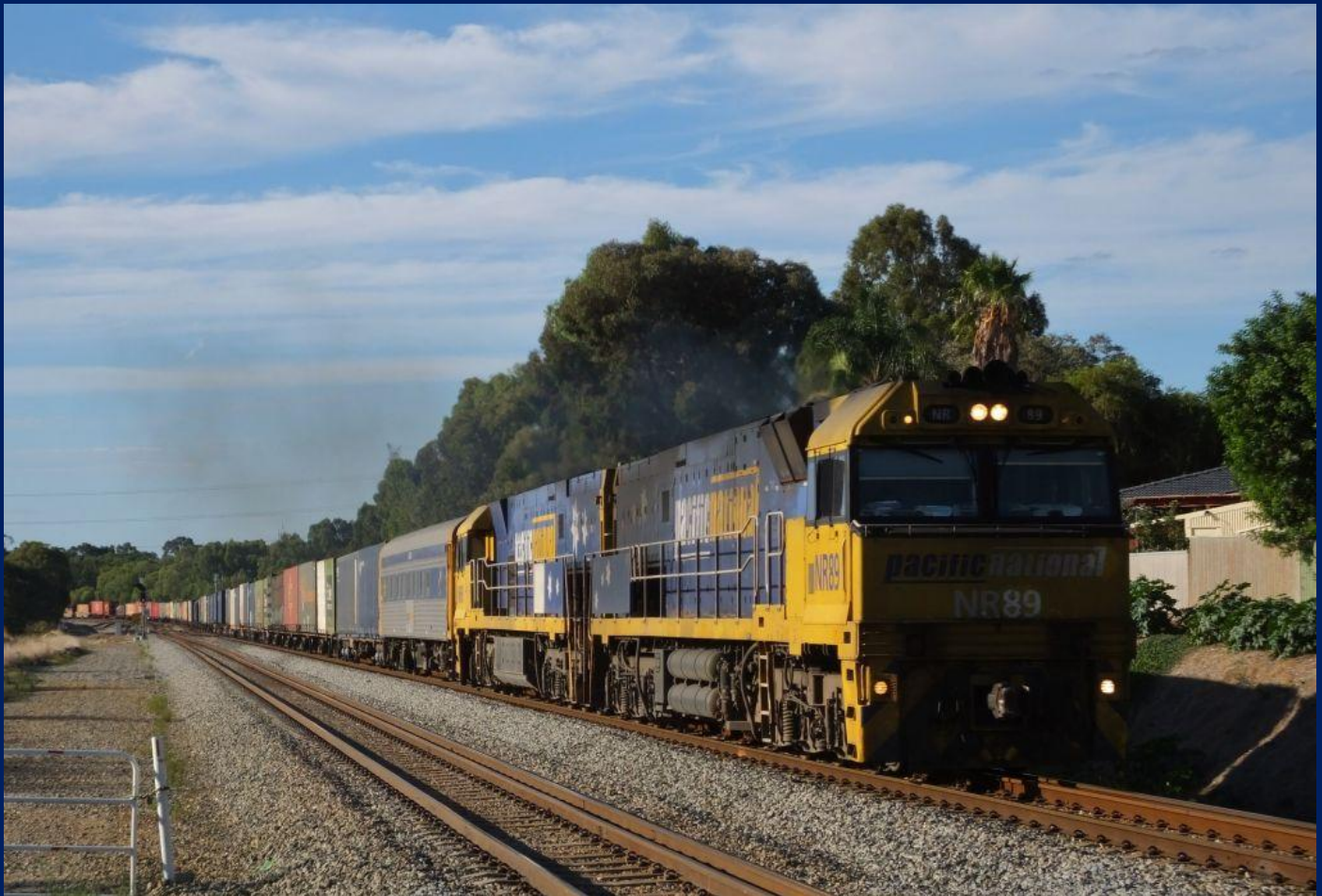
NR89 & NR61 on 6SP5 Sydney Perth intermodal at Hazelmere Mach 22nd.