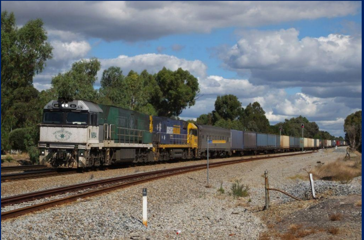
NR84 & NR69 on 3PS6 Perth Sydney intermodal at Woodbridge March 31st.