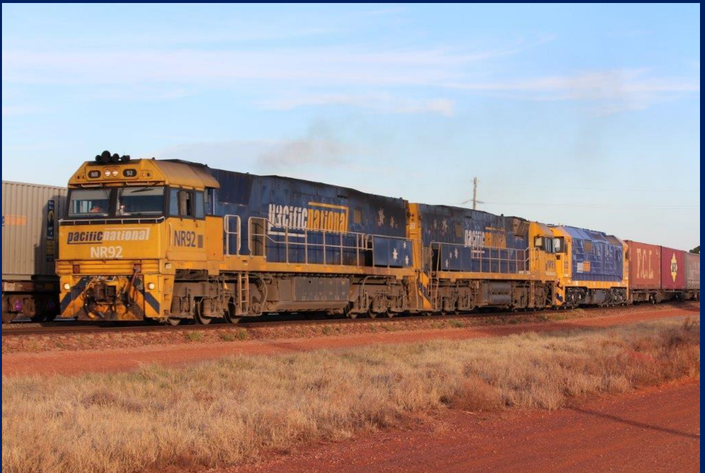
NR92, NR19 [dead] 8121 on 2SP7 at Parkeston March 26th.