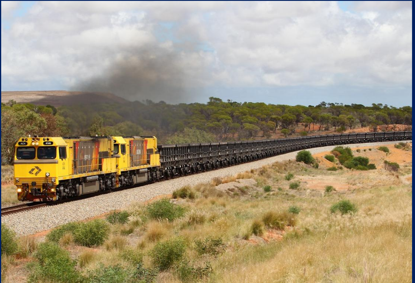
ACN4146 & ACN4144 on empty Karara ore at Grants on Narngulu Mullewa line 15/3.