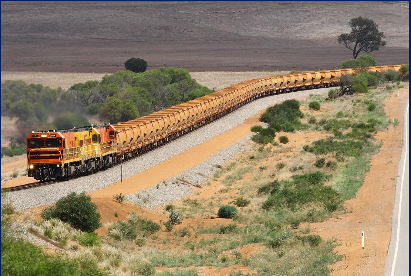
P2506, P2508 & P2507 on late 7720 empty Perenjori ore Moonyoonooka March 15th.