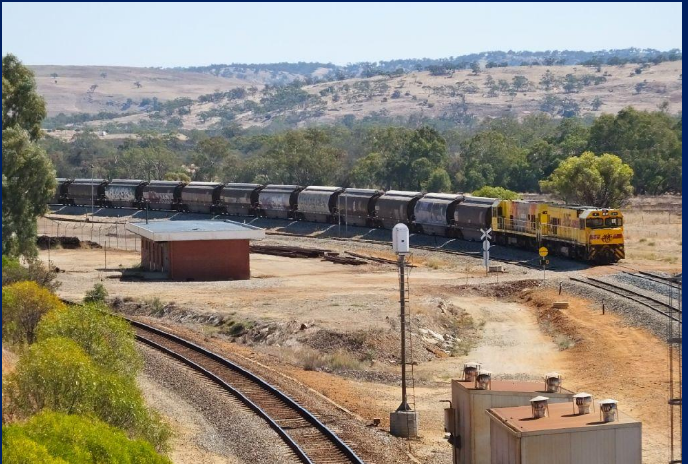
P2511 P2517 on Watco leased empty XU fleet stabled in Avon Yard March 29th.