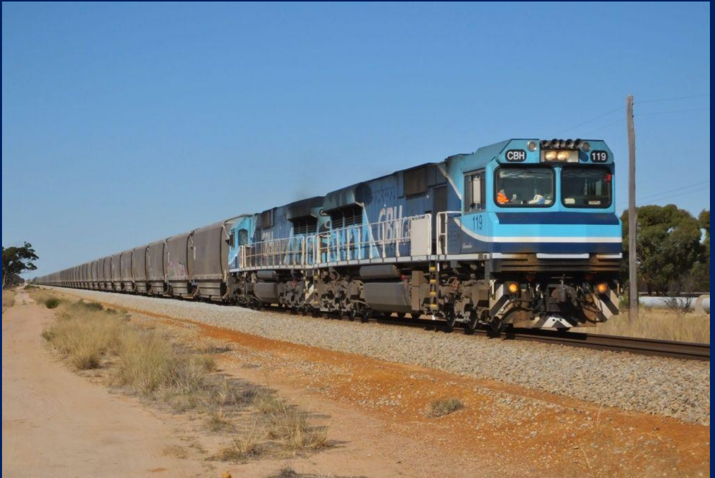
CBH119 & CBH121 on 1S58 Watco grain at Cunderdin March 29th.