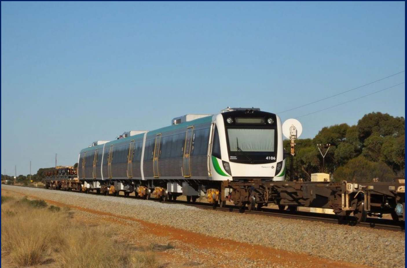
New Transperth EMU set 106 on rear 5MP2 steel at Cunderdin March 29th.