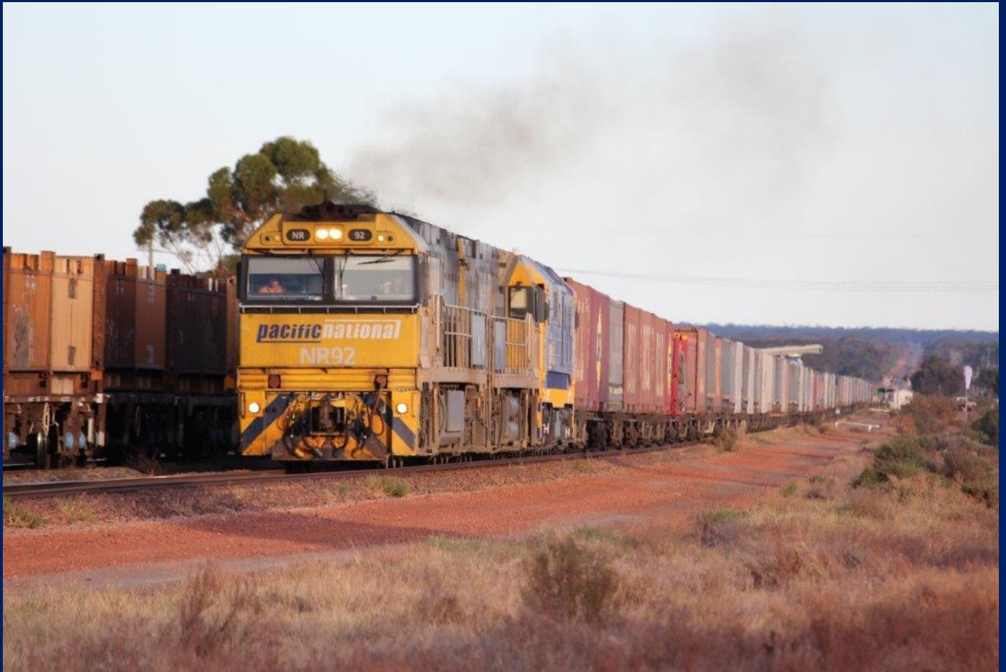
NR92, NR19 [dead Kewdale shunter] 8121 on 2SP7 crossing steel train as climbs grade into Parkeston 26/3