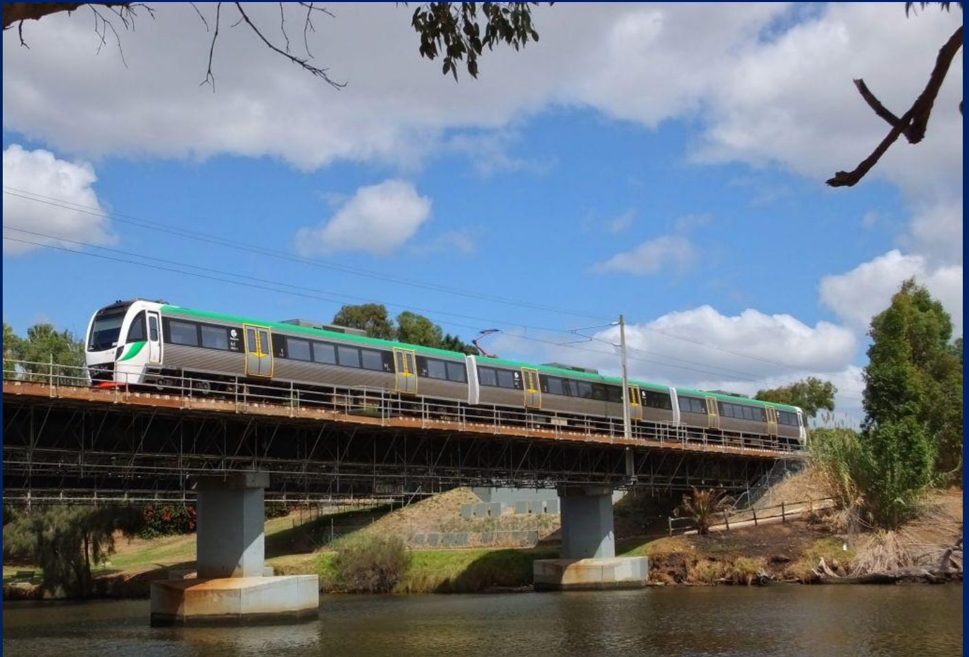
EMU B series set 093 crossing Swan River at Guildford on rare run on Midland line 22/3.

Annual Bike Hike, where the Mitchell and Kwinana Freeways are closed to enable a charity bicycle ride to take place occurred on March 22nd. To enable people to get back to their starting points or take part in the run number of A series EMU sets are used on Joondalup and Mandurah lines as their configuration is more conducive to taking bicycles. To cover this, a number of B series EMUs are used on Fremantle and Midland lines. Three more L class locomotives were stowed L3115 and LQ3121 were withdrawn for stowing on March 12th. LZ3103 hauled L3115 and LQ3121 from Forrestfield to Avon Yard Northam for stowing with LZ3103 being withdrawn on arrival. L3110 is last L class [unmodified] left in service, only LZ3106, LZ3107, LZ3109, LZ3111, LZ3112, LZ3114 and LZ3117 are the LZs still in service. A new westbound Indian Pacific timetable was introduced from April 1st that sees the long stopover in Kalgoorlie replaced by a longer stopover at Rawlinna on the Nullabor Plain with a dinner under the stars. New Transperth EMU set 106 was hauled from Queensland to WA in late March, arriving at Kewdale on evening of March 27th.