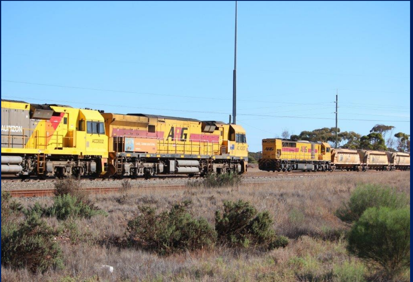
ACC6032, AC4307 on 6443 crossing Q4015 on 6439 empty WN nickel at WEK 20/3.