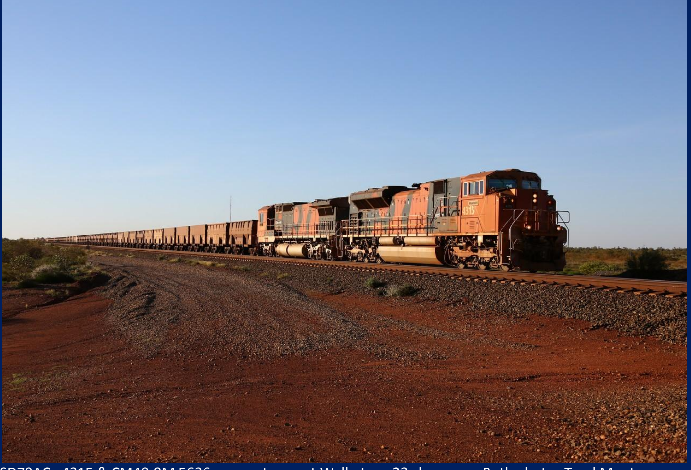
SD70ACe 4315 & CM40-8M 5636 on empty ore at Walla June 23rd.