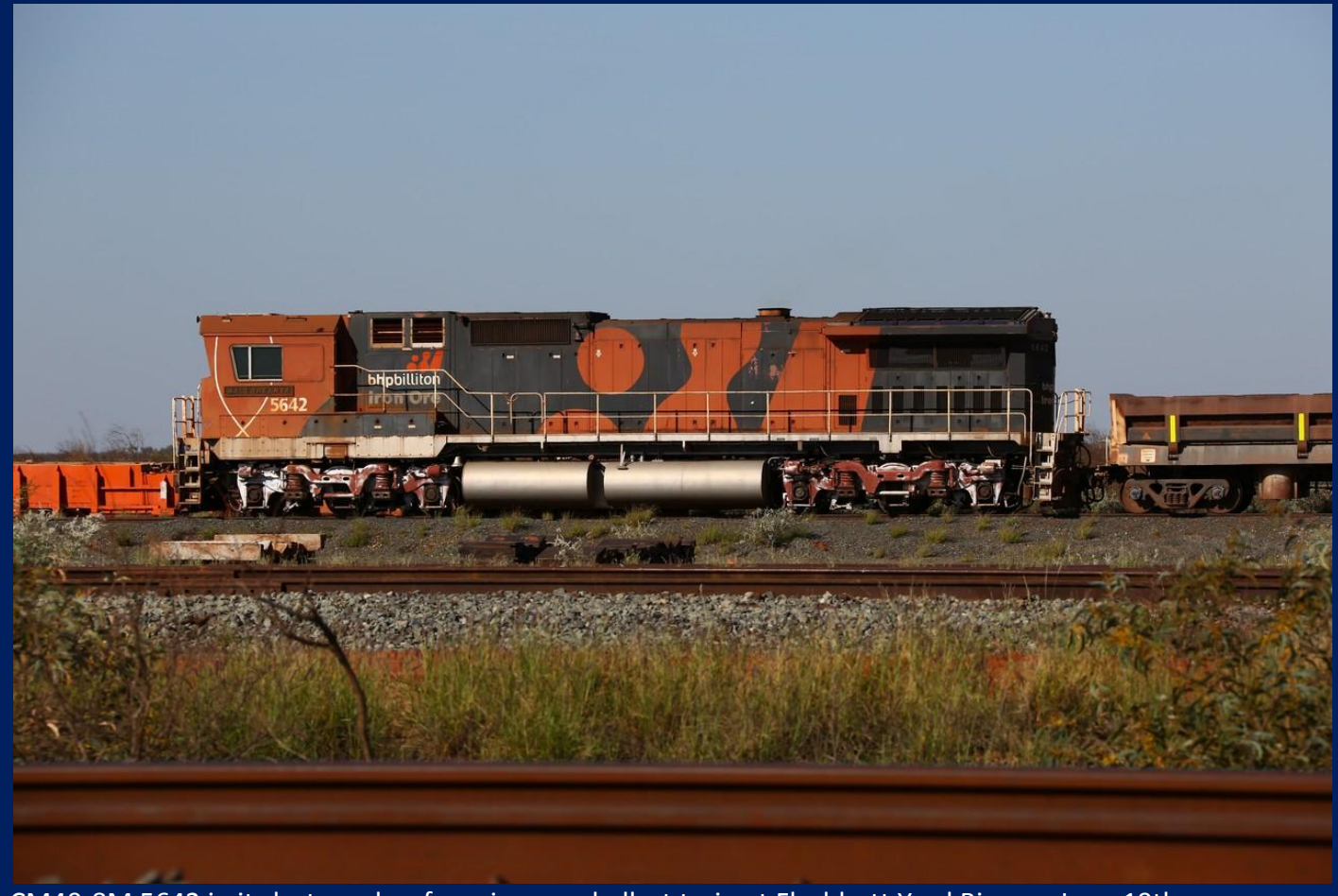
CM40-8M 5642 in its last weeks of service on a ballast train at Flashbutt Yard Bing on June 19th.