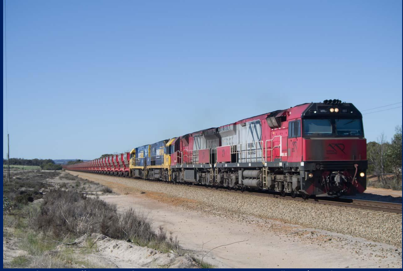
MRL003 & MRL006 off line NR114 & NR119 on 5030 Polaris ore at Grass Valley 25/6.