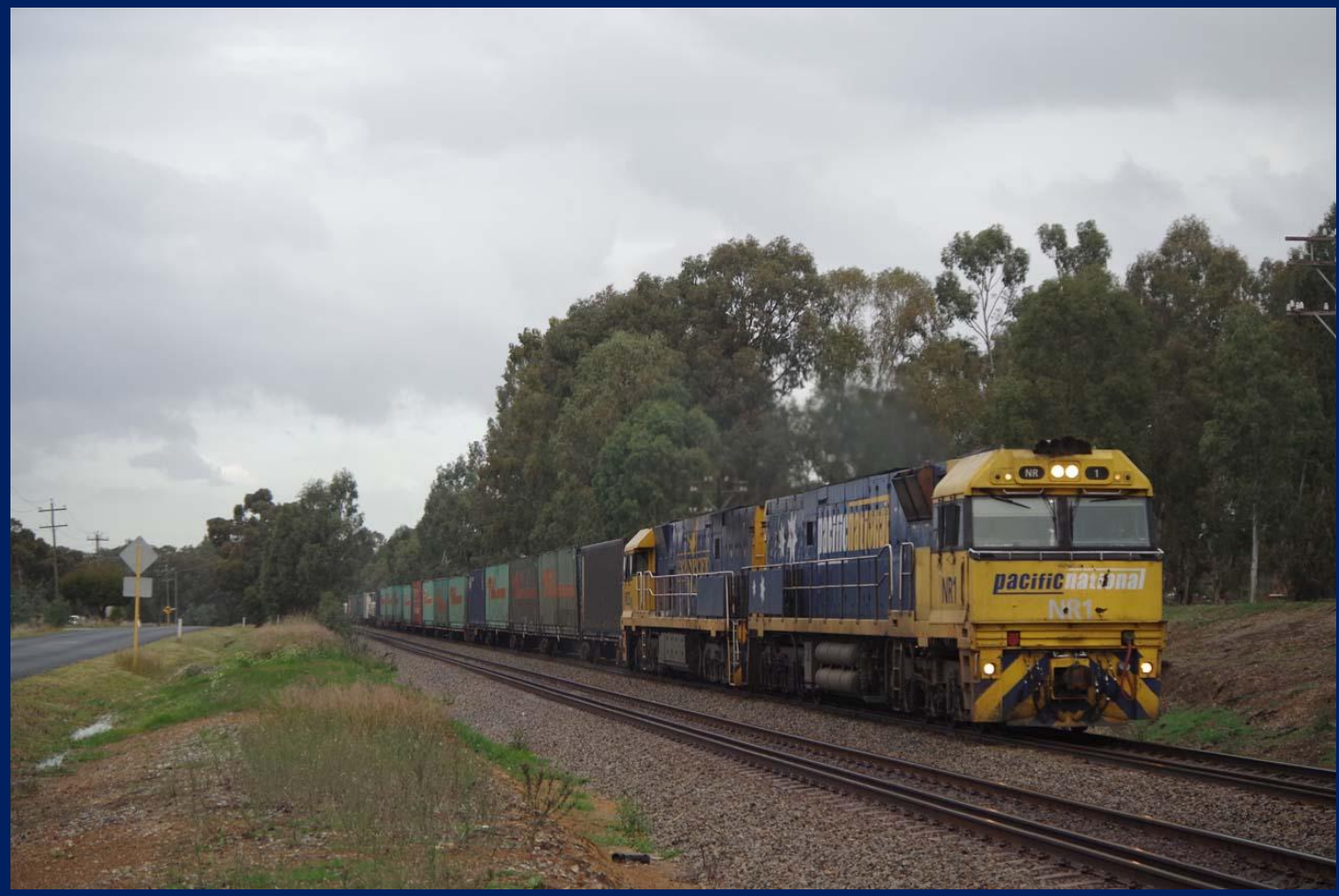
NR1 & NR25 on 1PM5 intermodal at Herne Hill June 21st.