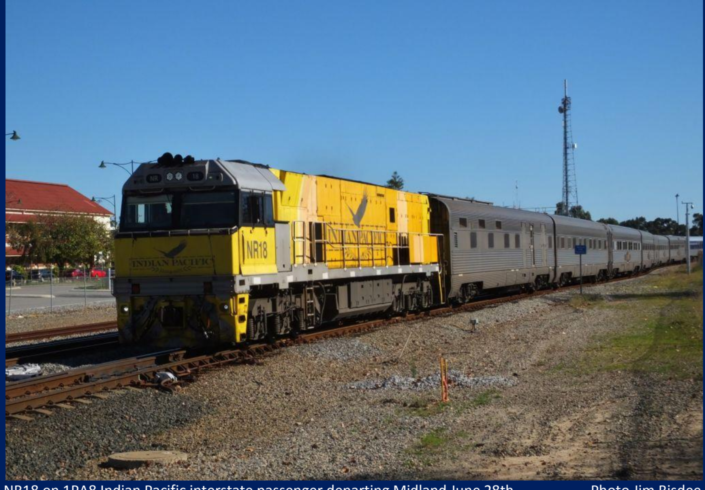
NR18 on 1PA8 Indian Pacific interstate passenger departing Midland June 28th.