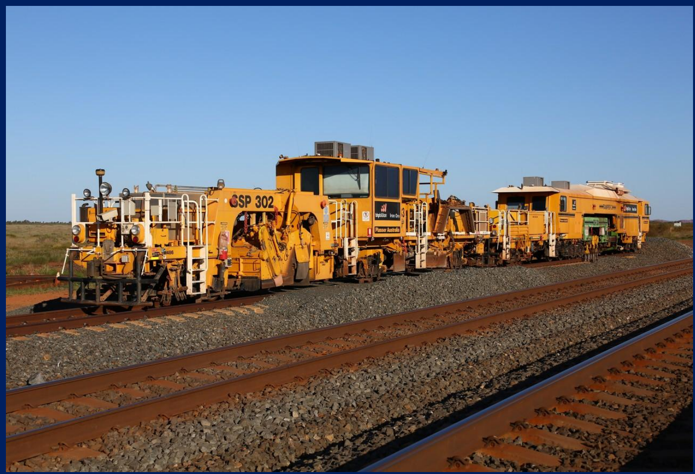
BHPBIO Plasser ballast regulator and Plasser tamper #3 at Walla siding June 19th.