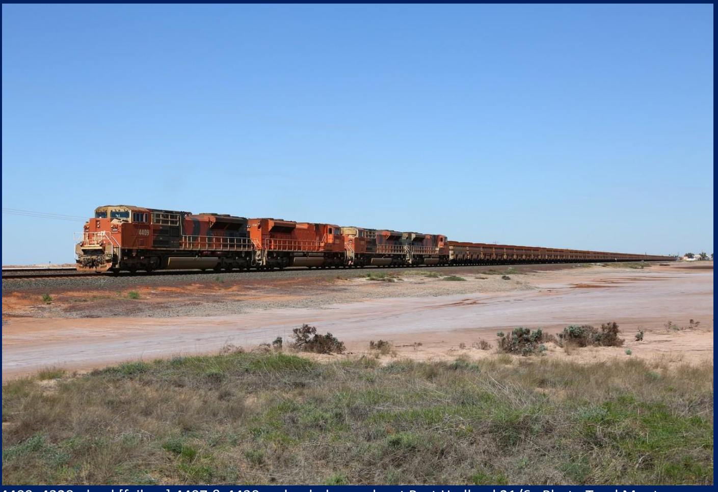
4409, 4328, dead [failure] 4407 & 4430 on loaded ore rake at Port Hedland 21/6.