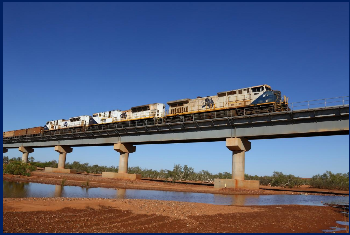
CW44-9 012, SD9043s 915 & 906 on loaded FMG ore crossing the East Turner River on June 20th.