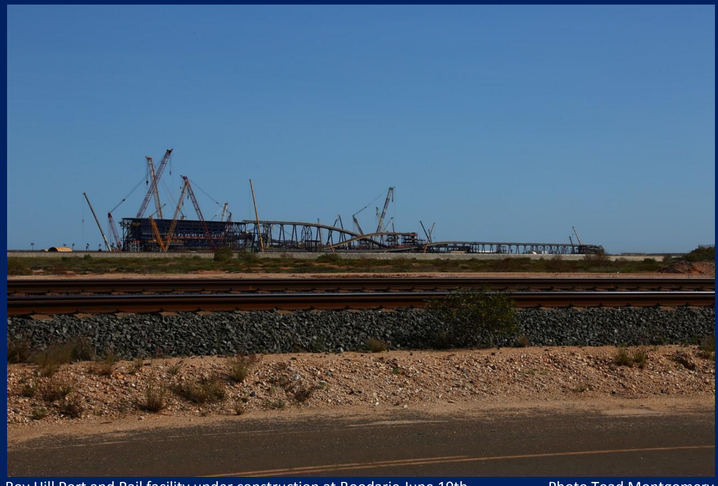
Roy Hill Port and Rail facility under construction at Boodarie June 19th.