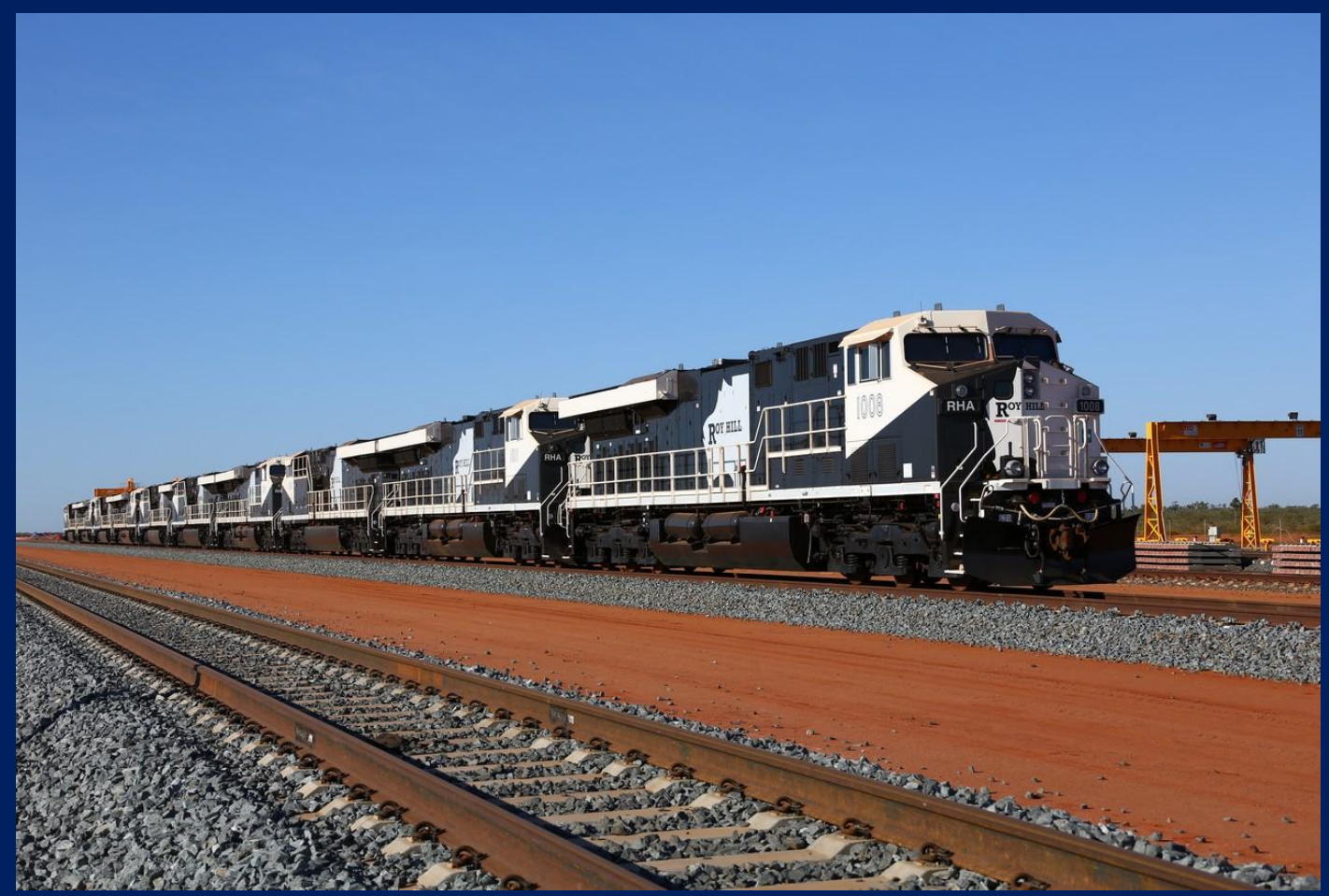
Ten new Roy Hill ES44ACis 1005 thru 1014 stored in their Flashbutt Yard Port Hedland June 20th.