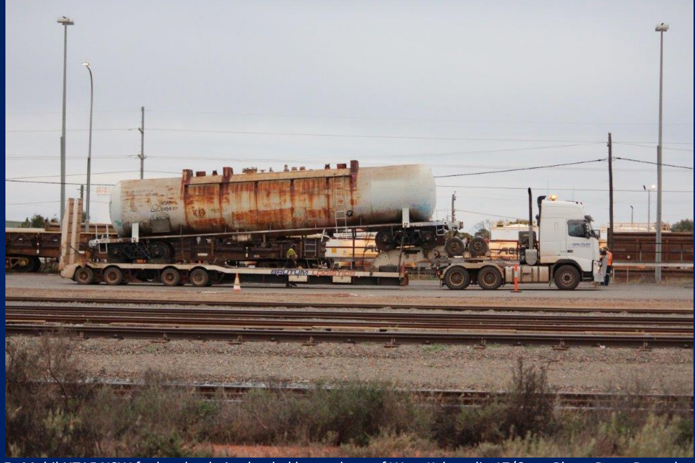
Ex Mobil NTAF NSW fuel tanker being hauled by road out of West Kalgoorlie 17/6.