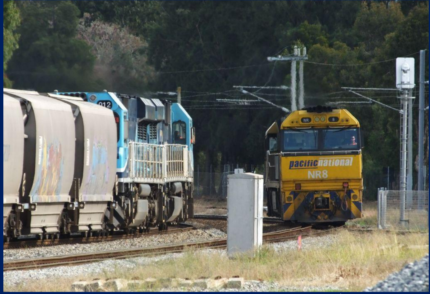
NR8 & NR31 on 6P31 light engines crosses CBH008 & CBH012 6K66 grain Midland 19/6.