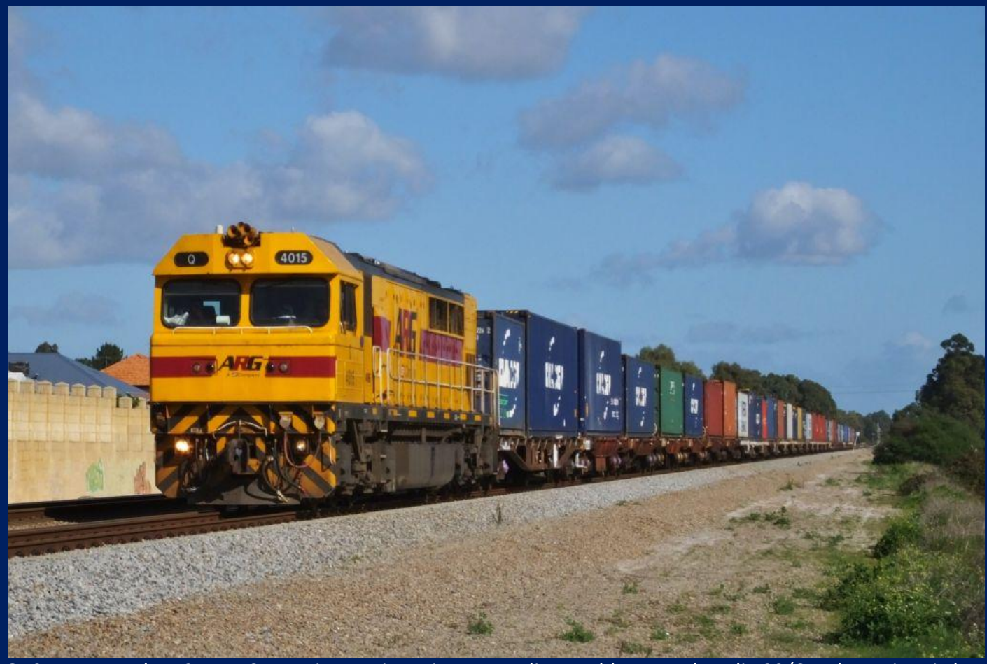
Q4015 on very late 2141 ILS container train owing to PTA line problems at Thornlie 22/6.