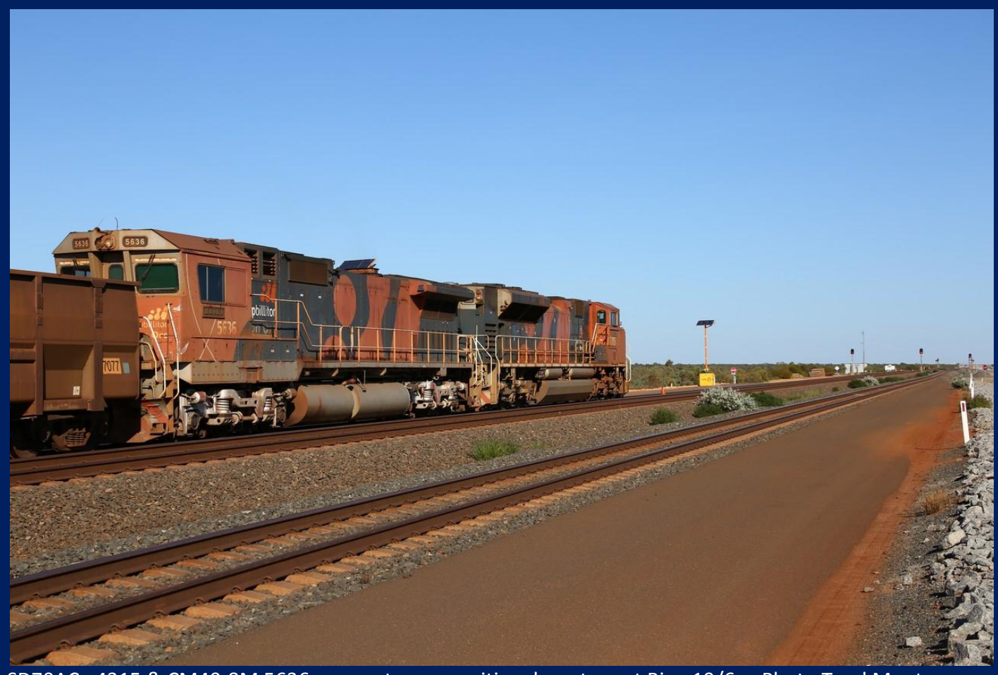
SD70ACe 4315 & CM40-8M 5636 on empty ore awaiting departure at Bing 19/6.