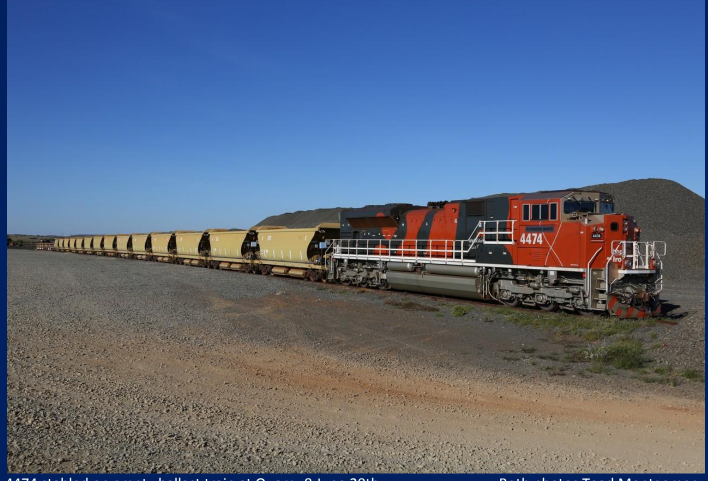
4474 stabled on empty ballast train at Quarry 8 June 20th.