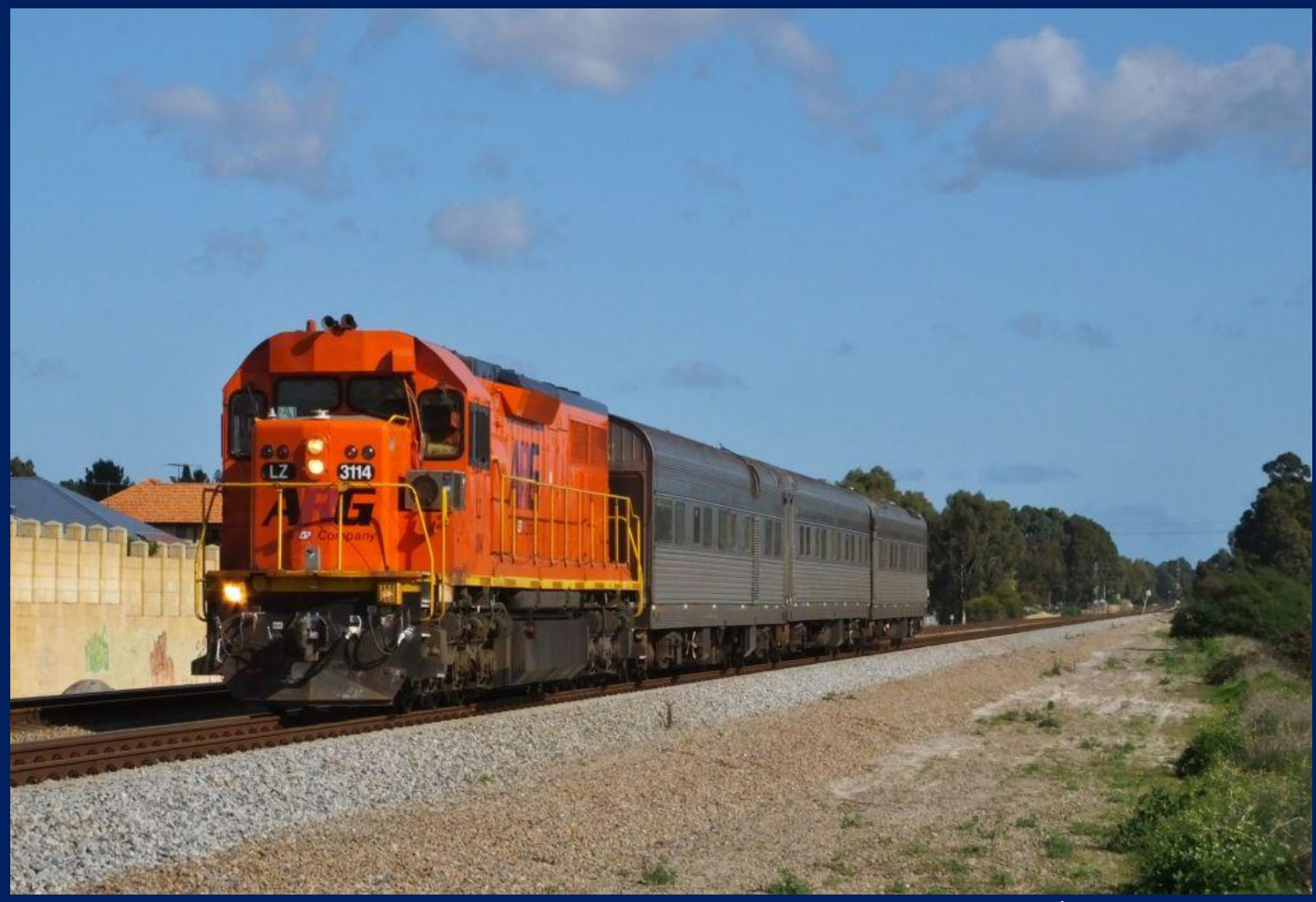
LZ3114 on 2CR6 AK car track inspection train on Cockburn Forrestfield line Thornlie 22/6.