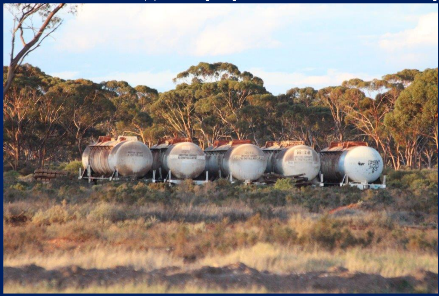
Five NTAF tankers stored on the ground at Parkeston June 20th.