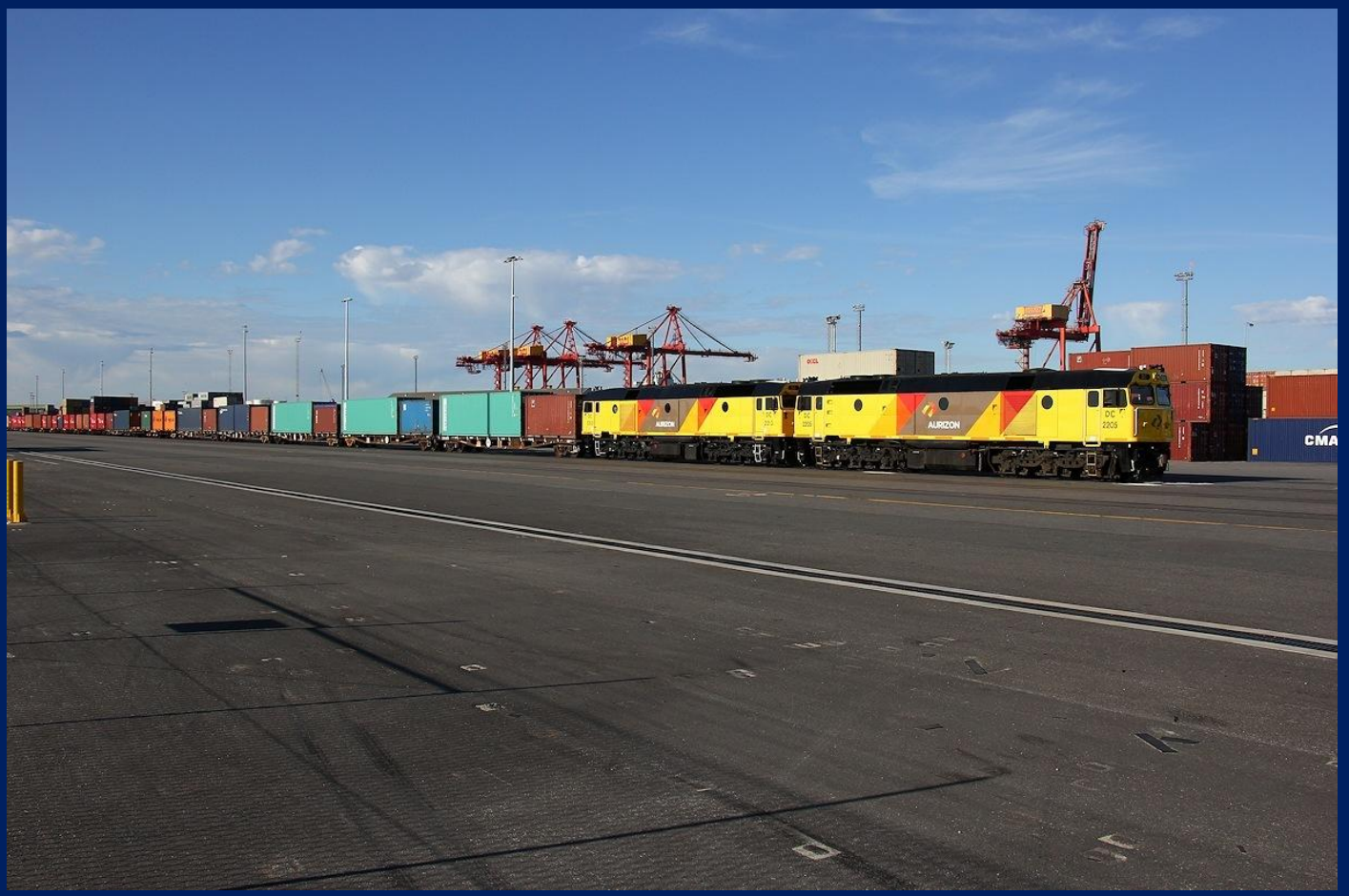
DC2205 & DC2213 on 3144 ILS container train at North Port Fremantle June 9th.