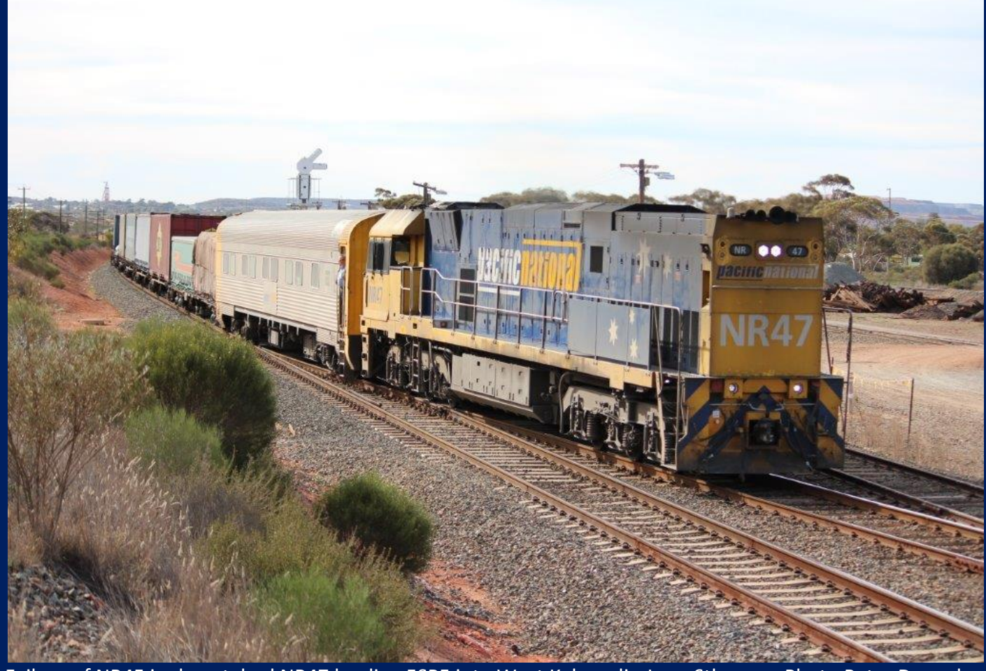
Failure of NR45 in desert, had NR47 hauling 5SP5 into West Kalgoorlie June 6th.