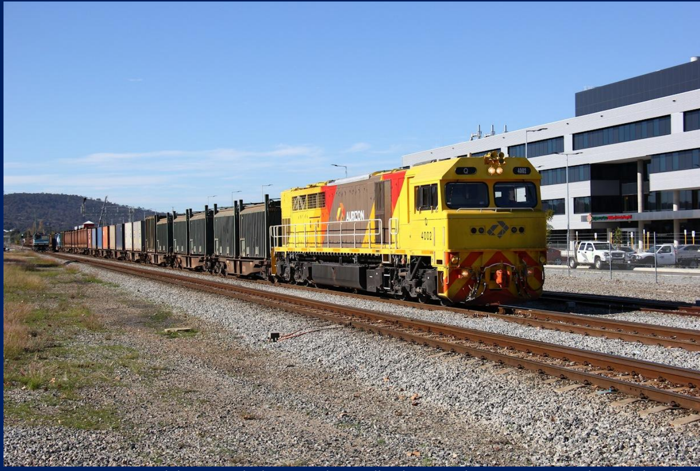
Q4002 on 4430 empty sulphur ex Malcolm going thru Midland June 11th.