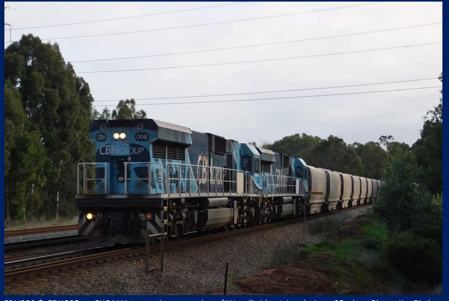
CBH008 & CBH005 on 2K64 Watco grain on east leg of Woodbridge triangle June 22nd.