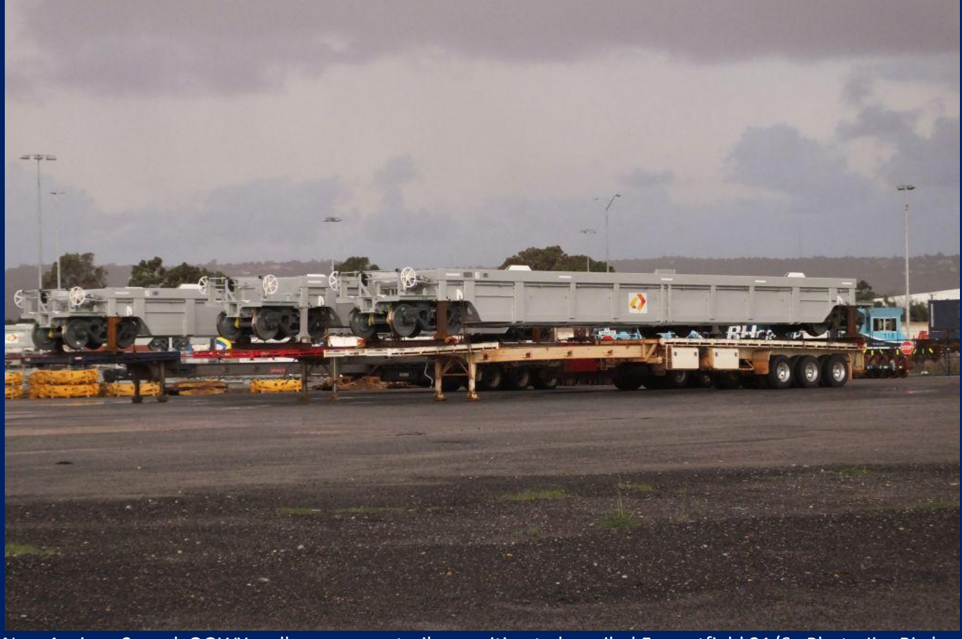
New Aurizon 2xpack QQWY well wagons on trailers waiting to be railed Forrestfield 21/6.