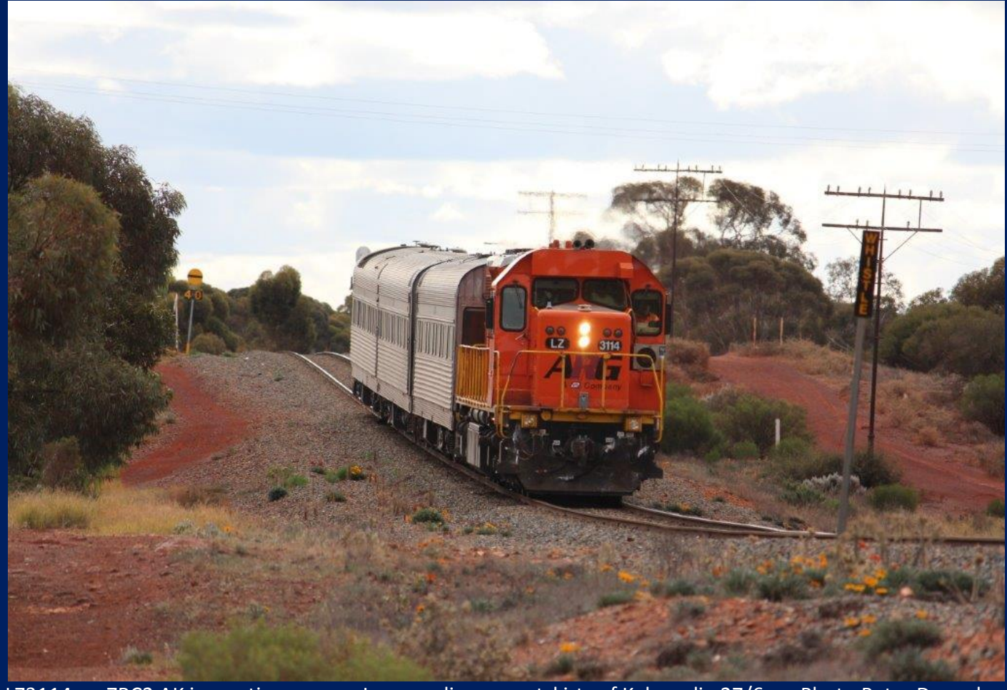
LZ3114 on 7RC2 AK inspection cars on Leonora line on outskirts of Kalgoorlie 27/6. Ph