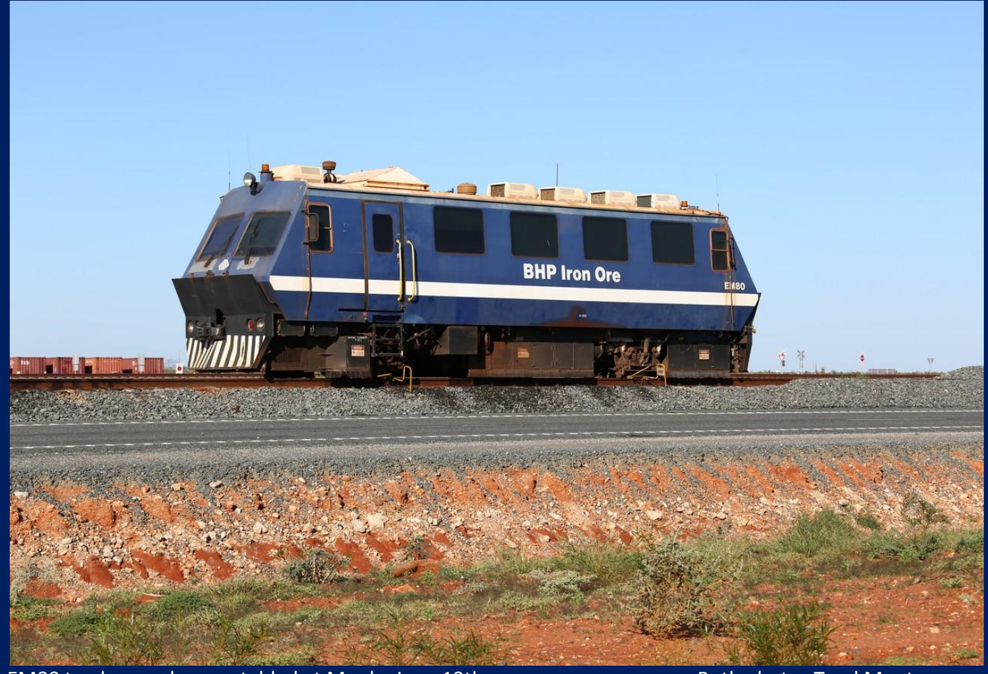
EM80 track recorder car stabled at Mooka June 19th.