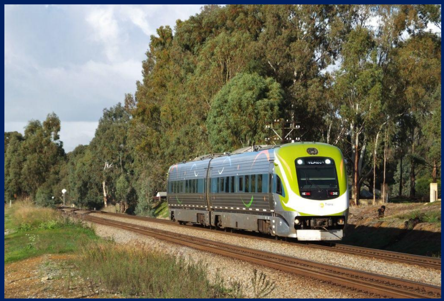
Saturday Avonlink service to Northam at Herne Hill on June 20th.