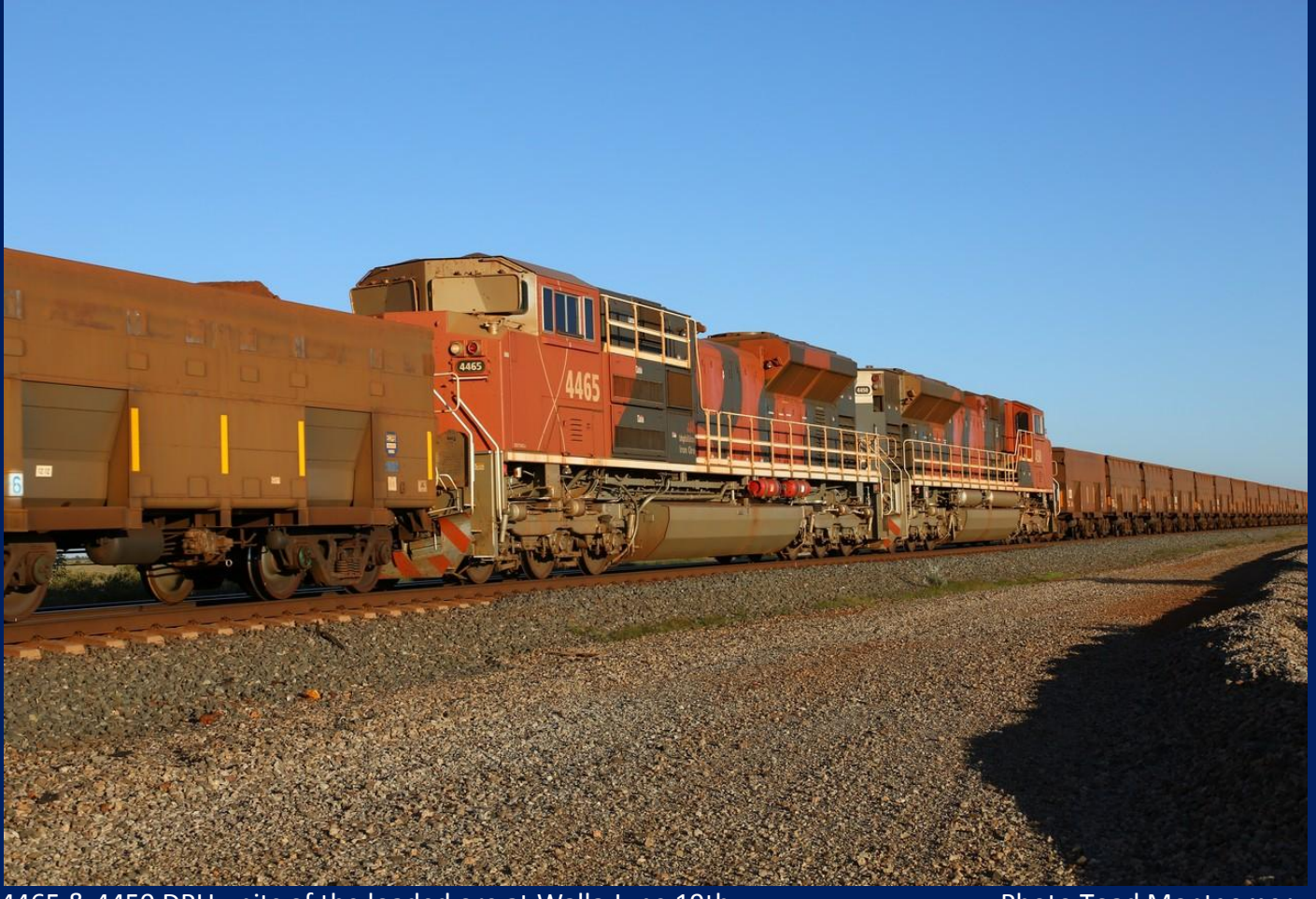
4465 & 4450 DPU units of the loaded ore at Walla June 19th.