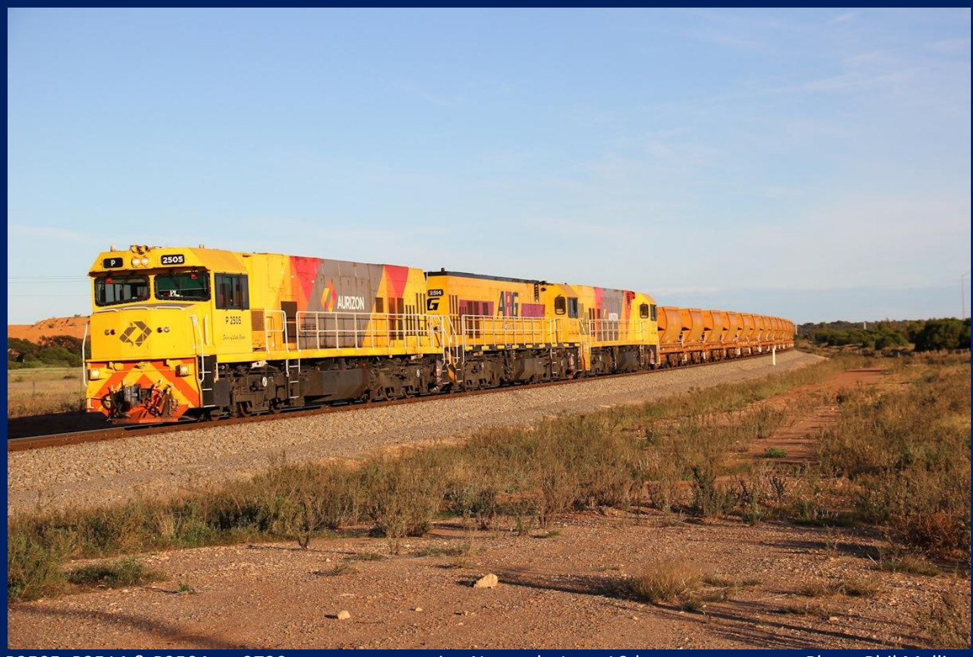
P2505, P2514 & P2504 on 3720 empty ore entering Narngulu June 16th.