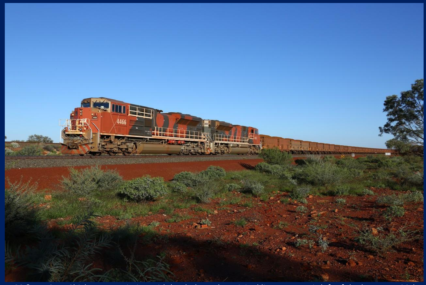
4466 & 4458 on Chichester Deviation with loaded ore the original line to Hesta is left of the loco June 20th.