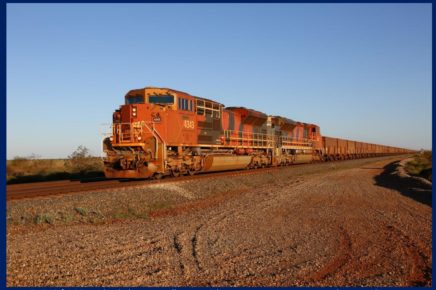
BHPBIO 4343 & 4385 on loaded ore at Walla June 19th.