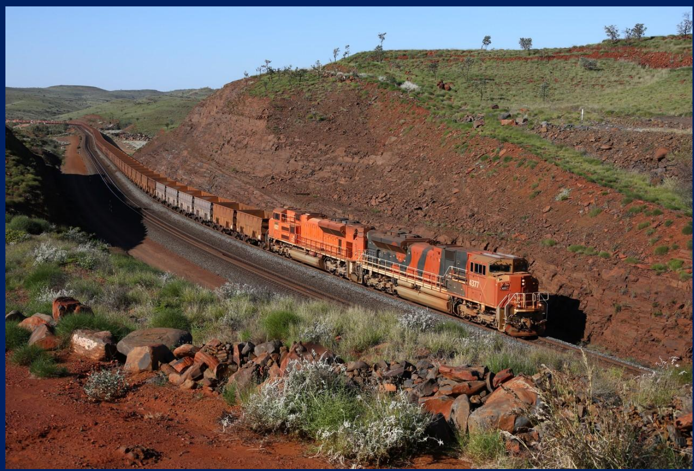
4377 & 4327 on empty ore in a cutting between Garden and Shaw on June 20th.