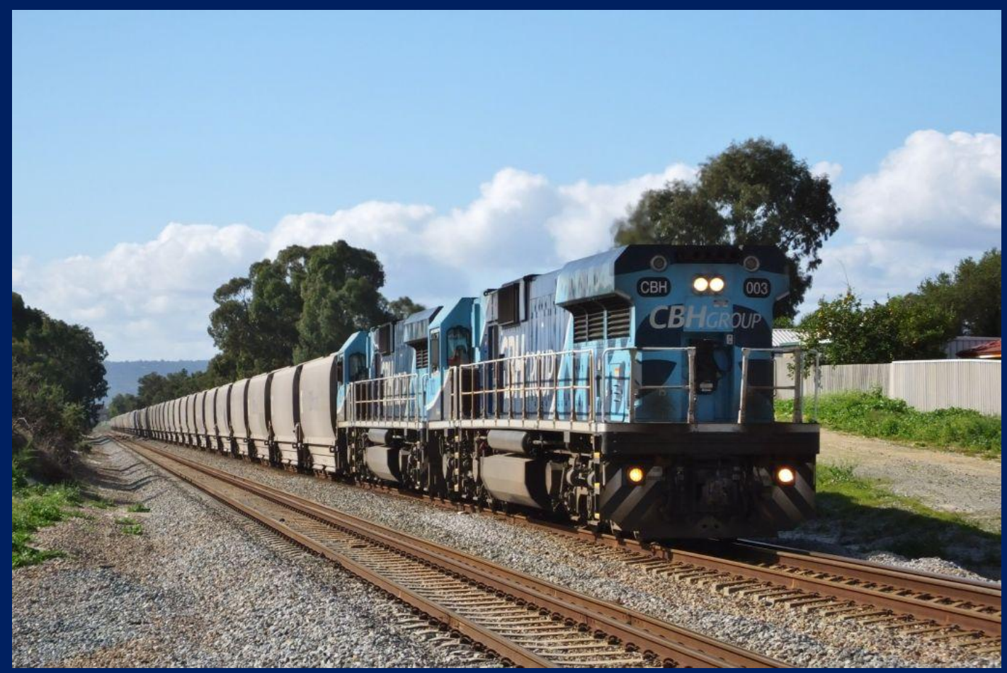
CBH003 & CBH001 both long end leading on Watco grain at Thornlie June 22nd.