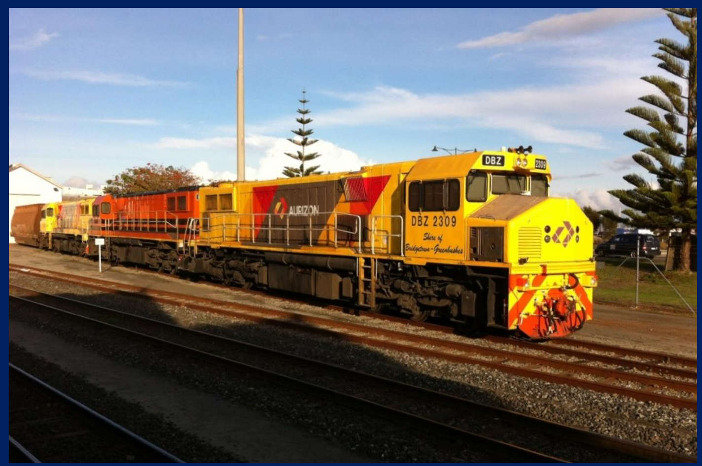
DBZ2309, DBZS2310 & DBZ2311 with XOA wagon at Albany to depart as 7304 to F/F 20/6.