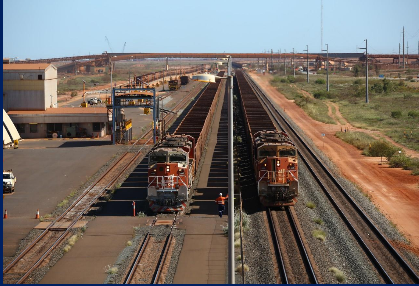
Two empty ore rakes, one on ready tracks other on bi-directional main at Boodarie on June 19th.