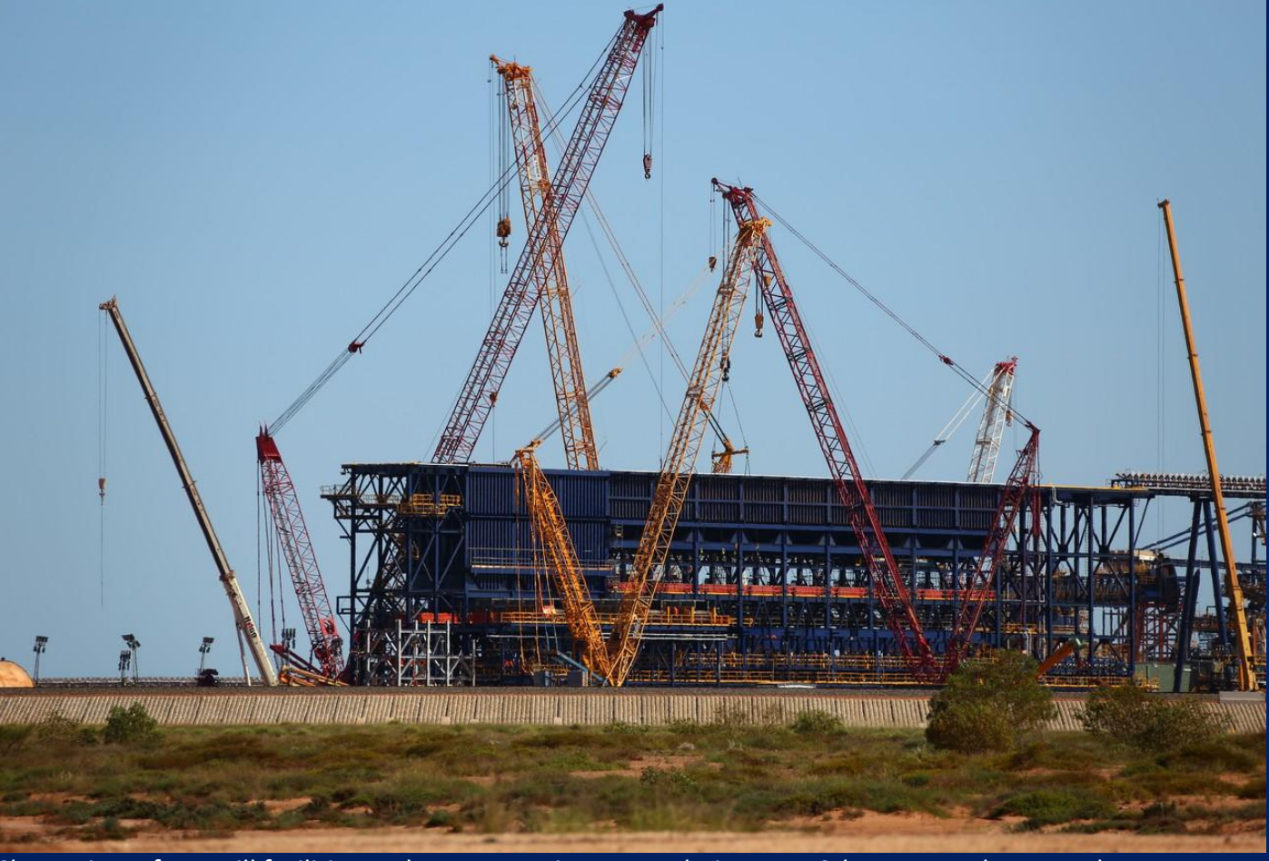
Closer view of Roy Hill facilities under construction at Boodarie June 19th.