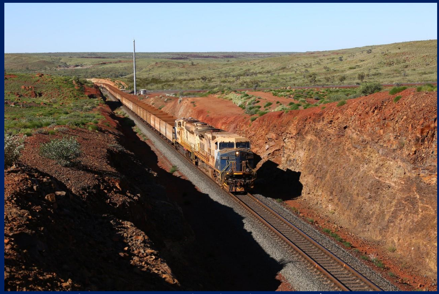
FMG CW44-9 005 & SD70ACe 715 in cutting Solomon line with GNH to rear 23/6.