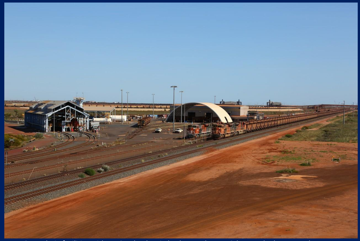
BHPBIO Boodarie facilities with FMG unloaders in background June 19th.