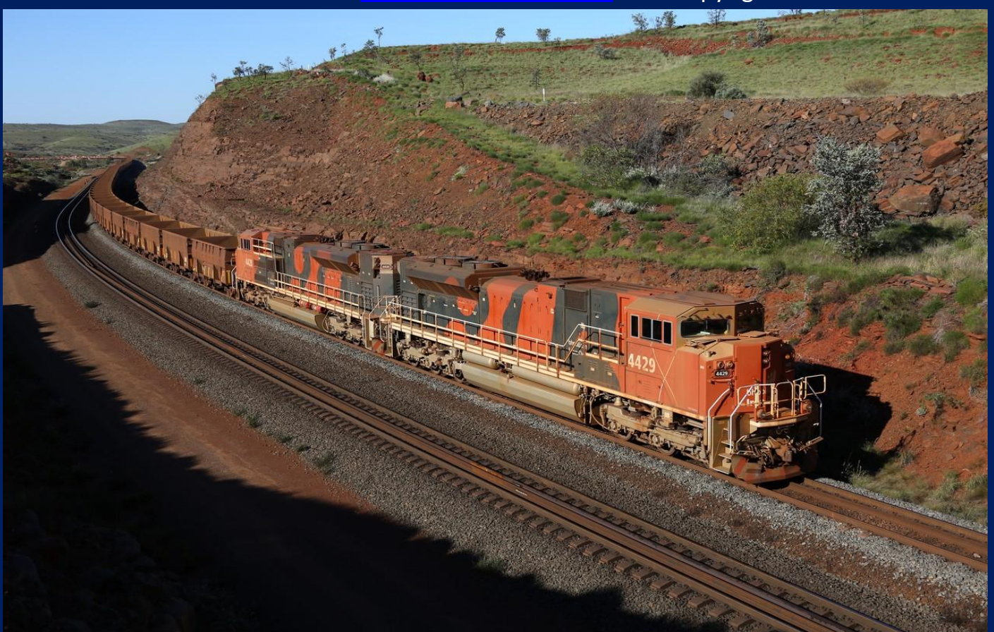
SD70ACe 4429 & 4428 with DPU 4386 & 4352 hauling an empty ore Newman main line as it climbs grade between Garden and Shaw on June 20th.

Publisher: Jim Bisdee Email: <a href="mailto:pm1225@bigpond.com">pm1225@bigpond.com</a> Copyright Jim Bisdee © 2015