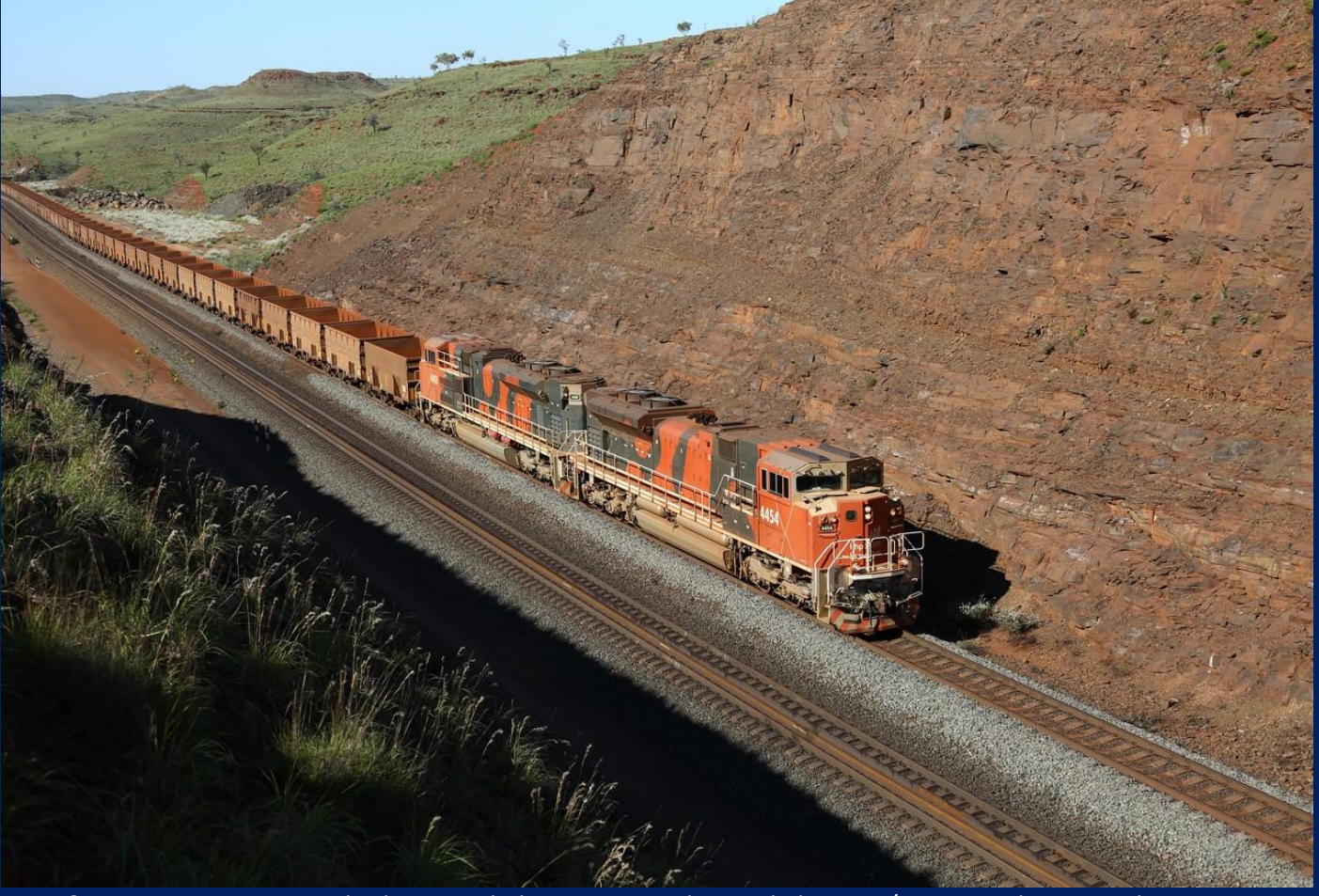
4454 & 4403 on empty ore climbing grade between Garden and Shaw 20/6.