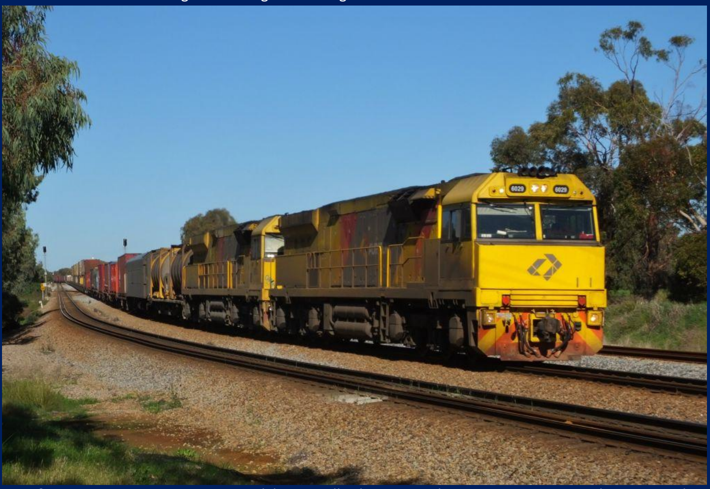
6029 & 6028 on 7PM1 Aurizon intermodal at Woodbridge June 27th.