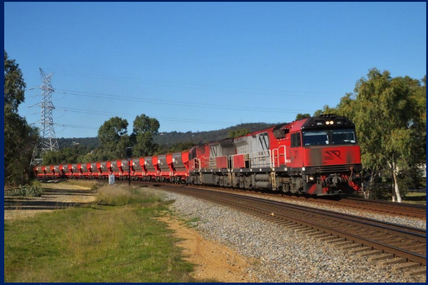
MRL003 & MRL006 on 1030 Polaris ore at Bellevue June 28th.