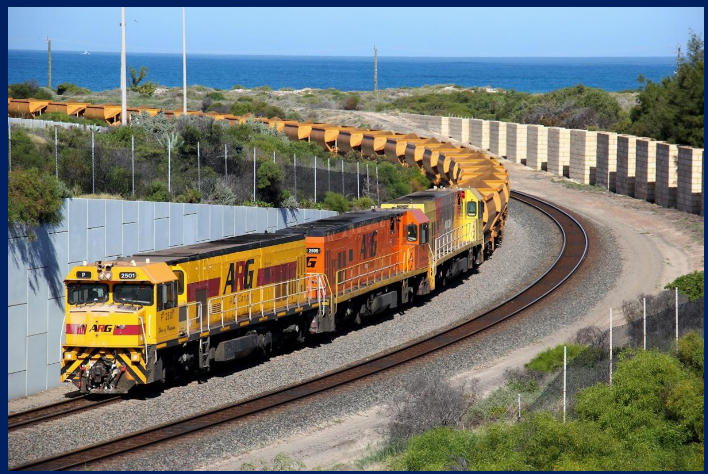
P2501, P2509 & P2504 on 2721 ore entering the Port of Geraldton on June 29th.