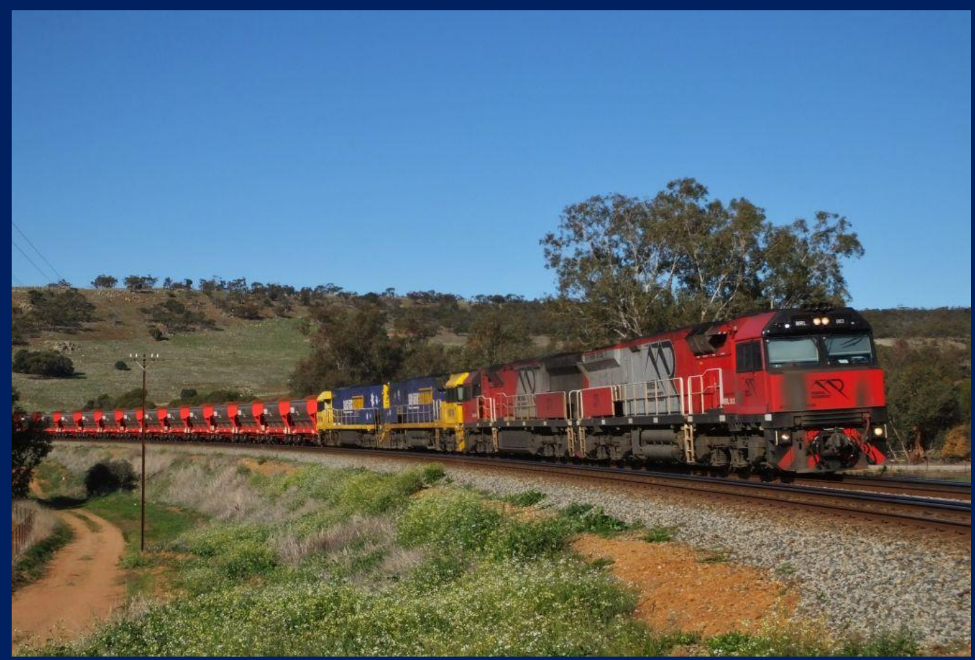
MRL003, MRL006, off line NR114 & NR119 on 5030 Polaris ore Northam on June 25th.