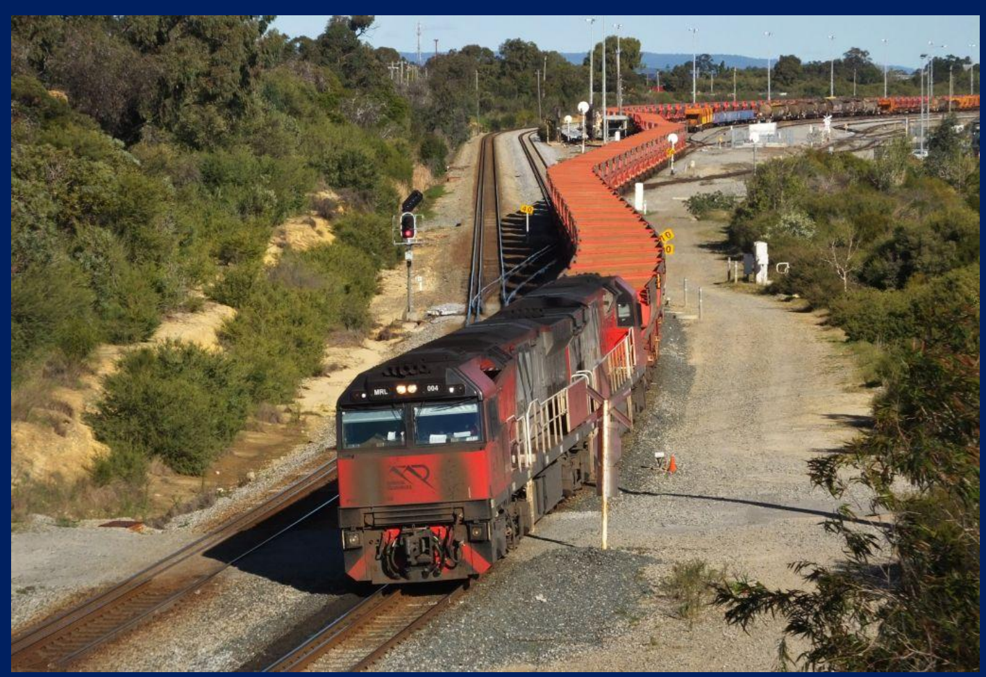
MRL004 & MRL002 on 1035 empty Polaris ore departing Forrestfield June 28th.