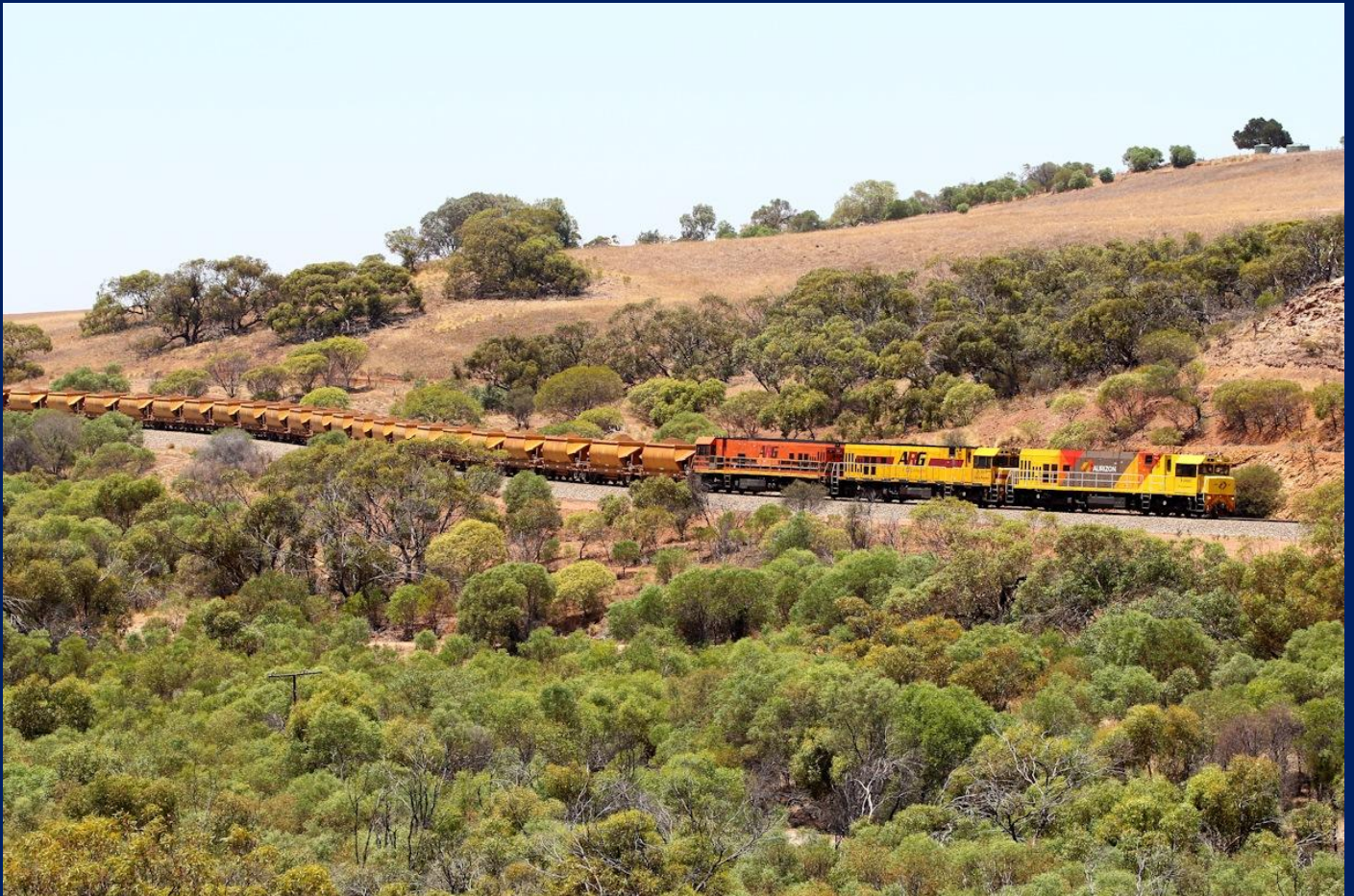
P2505, P2511 & P2513 on 4721 Mt Gibson ore descending grade at Bringo 6/1.