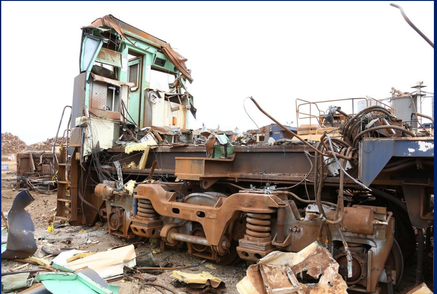
5661 showing how thick frames are on these BHPBio locomotives 28/1.