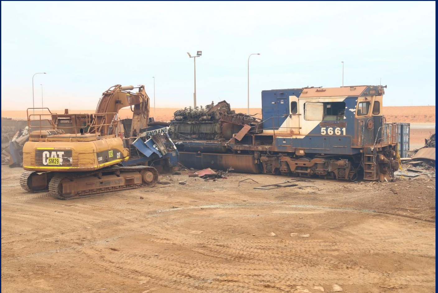
Cab and electrical cabinets with partly dismantled engine alternator at Simms Metal 28/1.