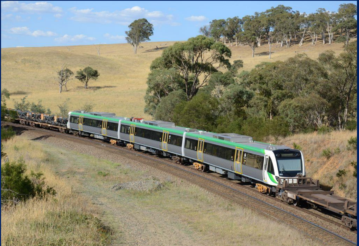
EMU set 113 on rear 5NY3 steel train Morandoo to Port Augusta at Goulburn NSW 13/1.