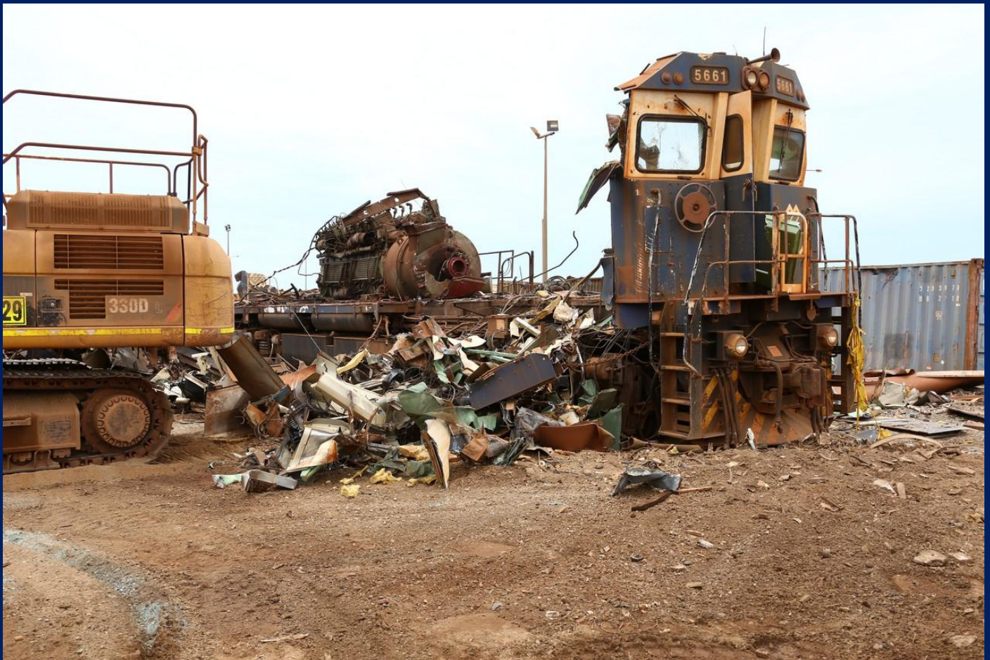
5661 nearly dismantled engine and alternator on the frame 28/1.