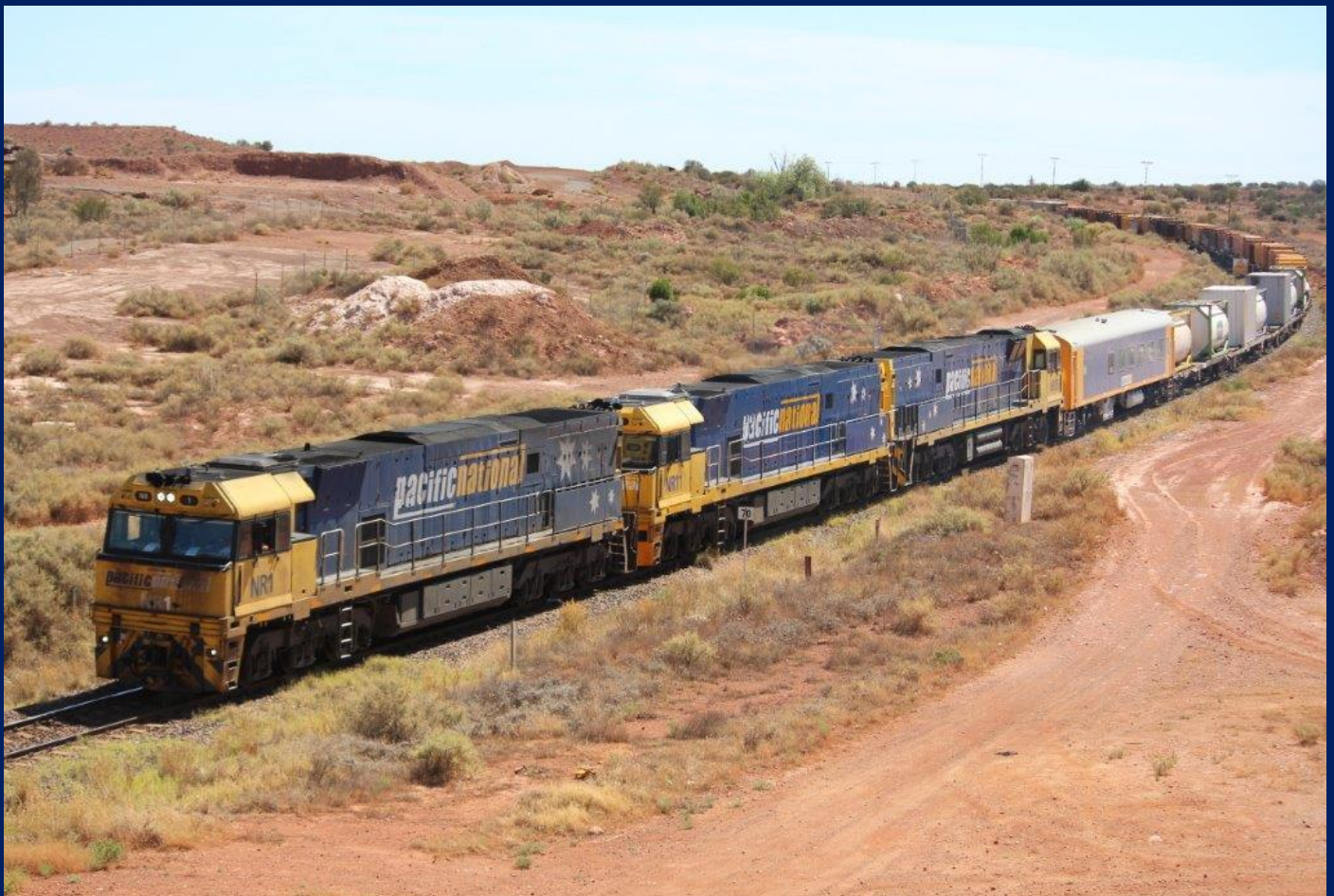
NR1, NR11 & failed NR35 on 5MP2 after cresting Parkeston bank 10/1.