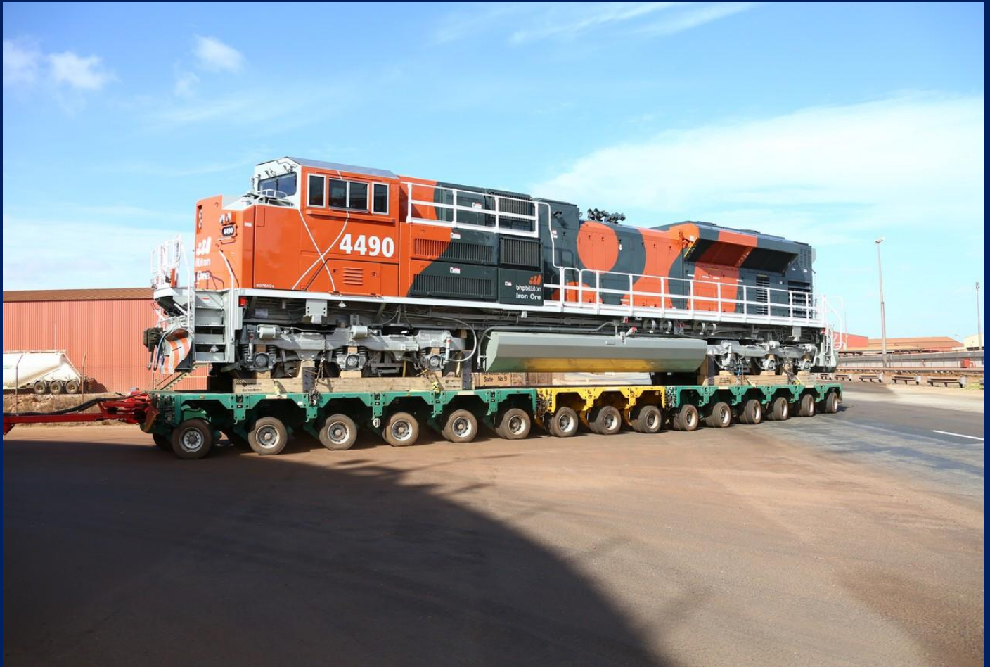
New BHPBio SD70ACe 4490 on transport float entering Nelson Point yard 19/1.