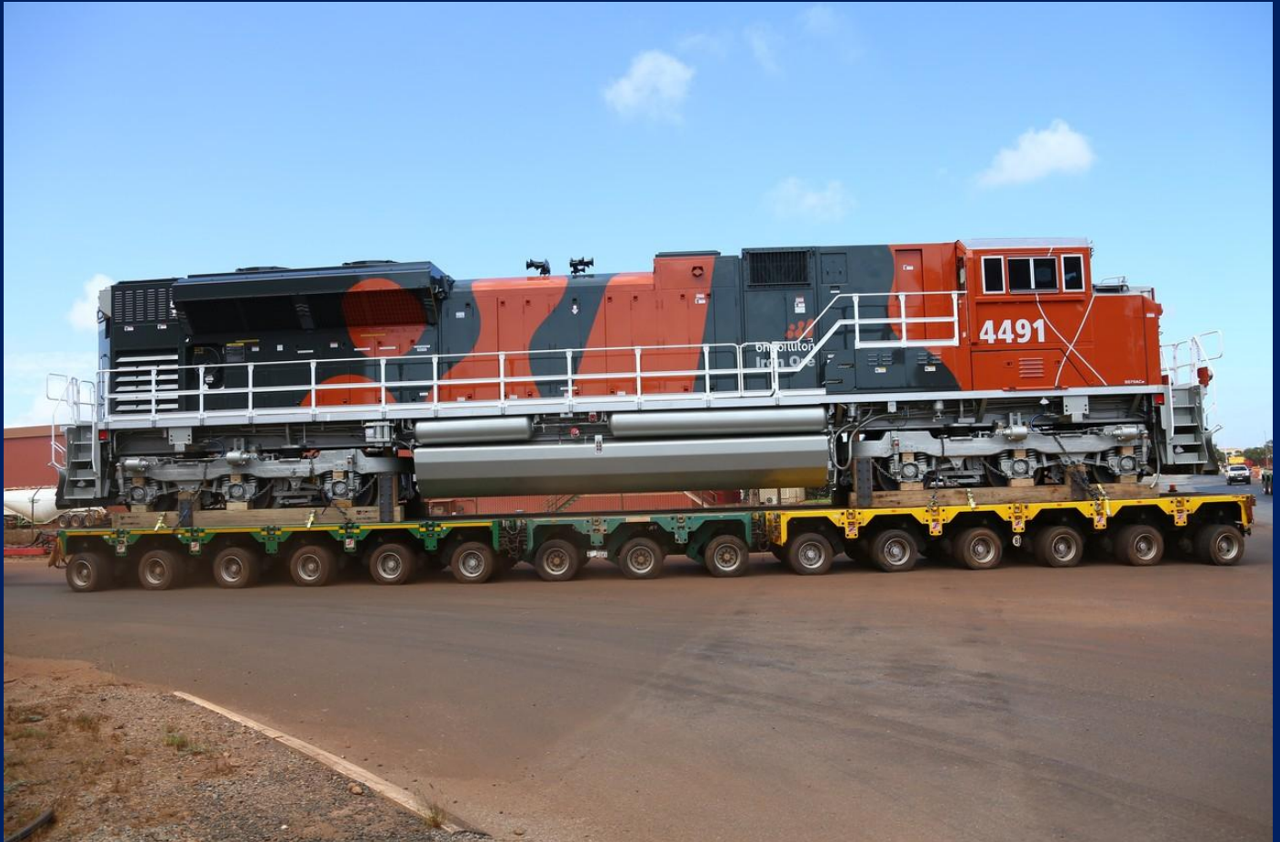
Final new BHPBio SD70ACe 4491 entering Nelson Point Yard 19/1.