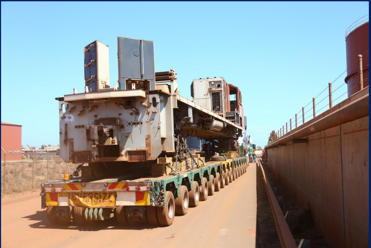
Remains of SD70ACE 4300 going to scrap departing Nelson Point 25/1.