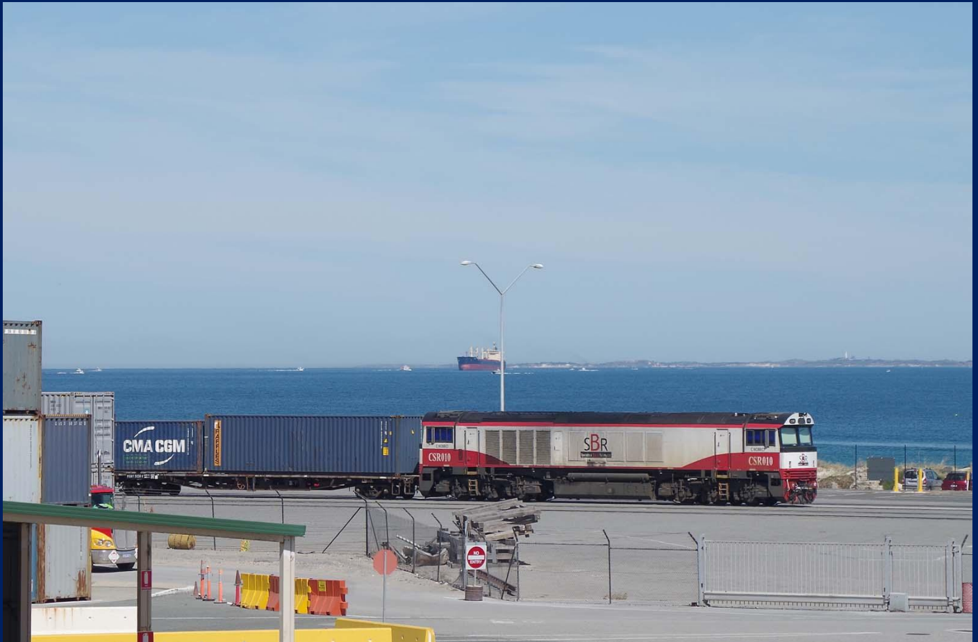
CSR010 stabled on intermodal at ILS terminal North Port January 24th.