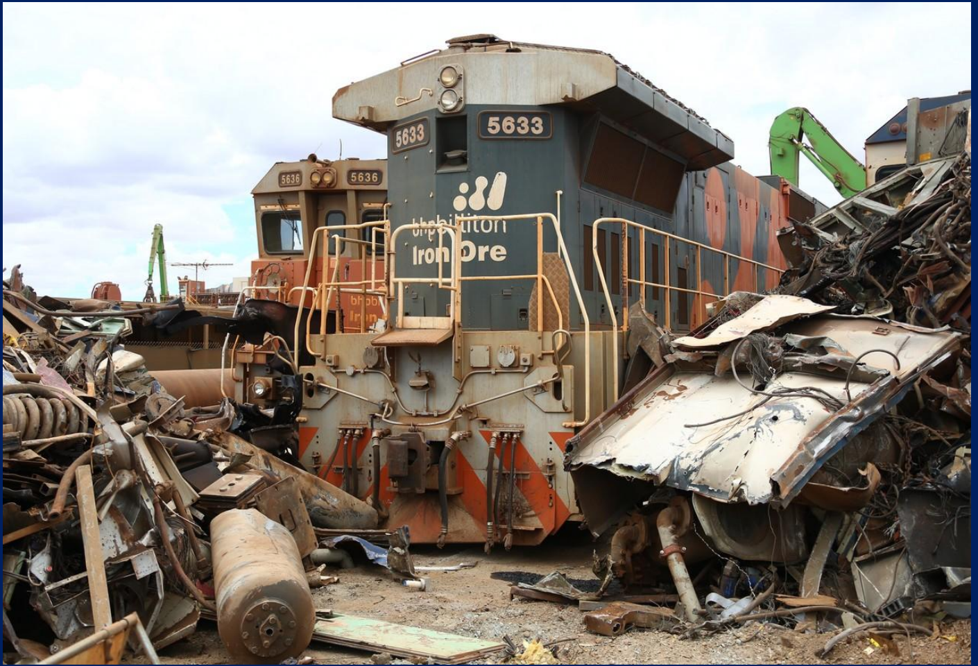
5663 and 5636 surrounded by scrap metal in Simms Yard at Wedgefield 28/1.