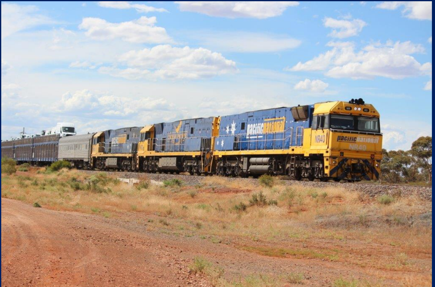
NR40, NR27 & NR24 on 6PM6 climbs grade out of Parkeston to Golden Ridge 9/1.