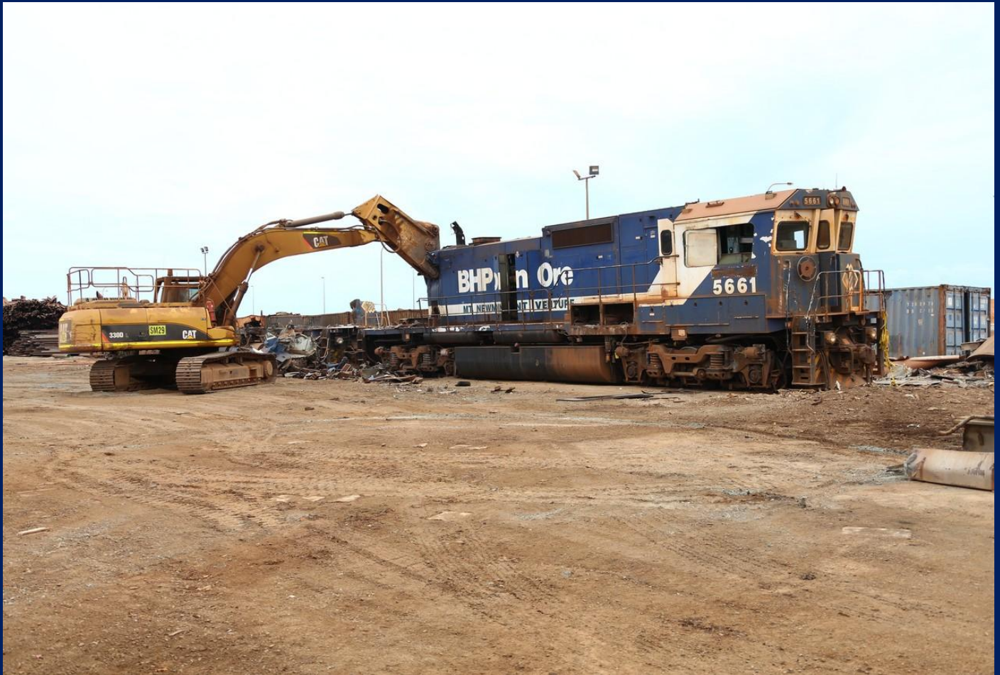
CM40-8M 5661 being scrapped at Simms Metal Wedgefield January 28th.