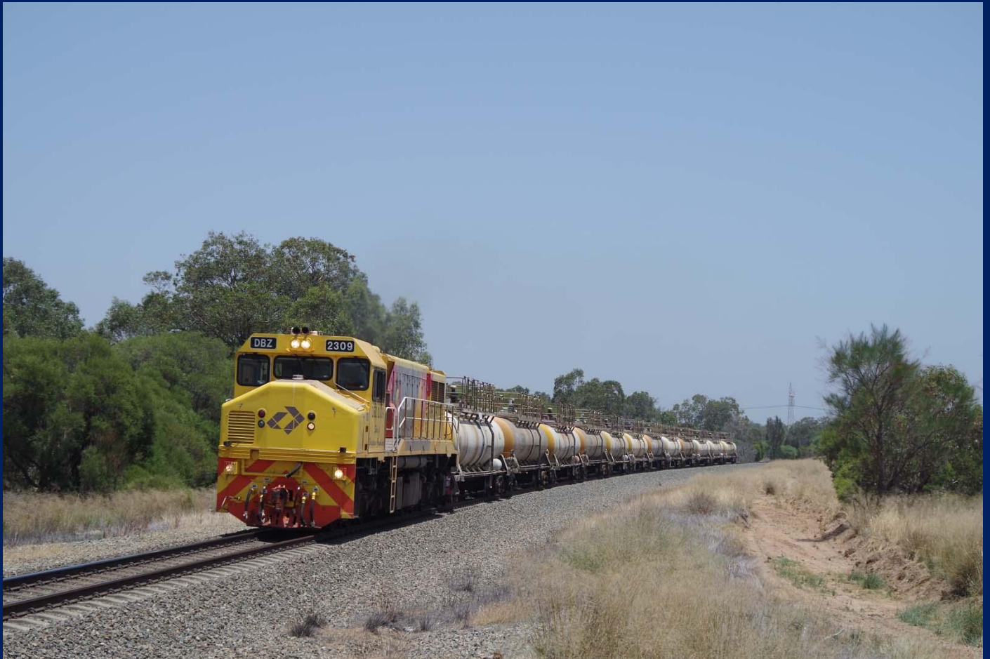
DBZ2309 on 3237 caustic tankers to Calcine at Mundijong Junction January 5th.