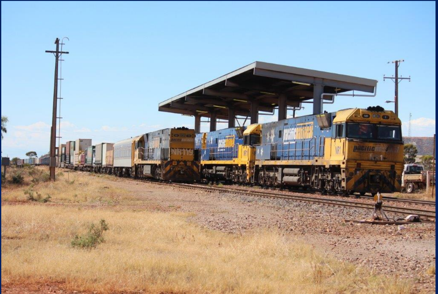
NR1 attached to lead 5MP2 to assist it to West Kalgoorlie with NR119 on 6MP4 stabled in the loop 10/1.