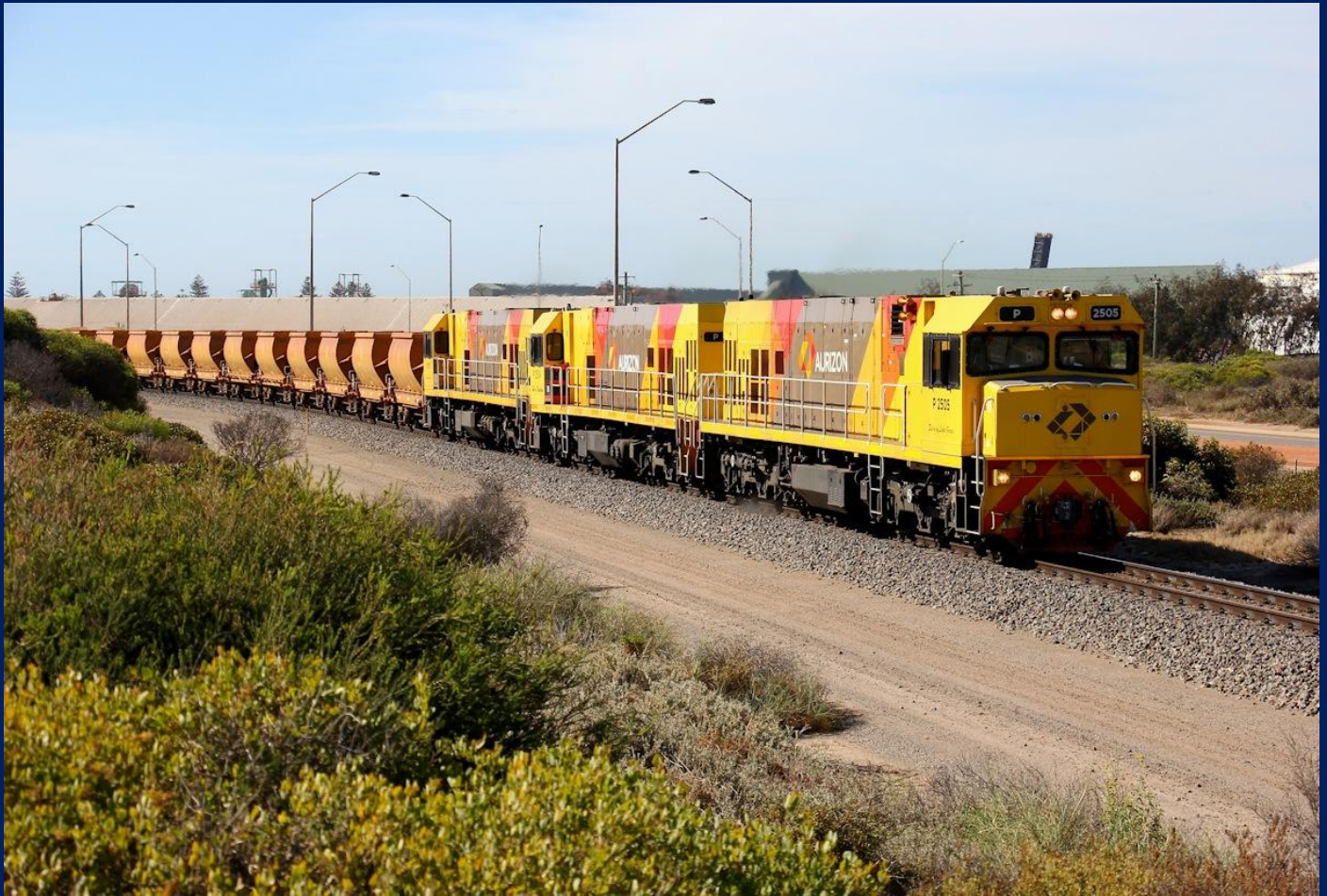
P2505, P2504 & P2517 on first run of three Aurizon livery units on 7722 empty ore Beachlands 23/1.