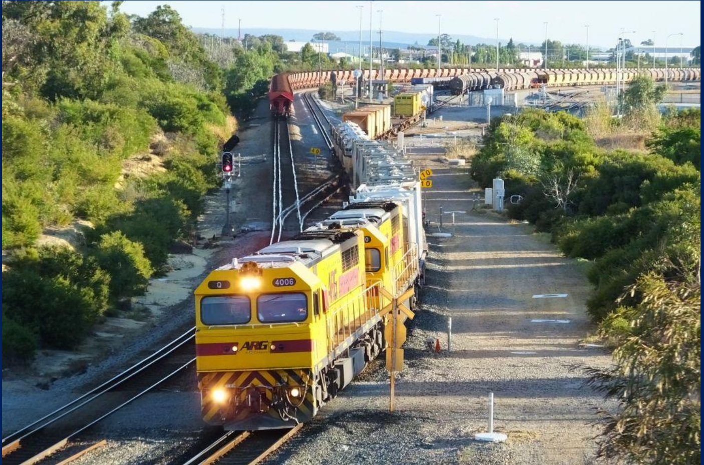
Q4006 & Q4010 on short 7025 Kalgoorlie freight departing Forrestfield as Mineral Resources Ltd Polaris iron ore train runs past on the main line January 23rd.