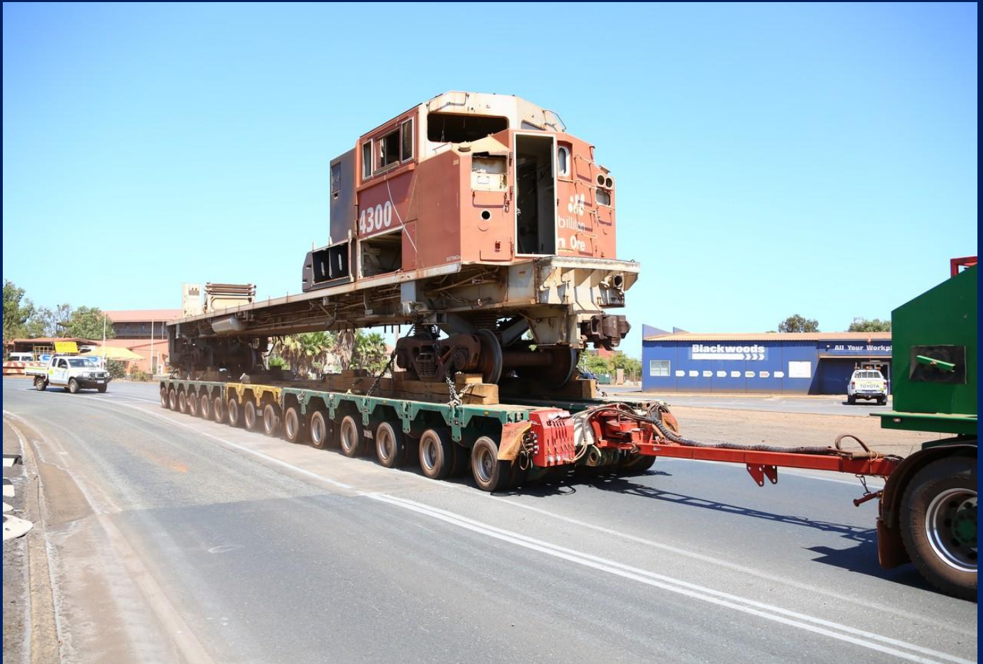
4300 was parts source on the original SD70ACe delivery being hauled to scrap out of Nelson Point 25/1.