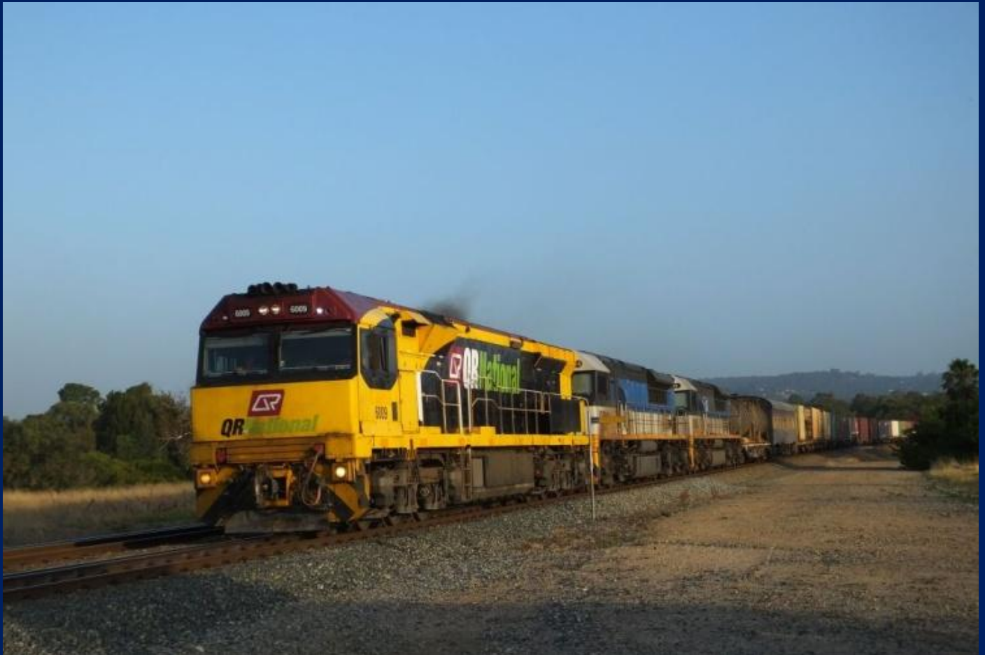
6009, LDP001 & LDP002 on 3PM1 Aurizon intermodal at Stratton January 5th.