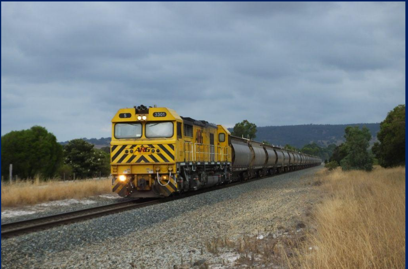
S3301 on 2224 alumina Calcine to Kwinana at Mundijong January 11th.