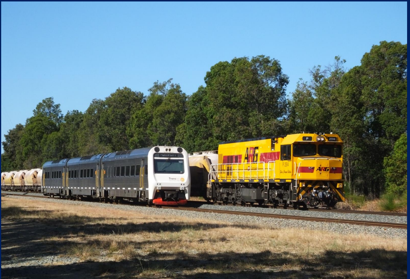
Australind on loop crosses P2514 on main line at Mundijong January 13th.