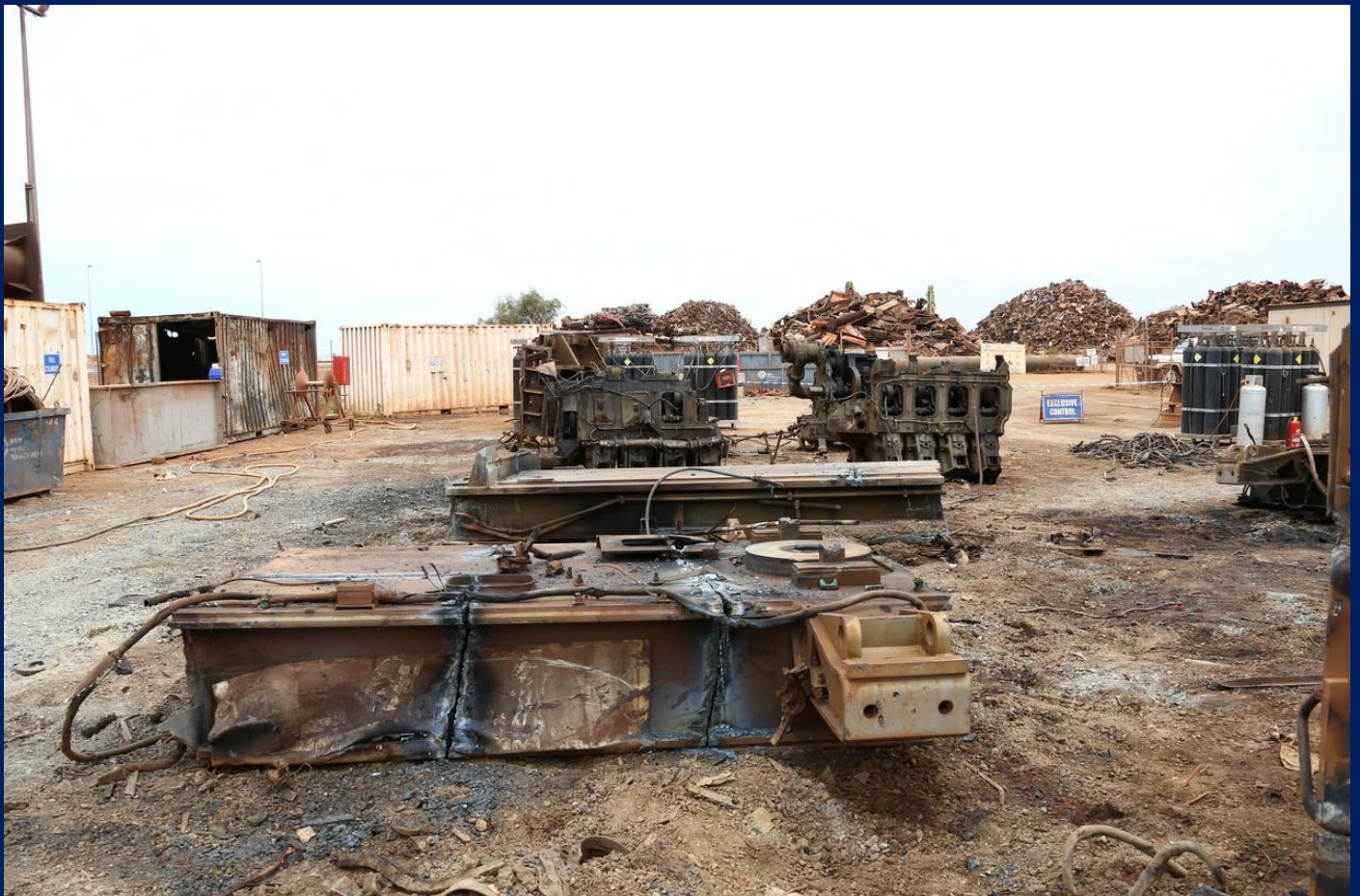
Remains of a CM0-8 soon to end up in the scrap piles like in the background 28/1.