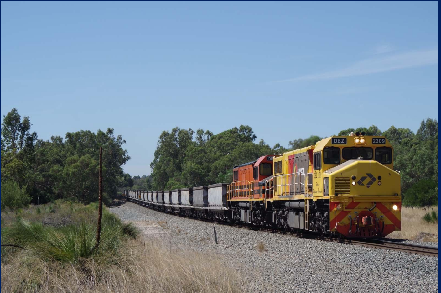
DBZ2309 & DBZ2310 on 4253 empty coal at Mundijong January 13th.