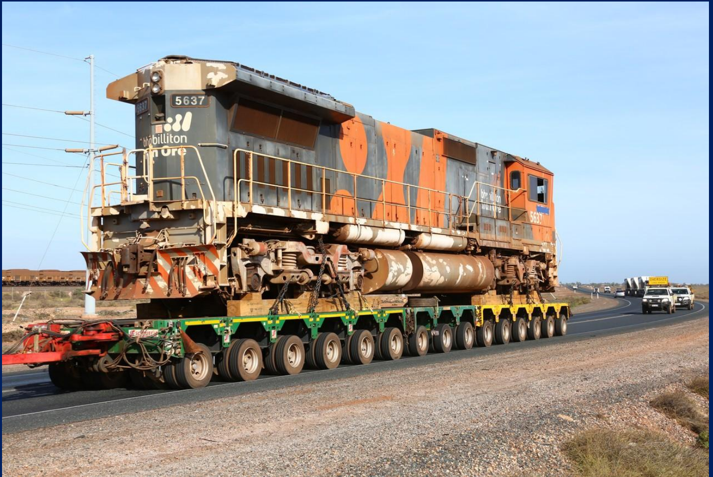
CM40-8M 5637 being hauled to scrap at Simms Metals Wedgefield January 24th.