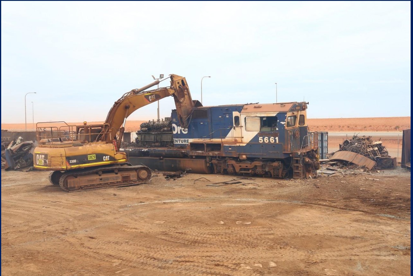
Scraping of 5661 CM40-8 continuing at Simms Metal January 28th.