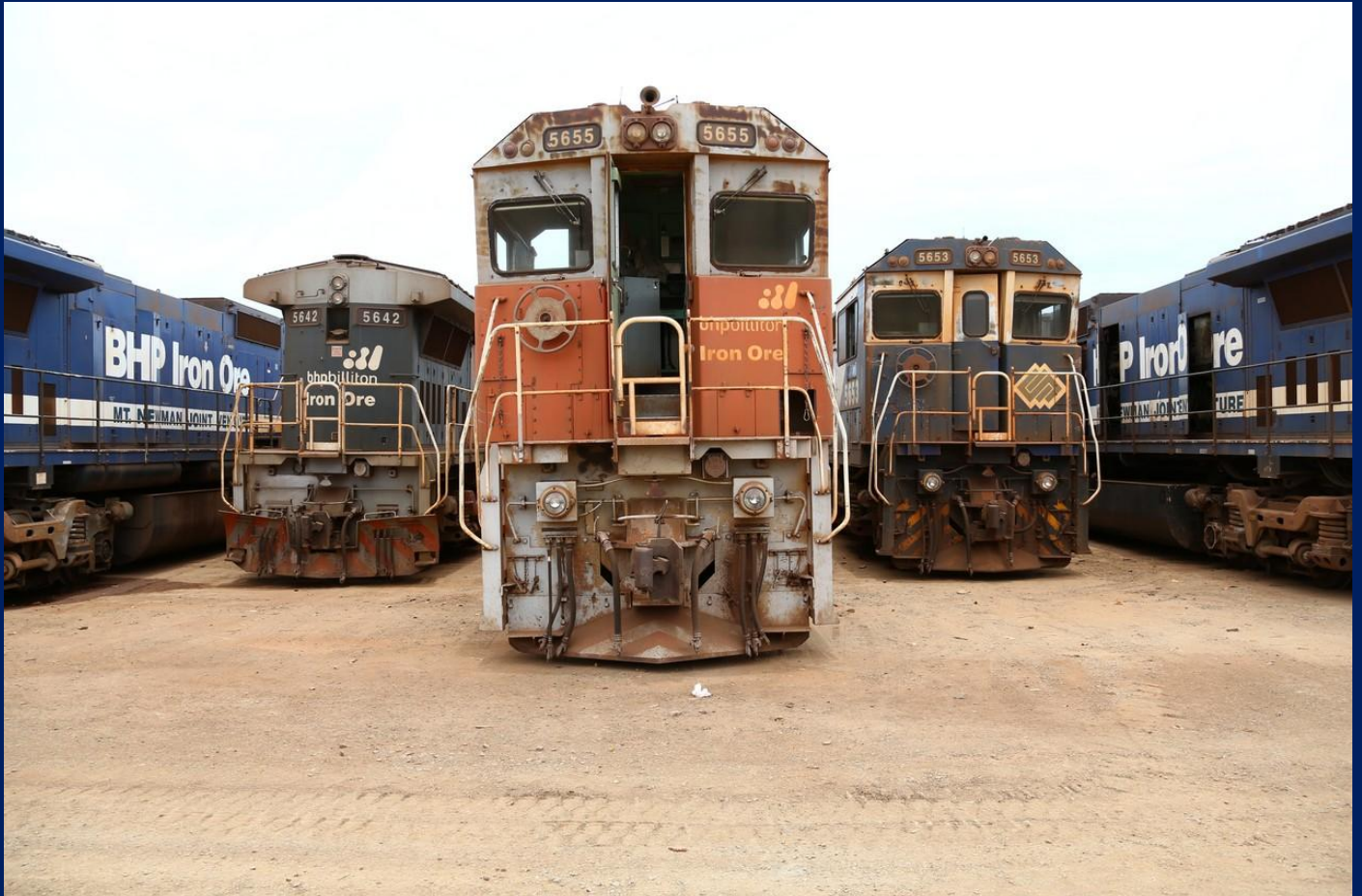
CM40-8s lined up at Simms Metal Wedgefield waiting to be scrapped 28/1.