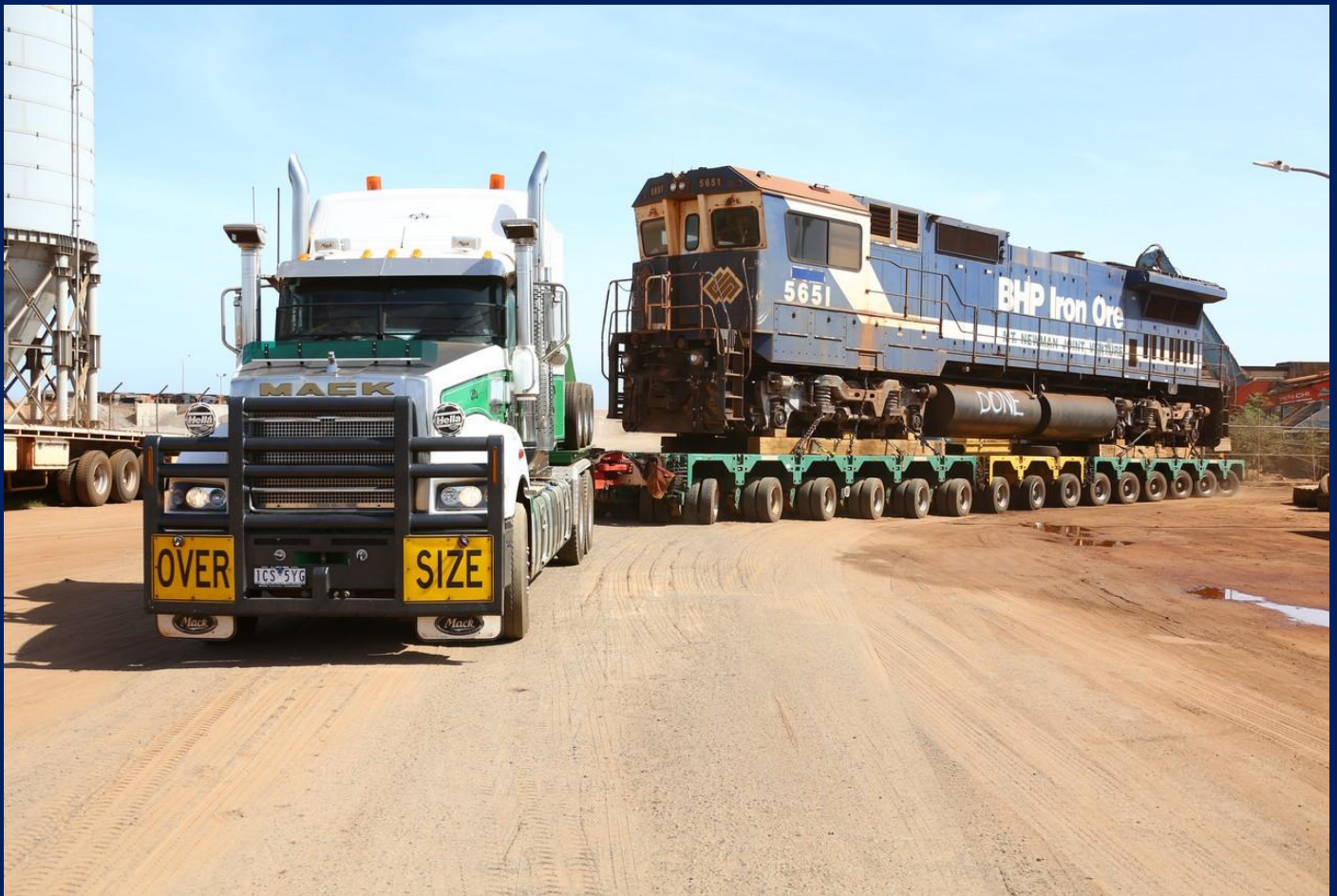
CM40-8M 5661 about to be pushed into Simms Metal Wedgefield 16/1.