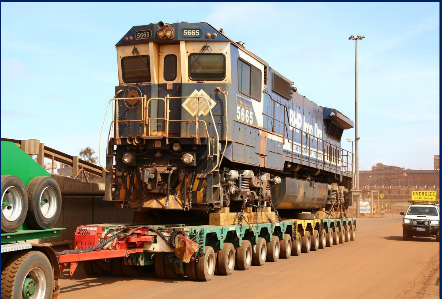
5665 being hauled out to be scrapped at Sims Metals January 24th.