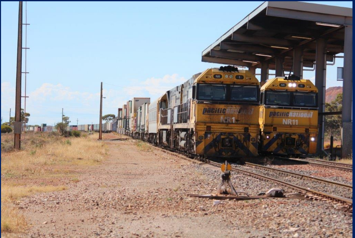
NR11 & failed NR35 on 5MP2 with NR1 & NR119 on 6MP4 at Parkeston 10/1.