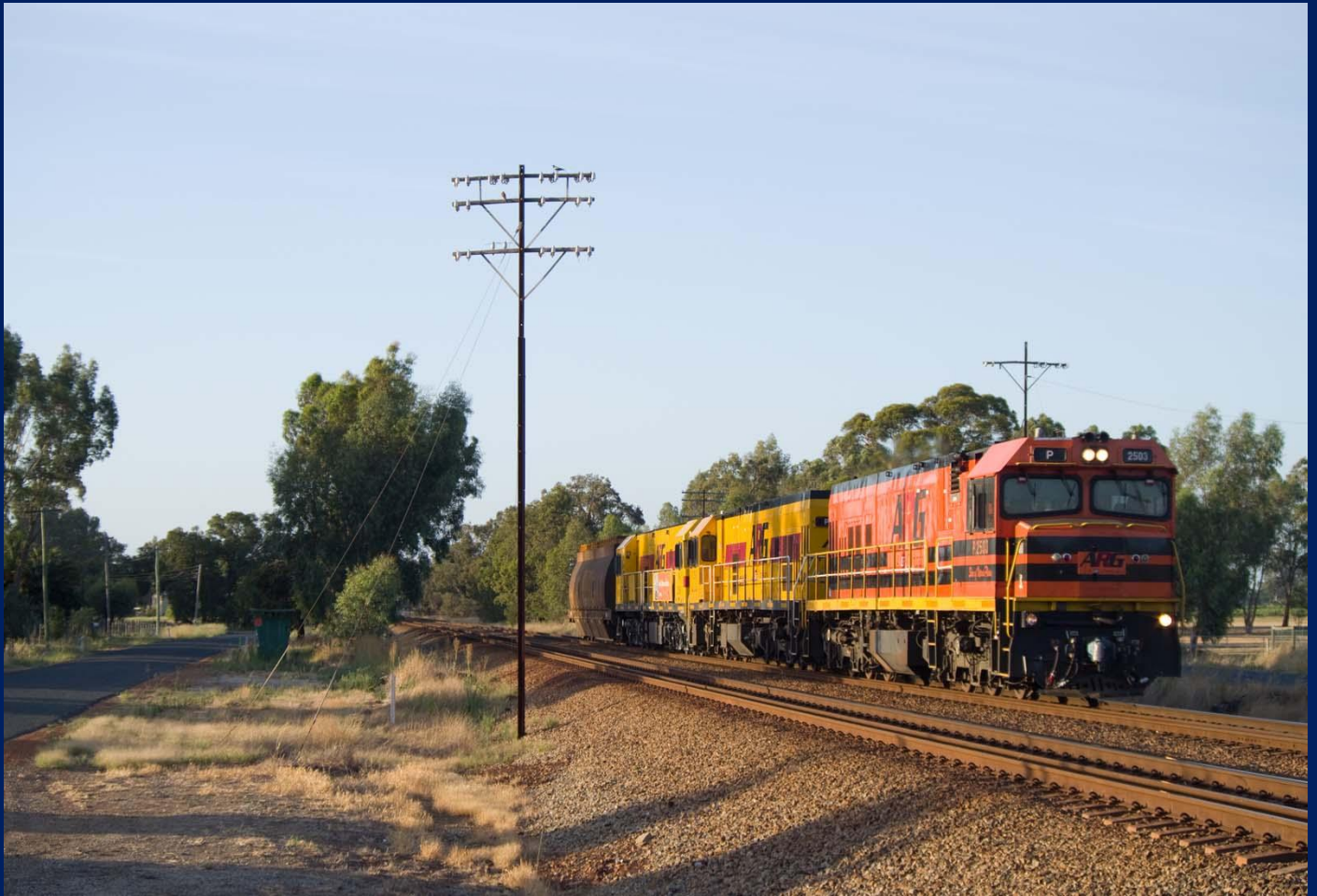
P2503, P2515 & PA2819 with XOA wagon on 1305 transfer to Albany at Millendon 3/1.