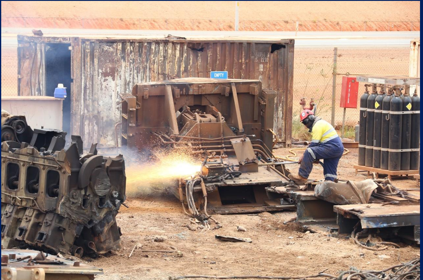
Cutting thru frame of CM40-8 at Sims Metal Wedgefield 28/1.