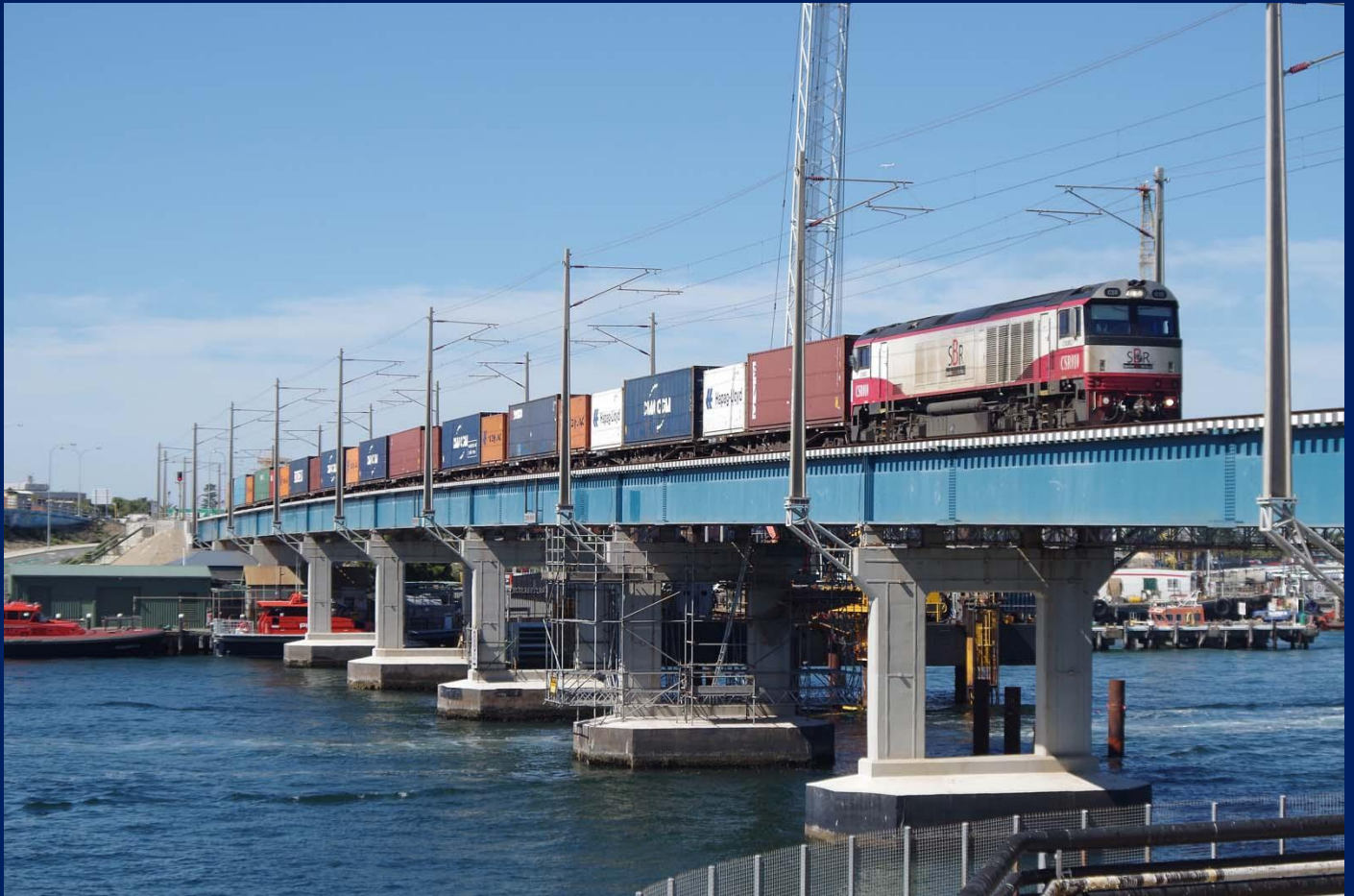
CSR010 on 1142 ILS intermodal crossing Fremantle rail bridge January 24th.