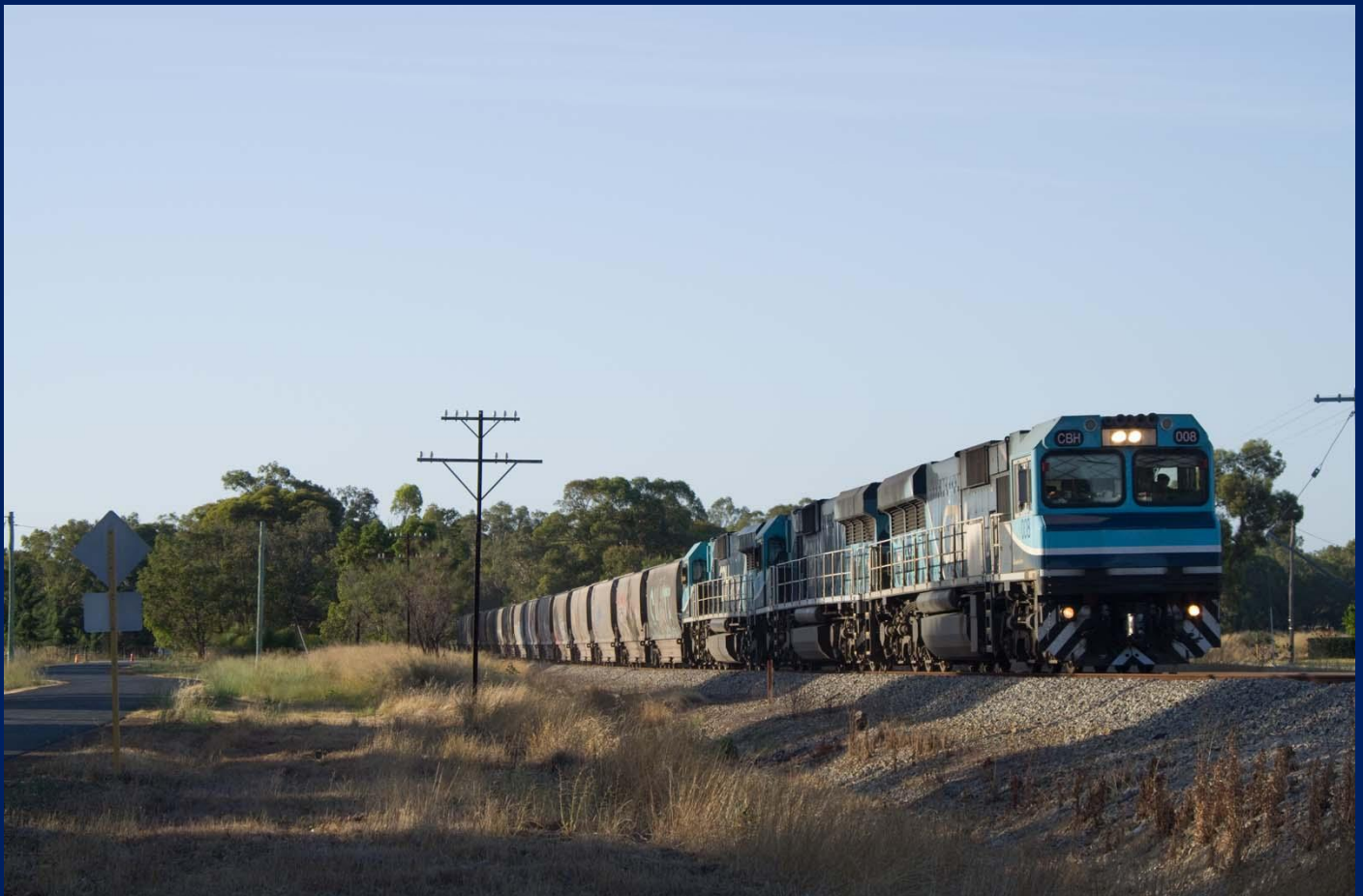
CBH008, CBH005 & CBH006 on 1K51 empty grain transfer Geraldton at Millendon 3/1.