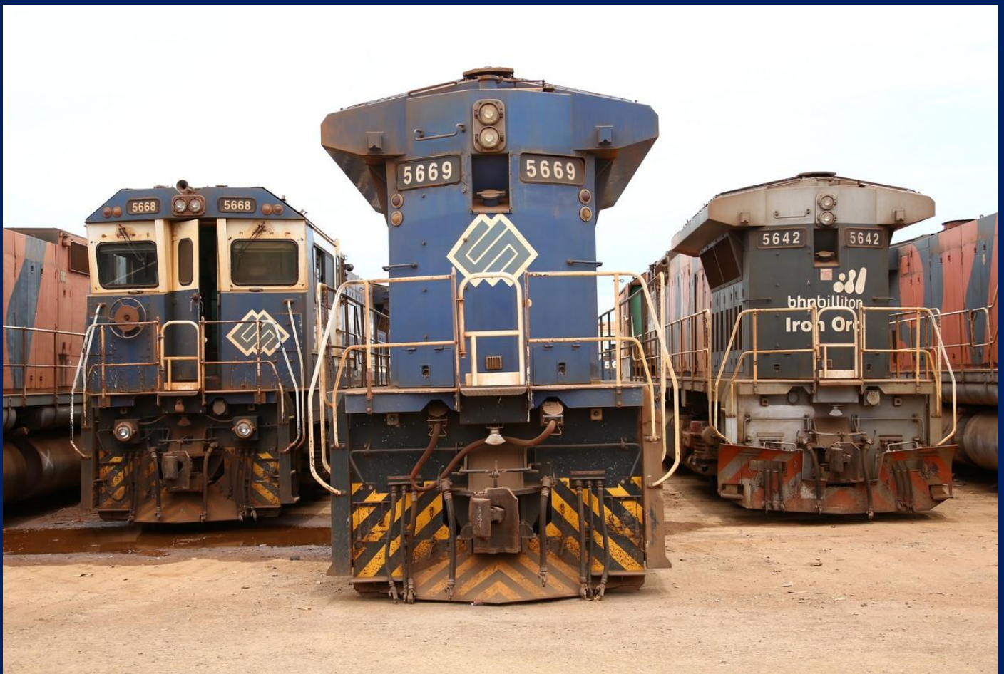
Final CM40-8s built 5669 with 5668 and 5642 awaiting scrapping Simms Metal Yard Wedgefield 28/1.