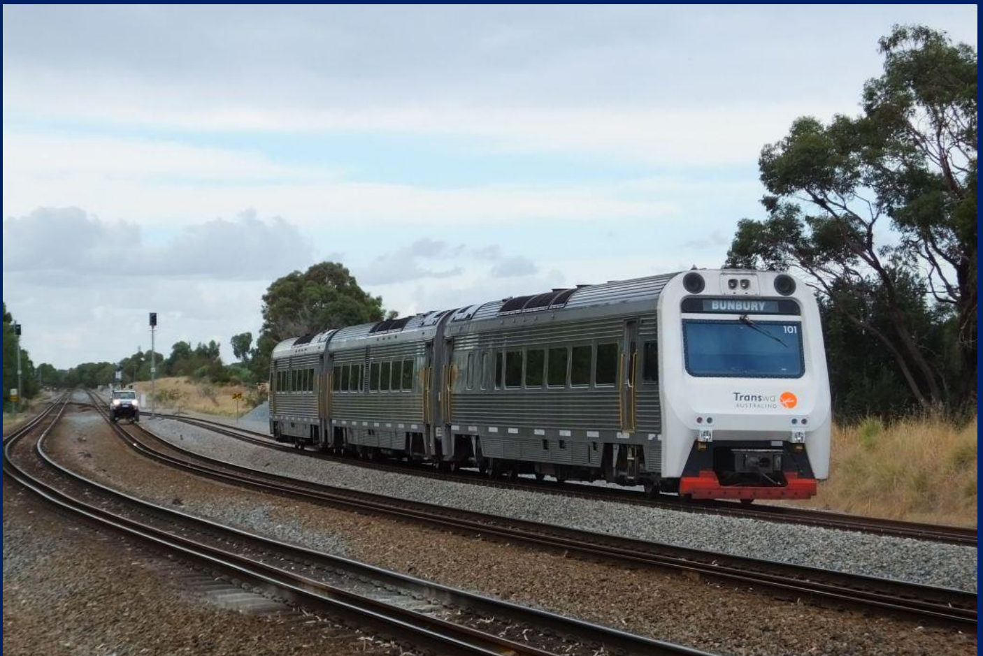
ADP103, ADQ121 & ADP101 on 3CF1 Australind set Claisebrook to Forrestfield to collect ADP102 19/1.