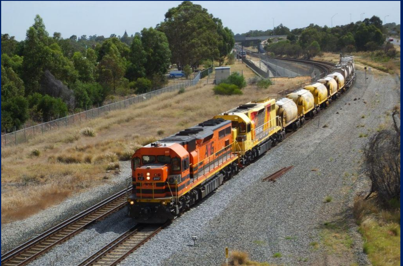
LZ3117 hauling failure LZ3106 on 1197 Soundcem shunter at Kenwick January 4th.