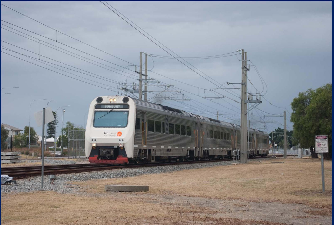
ADP101, ADQ121, ADP103 & ADP102 on four car Australind set on Midland line at Bassendean 19/1.