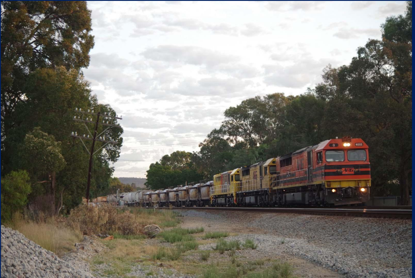
Q4005, Q4008 & Q4007 on 1029 combined sulphur Kalgoorlie freight Swan View 24/1.