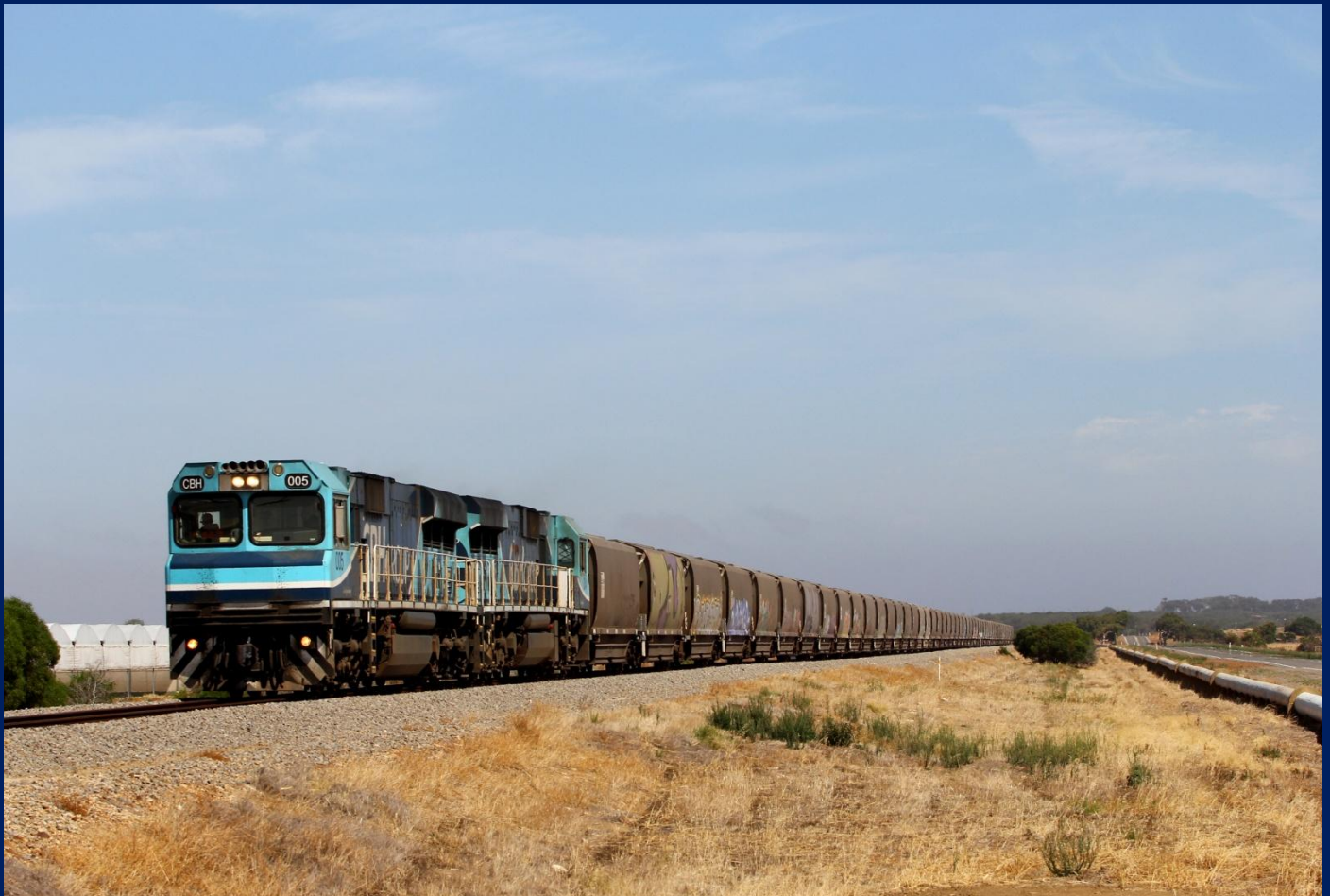
CBH005 & CBH004 on 5G50 empty grain to Carnamah at Bootenal January 7th.