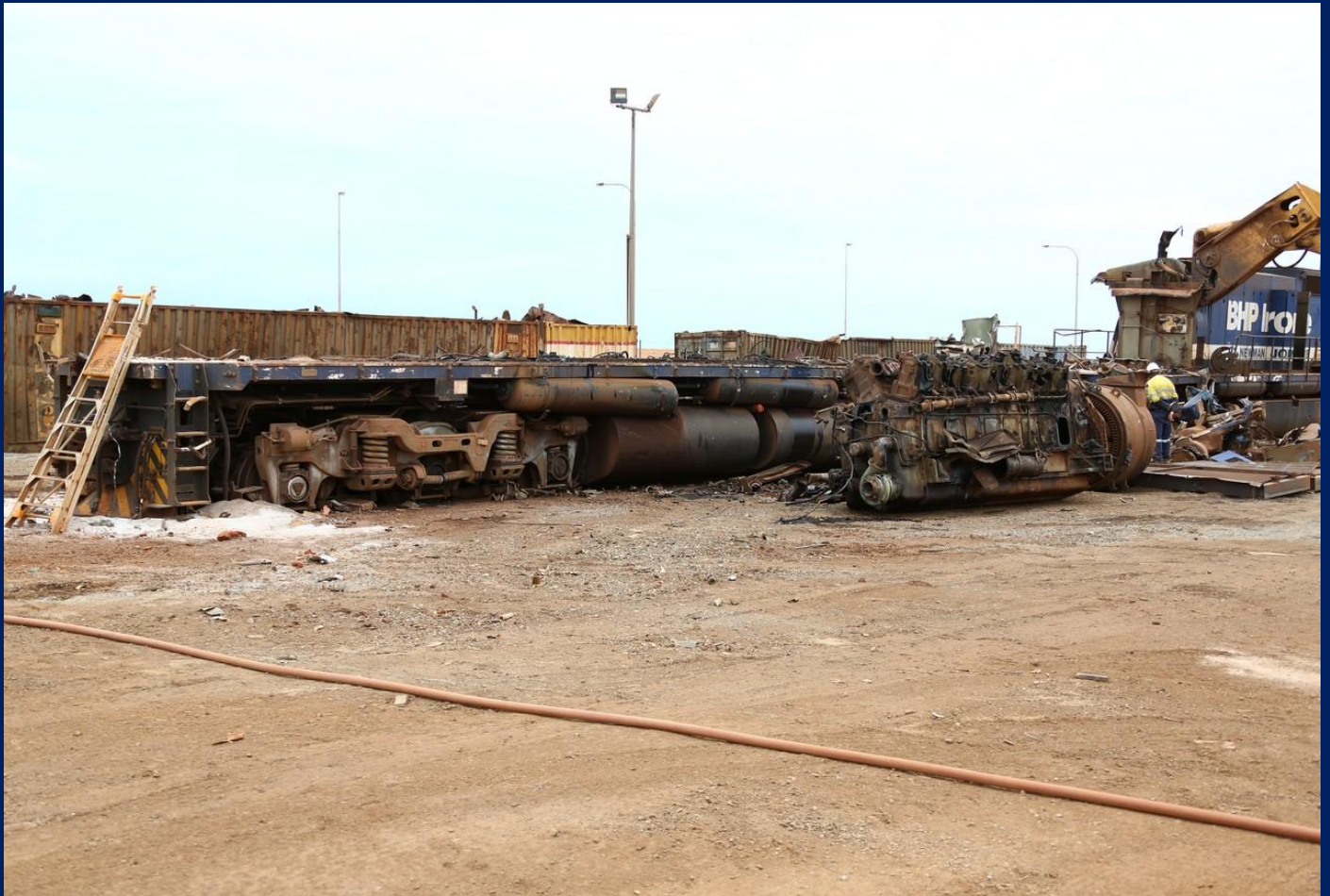
Dismantled CM40-8 at Sims Metal with dismantling of next one underway 28/1.