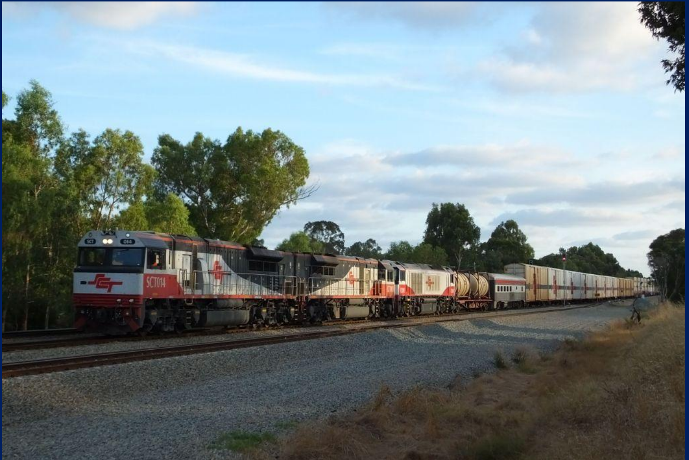
SCT014, SCT003 & dead attached CSR005 on 1PM9 SCT freight at Woodbridge 10/1.