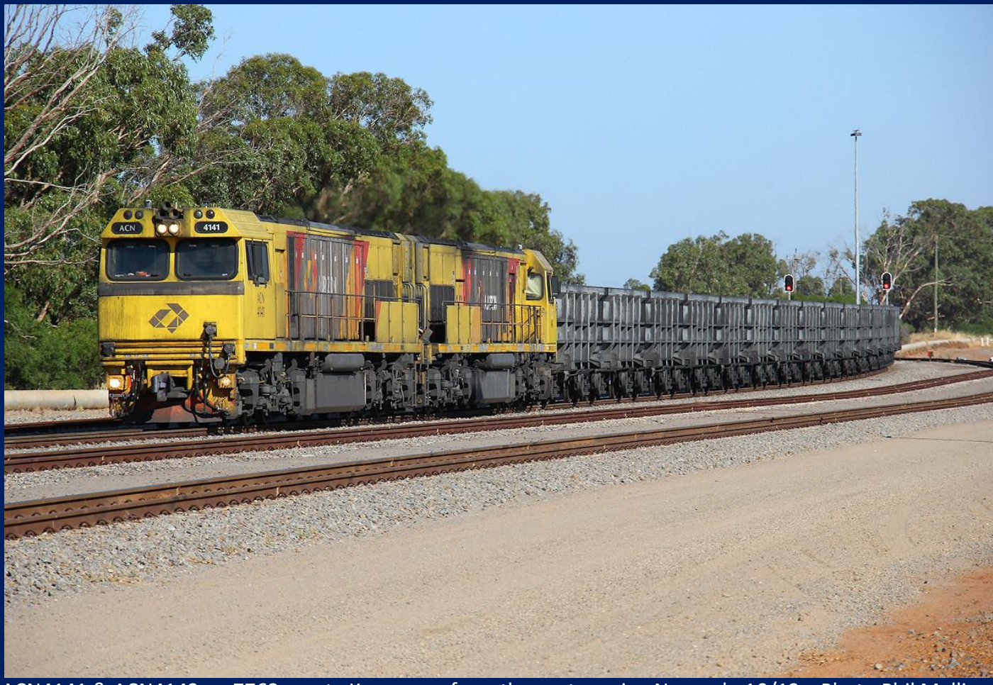
ACN4141 & ACN4143 on 7762 empty Karara ore from the port passing Narngulu 10/12.