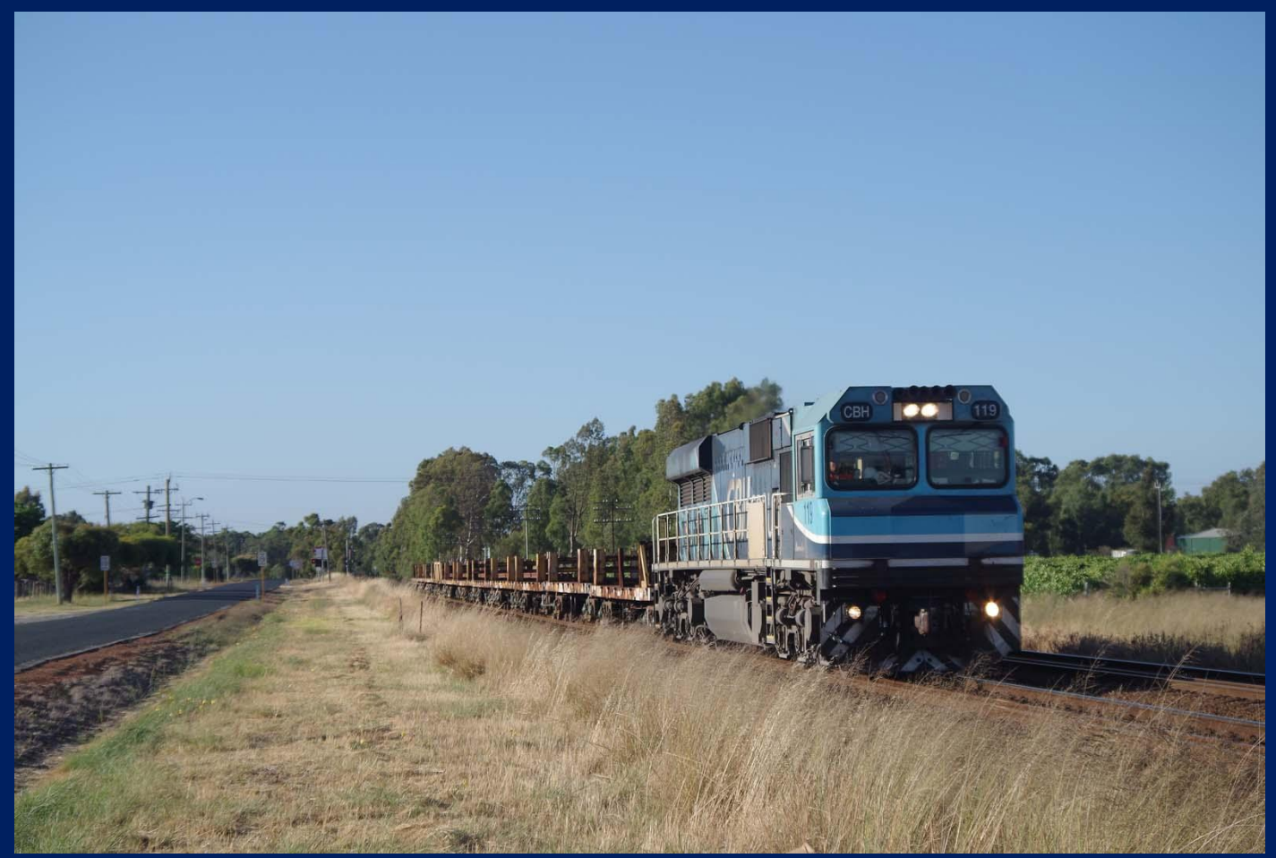
CBH119 on 5RT1 Watco rail train at Herne Hill December 8th.