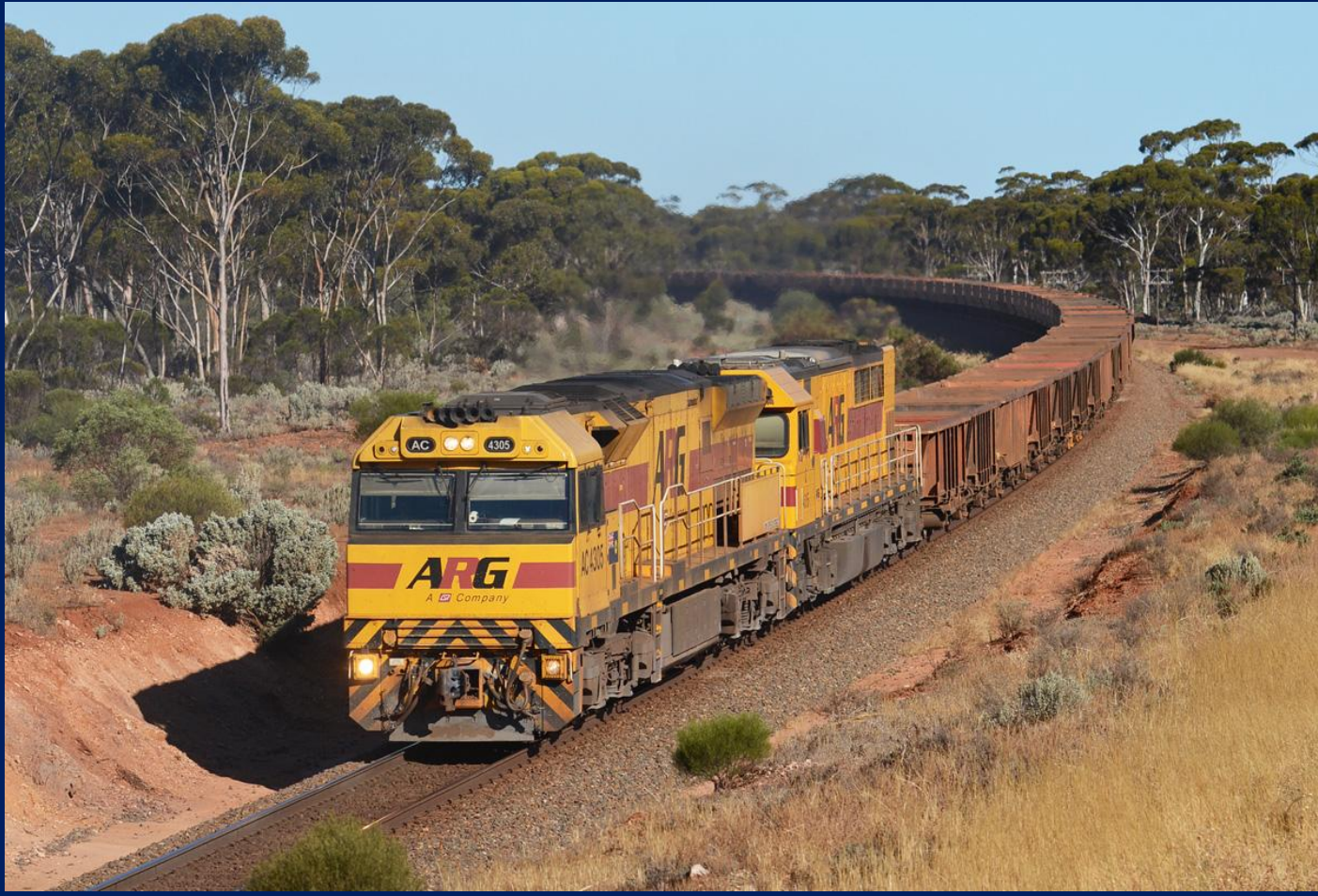
AC4305 & Q4015 on 3414 empty Portman ore with DPU Q4002 & ACC4031 at Beckwith 20/12.