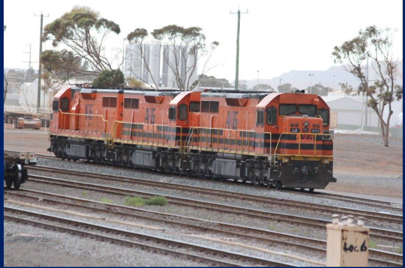
LZ3111, LZ3107 & LZ3114 in a thunder storm at West Kalgoorlie to work 5426 22/12.