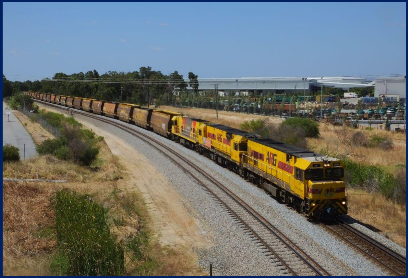
P2511, PA2819 & P2505 on 4304 empty woodchip wagon movement from Albany, South Guildford 28/12.