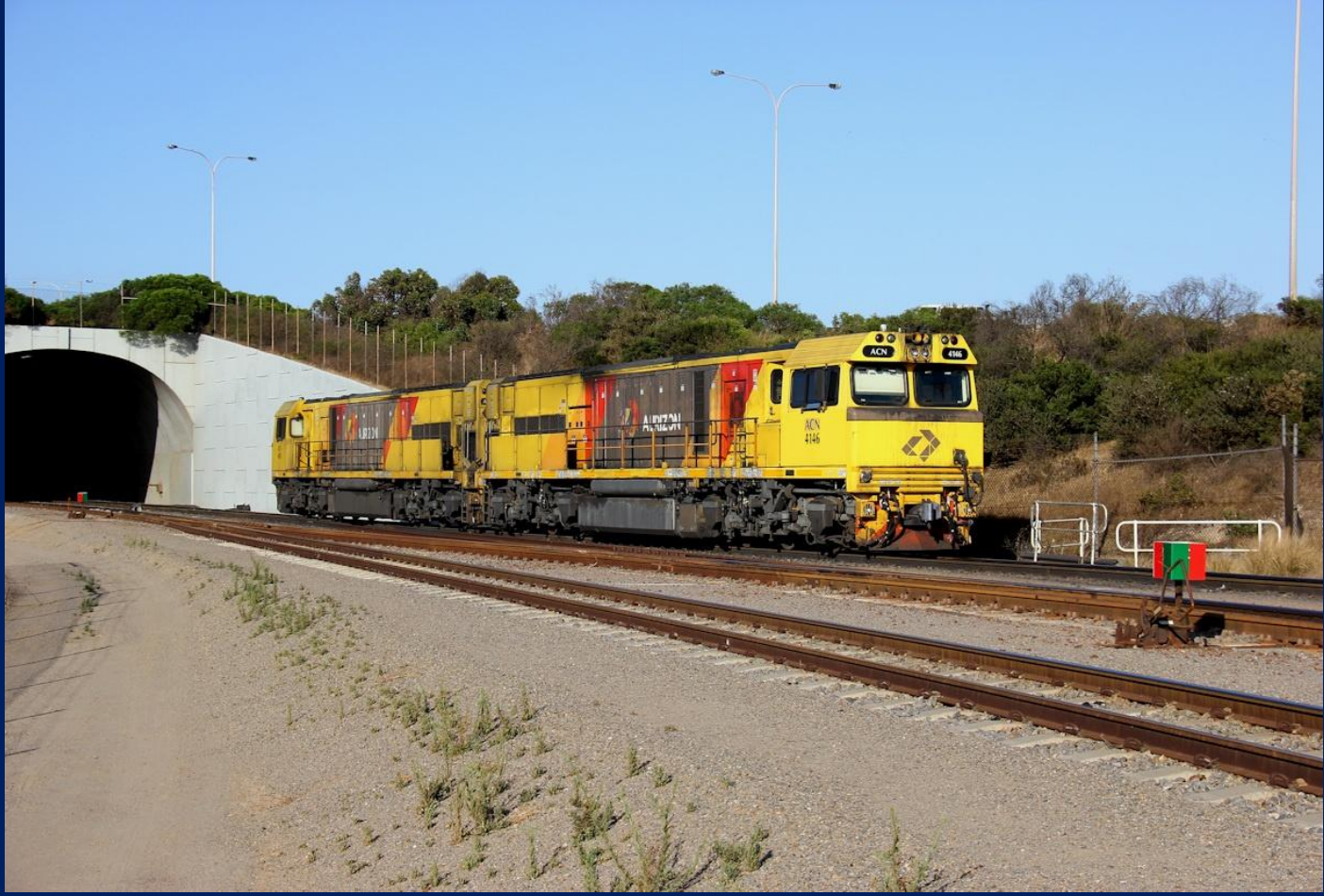
ACN4141 & ACN4146 running round their train Geraldton port as no DPU owing to failure December 10th.