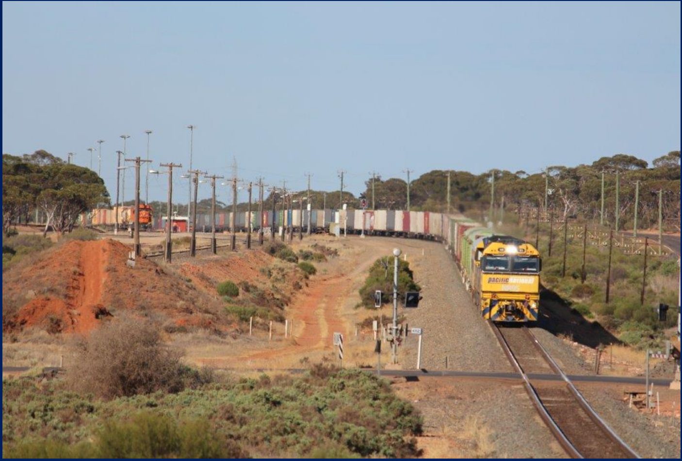
NR95 & NR7 on 6PS7 depart West Kalgoorlie with LZ3114 shunting east end 3/12.