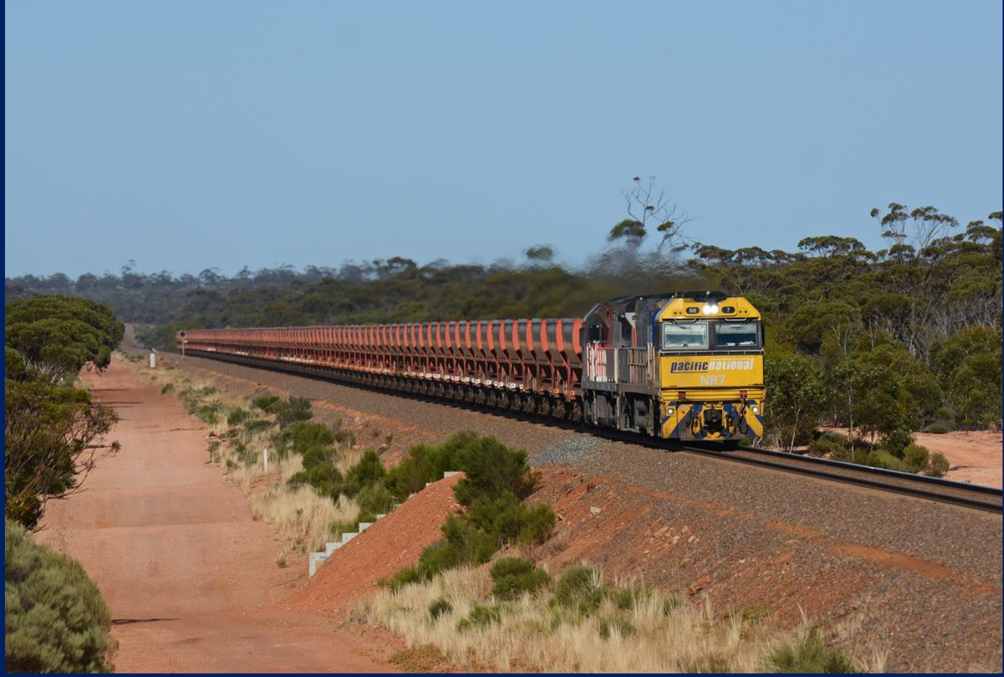
NR7 & MRL001 on 3035 empty Polaris ore KBT to Mt Walton near Darrine 21/12.