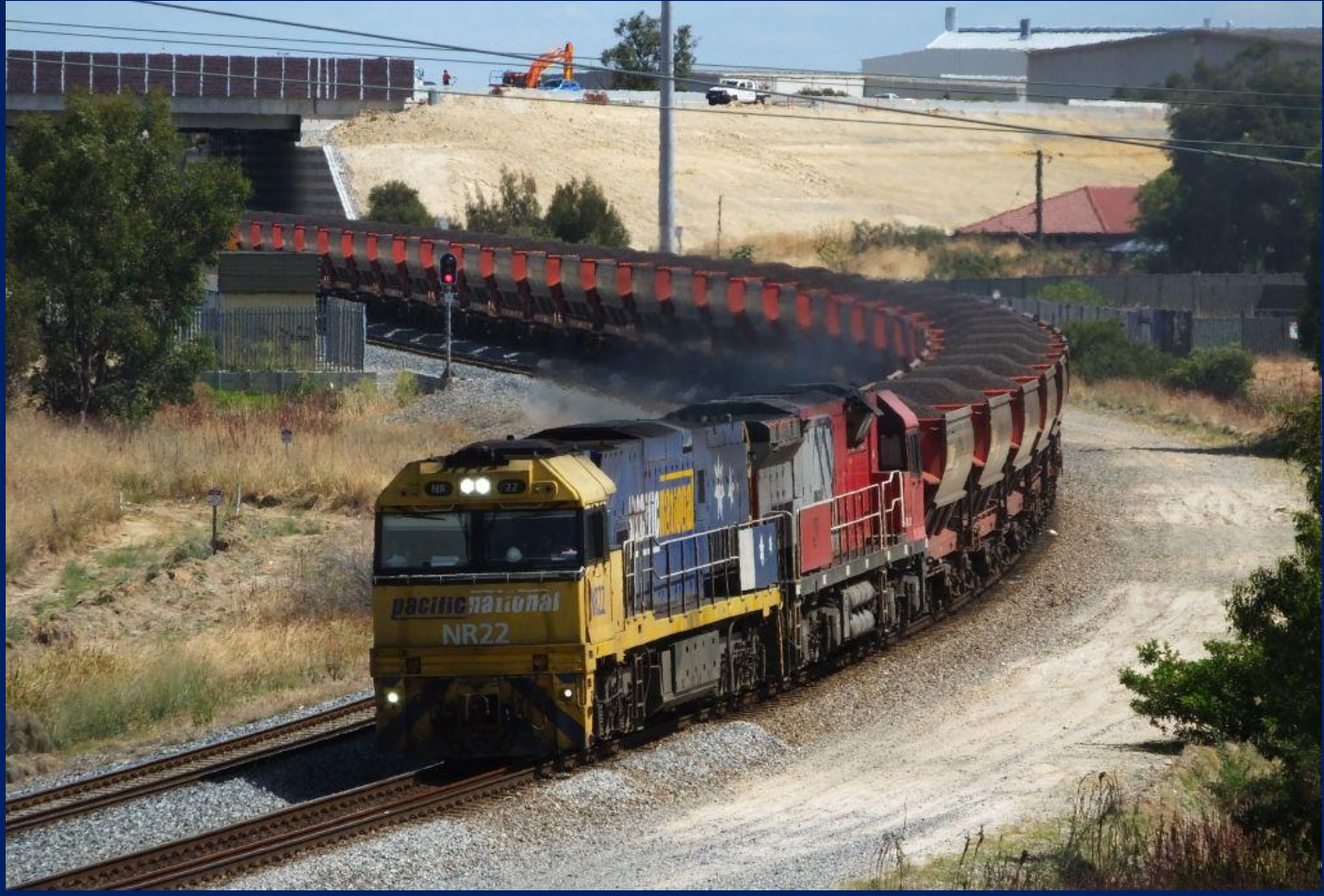
NR22 & MRL003 on 2034 Polaris ore Mt Walton to KBT at Wattle Grove December 13th.