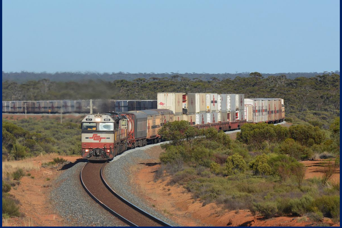
SCT003 & SCT008 on 3PG1 SCT Forrestfield Parkes freight at Beckwith 21/12. Photo