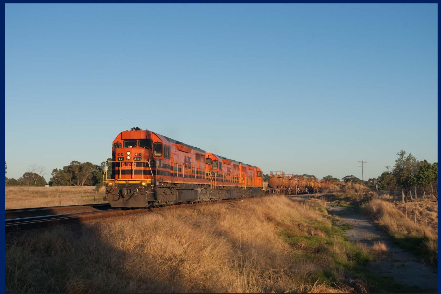
LZ3111, LZ3107 & LZ3114 on 5426 Kalgoorlie Forrestfield freight Middle Swan 23/12.