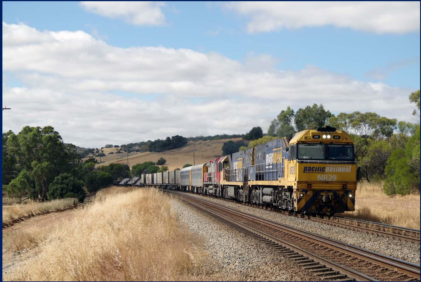
NR29, NR35 & MRL006 on 1MP2 combined steel intermodal Avon Yard 7/12.