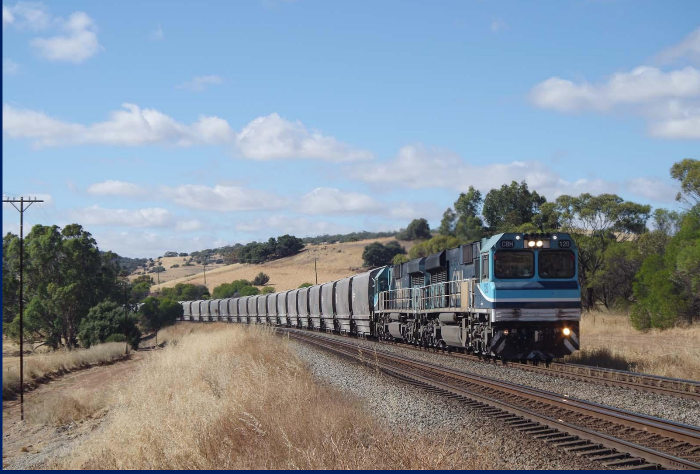
CBH120 & CBH118 on 4S54 Watco grain Avon Yard December 7th.