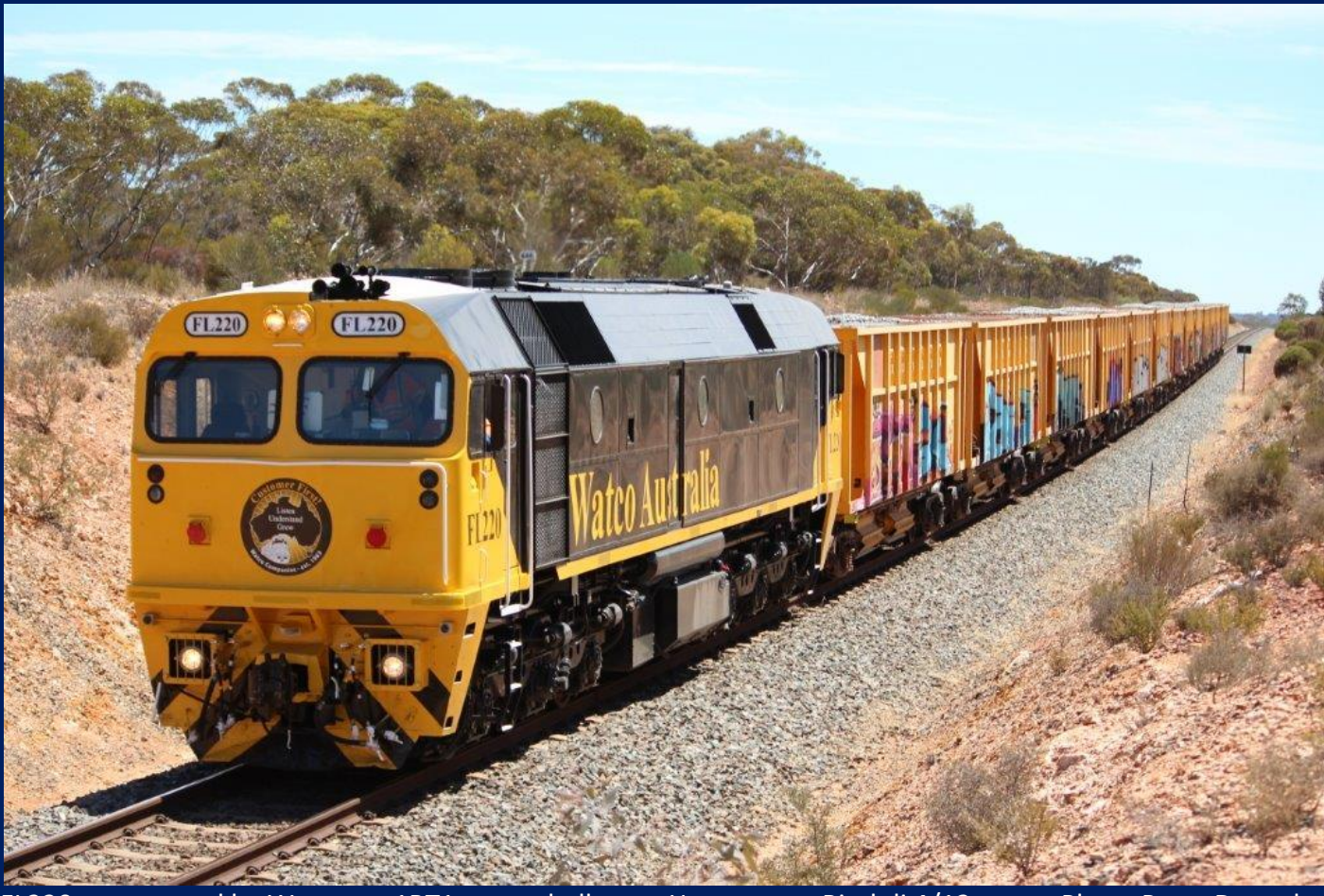
FL220 now owned by Watco on 1BT1 empty ballast to Hampton at Binduli 4/12. Ph