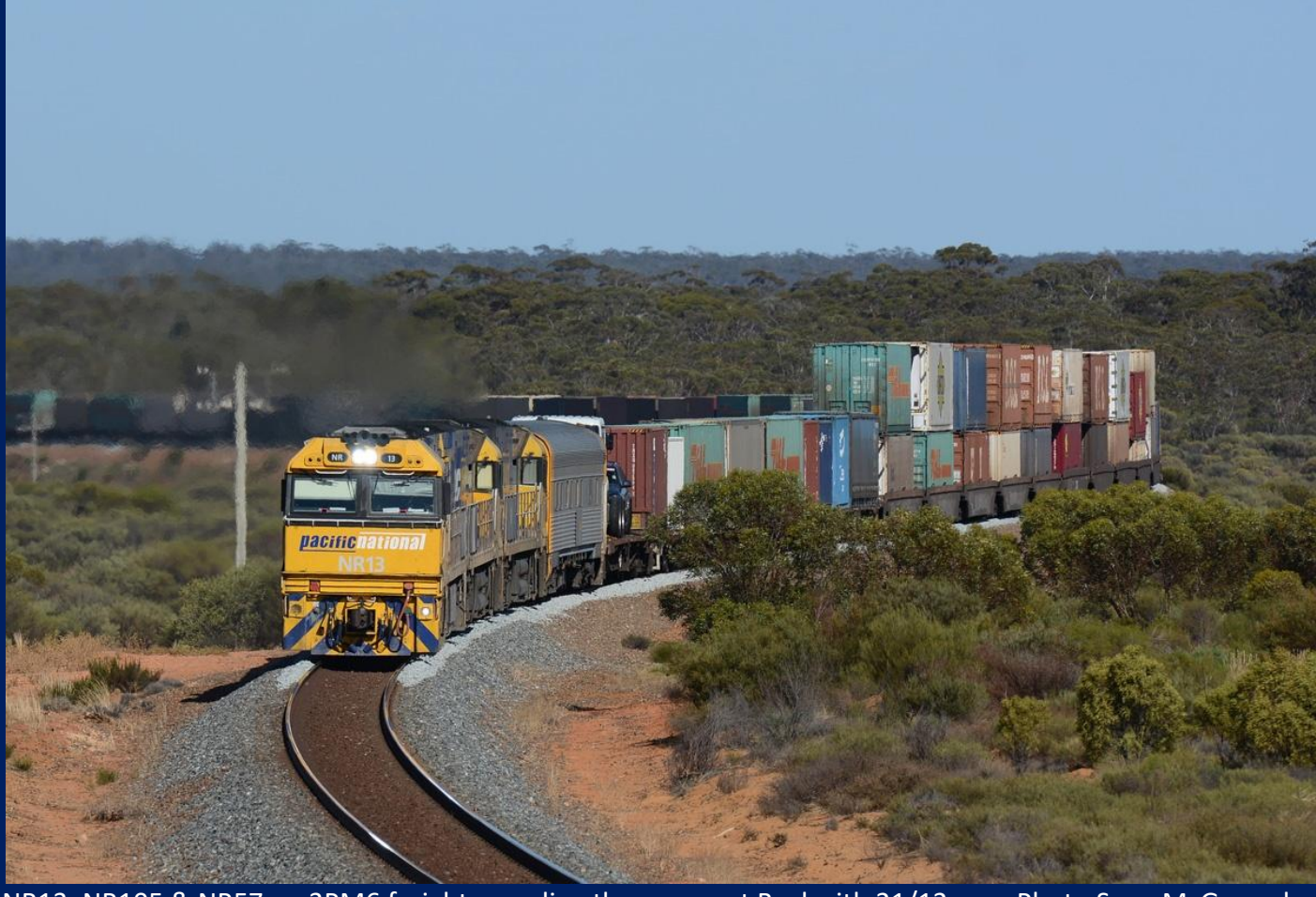
NR13, NR105 & NR57 on 3PM6 freight rounding the curves at Beckwith 21/12.