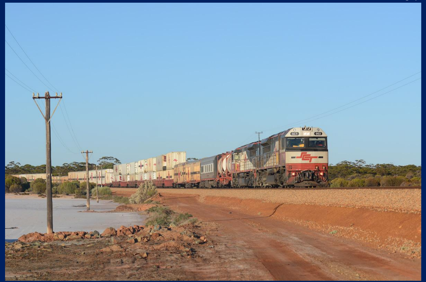
SCT003 & SCT008 on 3PG1 SCT Parkes freight Koolyanobbing December 21st.