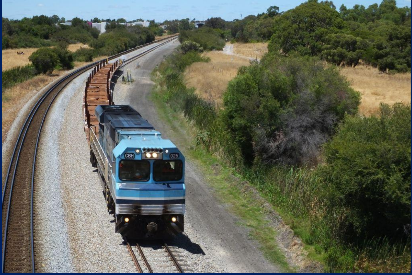
CBH025 on 7RT2 empty rail train Collie to Flashbutt at South Guildford December 31st.