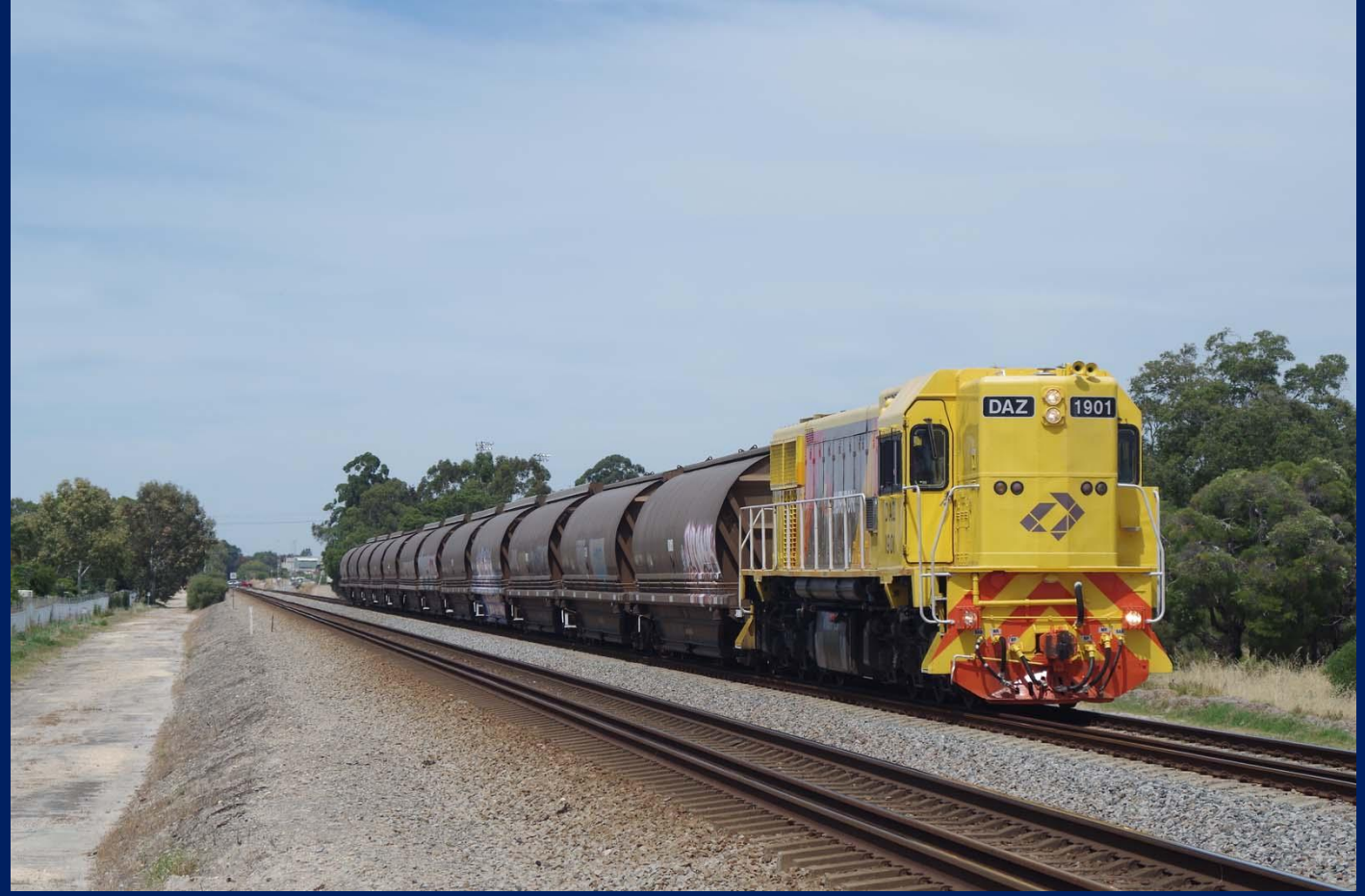
DAZ1901 on 5113 empty XT wagon movement t Thornlie December 12th.