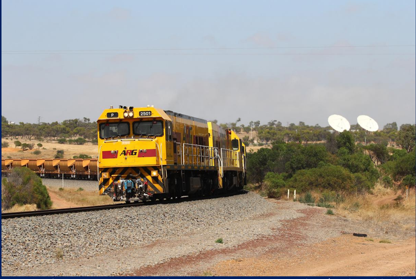
P2501, 2512 & P2517 on 7720 empty Mt Gibson ore to Perenjori, Moonyoonooka 24/12.