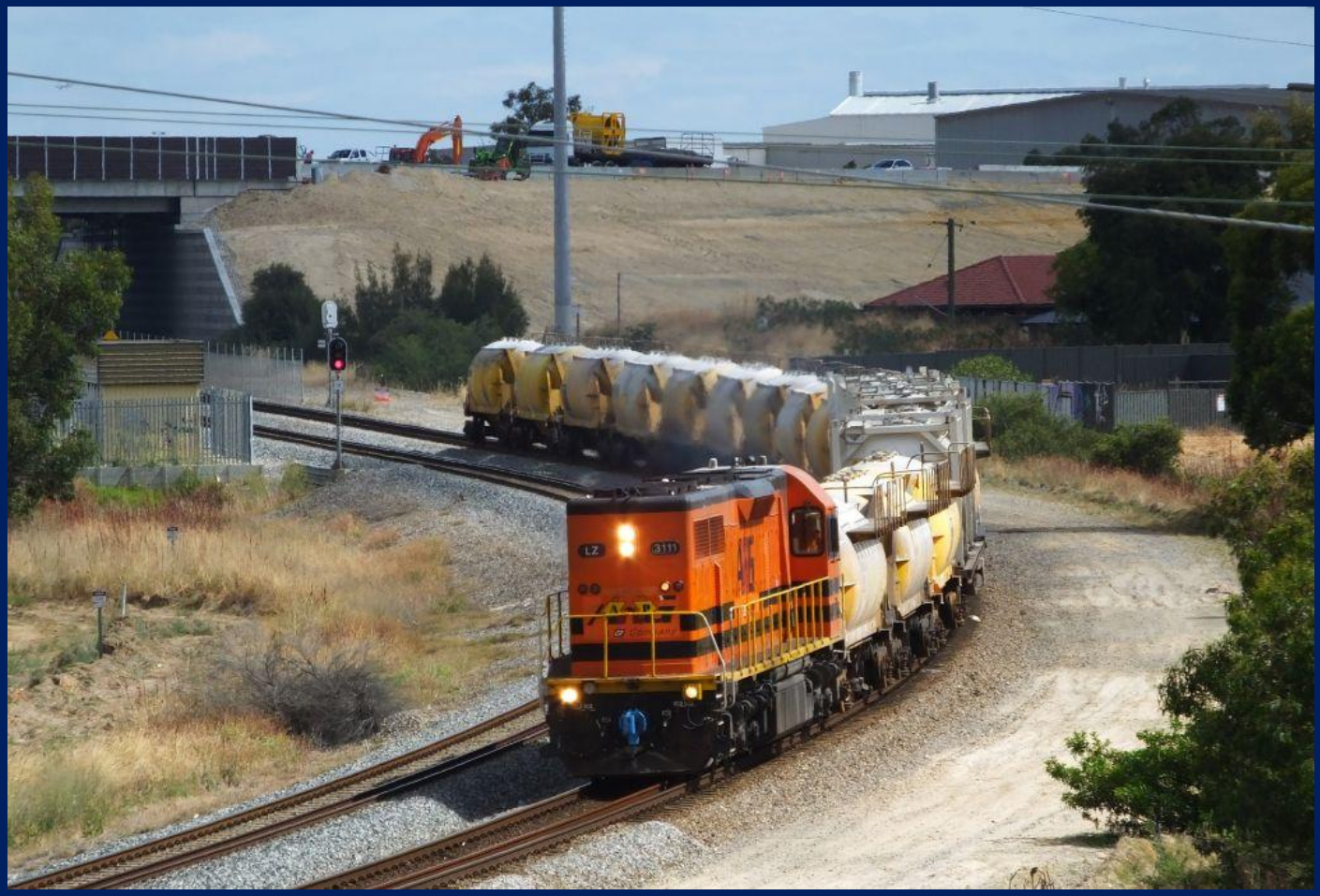
LZ3111 returning to service after repair on 3194 Soundcem shunter Wattle Grove 13/12.