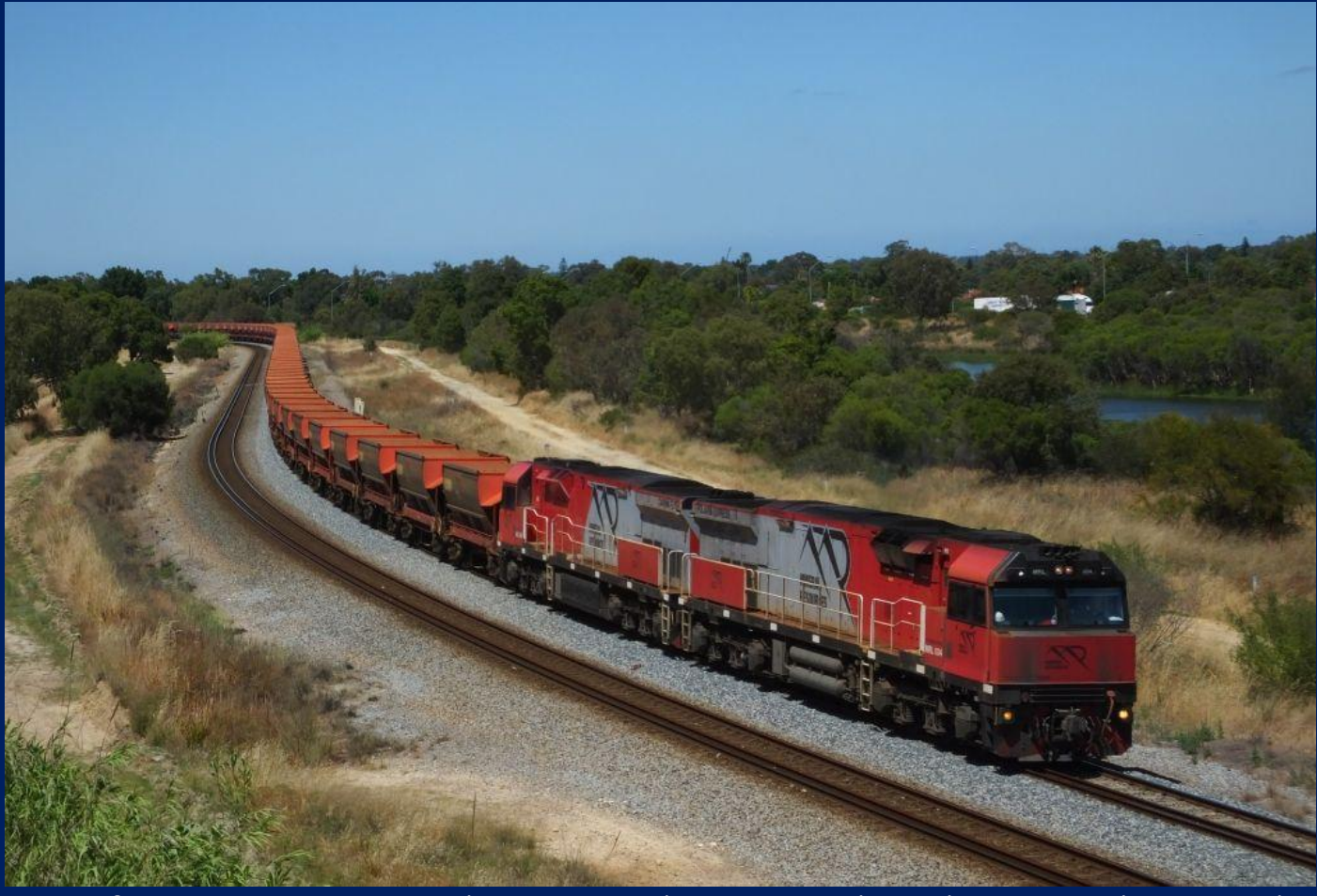
MRL004 & MRL005 on 3033 empty Polaris ore at Wattle Grove December 13th.