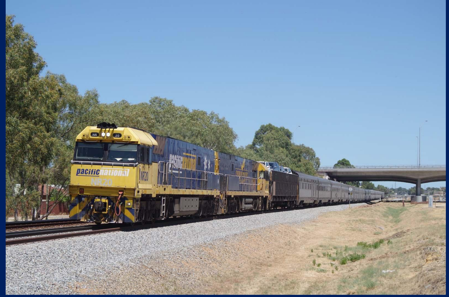
NR20 & NR25 on 1PA8 Indian Pacific with two locomotives at Bellevue December 25th.