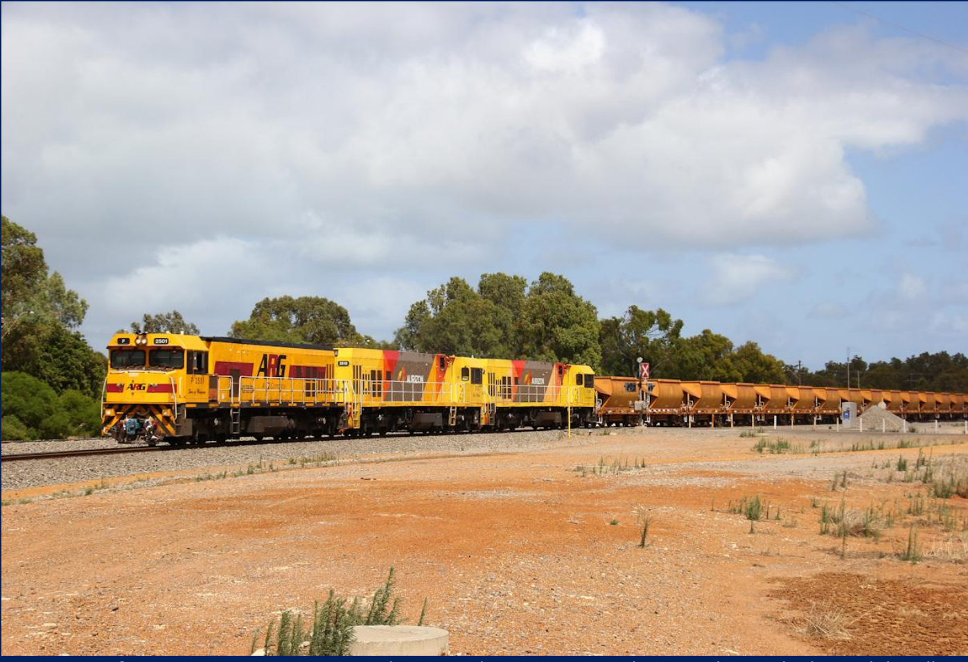
P2501, 2512 & P2517 on 3720 empty Mt Gibson ore departing Narngulu December 27th.