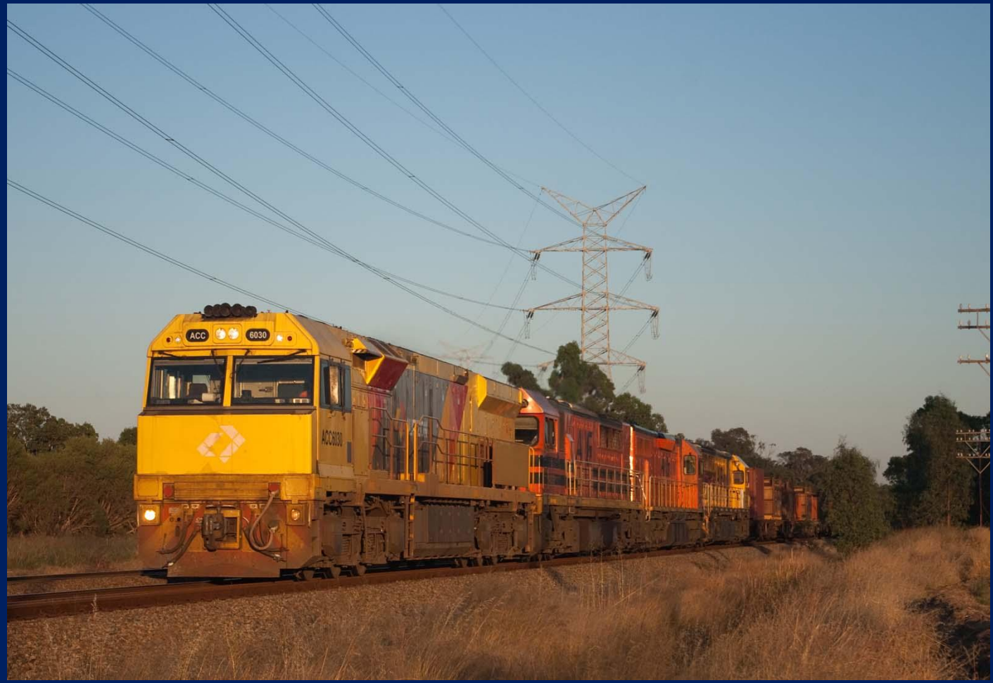
ACC6030, Q4004, LZ3109 & Q4019 on 6426 freight ex Kalgoorlie at Middle Swan 14/12.