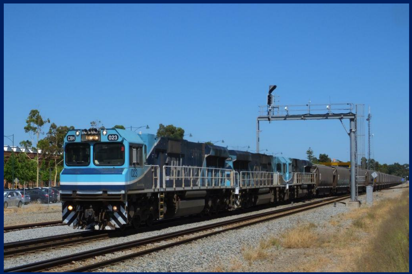
CBH023, CBH005 & CBH024 on 5K65 empty Watco grain crossing over from down to up main Midland 8/12.