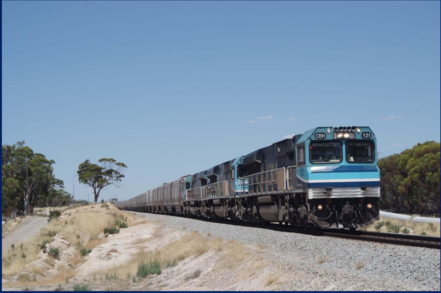
CBH121, CBH118 & CBH119 on 2S58 Watco grain Grass Valley December 26th.