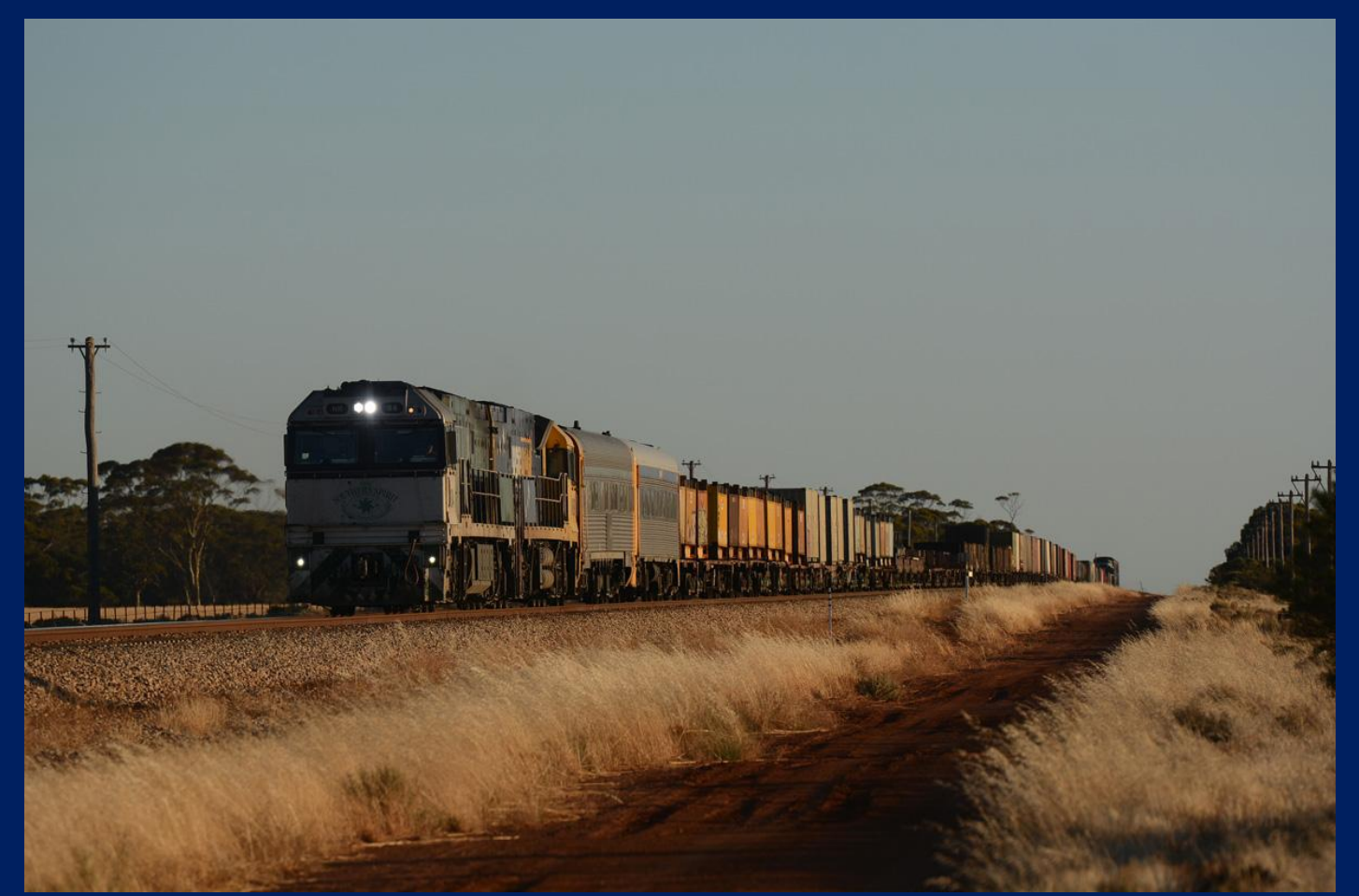
NR84 & NR98 on 1MP2 combined steel intermodal Lake Julia December 21st.