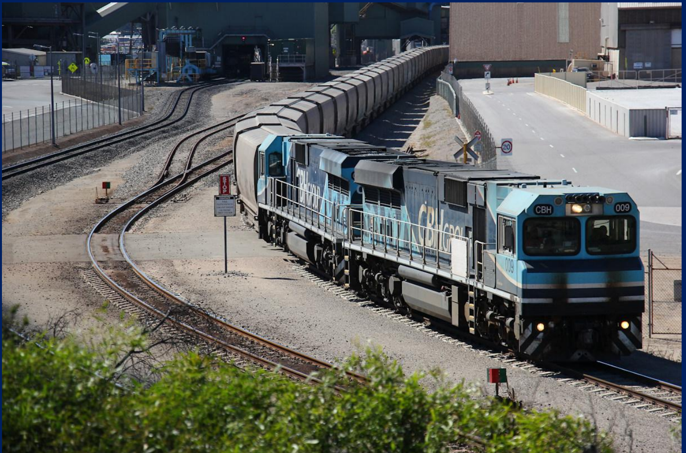
CBH009 & CBH006 on 1G50 empty Watco grain leaving Geraldton Port for Mingenew 9/4.