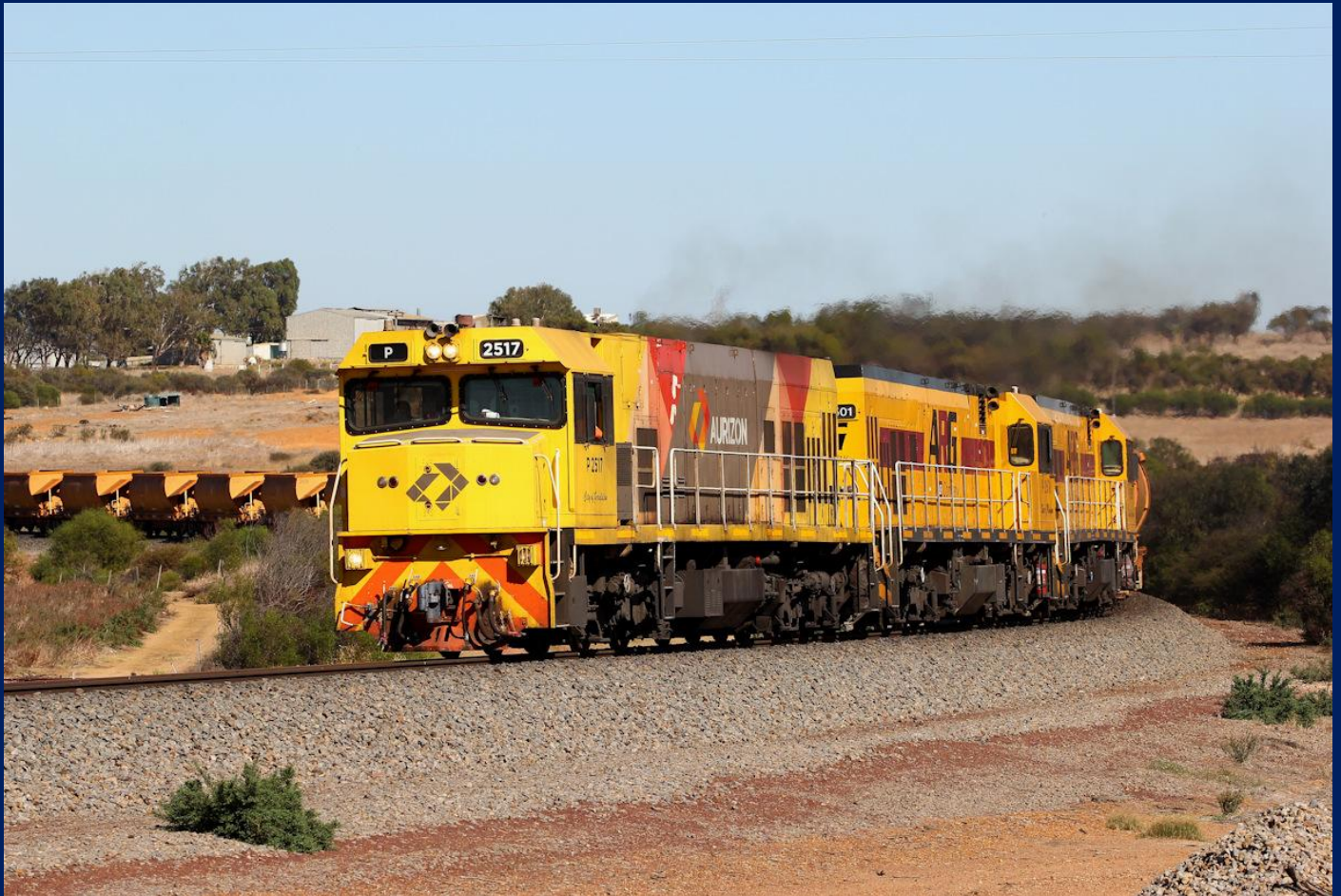
P2517, P2508 & P2501 on 3720 empty Mt Gibson ore Moonyoonooka April 25th.