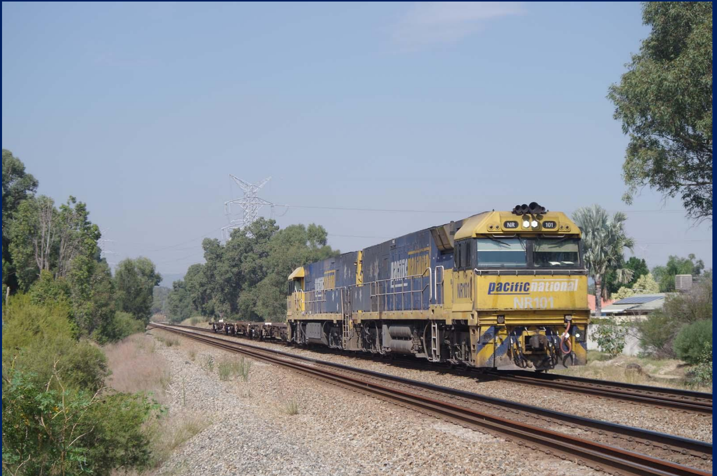
NR101 & NR51 on 5P15 to Jumperkine to recover damaged 4xpack wagon 6/4.