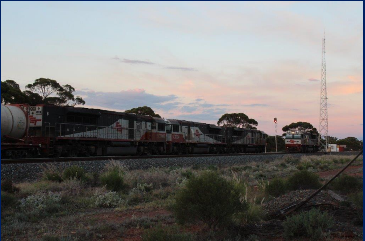
SCT012, SCT004 failed SCT008 on 6PM9 with SCT009 in loop Bonnie Vale 22/4.