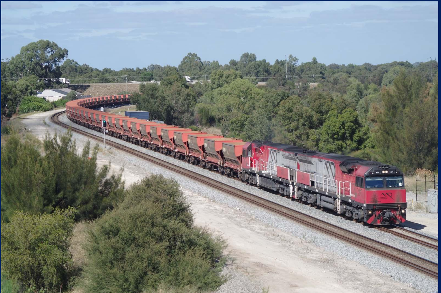
MRL001 & MRL005 on 4033 empty Polaris ore to Mt Walton Welshpool April 12th.