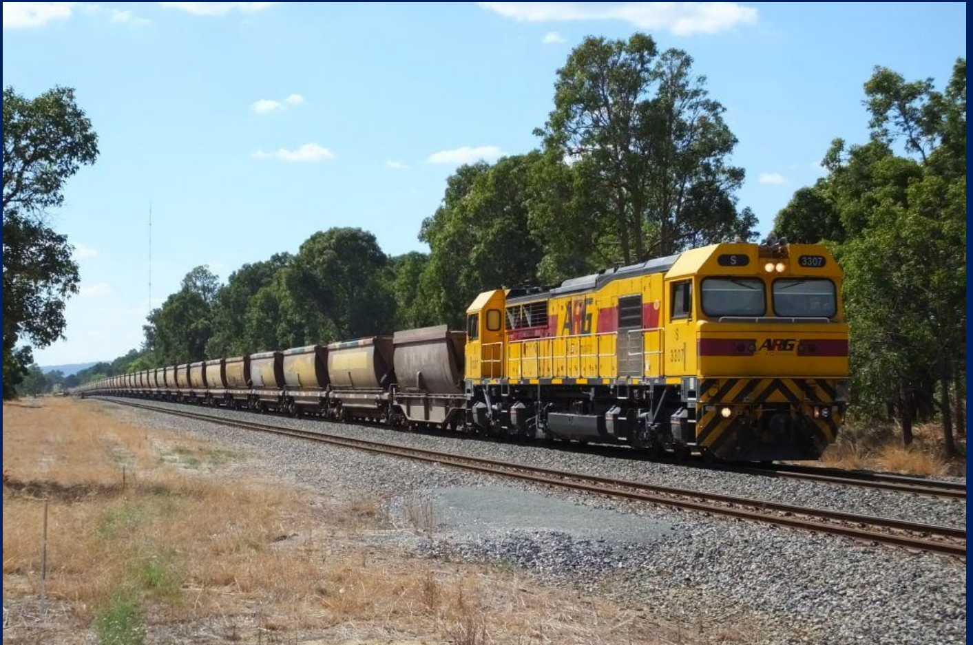
S3307 on 5943 empty bauxite to Calcine Pinjarra at Mundijong April 20th.