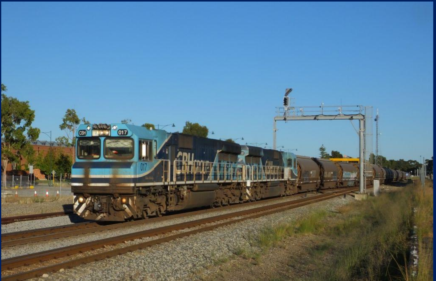
CBH017 & CBH002 on 1K05 empty Watco grain April 2nd crossing from down to up main at Midland owing to points issues that caused all down trains to cross over mains then cross back over.