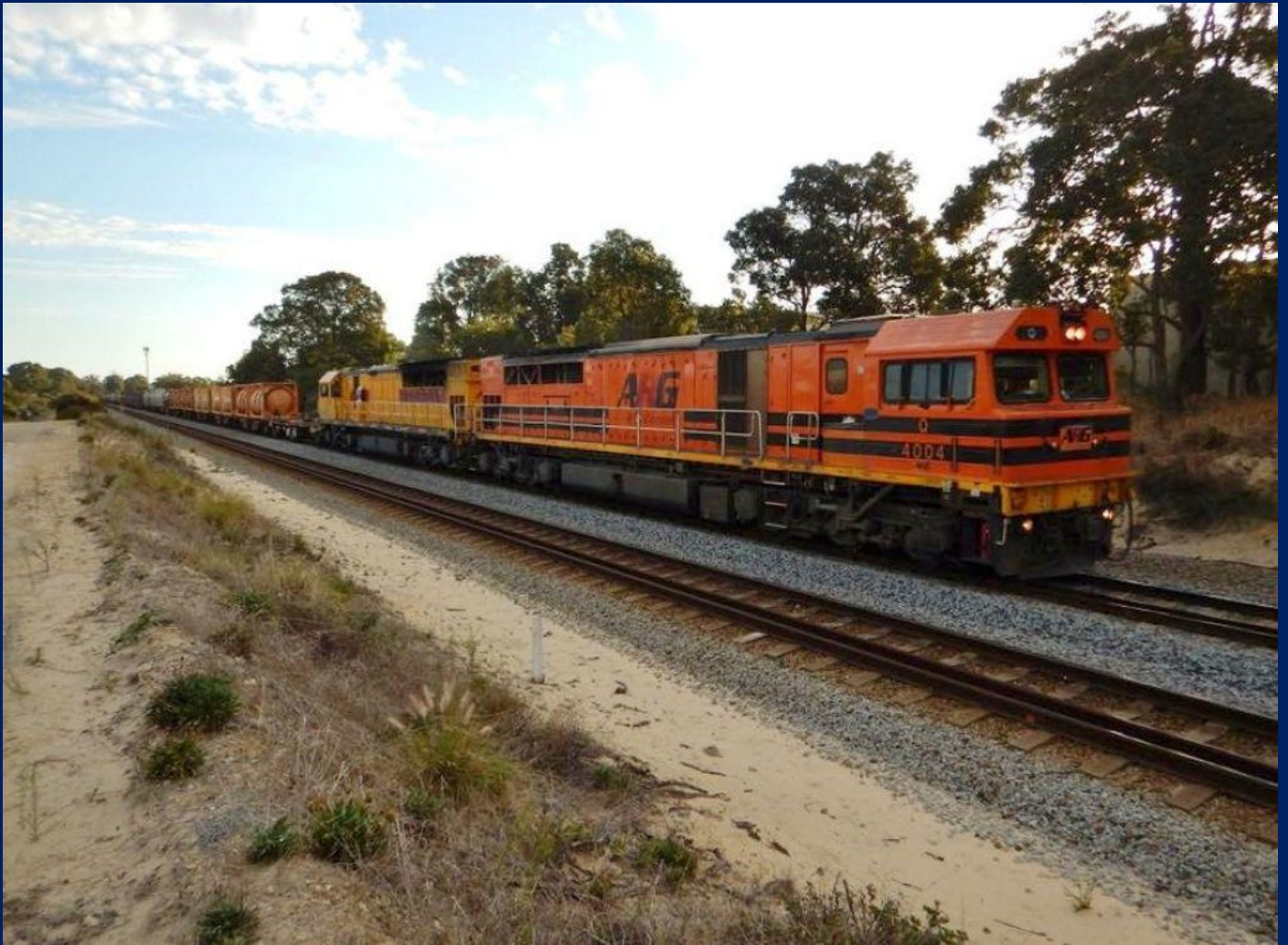
Q4004 & Q4013 on 6025 Kwinana to Forrestfield shunter at Yangebup April 14th.