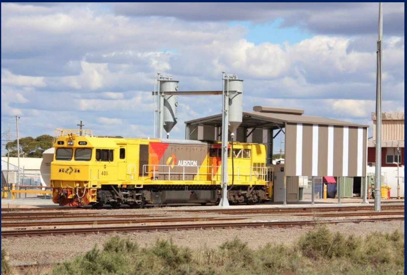
Q4011 under new sanding tower at West Kalgoorlie April 25th.