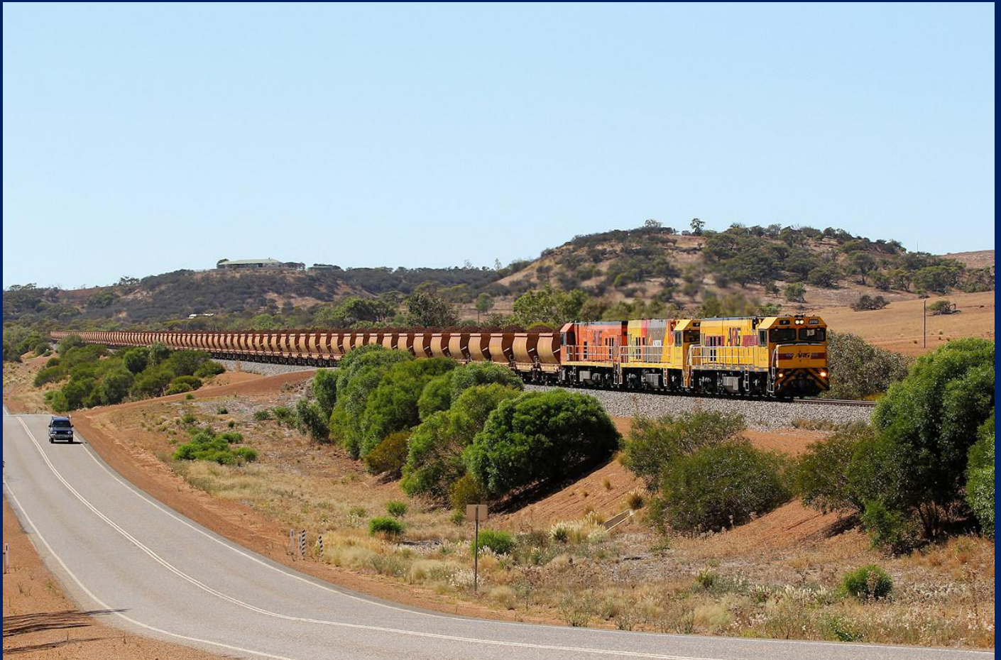
P2502, P2506 & P2509 on 1721 Mt Gibson ore to Geraldton Port at Bringo 9/4.