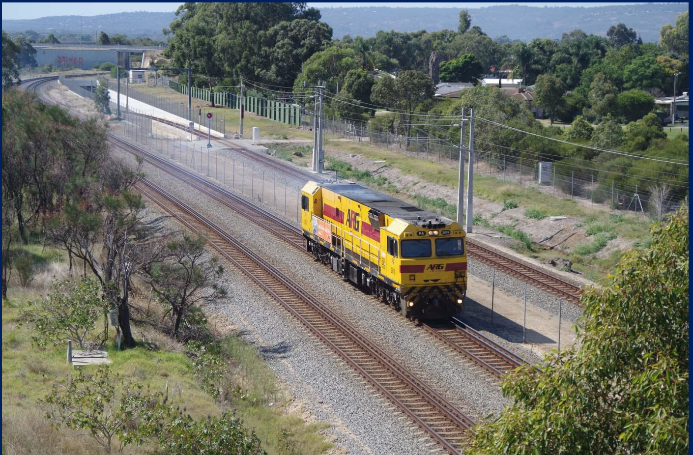
PA2819 on 1120 light engine Forrestfield to Kwinana at Kenwick April 9th.