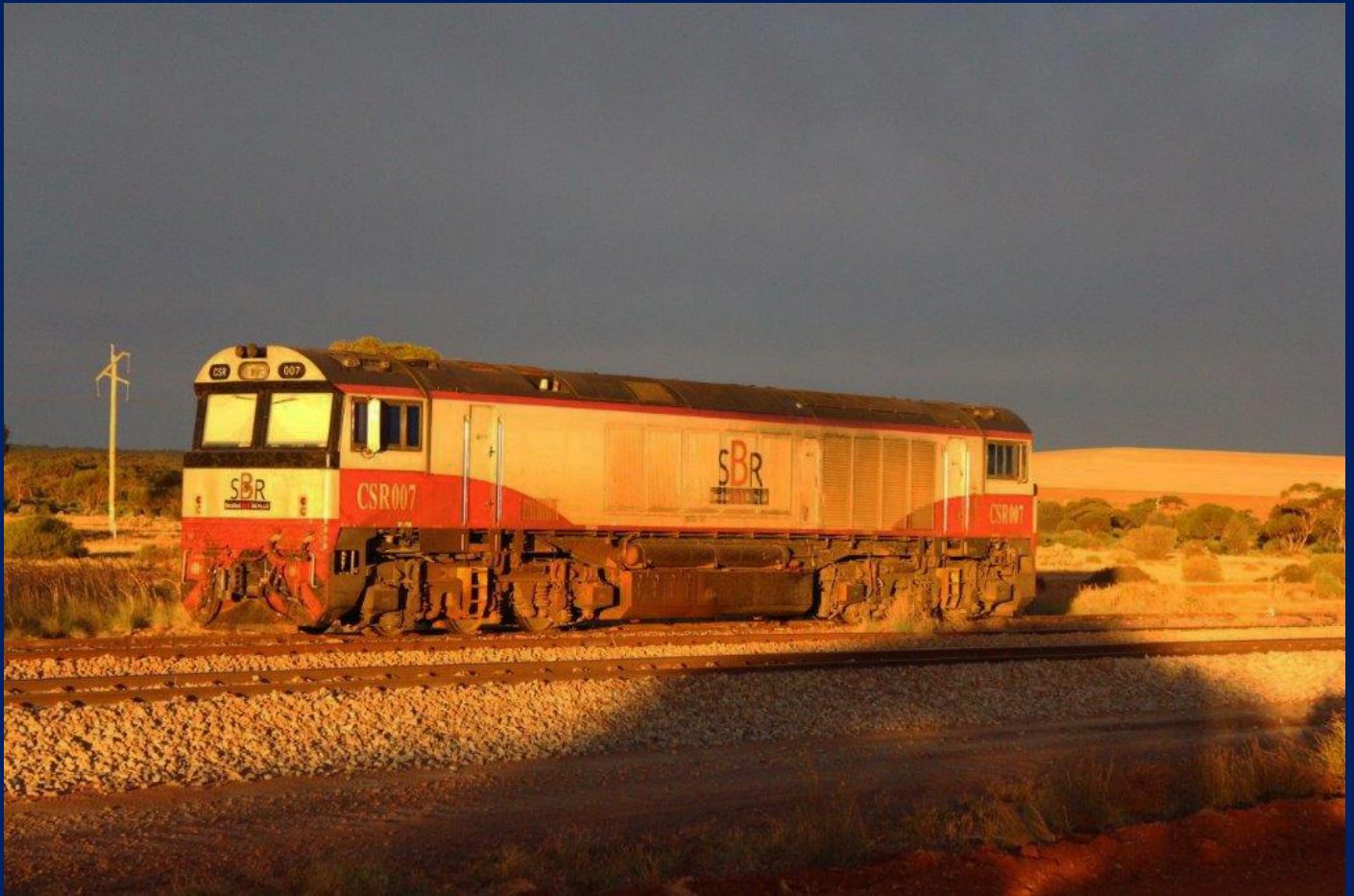
CSR007 stabled in engineers siding Parkeston 23/4 to be attached 1PM9 eastbound.