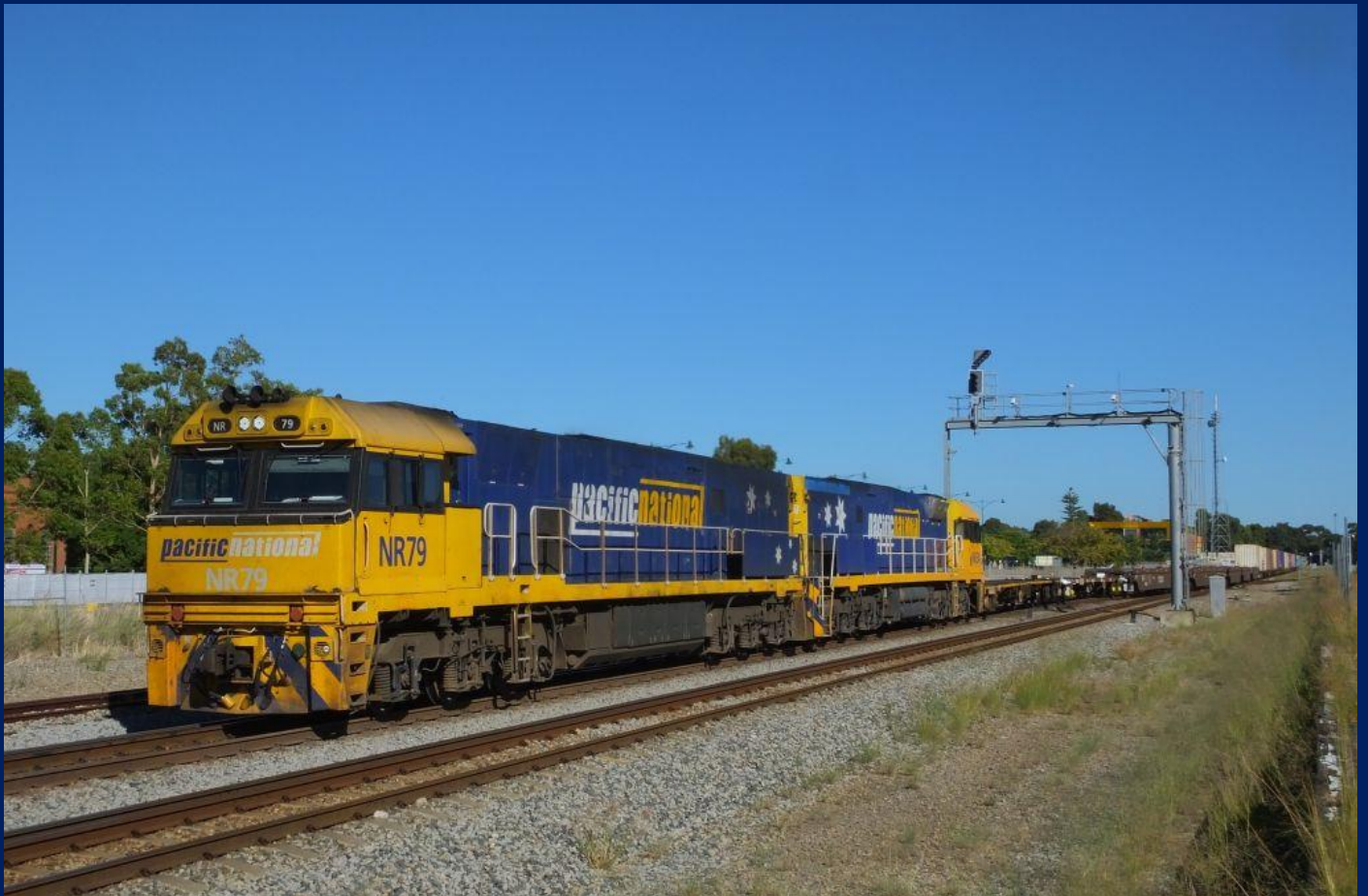
NR79 & NR34 on 1PS6 intermodal crossing over from down to up main Midland April 2nd.