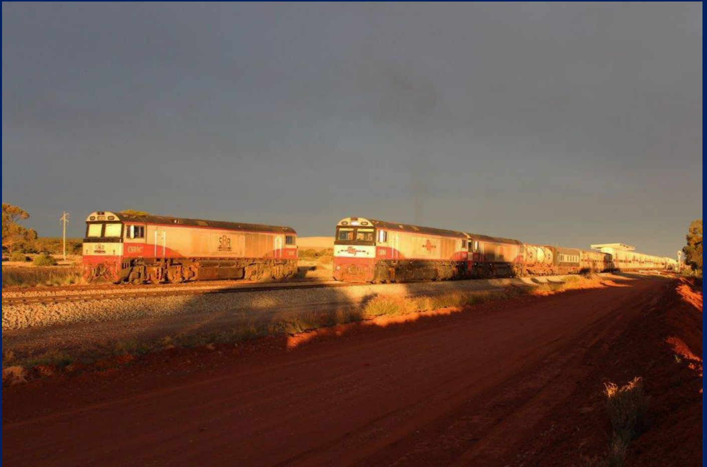
CSR004 & CSR010 on 6MP9 passing CSR007 stabled at Parkeston April 23rd.