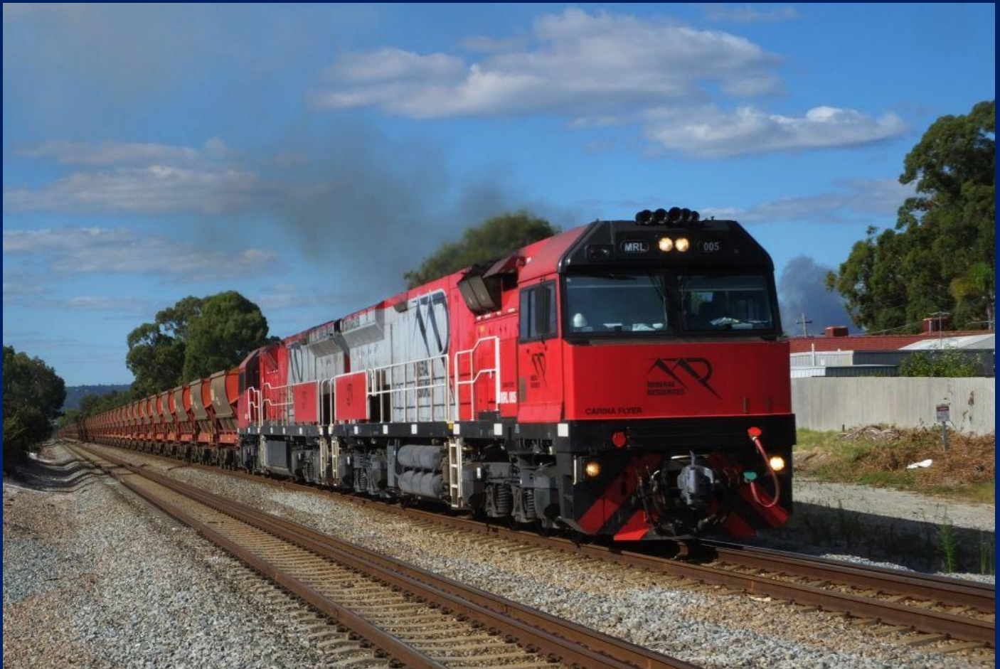
MRL005 & MRL003 on 6030 Polaris ore at Thornlie April 7th.