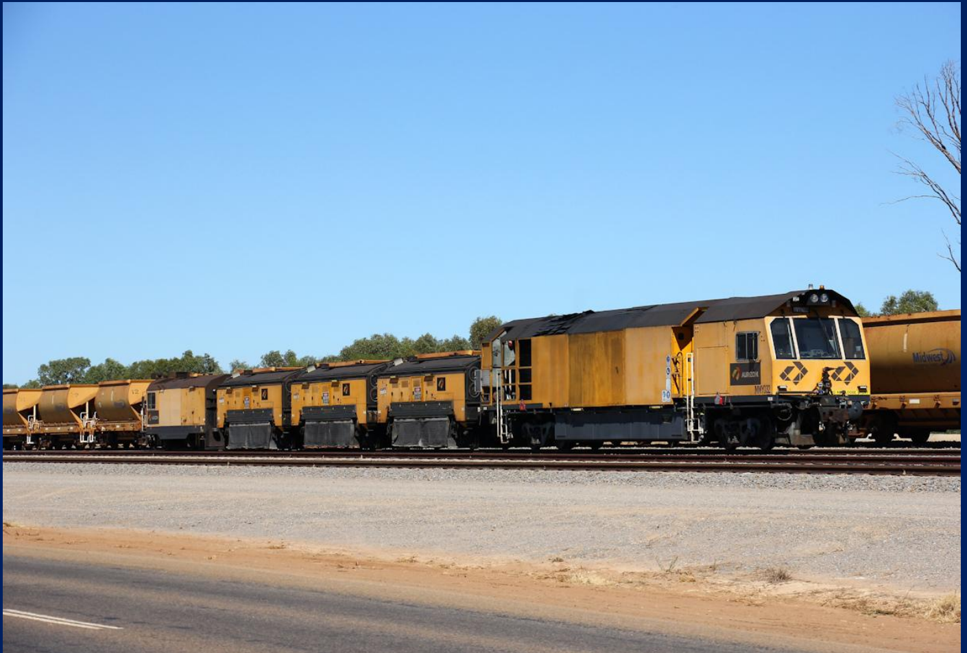
MMY032 Aurizon rail grinder arrives at Narngulu yard April 26th.