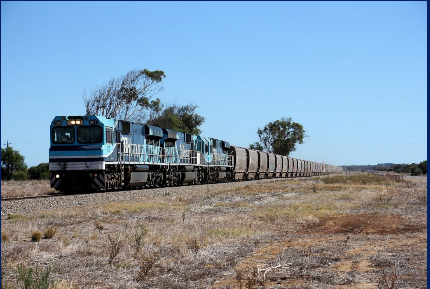
CBH007, CBH006 & CBH009 on 2G50 empty Watco grain Georgina April 24th.