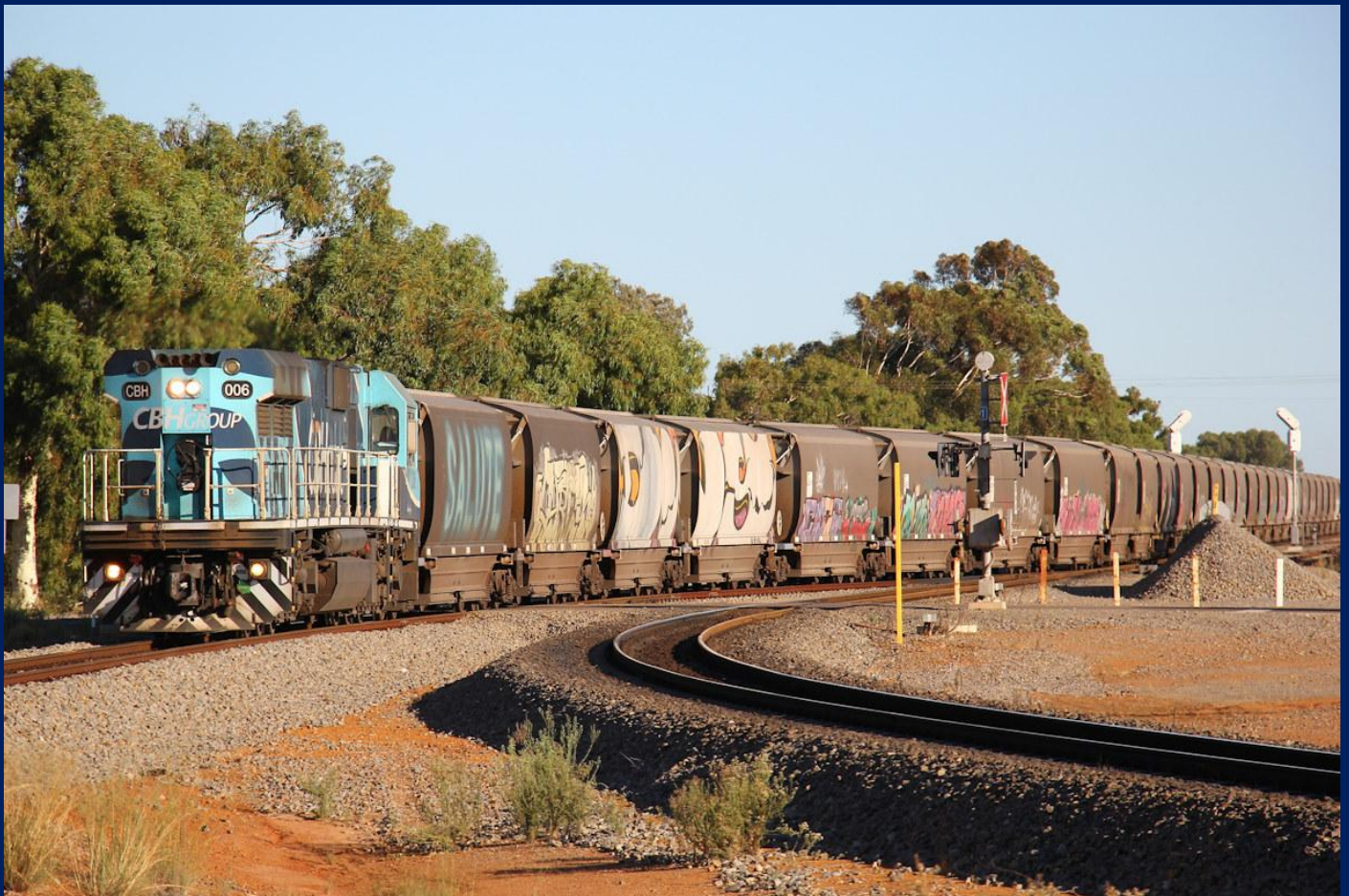
CBH006 rare single unit on 5G52 empty Watco grain to Mingenew leaving Narngulu 5/4.