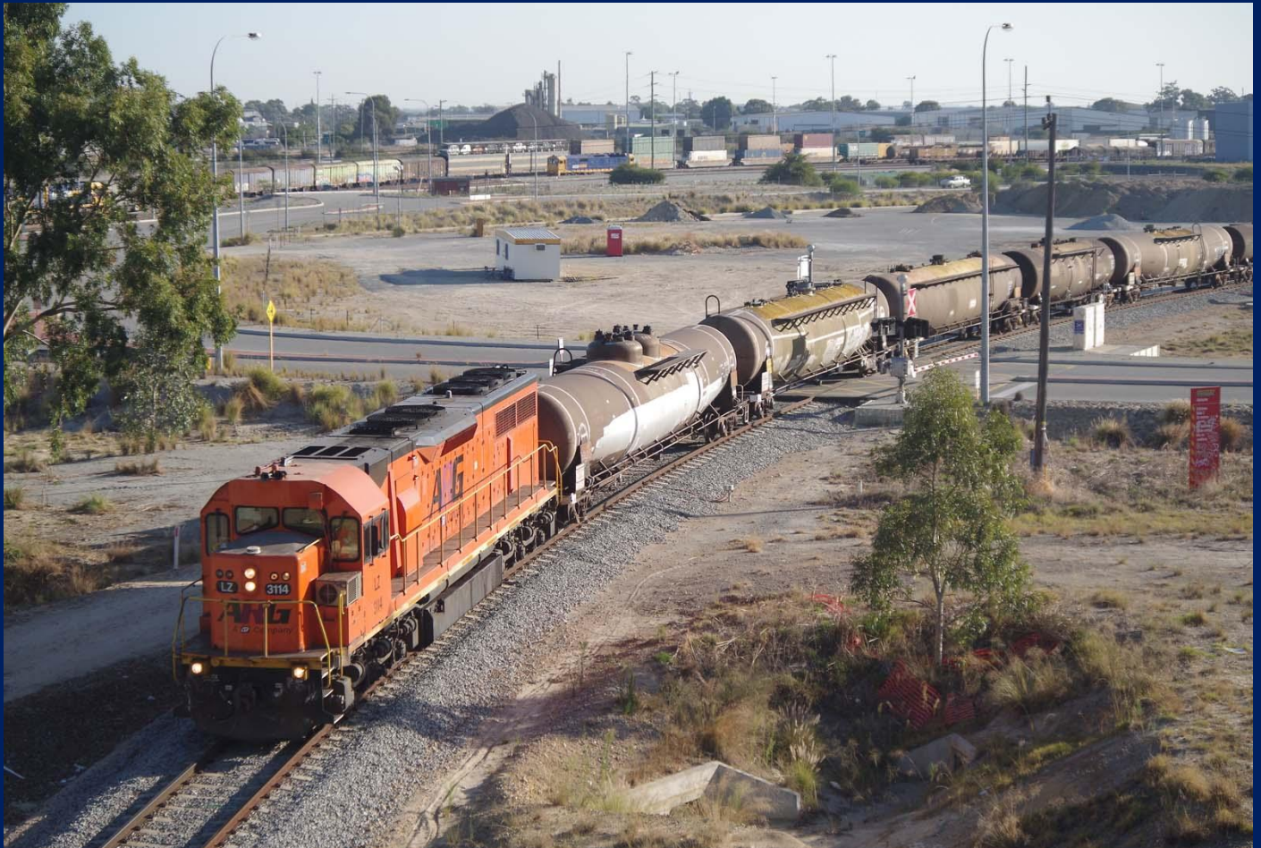
LZ3114 on 5SG4 fuel tankers from BP terminal Kewdale to Forrestfield April 13th.