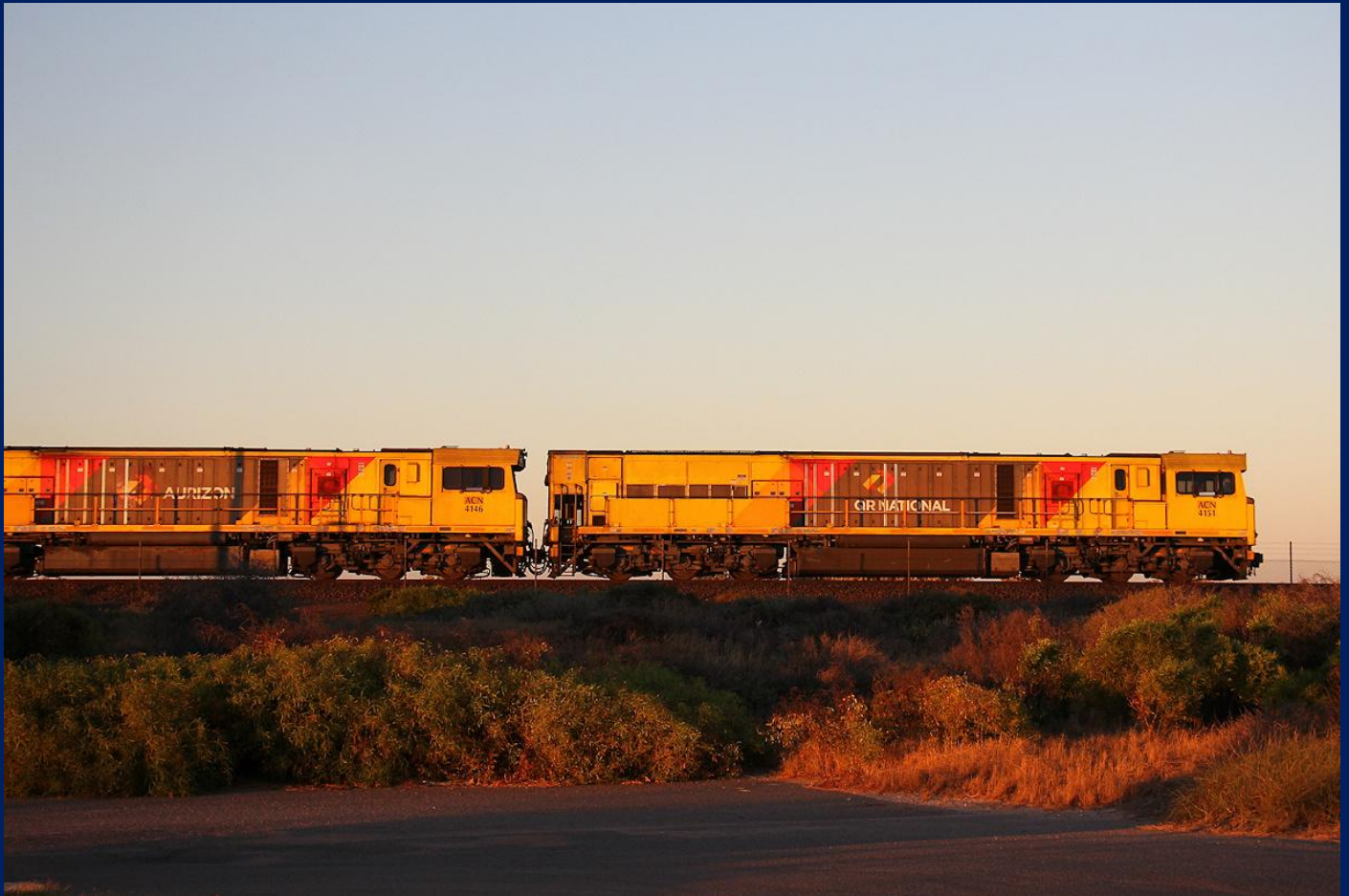
ACN4151 & ACN4146 on Karara ore at sunrise West End Geraldton on April 29th.