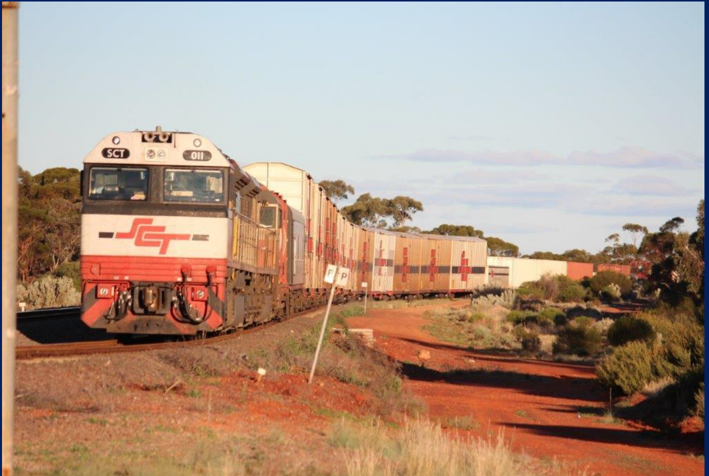
SCT011 & SCT010 on 7GP1 stabled Golden Ridge as is line closure at Kellerberrin 24/4.