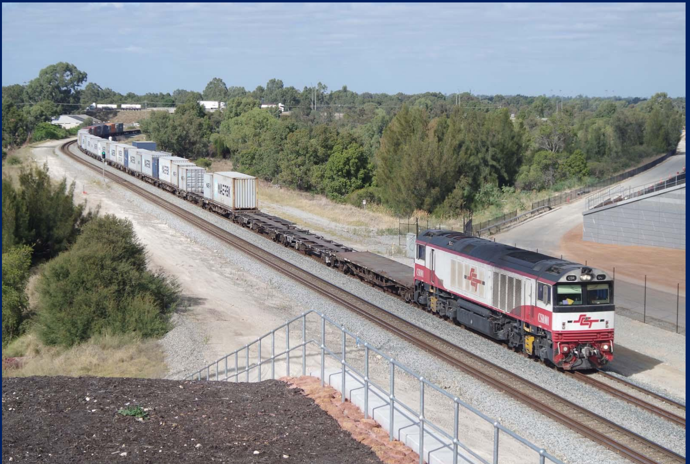
CSR001 on 4141 late ILS port shuttle at Welshpool April 12th.