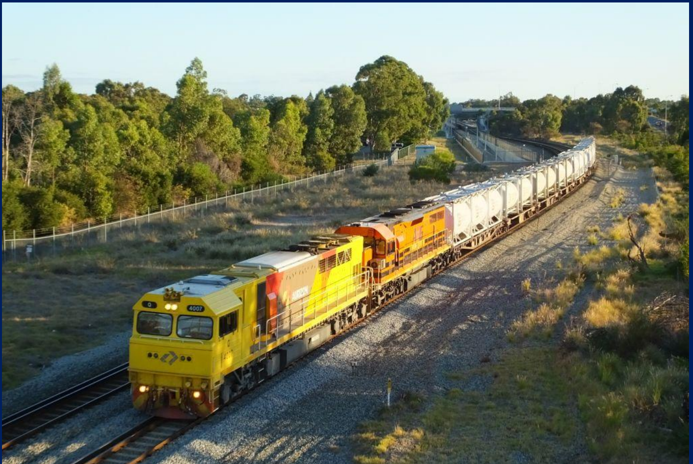
Q4007 & failed dead attached LZ3111 on 1197 Soundcem shunter Kenwick April 30th.