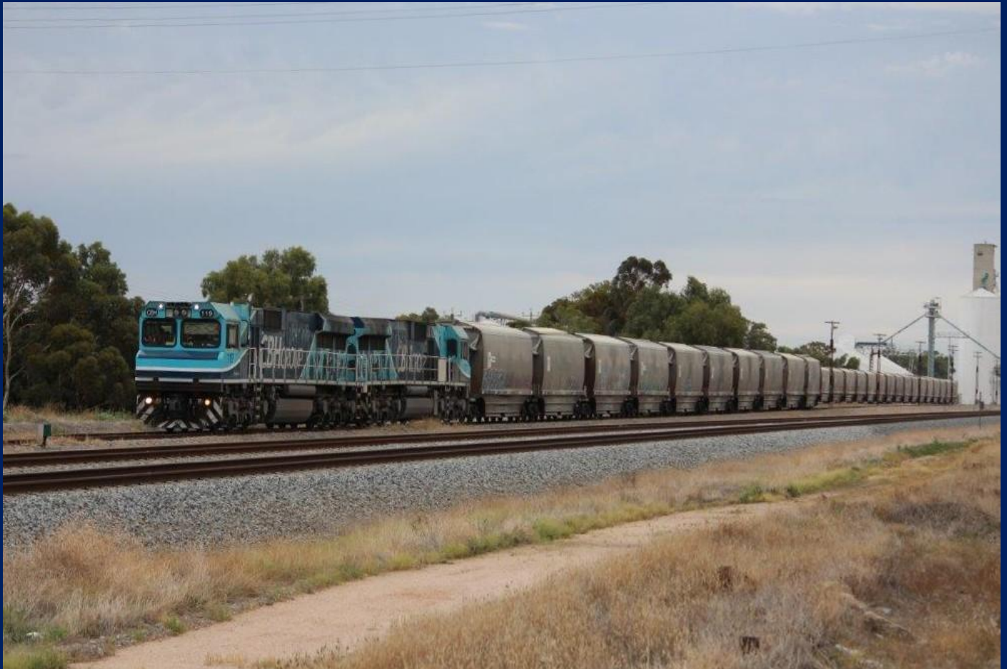
CBH119 & CBH121 on 6S56 Watco grain loading at Kellerberrin April 14th.