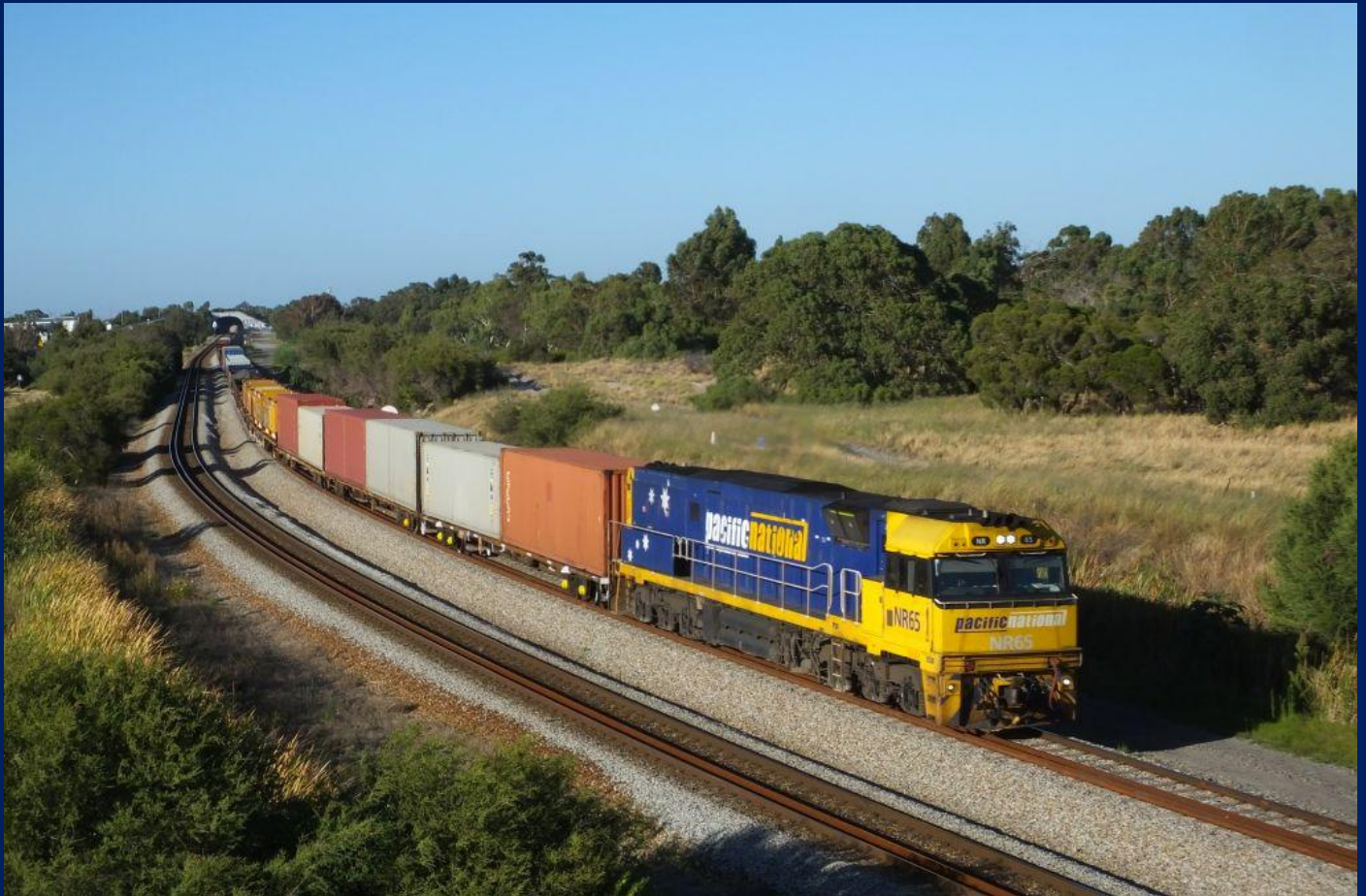
NR65 on 7PX4 empty steel passing Perth Airport boundary South Guildford April 1st.