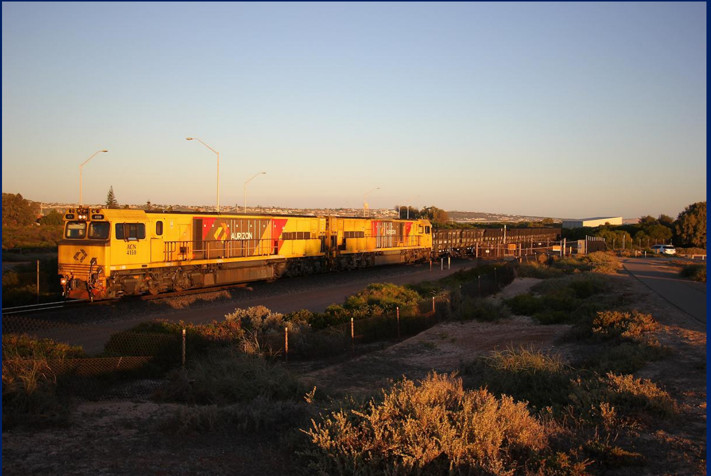
ACN4150 & ACN4142 on 1763 Karara ore to the port unloaders Beachlands April 1st.