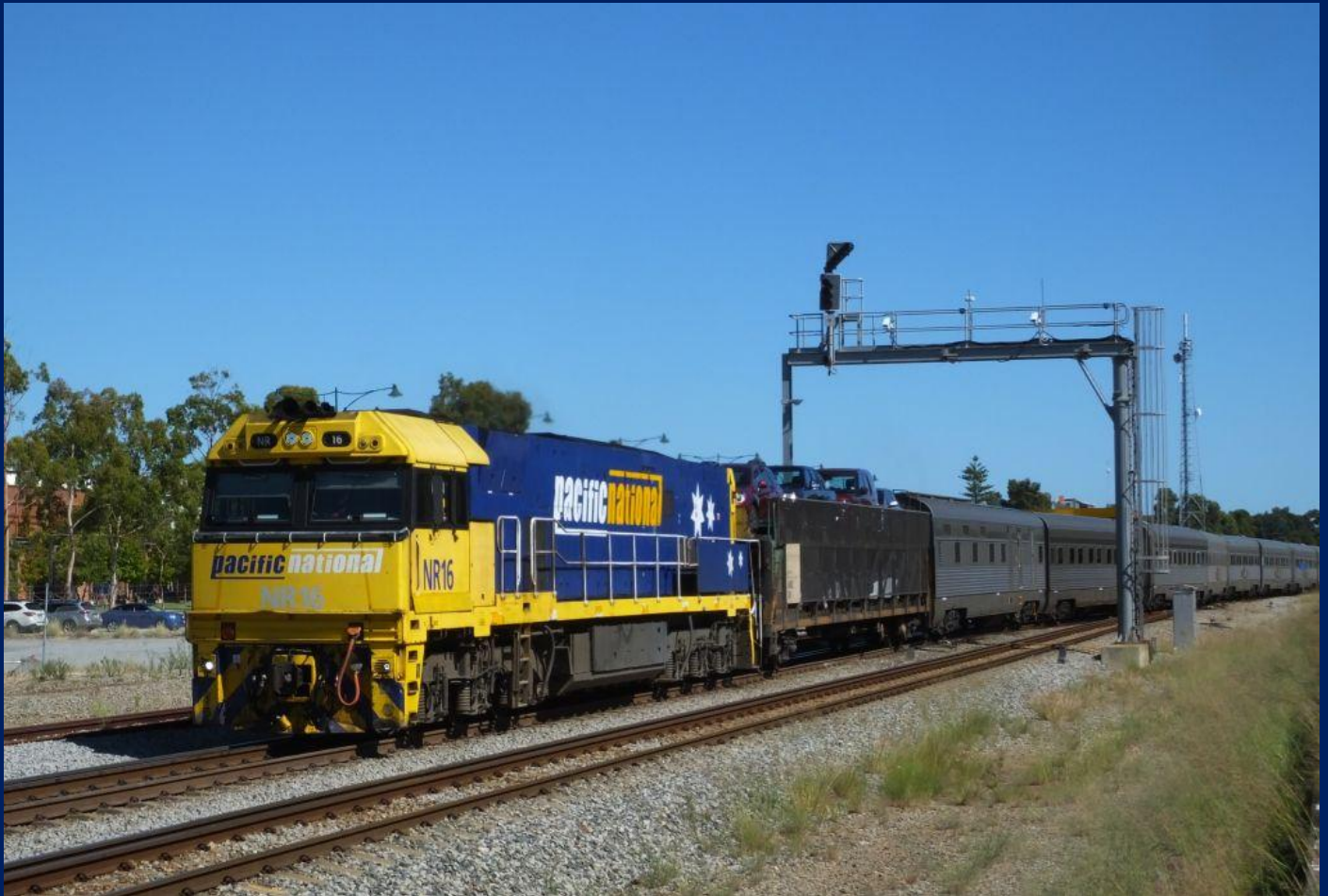
NR16 on 1PA8 Indian Pacific crossing over from down to up main at Midland April 2nd.