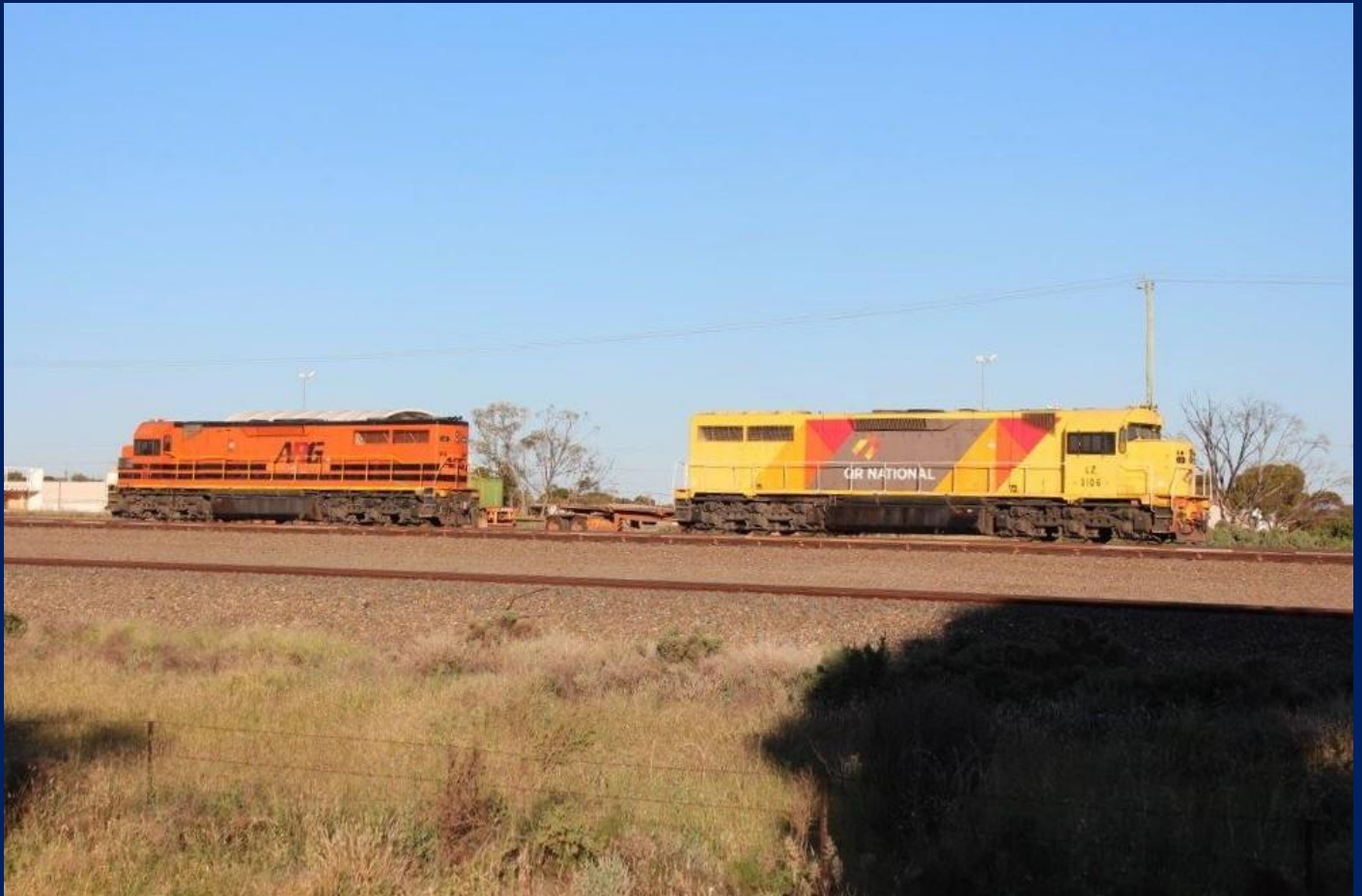
LZ3107 and LZ3106 stabled at West Kalgoorlie yards April 11th.