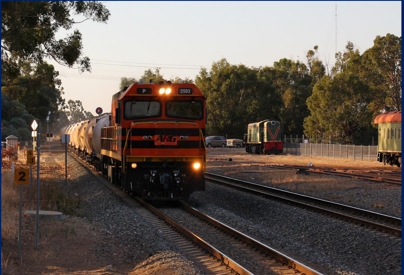
P2503 on 7271 lime to Worsley Alumina passing preserved C1701 at HVR Pinjarra 22/4.