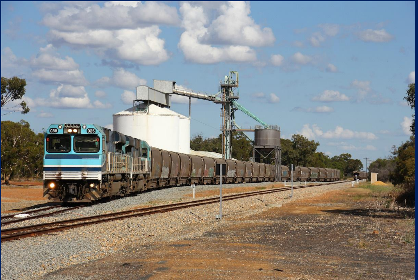
CBH025 & CBH002 on 1K55 empty Watco grain shunting Mogumber April 23rd.