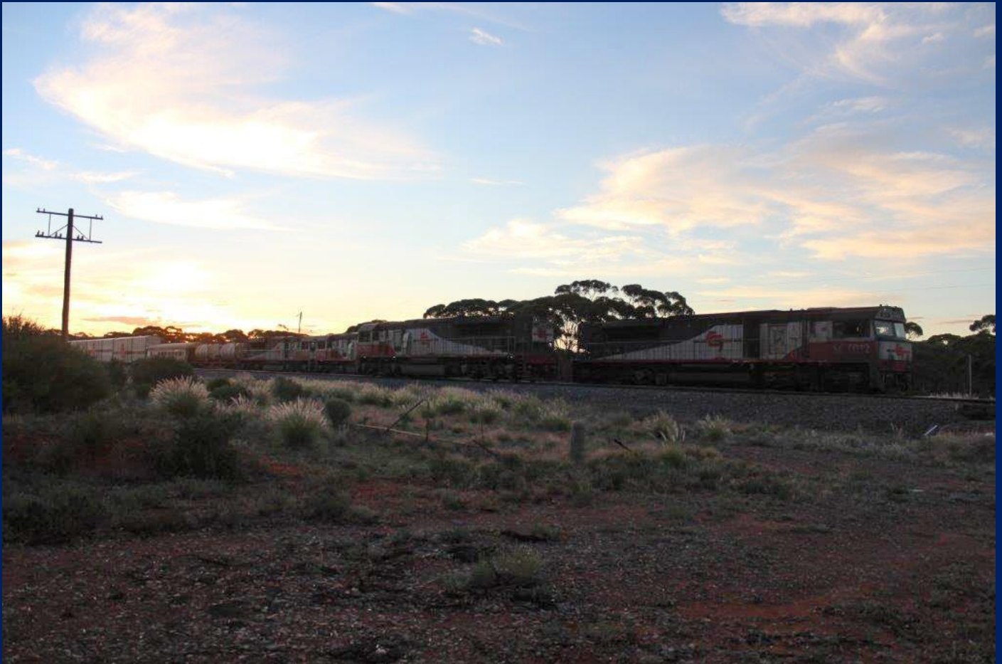
SCT012 being attached to 6PM9 at Bonnie Vale while SCT009 will run 5MP9 to Forrestfield April 22nd.