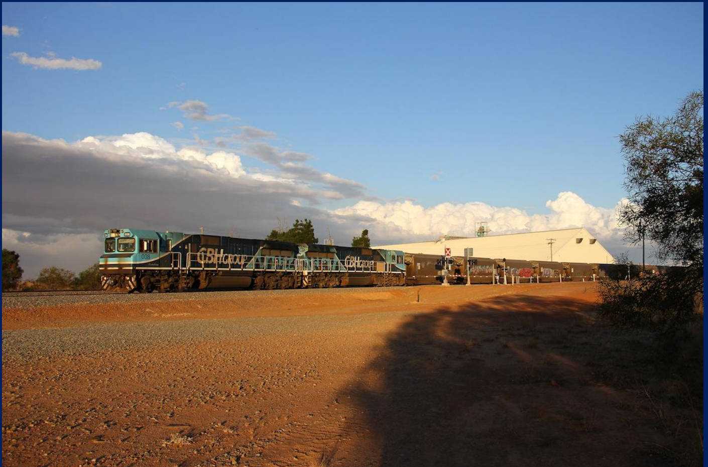
CBH008 & CBH011 on Watco grain being loaded at Mingenew CBH April 23rd.