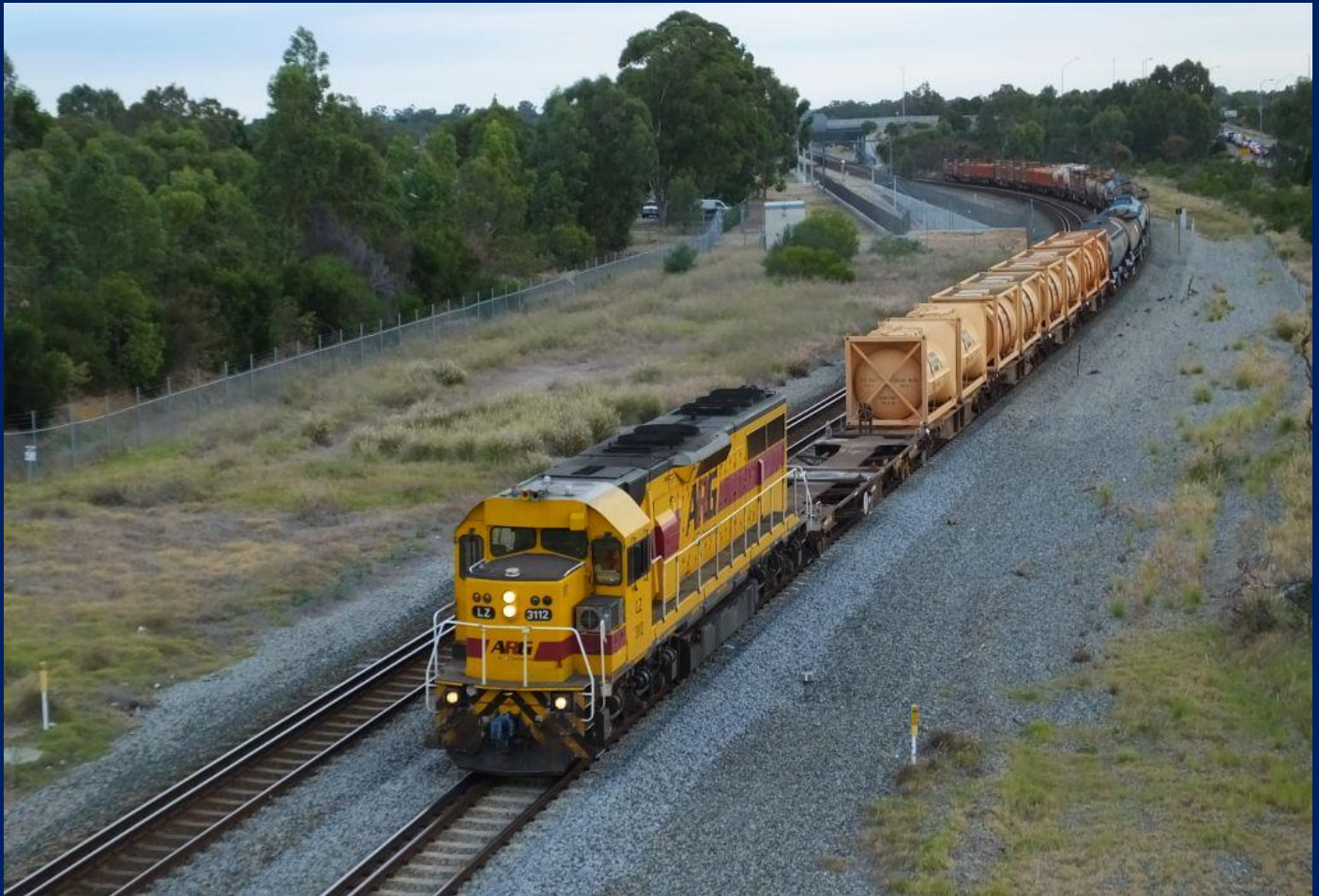
LZ3112 on 3025 Kwinana to Forrestfield shunter at Kenwick April 18th.