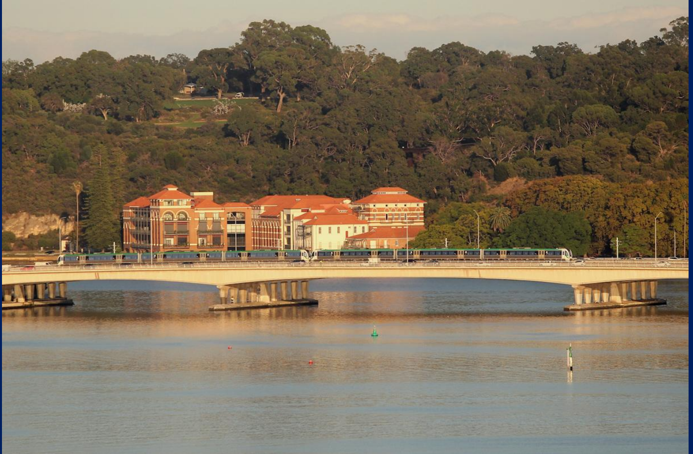
Six car B series EMU set crosses Narrows Bridge at South Perth with old Swan Brewery now an office and apartment complex and Kings Park in the background 19/4.