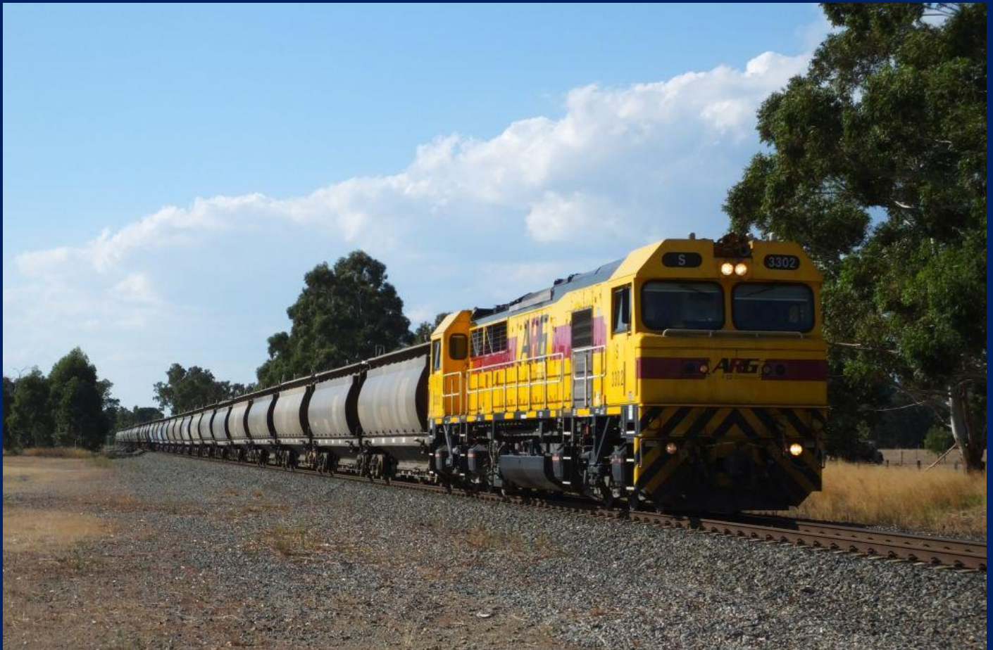
S3302 on 5223 Kwinana to Calcine empty alumina at Keysbrook April 20th.