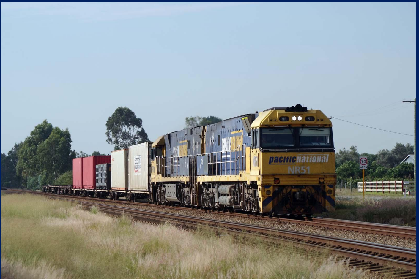
NR51 & NR101 on 5P16 ex Jumperkine at Herne Hill with recovered 4xpack wagon 6/4.