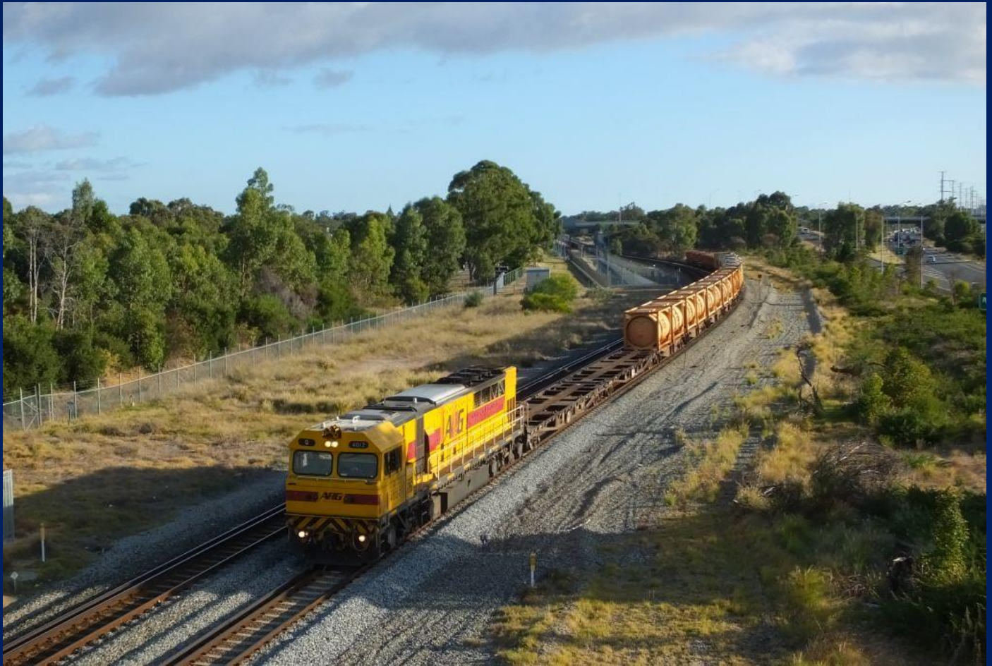
Q4012 on 1025 Kwinana Forrestfield shunter at Kenwick April 30th.