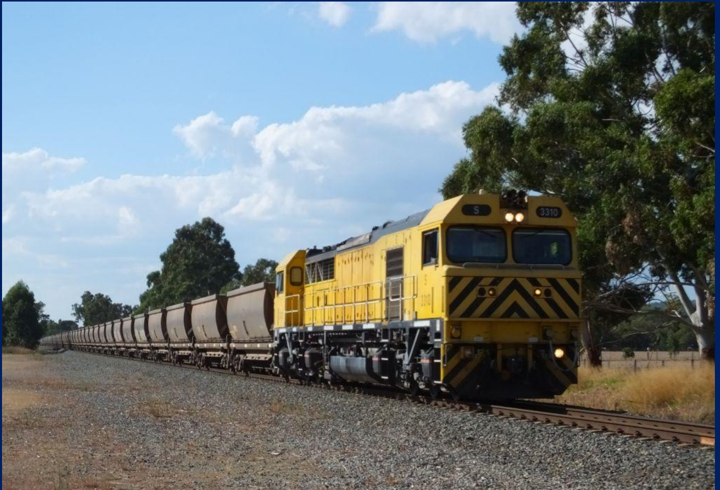
S3310 on 5953 empty bauxite to Calcine at Keysbrook April 20th.