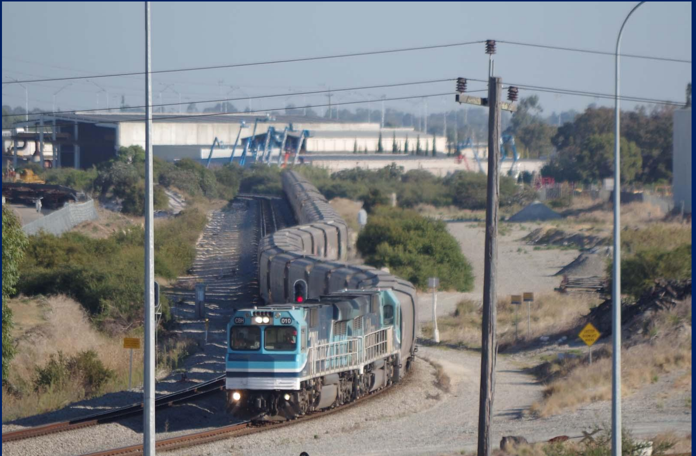
CBH010 & CBH024 on 5K45 empty Watco grain Forrestfield South April 13th.