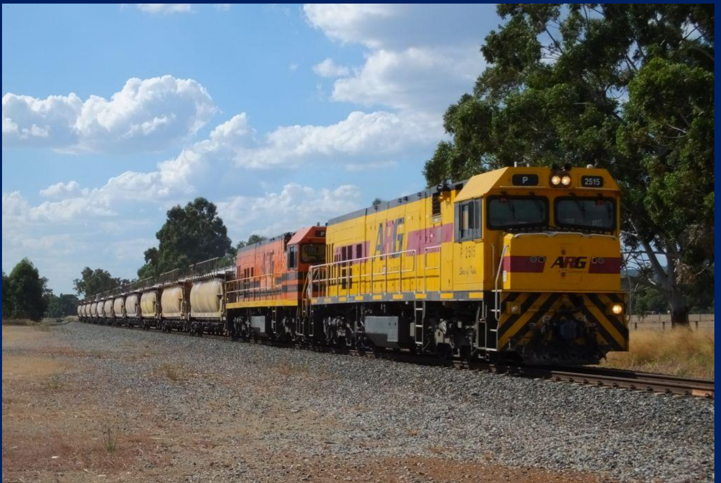
P2515 & P2503 on 5271 lime at Keysbrook April 20th.