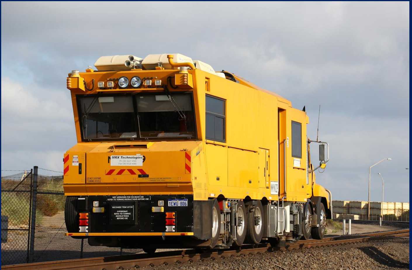
MMY029 track recorder hi-rail vehicle heading to Geraldton Port April 6th.