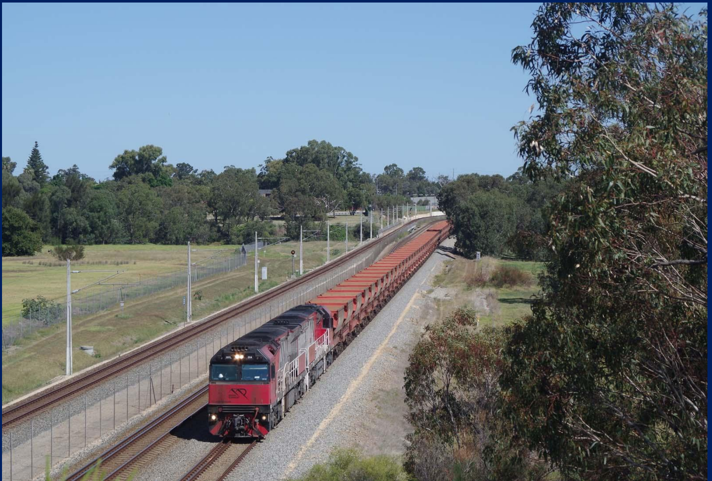
MRL004 & MRL006 on 1035 empty Polaris ore Kenwick April 9th.