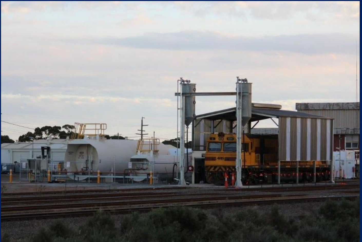
Q4016 in new loco trip service bay at West Kalgoorlie on first day of use April 20th.