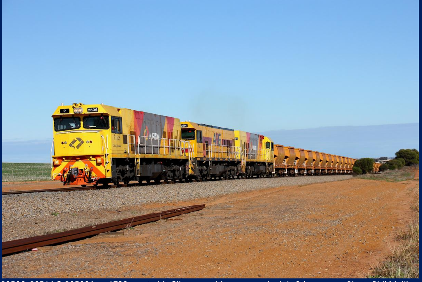
P2506, P2514 & P25004 on 1720 empty Mt Gibson ore Moonyoonooka July 9th.