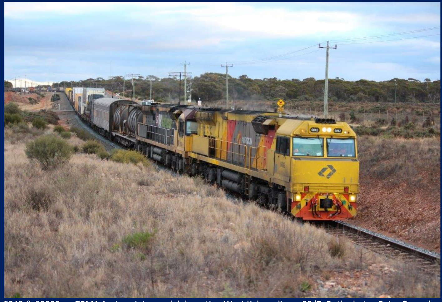
6042 & 60002 on 7PM1 Aurizon intermodal departing West Kalgoorlie on 22/7.