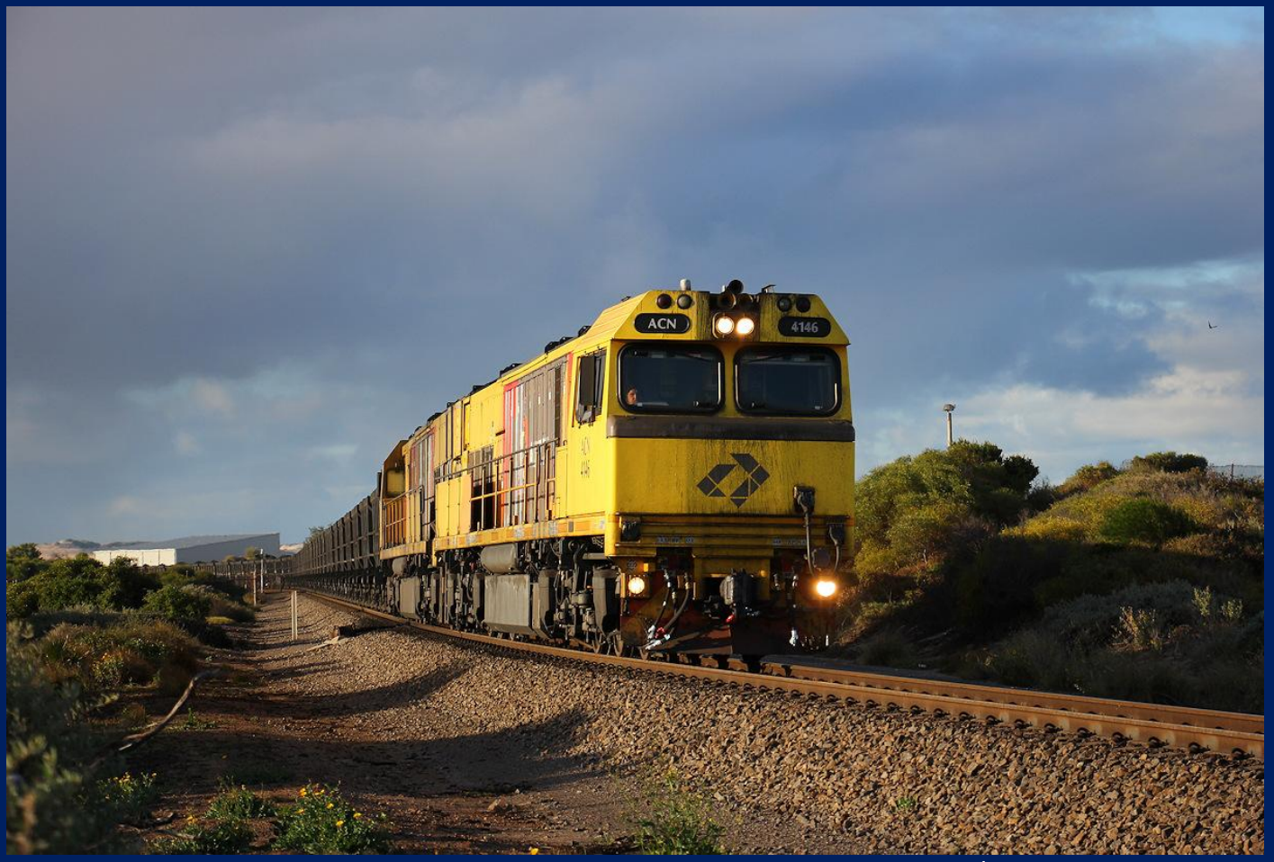
ACN4146 & ACN4144 on 4761 loaded Karara ore to Geraldton Port at Beachlands 5/7.