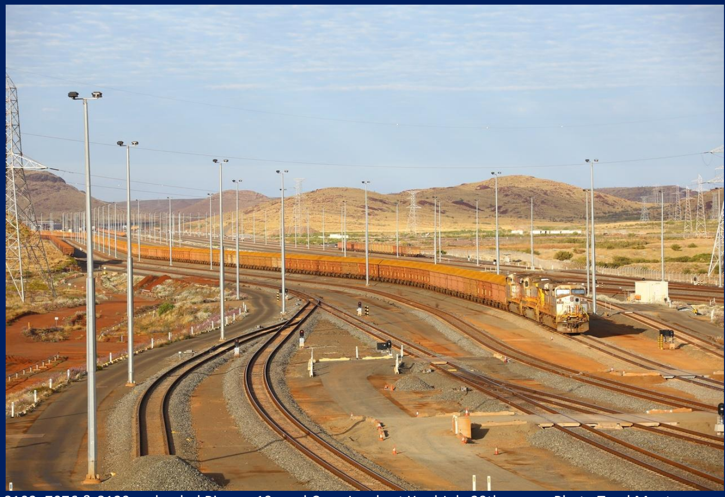
8103, 7076 & 8129 on loaded Rio ore 19 road Cape Lambert Yard July 29th.