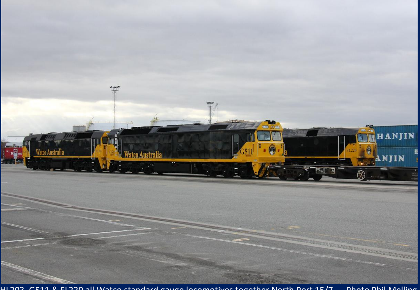
HL203, G511 & FL220 all Watco standard gauge locomotives together North Port 15/7.