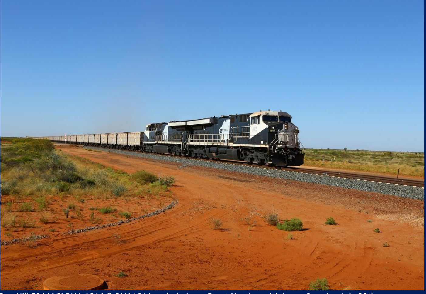
Roy Hill ES44ACi RHA 1014 & RHA1011 on laded ore Great Northern Highway Crossing July 30th.