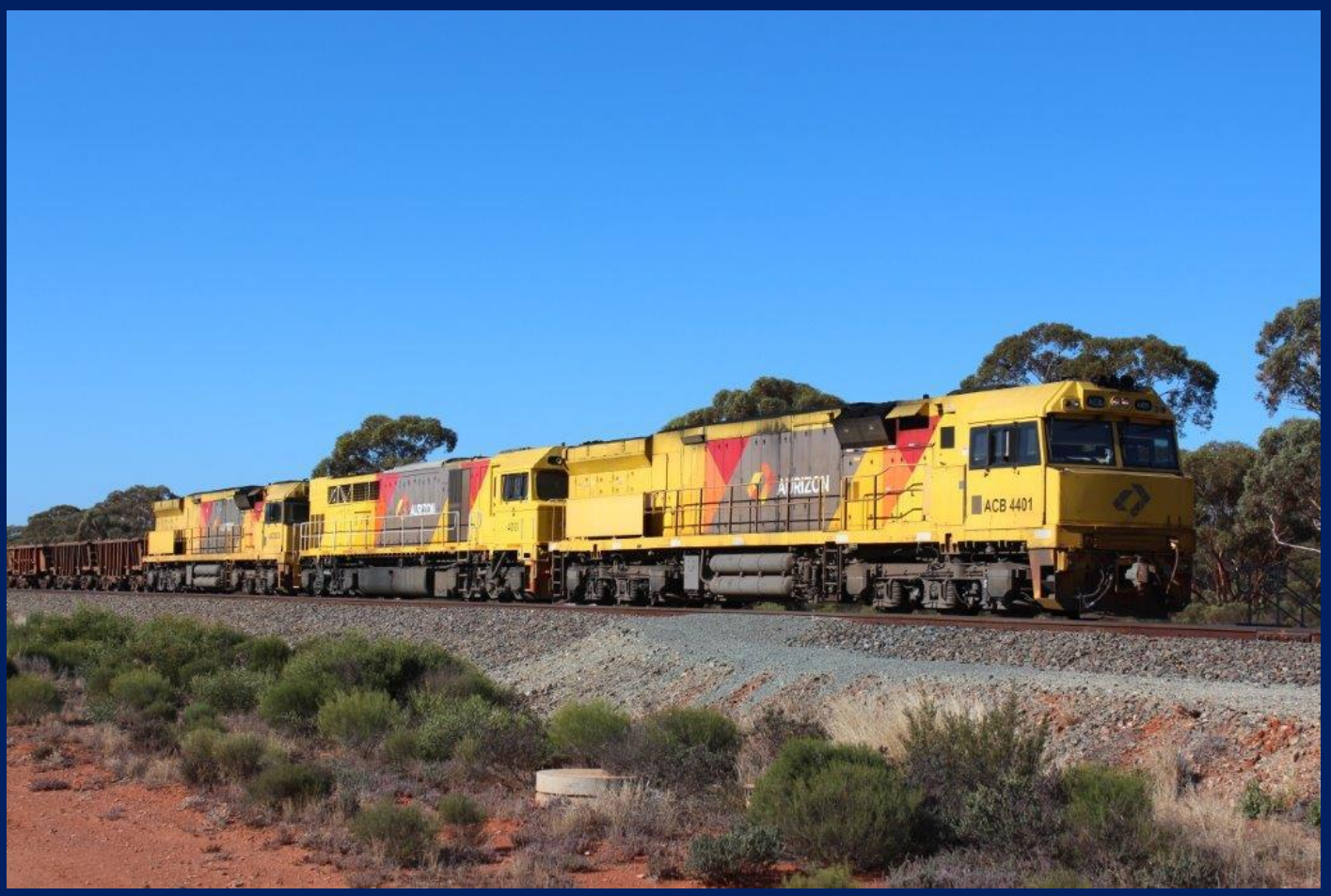
ACB4401, Q4001 & ACC6030 on 1414 empty ore at Binduli with ACC6030 to be shunted out July 16th.