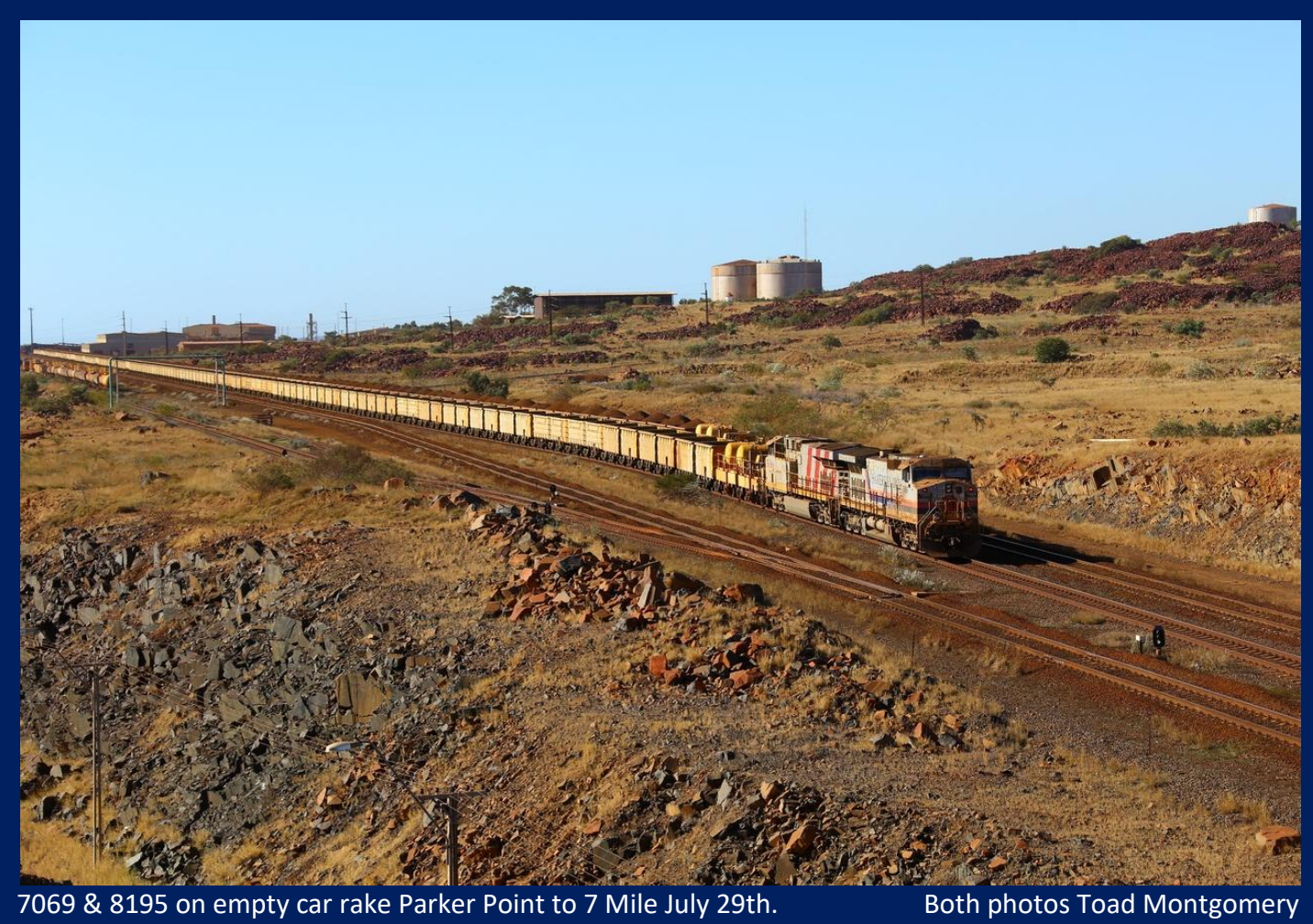
7069 & 8195 on empty car rake Parker Point to 7 Mile July 29th.