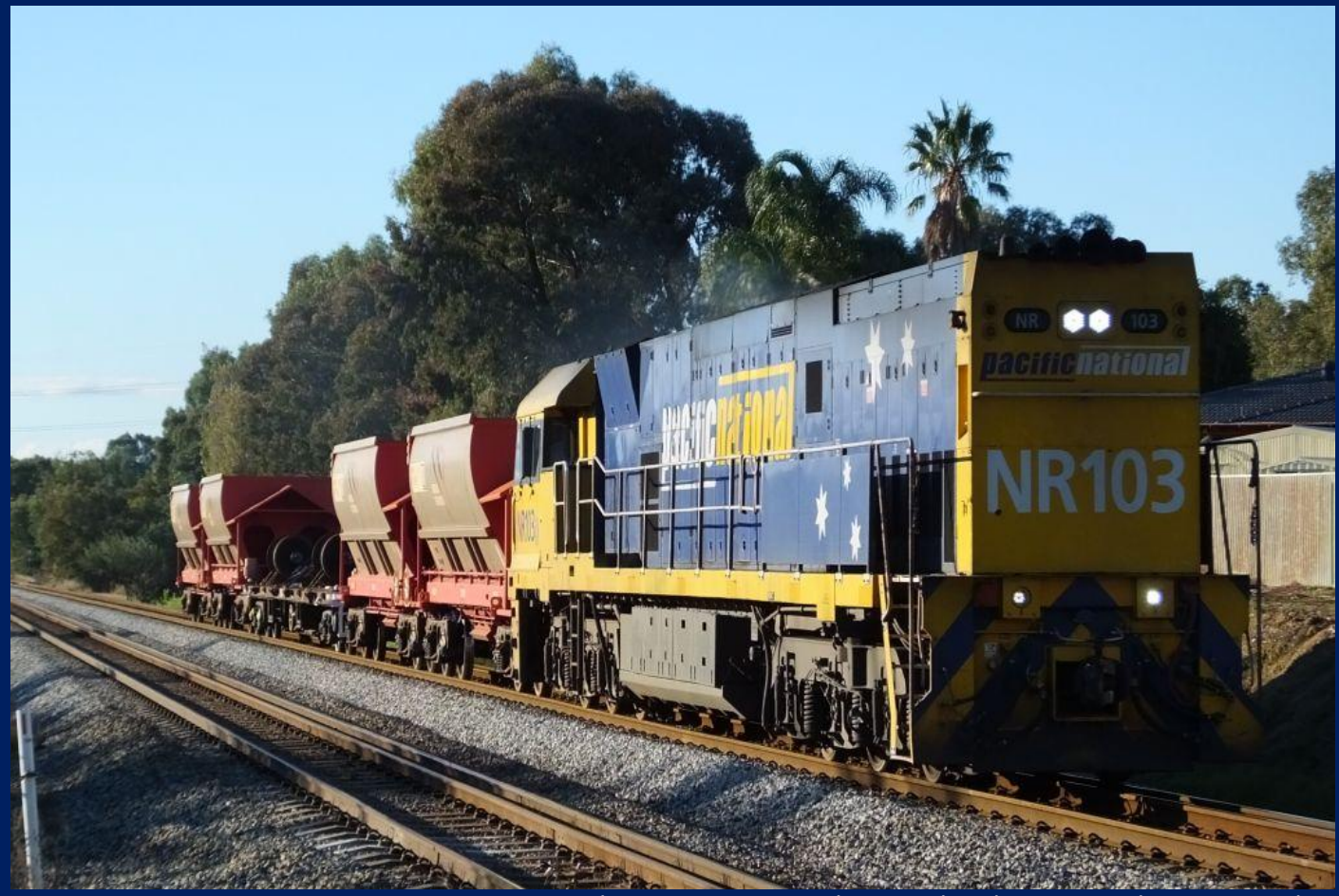
NR103 on 7P16 wagon recovery train ex Jumperkine to PFT at Hazelmere July 8th.