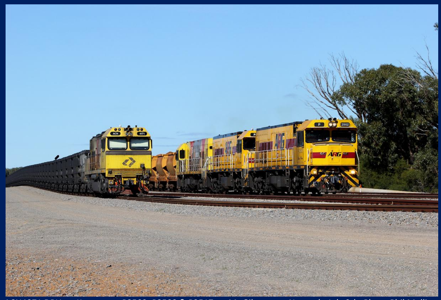
ACN4071 DPU on Karara set, P2502, P2508 & P2517 on Mt Gibson ore Narngulu July 9th.