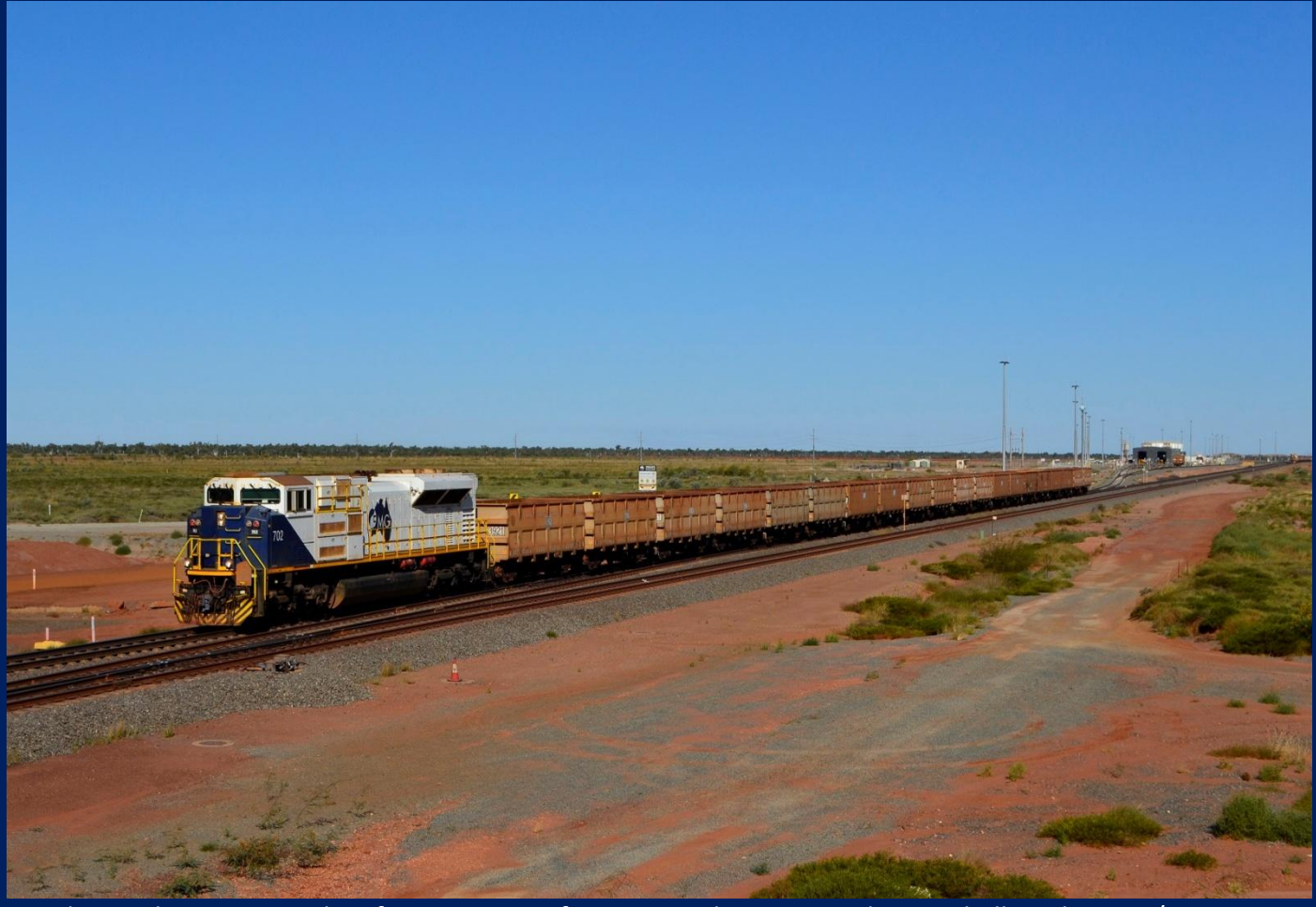
702 shunts short empty rake of ore cars out of Kanyiri Yard to turn on the port balloon loop 26/7.