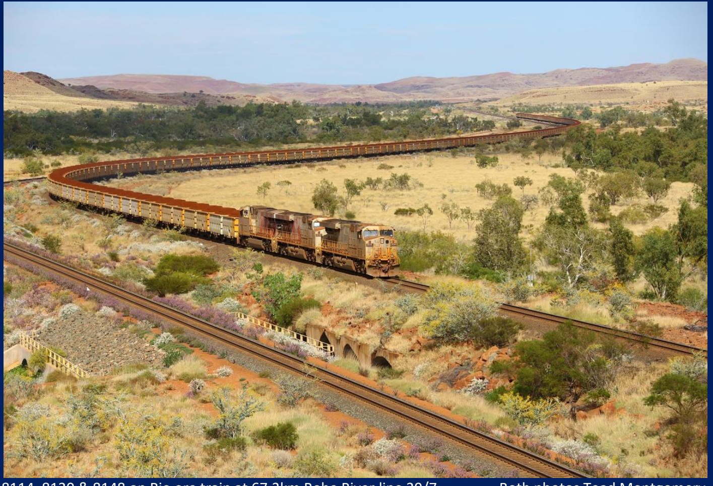
8114, 8120 & 8148 on Rio ore train at 67.3km Robe River line 29/7.