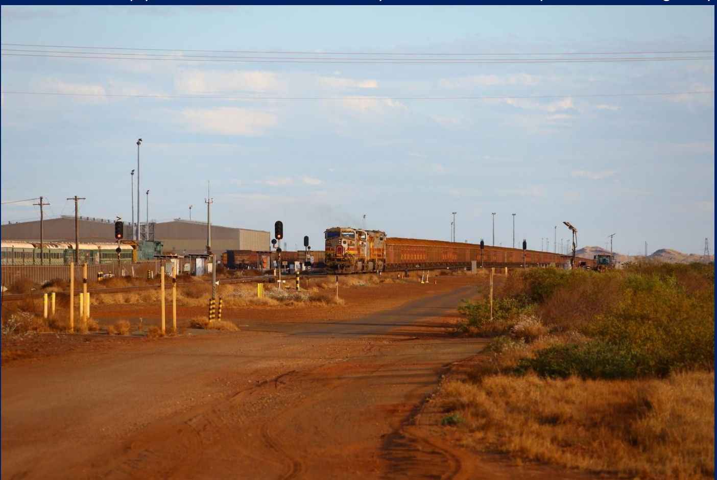
7044, 8134 & 9407 on loaded ore to East Intercourse Island pass preserved Alco 3107 at 6 Mile 29/7.