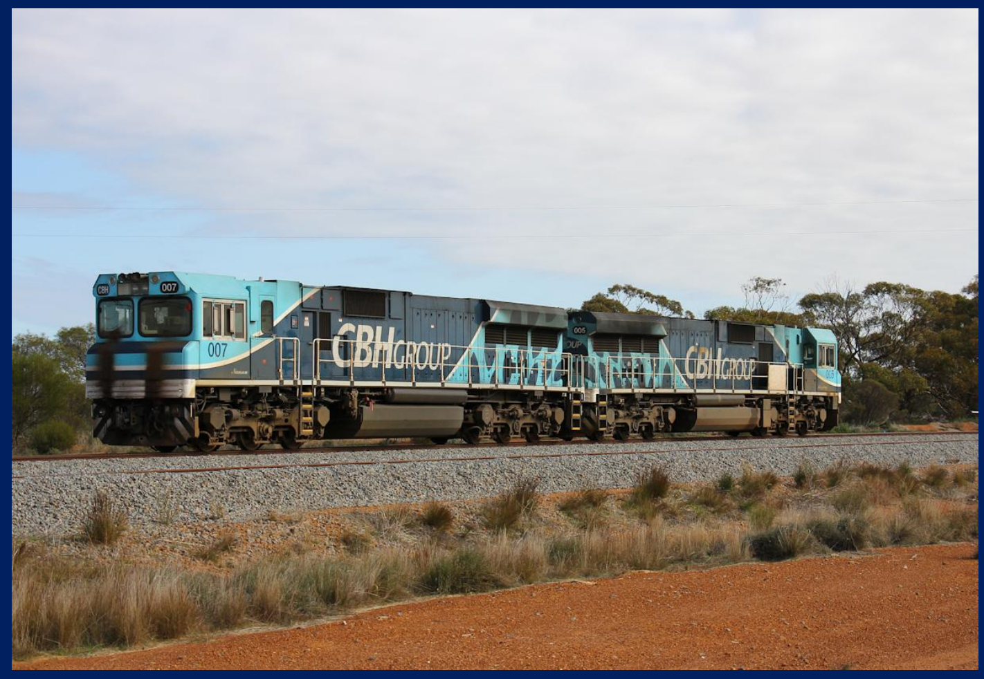
CBH007 and CBH005 stabled Carnamah during Geraldton Port shutdown July 14th.