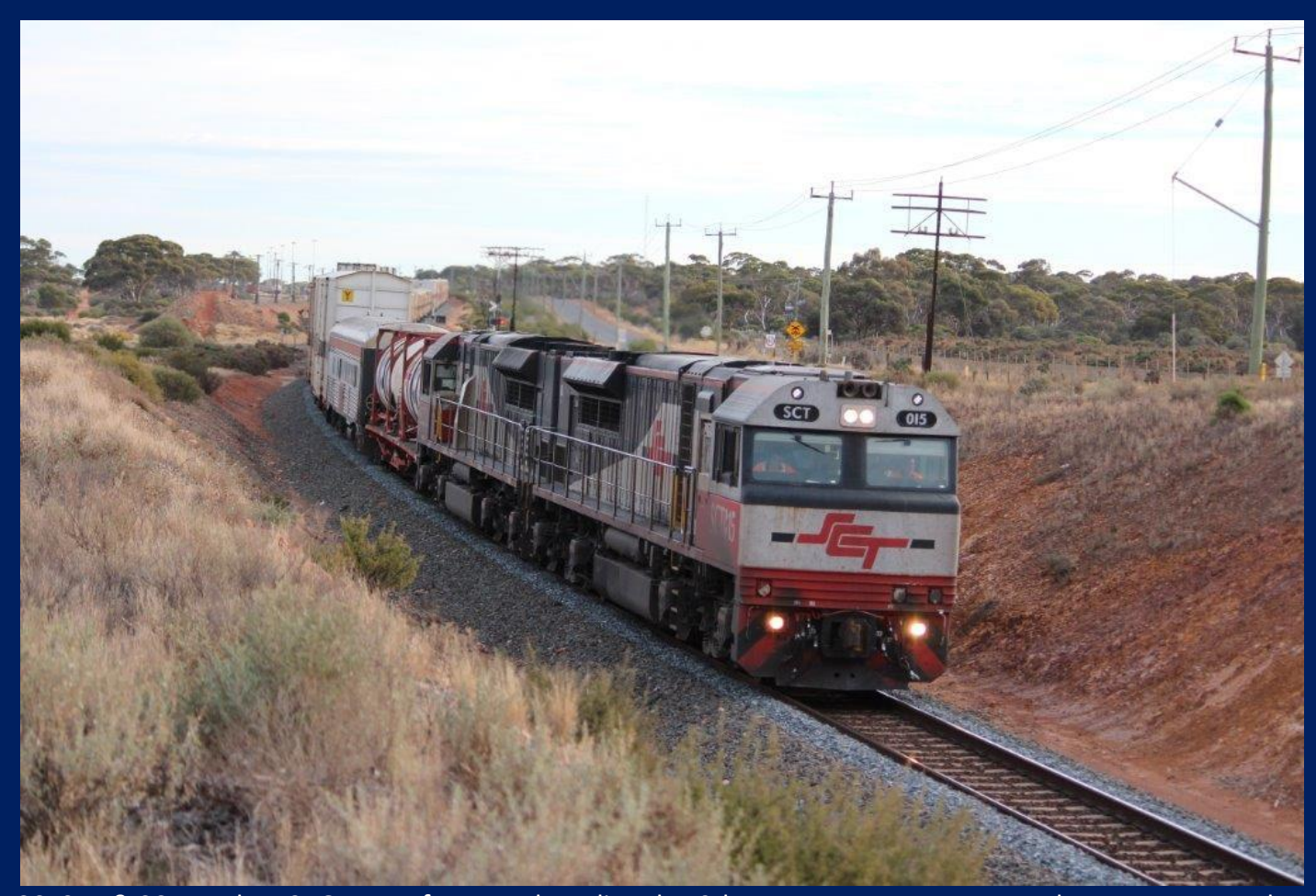
SCT015 & SCT run late 3PG1 out of West Kalgoorlie July 19th.