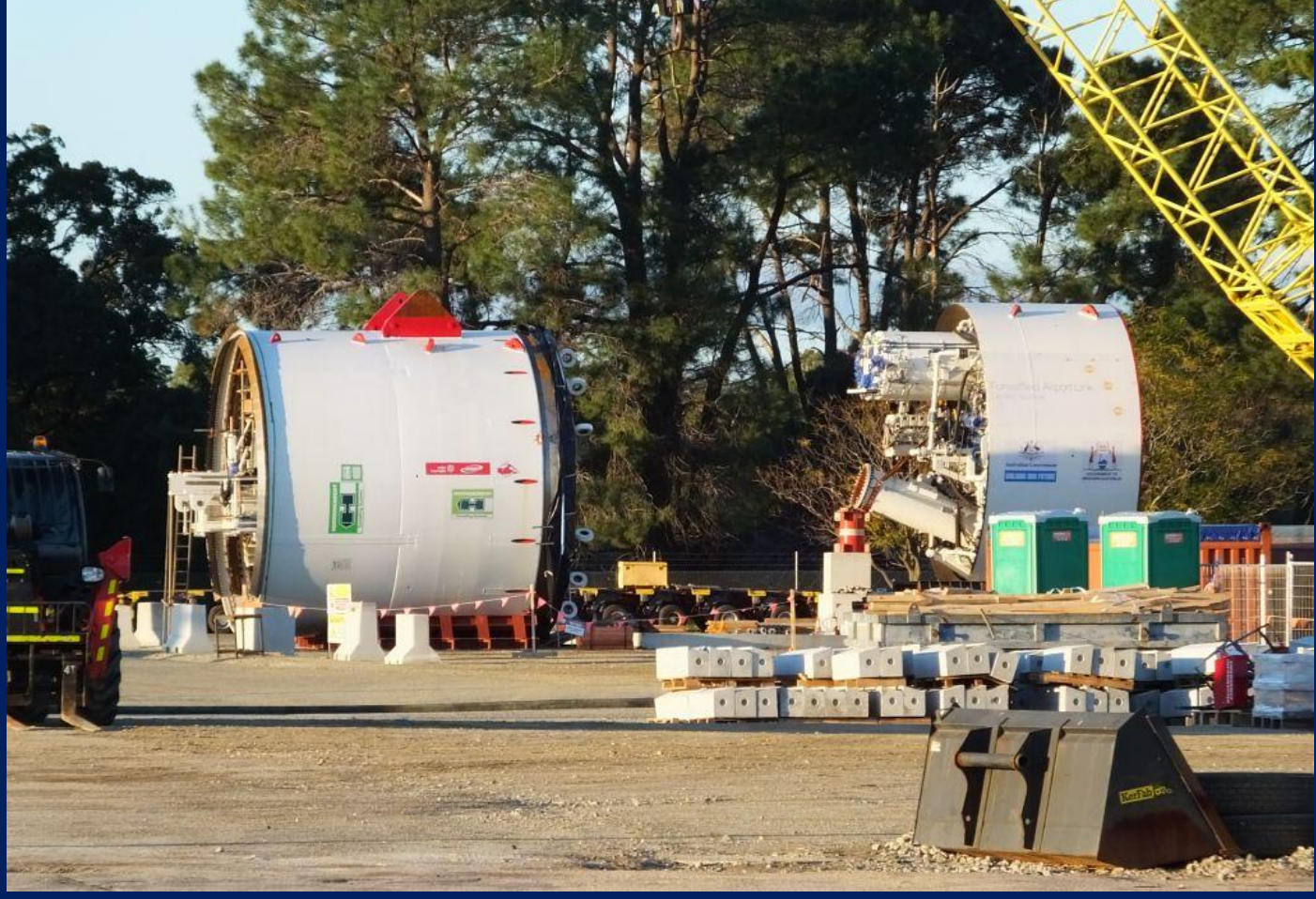
Tunnel Boring Machine for Forrestfield line being prepared to commence work 8/7.