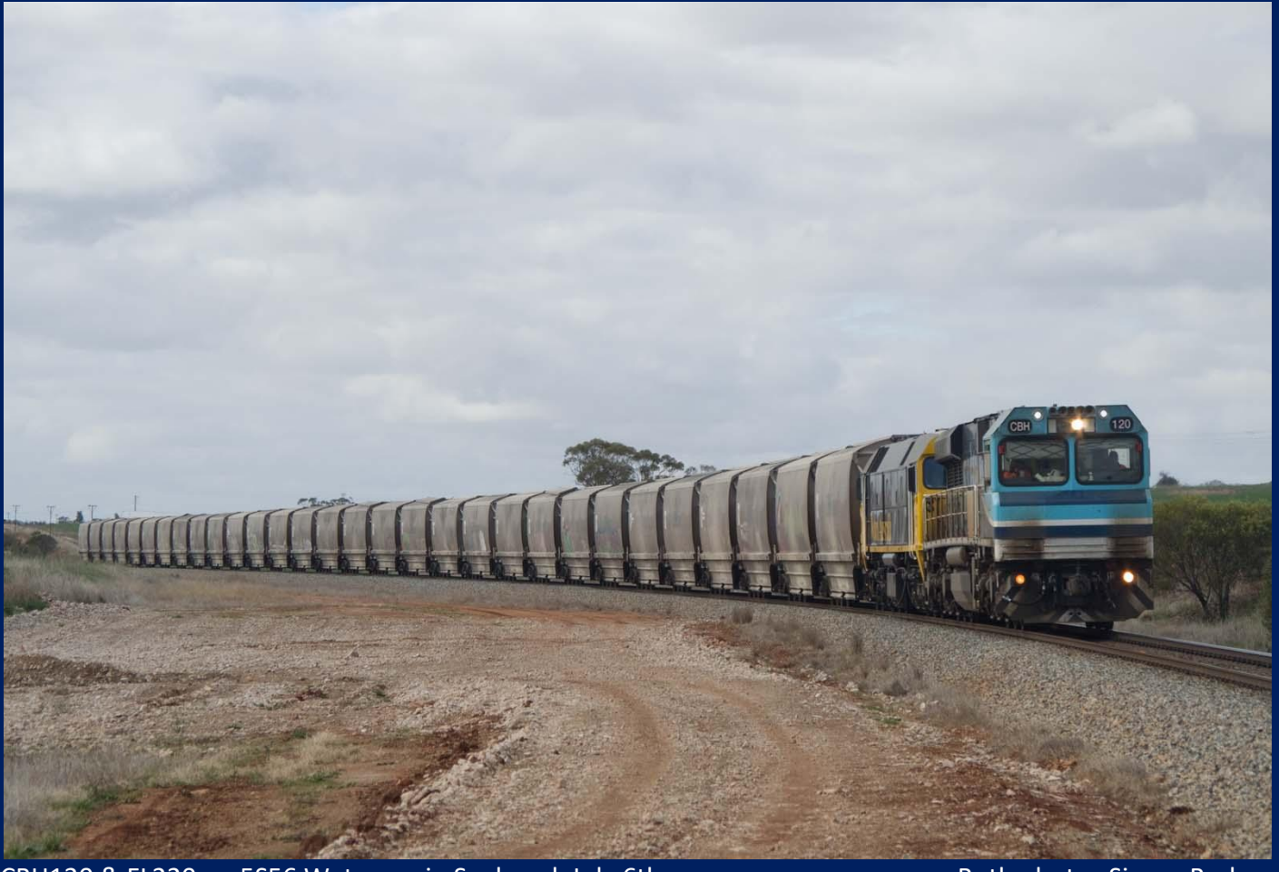
CBH120 & FL220 on 5S56 Watco grain Seabrook July 6th.