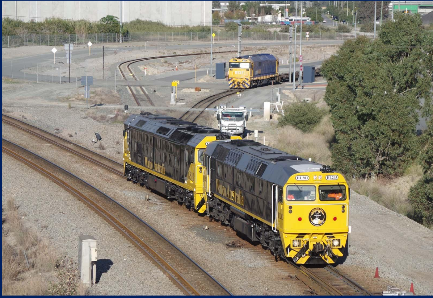
HL203 & G511 on 6W43 Watco light engine crossing 8121 PFT shunter Kewdale 30/6.