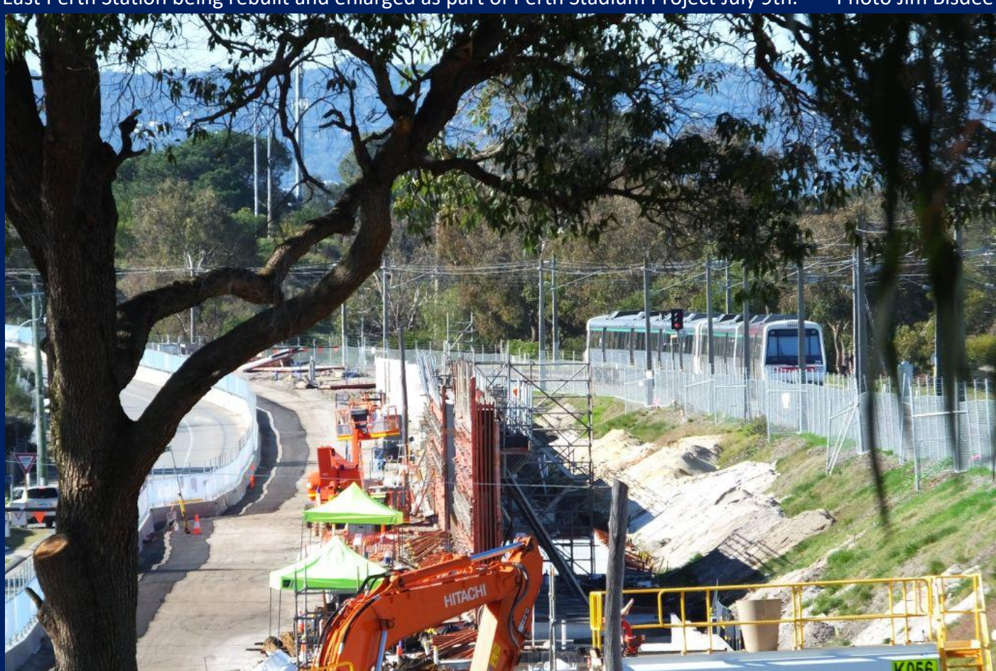
Earthworks and construction underway to move Midland line over at Bayswater July 9th.