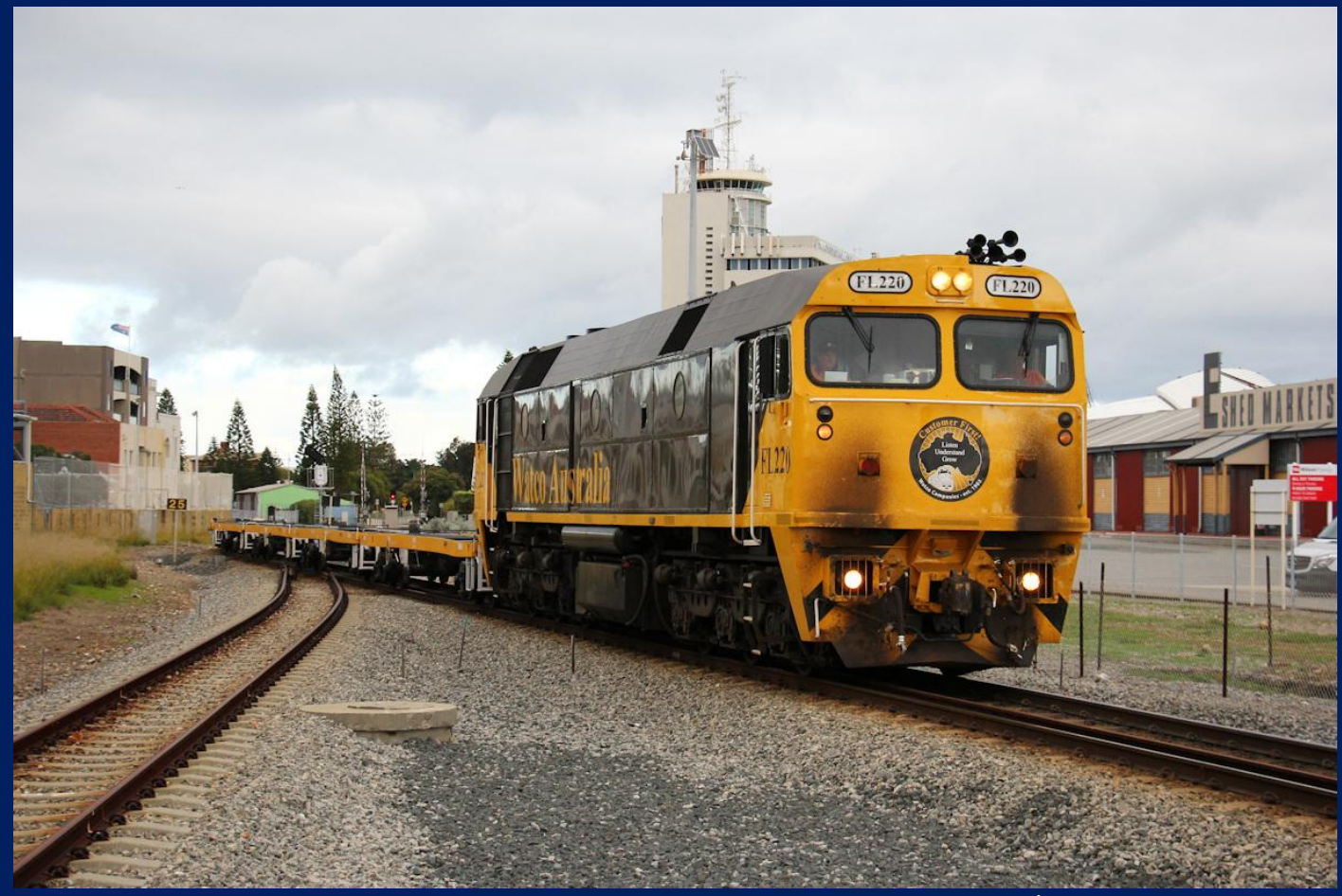
FL220 on 7142 empty wagon movement Forrestfield to North Port at Fremantle 15/7.