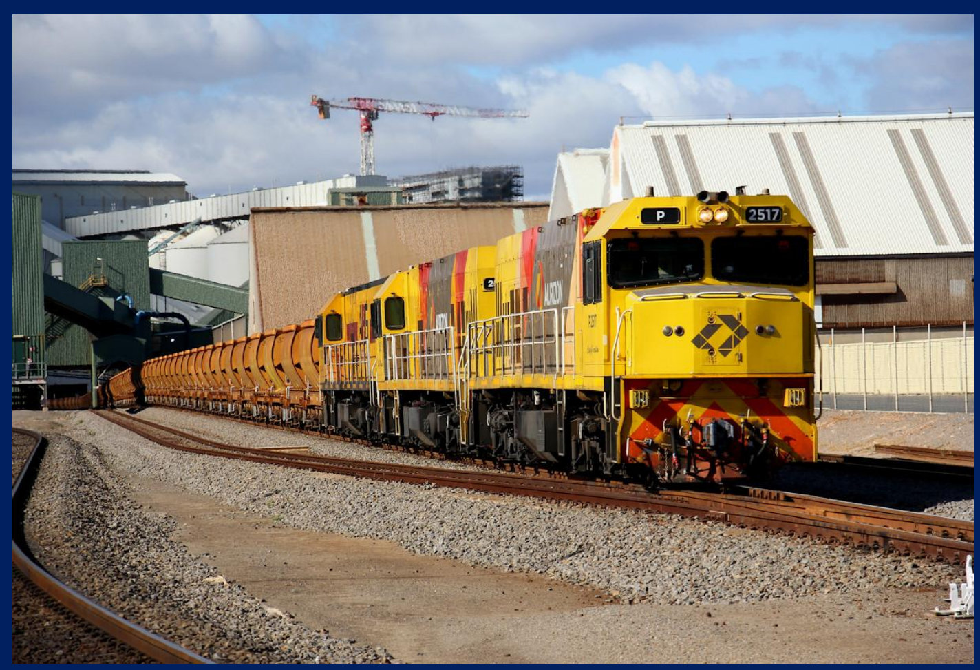
P2517, 2512 & P2502 on 3721 Mt Gibson ore train unloading at Geraldton Port July 4th.