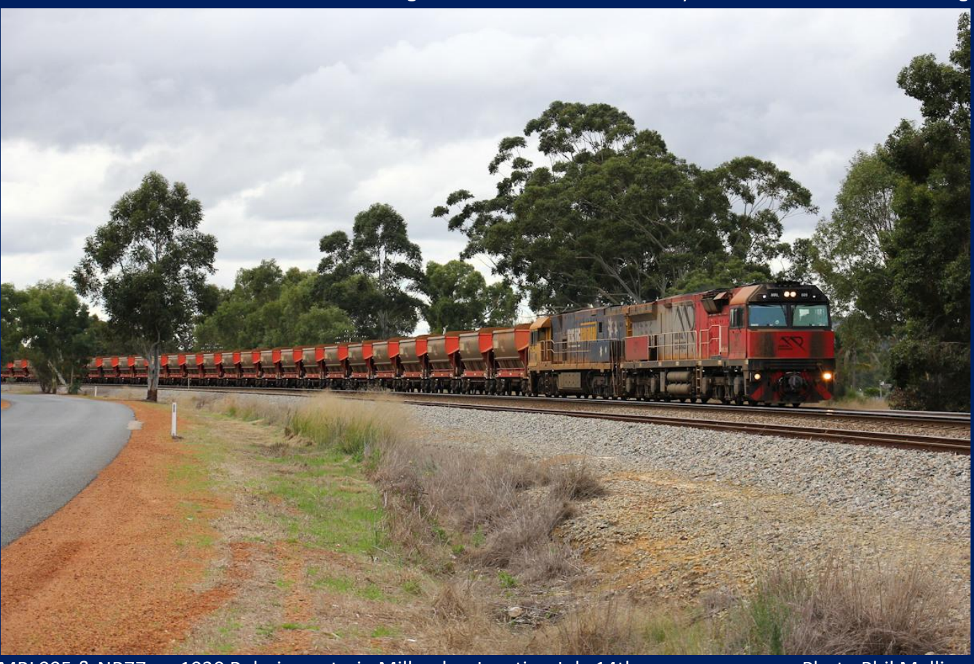
MRL005 & NR77 on 1030 Polaris ore train Millendon Junction July 14th.