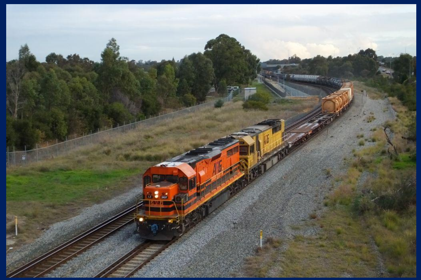
LZ3107 & Q4017 on 3025 Kwinana to Forrestfield shunter at Kenwick July 4th.