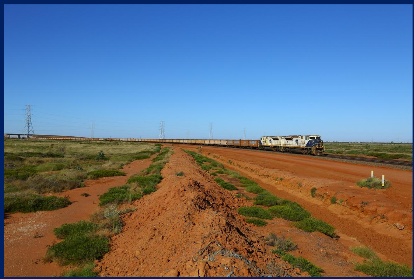
FMG SD70Ace 719 & 704 on loaded ore around 5km curve July 30th.