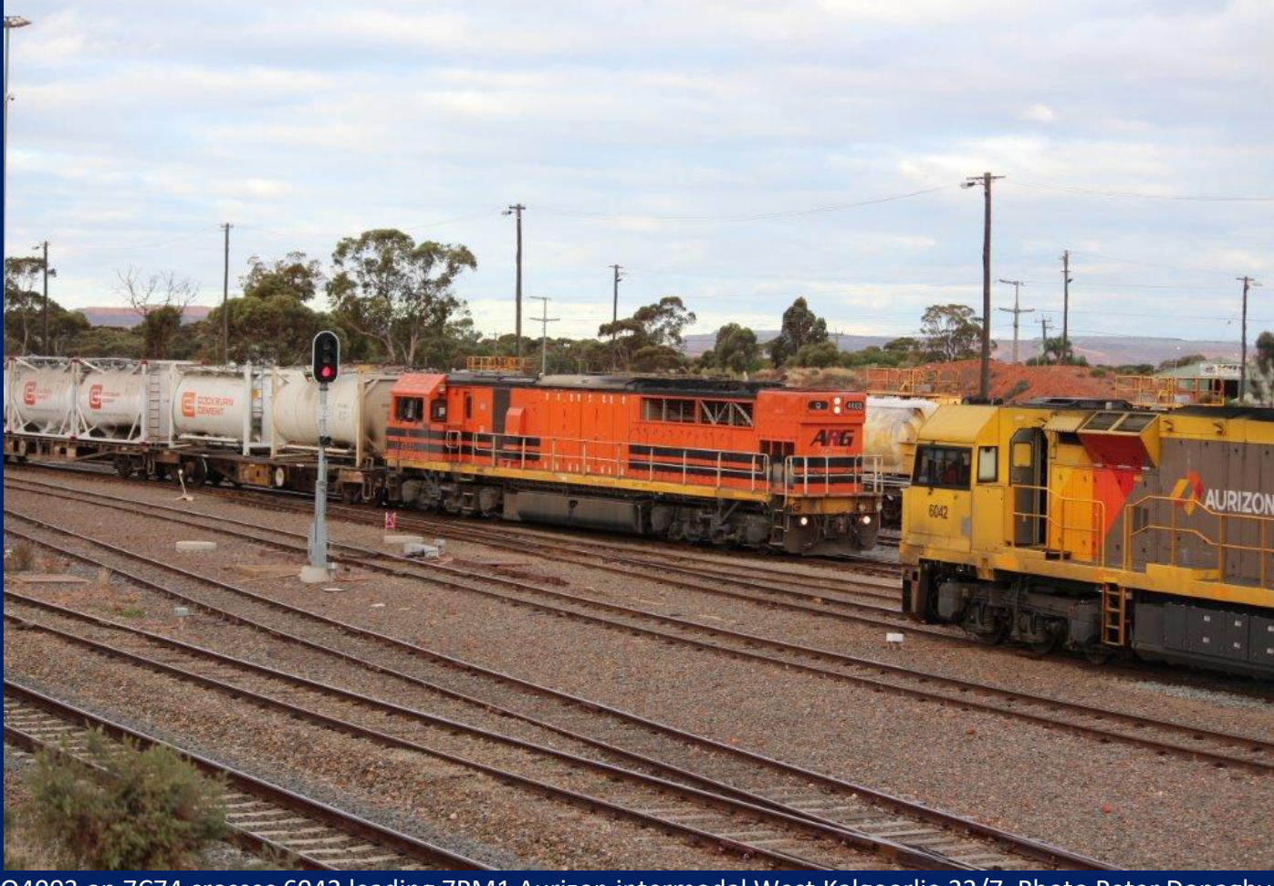
Q4003 on 7C74 crosses 6042 leading 7PM1 Aurizon intermodal West Kalgoorlie 22/7.