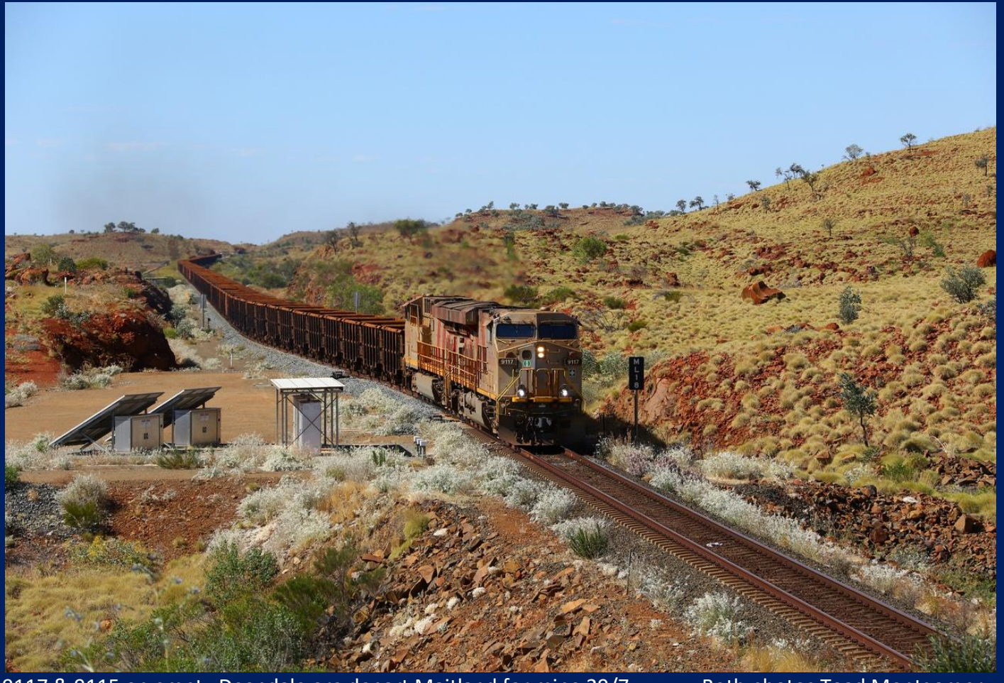
9117 & 9115 on empty Deepdale ore depart Maitland for mine 29/7.