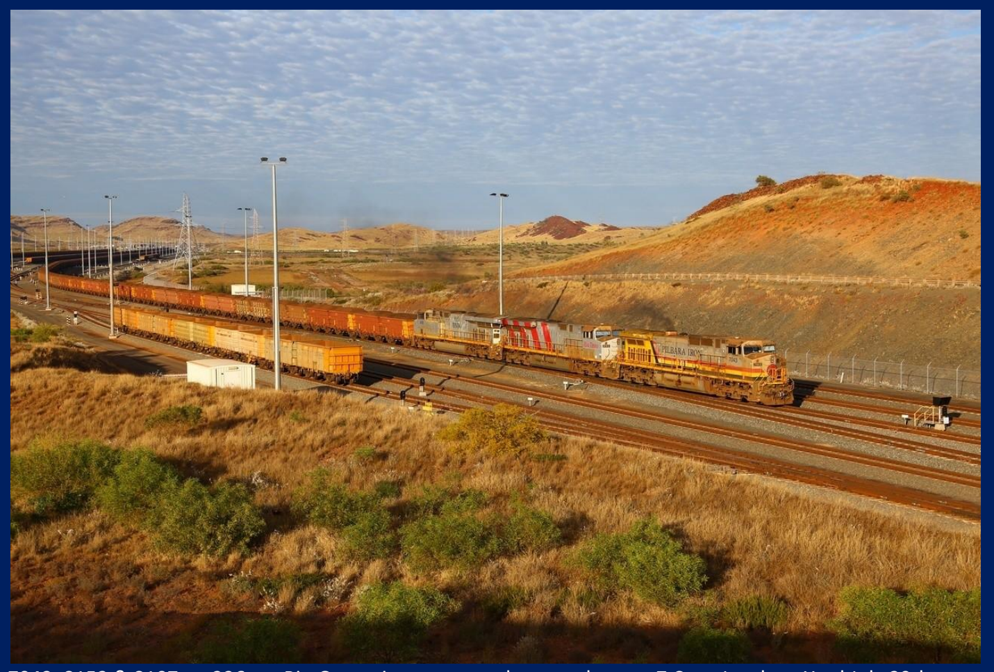
7043, 8153 & 8107 on 236 car Rio Ore train on approach to car dumper 7 Cape Lambert Yard July 29th.