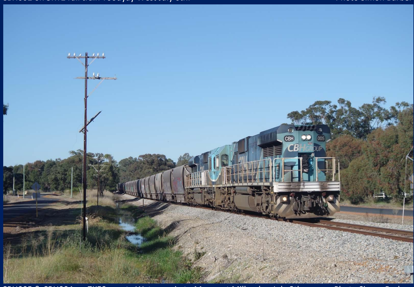
CBH005 & CBH004 on 7K53 empty Watco grain to Moora at Millendon July 8th.