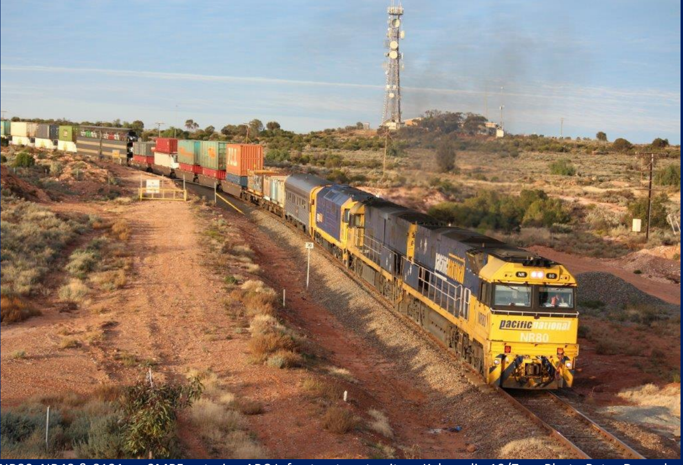
NR80, NR48 & 8121 on 2MP5 entering ARC Infrastructure territory Kalgoorlie 19/7.