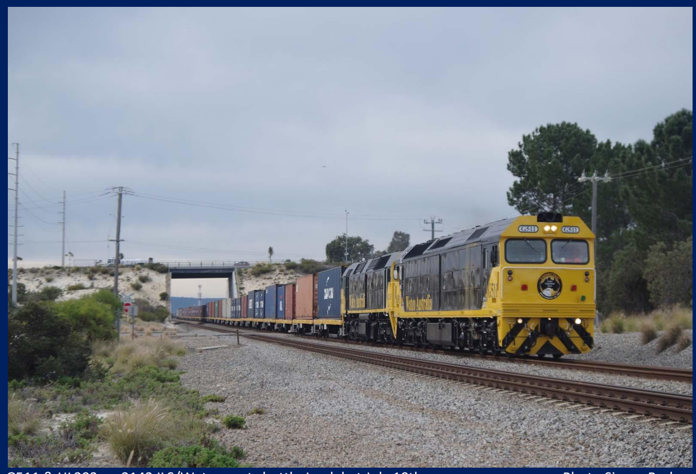
G511 & HL203 on 2142 ILS/Watco port shuttle Jandakot July 10th.