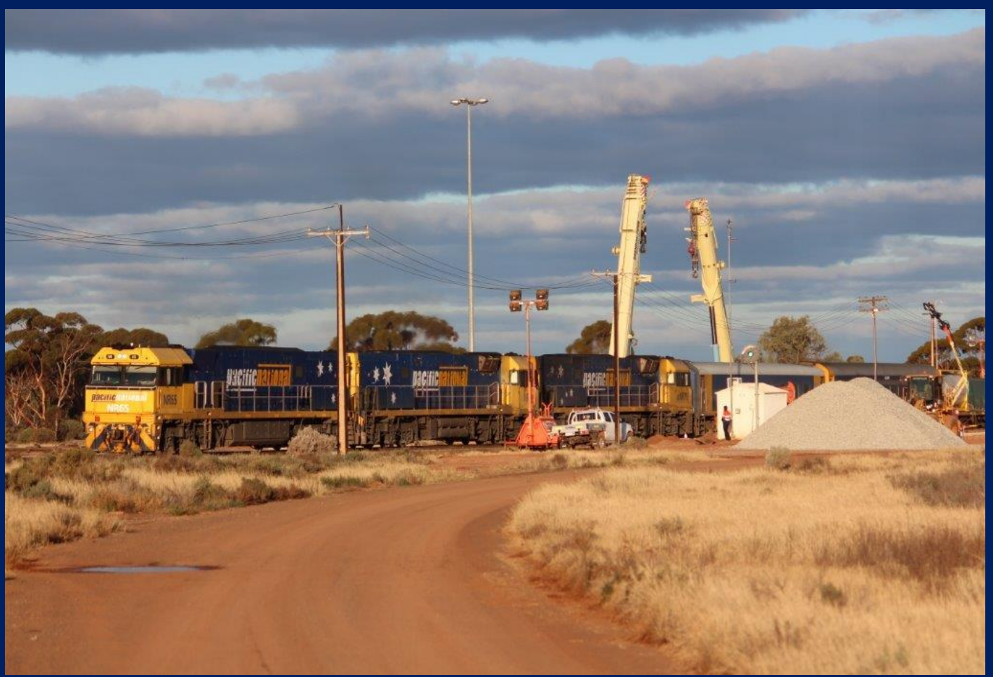
NR65, NR59 & NR79 on 3MP5 crawl over newly laid points at Parkeston July 6th.