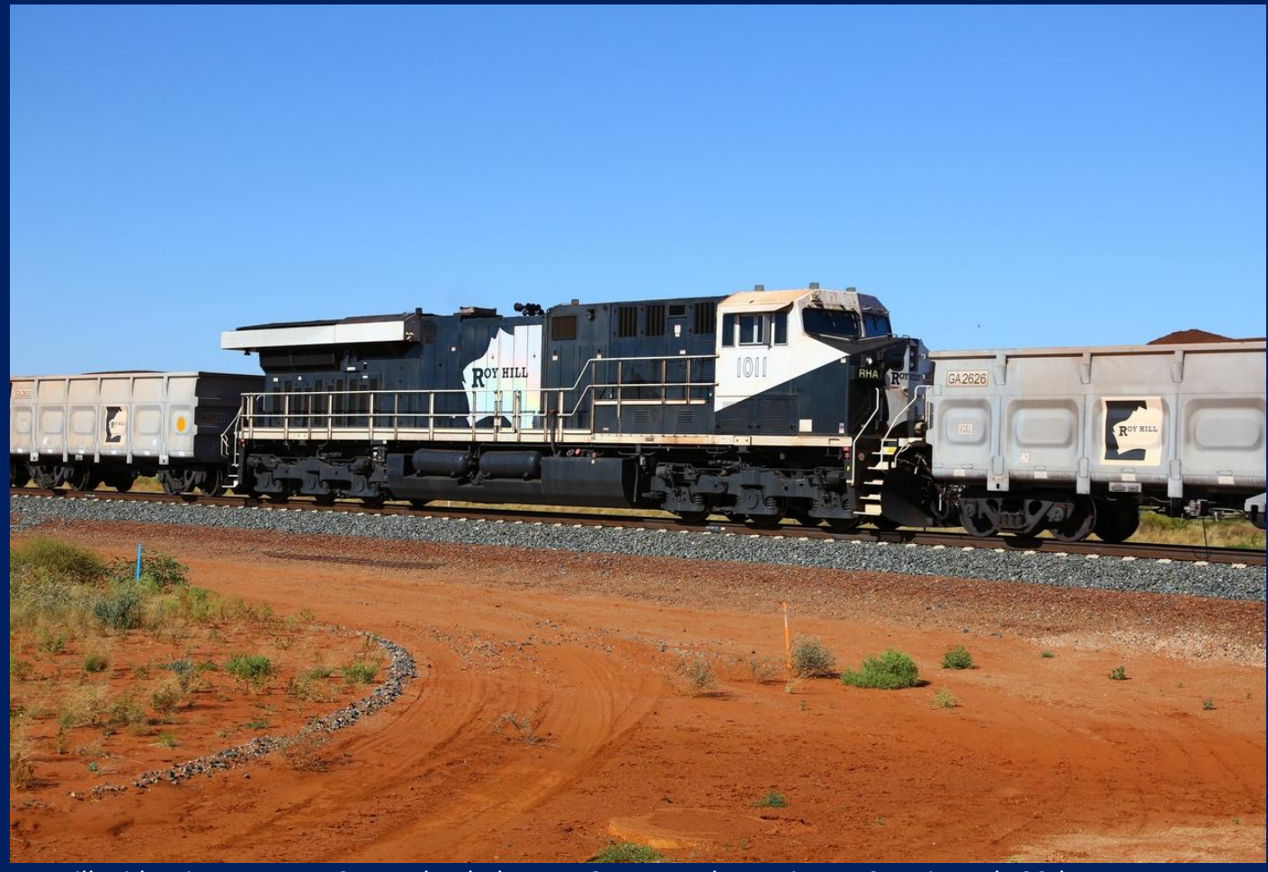
Roy Hill mid train DPU RHA1011 on loaded ore at Great Northern Higway Crossing July 30th.