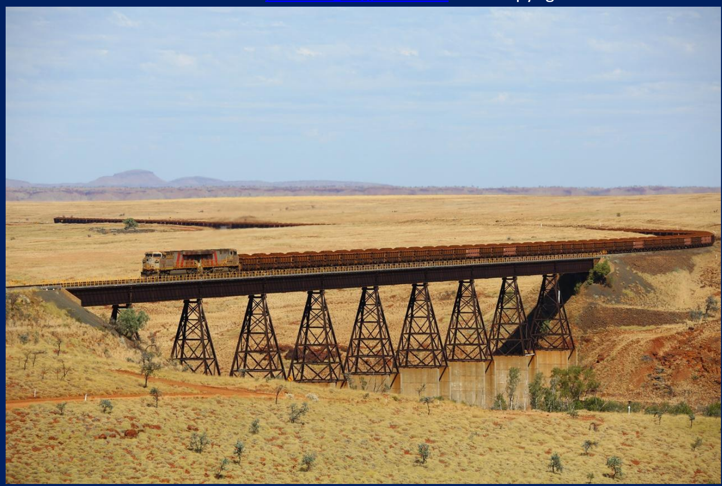
9114 & 9101 on 156 car loaded Robe River ore train crossing the massive bridge over the Fortescue River at 115.8km on Deepdale line July 29th. Photo Toad Montgomery

Publisher: Jim Bisdee Email: pm1225@bigpond.com Copyright Jim Bisdee © 2017