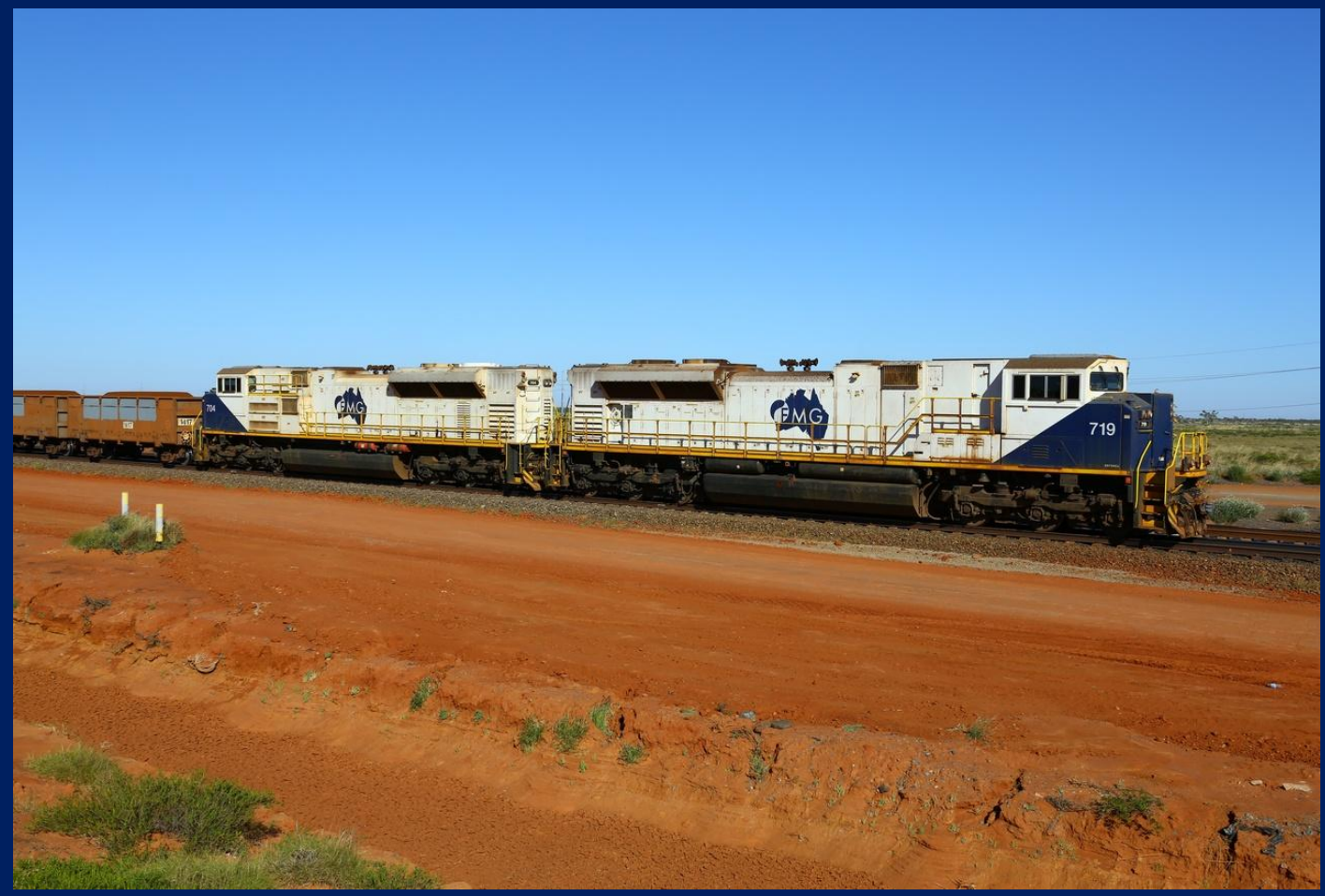
FMG 719 and 704 on loaded ore about 5km Boodarie July 30th.