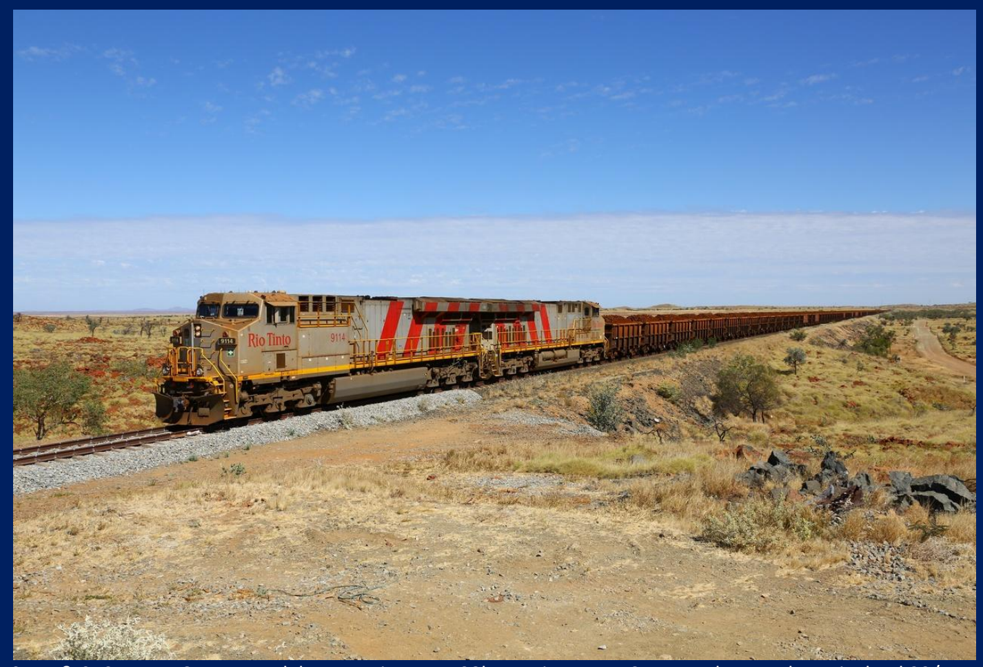
9114 & 9101 on 156 car Deepdale ore train near 108km on its run to Cape Lambert to dump its load 29/7.