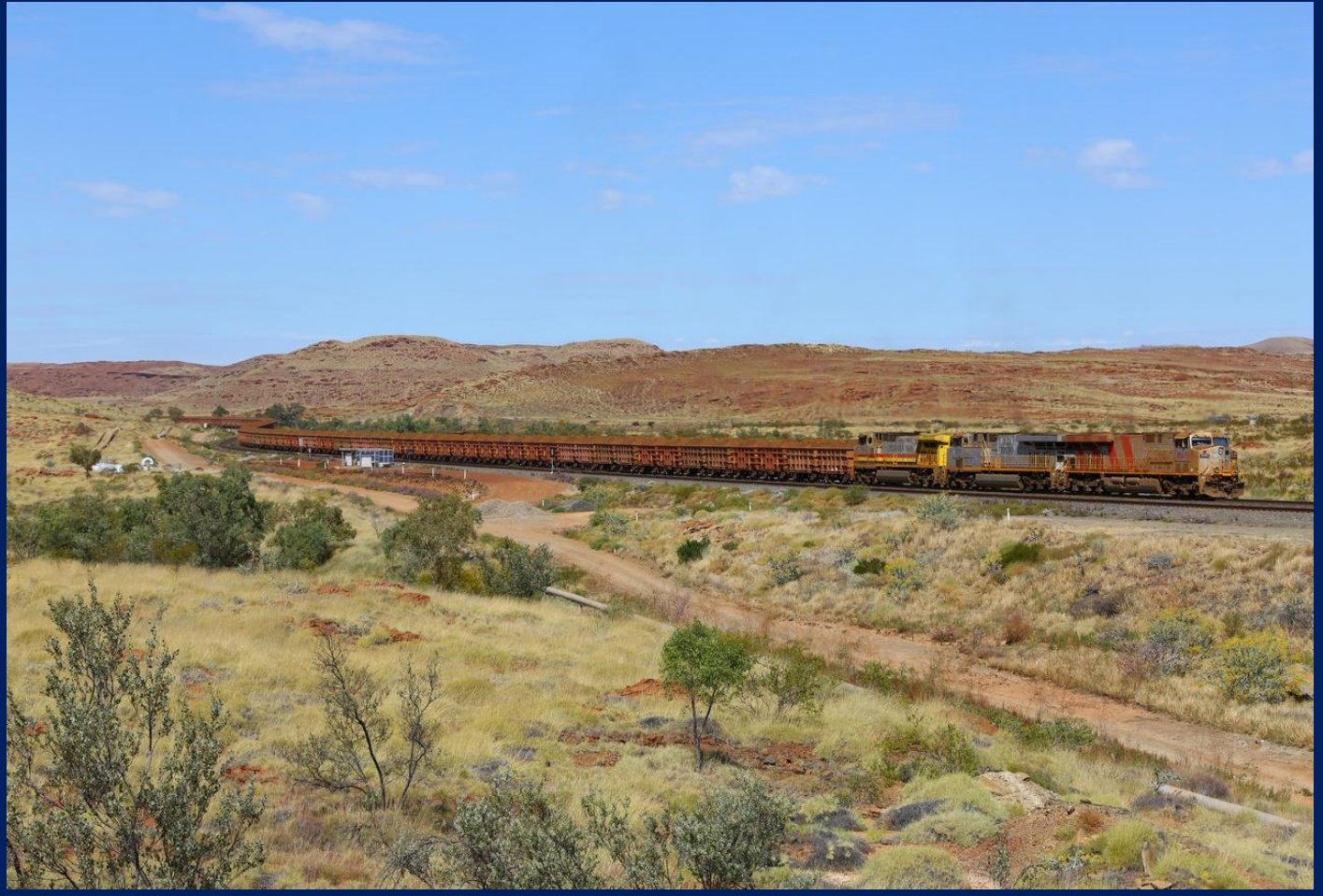
8194, 8111 & 7055 on Rio ore departing Emu 2 Road for Cape Lambert 29/7.