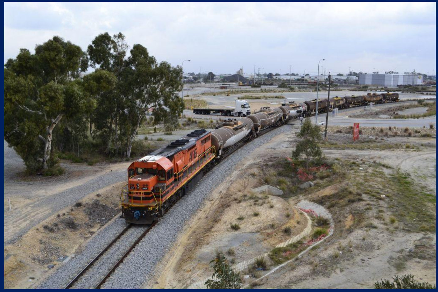
LZ3107 on 4SG4 tankers ex BP terminal Kewdale to Forrestfield July 12th.