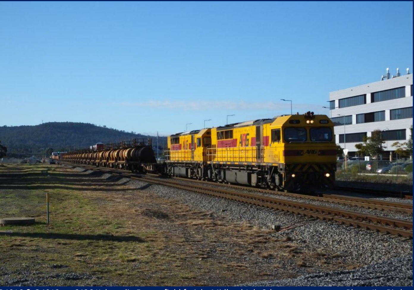
Q4016 & Q4012 on 6426 Kalgoorlie Forrestfield freight Midland July 8th.